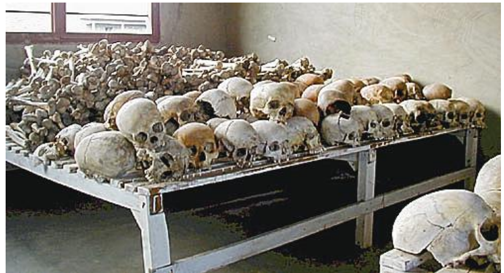
Murambi Genocide Memorial Centre, near the town of Murambi in southern Rwanda where skulls are laid out. Note the deep gashes delivered by the killers, which are visible in the skulls