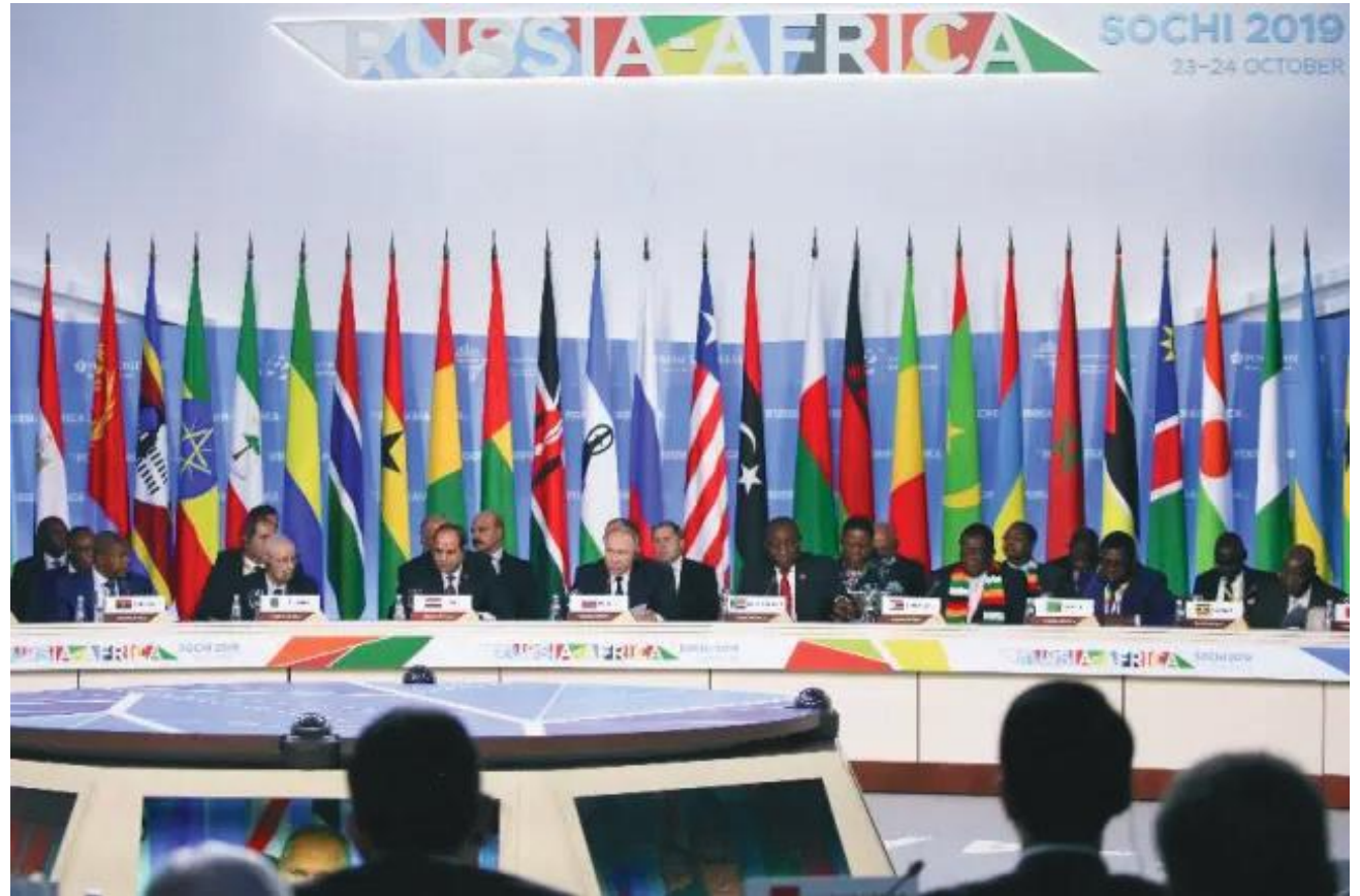
The organising-committee has announced the programme

The main themes of the 'Integrated Security and Sovereign Development' pillar will be international security, political stability, food security, as well as joint efforts to combat epidemics and emergencies. The key question that experts plan to