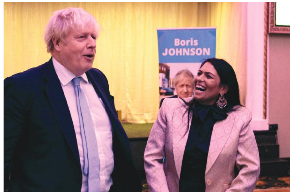
Former Prime Minister Boris Johnson and Home Secretary Priti Patel initiated the Rwanda asylum agreement.

Sending asylum seekers to Rwanda is a policy devised by the UK Government as a new plan for immigration management. It seeks to reduce the number of people