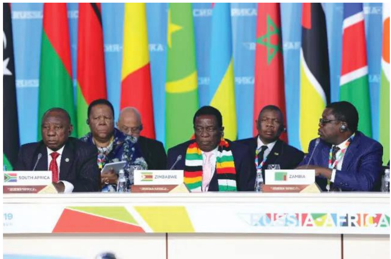
Bolstering ties between Russia and Africa is the key focus

answer as part of this pillar is: "How can Russia's experience in ensuring security be beneficial to African countries?"