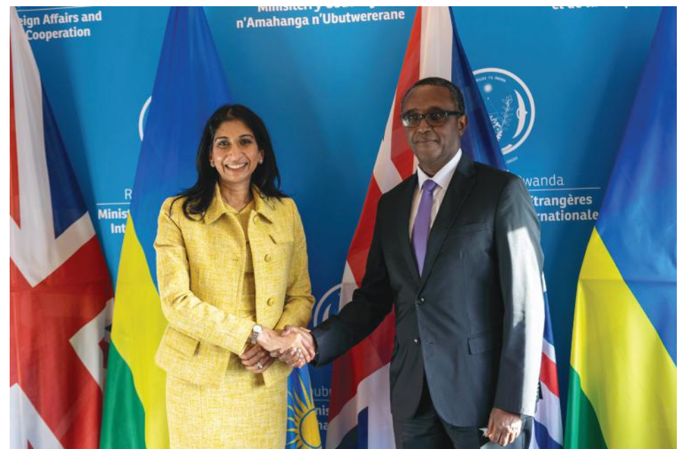
Continuing partnership Home Secretary Suella Braverman flew to Kigali, where she met President Paul Kagame. She signed an expansion agreement to settle asylum seekers in Rwanda.

The story so far...British government progress report on their immigration policy