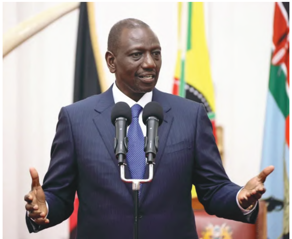
President William Ruto

Ruto said he is looking forward to tremendous progress in institutional reforms at the African Union, that will enable the AU Commission, AU organs and specialised agencies to rise to their full potential and fulfil their mandate of facilitating the emergence of a union that can effectively participate in global affairs.