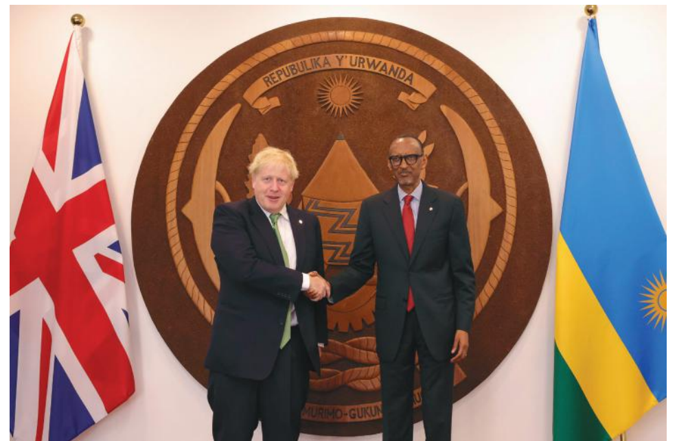
To add mileage to the Rwanda asylum programme Boris Johnson flew to Kigali where he met President Paul Kagame.