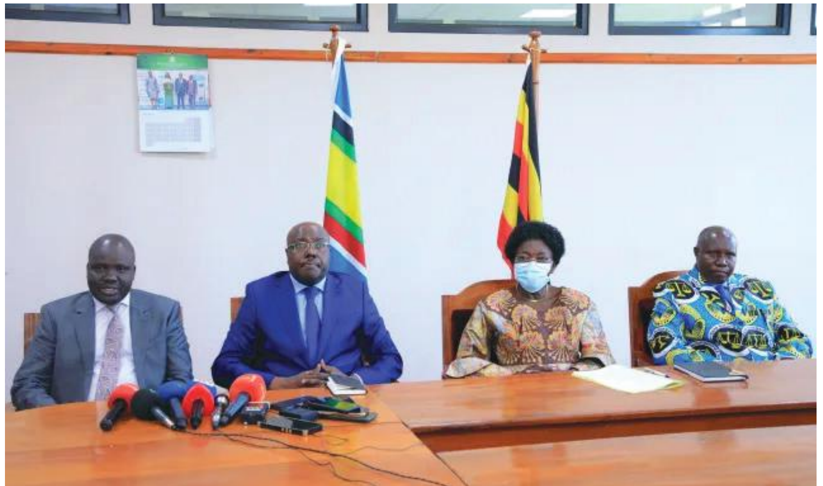
Uganda's 1st Deputy Prime Minister and Minister for East African Community (EAC) Affairs, Rebecca Alitwala Kadaga second right

• Kadaga was speaking during a media briefing on the upcoming 2nd EAC World Kiswahili Day celebrations to be held in Kampala, Uganda from 5th – 7th July, 2023. She said that it was a great honour for East Africa as the home of Kiswahili to have it as the first indigenous African language to be recognised by UNESCO.