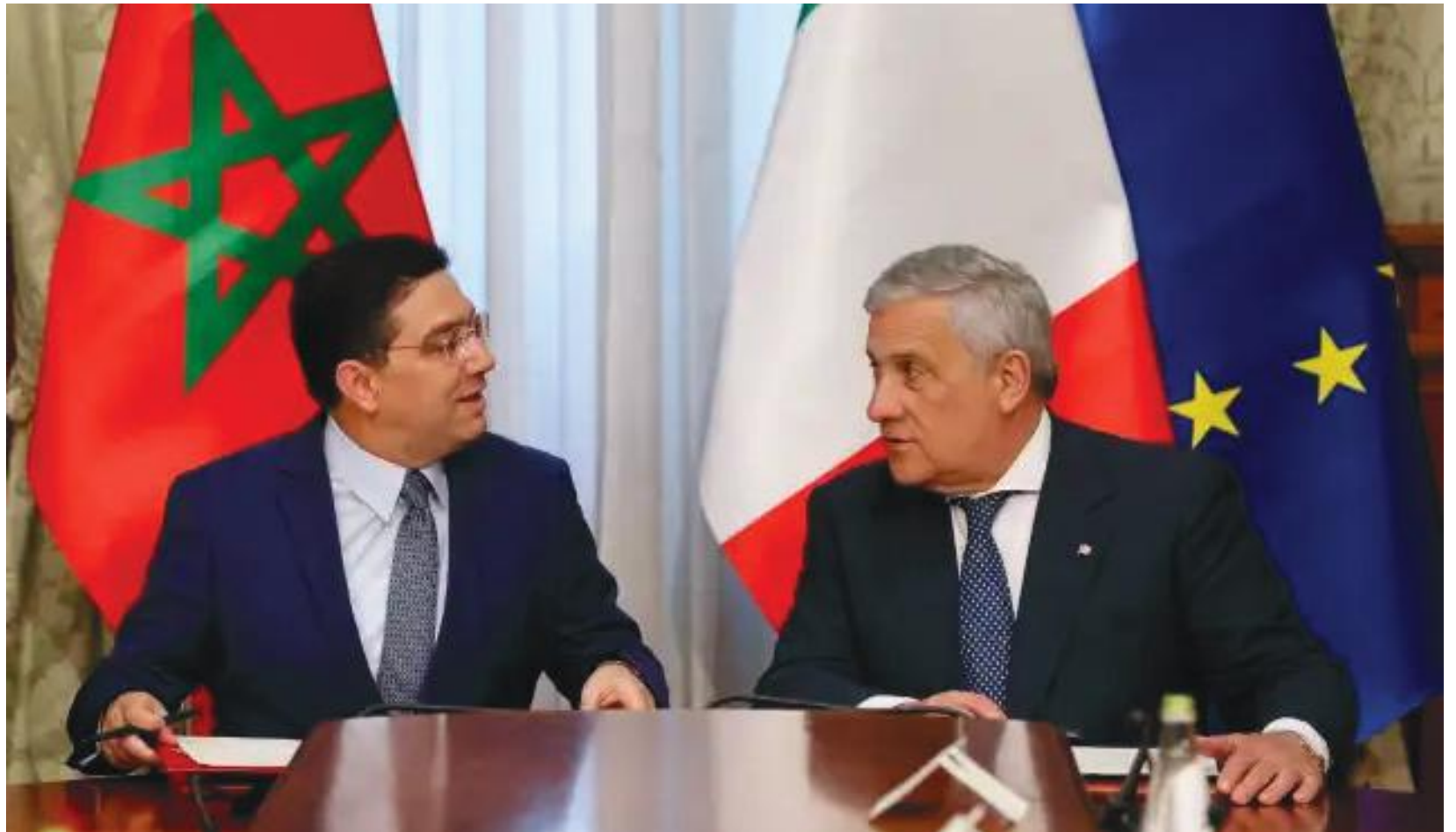
Nasser Bourita, the Moroccan Minister of Foreign Affairs, African Cooperation, and Expatriates, and Antonio Tajani, his Italian counterpart

It is stated in the same Action Plan that Italy "encourages all parties to pursue their commitment in a spirit of realism and compromise,