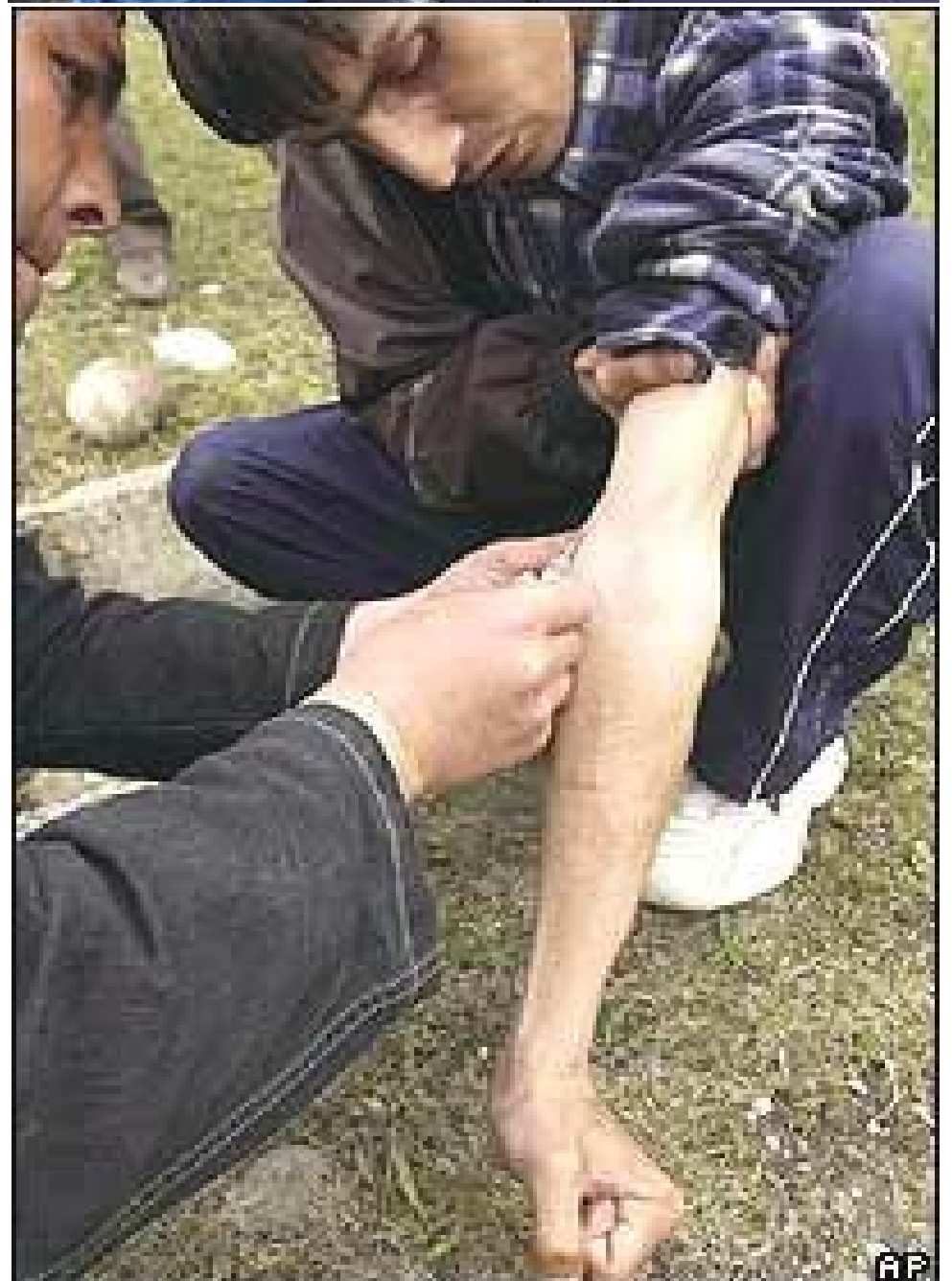
Uzbekistan injecting drug among youth