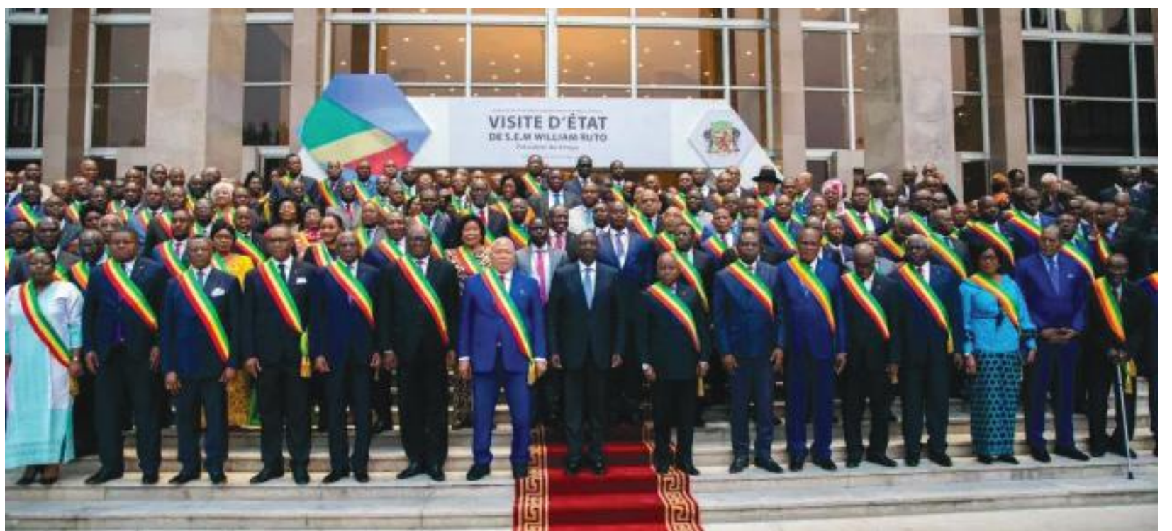
President William Ruto (Centre) during a joint session of the Congolese Parliament in Brazzaville

He noted that African leaders must speak with one voice and called for collective climate action on a global