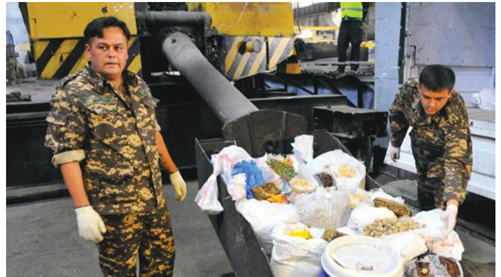
Uzbekistan steps up anti-drug efforts among youth

In conclusion, it is necessary to avoid becoming a victim of bad vices such as drug addiction. It is the duty of each of us to be aware of what is happening in the society and around us, and to fight against the rise of drug addiction, without being indifferent to the fate of the whole humanity.