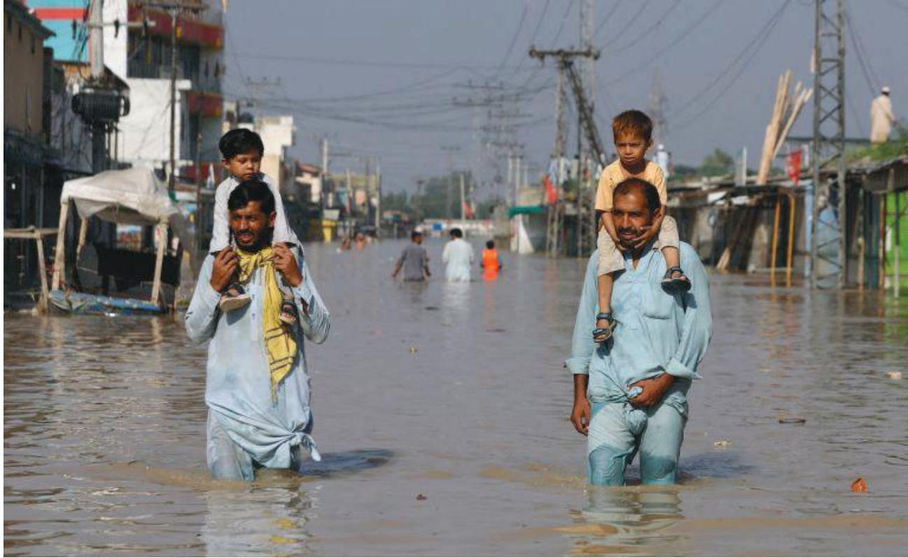
Men carry children on their shoulders and wade along a flooded road, following rains and floods during the monsoon season in Nowshera, Pakistan

Heavy monsoon rains in Pakistan over the past week killed at least 50 people across the country, nearly a year after massive flooding killed more than 1,700 people and affected 33 million others.