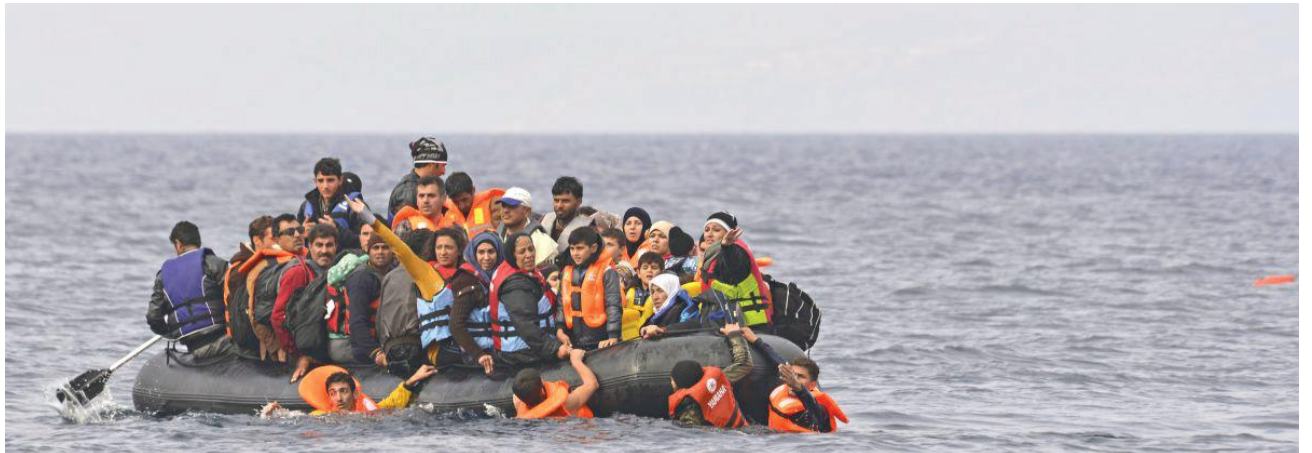
Seeking a new home... These boat people flee their countries for a new life in Britain, risking their lives only to be booted out to Rwanda.

Human rights bodies such as the London-based Liberty have slammed the 2023 Immigration Bill, known as the Refugee Ban Bill, calling it an assault on human rights that will put people's lives at risk and allow the Government to abuse rights with impunity. The Rwanda policy is a plank of this Bill. "This Bill will violate the human rights of people needing safety and protection. Give the Home Secretary of the day unprecedented powers to make laws and life-changing decisions, evading Parliamentary scrutiny and giving the Government a free pass to commit human rights abuses, re-