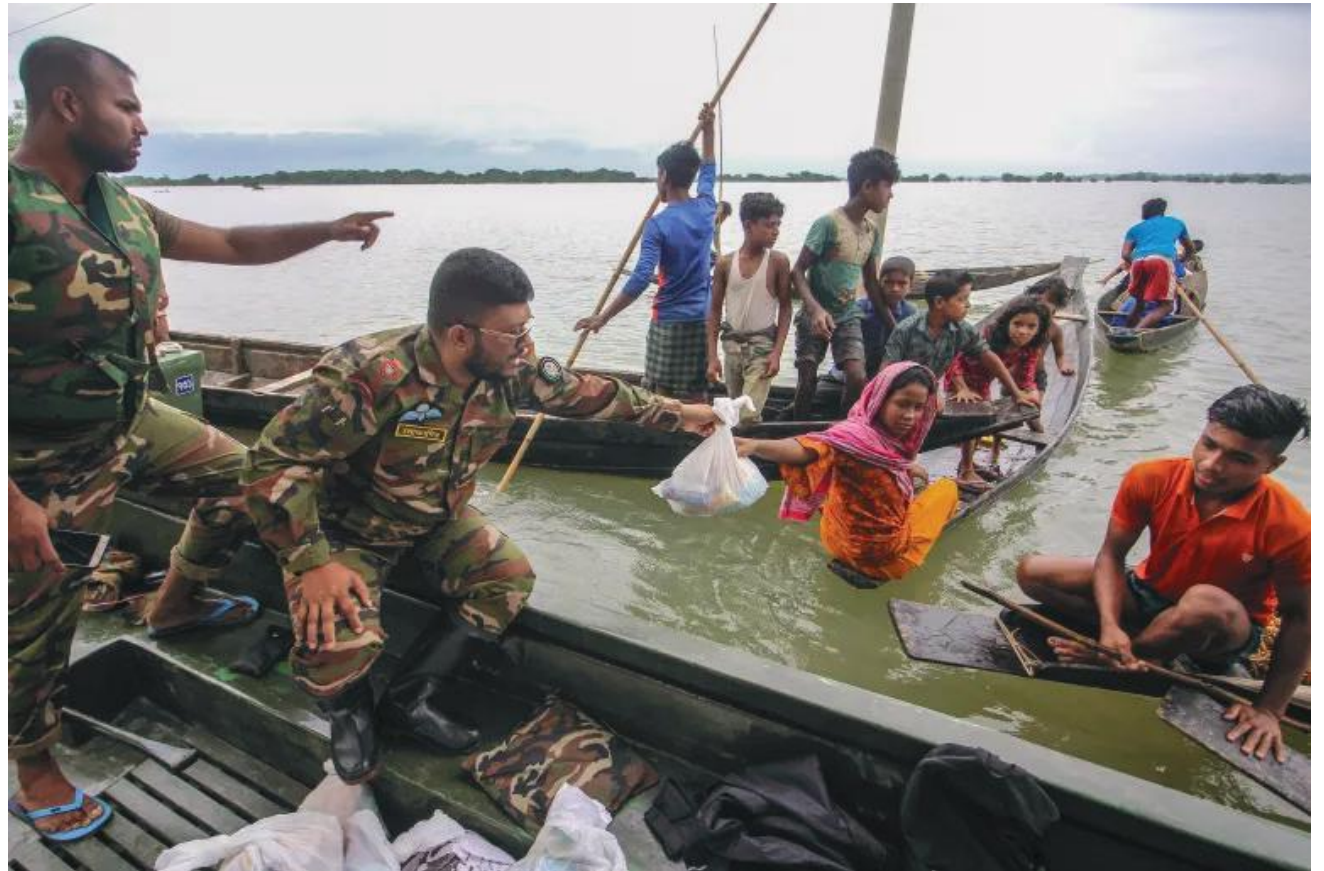
Soldiers provide food to residents following heavy monsoon rain in Goyainghat, Bangladesh

“Mosquitoes can breed in warmer areas which have now opened up. In fact, as humans are wilting in the heat, mosquitoes become