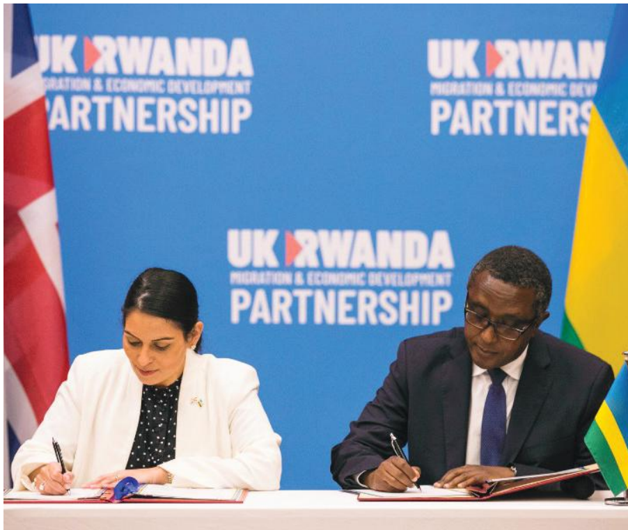
The contentious Rwanda asylum agreement signed on April 14, 2022, between former Home Secretary Priti Patel and Rwanda Foreign Minister Vincent Biruta in Kigali.