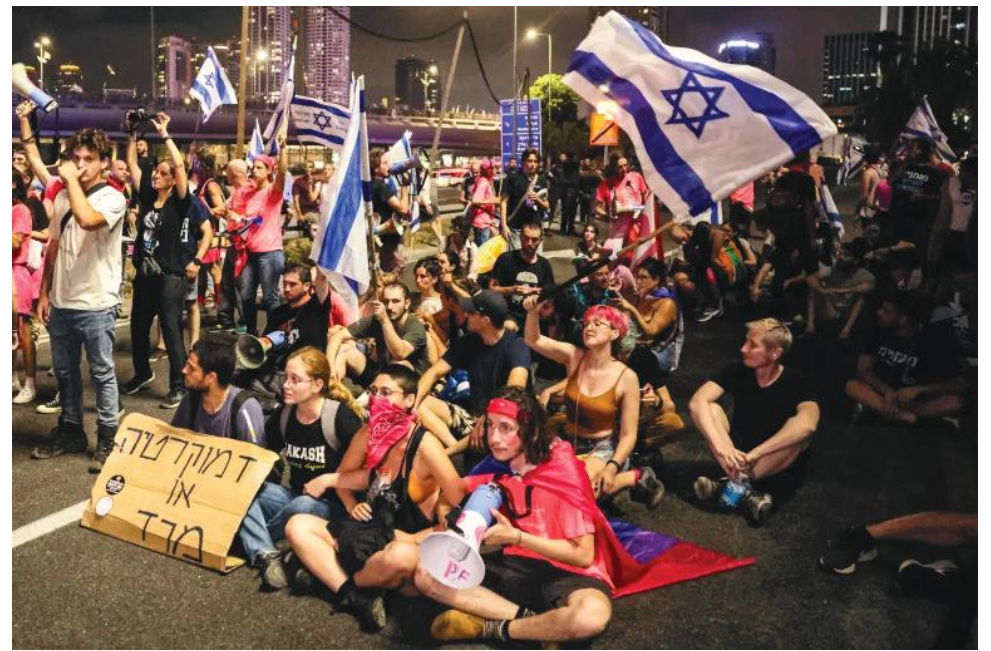
Demonstrators block a highway during protests against the Israeli government's judicial plan