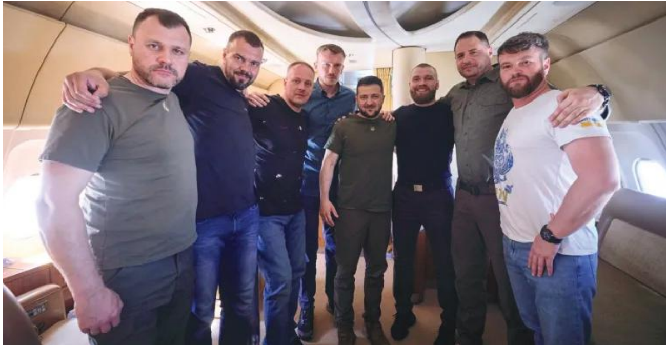
Ukrainian President Volodymyr Zelenskyy, centre, and other officials pose for a picture with commanders of defenders of the Azovstal Iron and Steel Works in Mariupol inside a plane as they return to Ukraine from Istanbul, Turkey July 8, 2023

Russia denounces the soldiers' return, accusing Kyiv and Ankara of violating a prisoner exchange deal under which the men were to remain in Turkey until the end of the war.