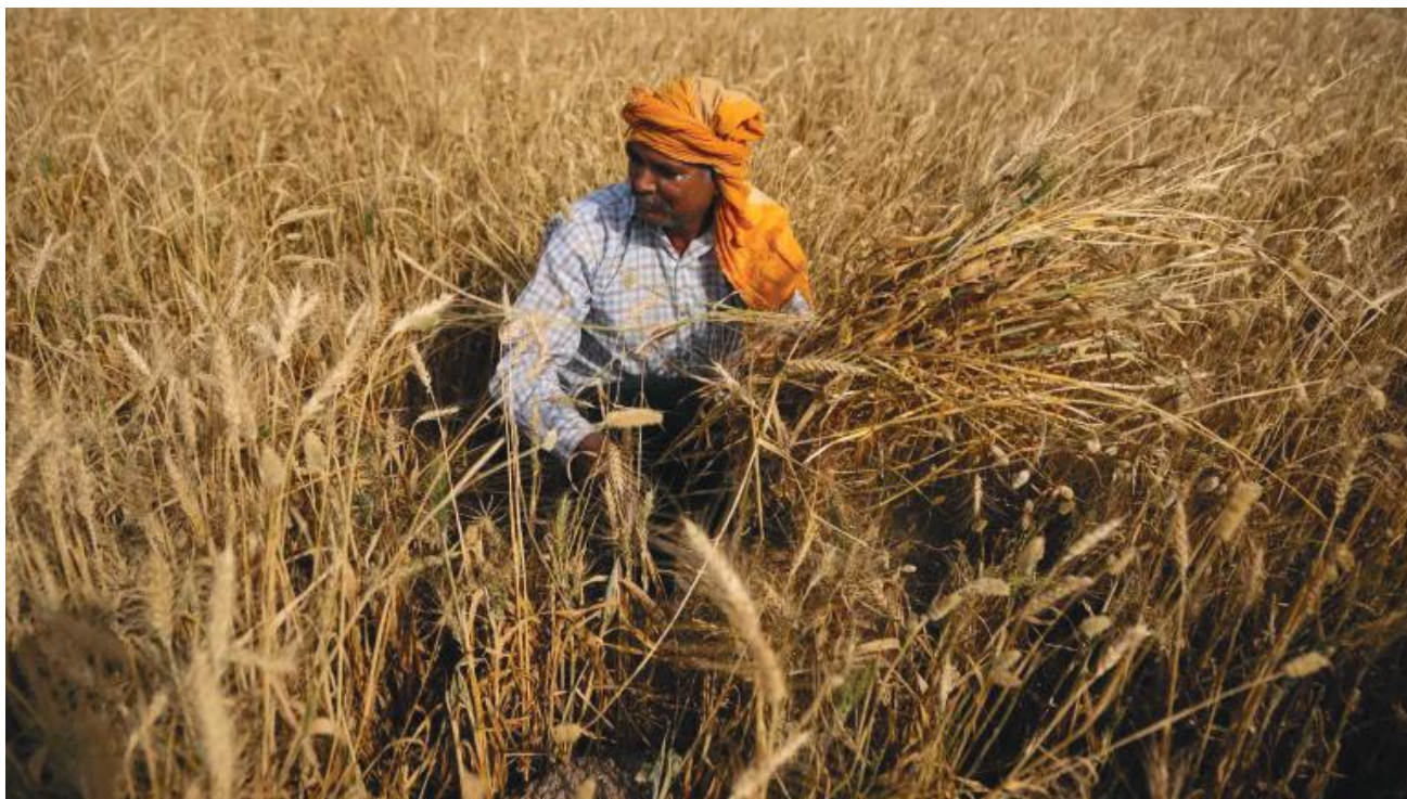
A farmer harvests wheat on the outskirts of Jammu in Indian-administered Jammu and Kashmir

A report published by activist group ActionAid in 2020 estimated the region could see up to 63 million people become migrants by 2050 as a result of extreme weather events.