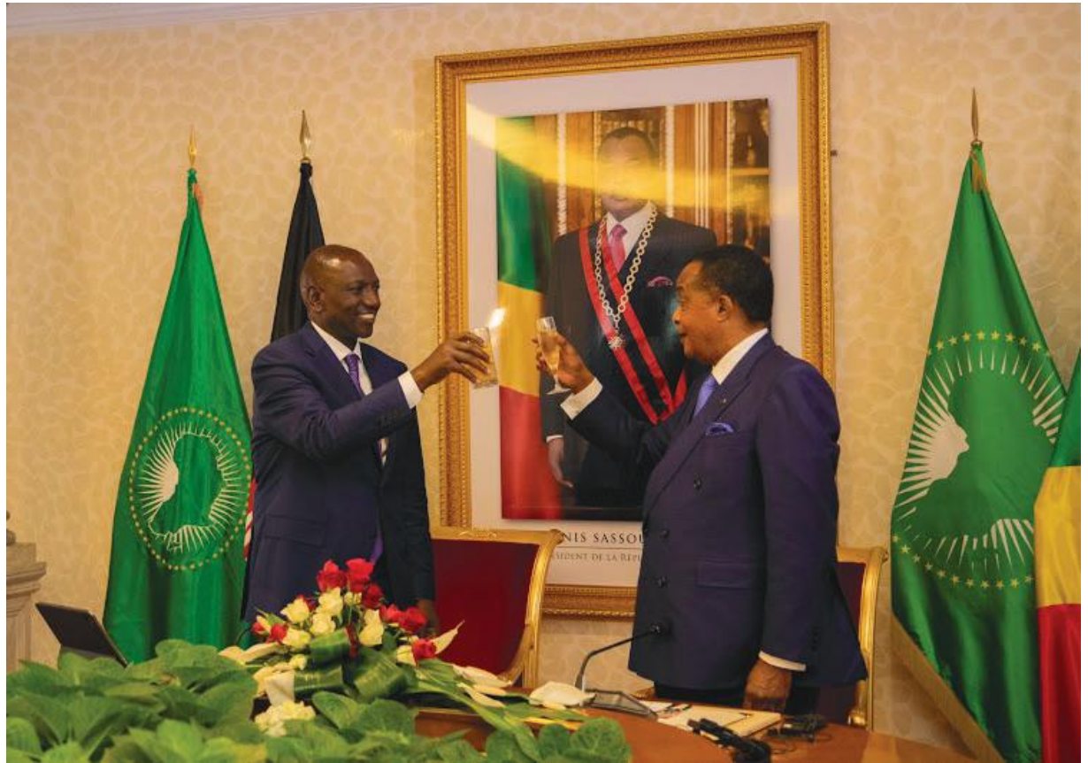
President William Ruto and President Denis Sassou N'Guesso