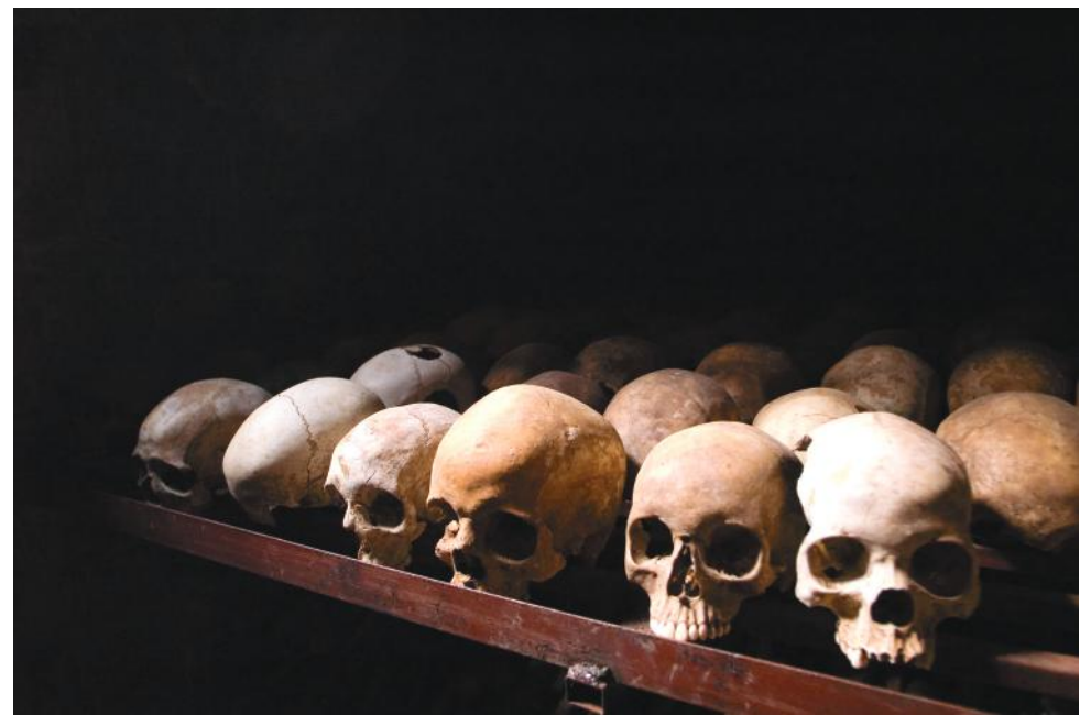
Rwanda's shame... A bloody reminder of the nation's recent past. A collection of human skulls, part of a museum exhibit near Kigali about the country's genocide.

"This is a cruel, reckless and desperate move from a government willing to rip up ev-