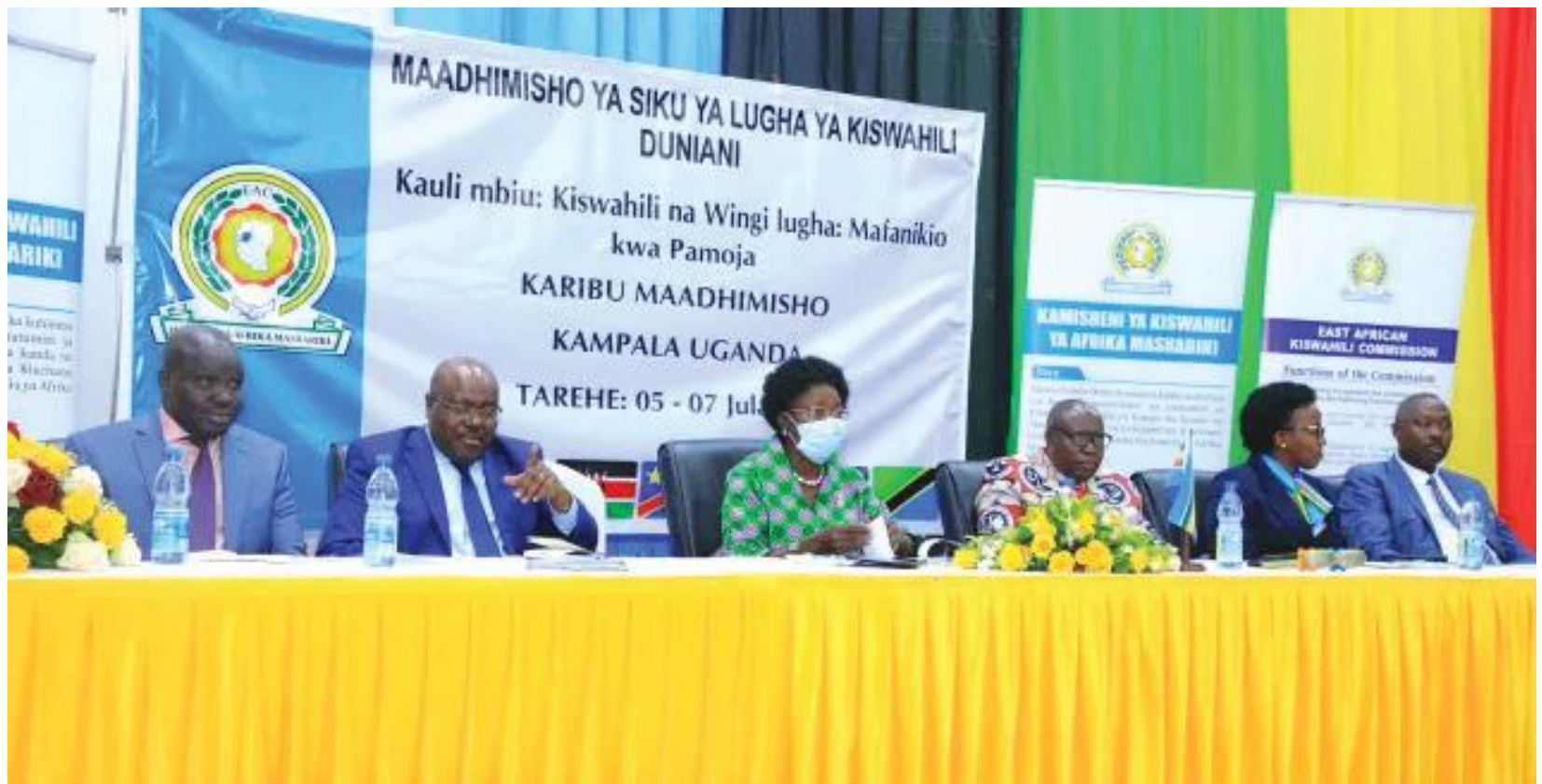
EAC official opening session of the 2nd EAC World Kiswahili Language Day celebrations in Kampala, Uganda, Kiswahili language scholar and University of Dar es Salaam