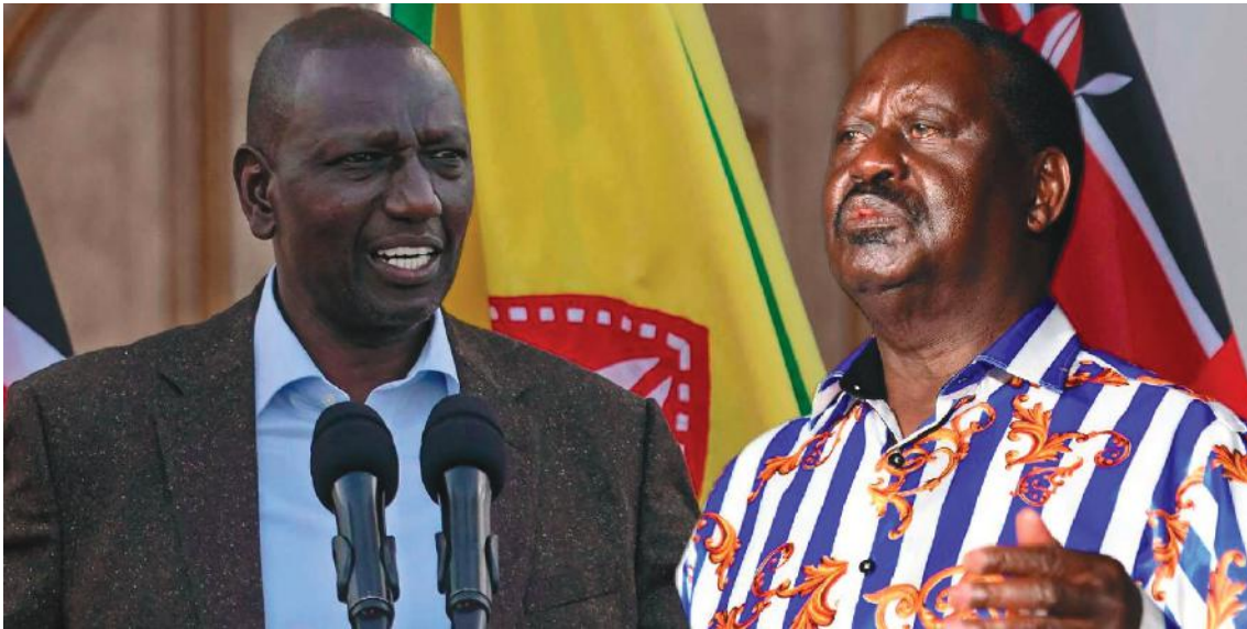
President William Ruto and Azimio Leaders Raila Odinga .

"This man was behind the 1982 coup, he tried to destabilize Kibaki's government and I have vowed that this time I will make sure there are no more violent demonstrations," he