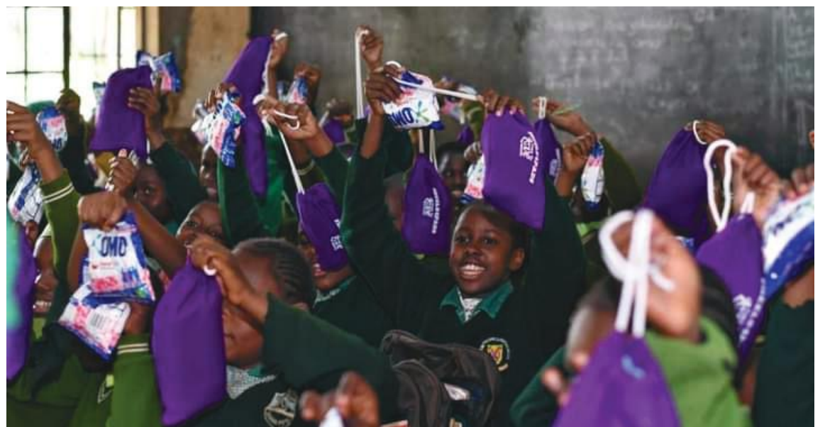
Girls holding reusable sanitary and washing detergent.