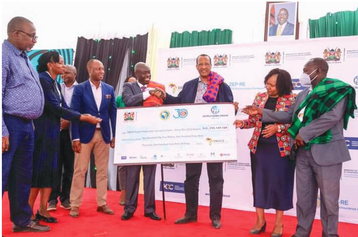
Deputy President Rigathi Gachagua handing over the cheque.

The government has launched a Sh15.9 billion projects for pastoralists in Arid and Semi-Arid Lands (ASALs) meant to safeguard them from drought as well as boost their economies.