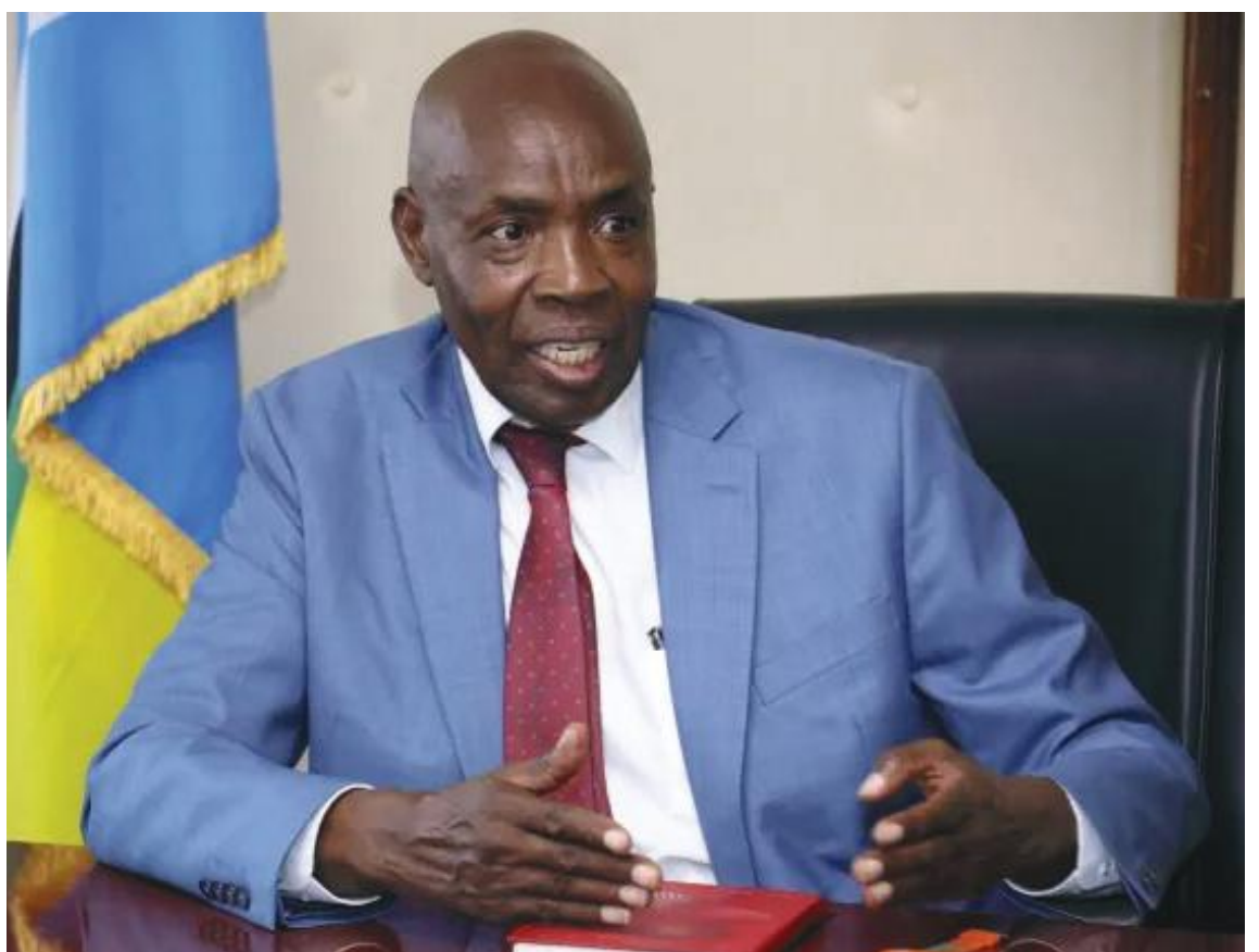
Education Cabinet Secretary Ezekiel Machogu

One pupil is still admitted while the rest were treated and discharged.