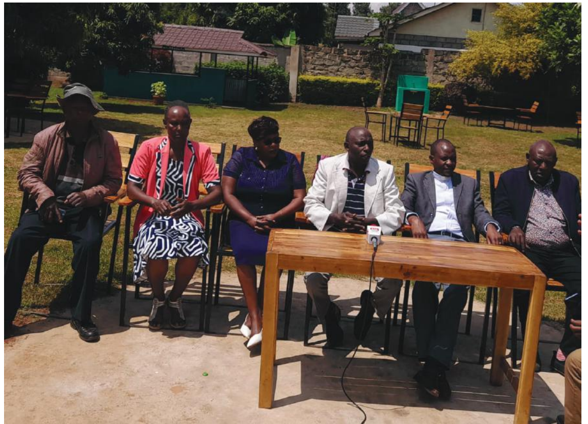
Nyeri County leaders addressing the media at Senior Chief Wambugu Palace in Nyeri town.

The other leaders called on the government to speed up reforms in various sub sectors that Kenyans rely on to get their daily bread and fund other activities.