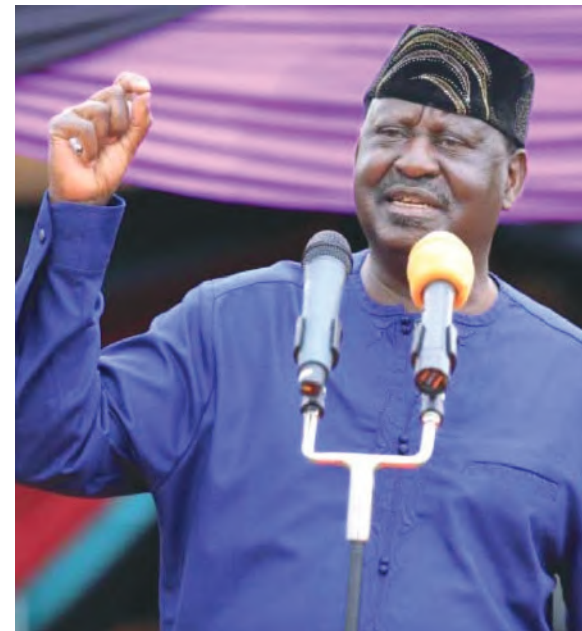
President William Ruto

County Politics: Will The Arrest Of Raila Help To Restore Peace, Normalcy? P.11