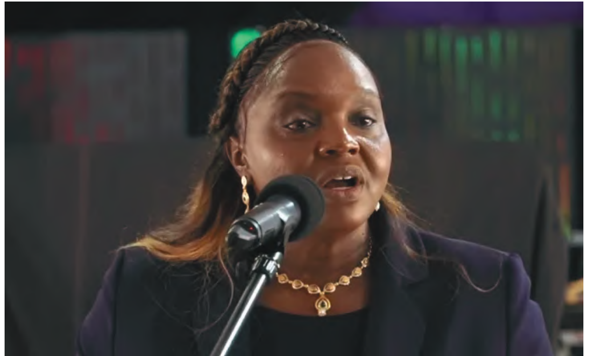
Spouse of the Deputy President Pastor Dorcas Rigathi.

“We know that without gender equality we will not achieve SDG (Sustainable Development goals) and we will not achieve a just and a fair world. This deep belief is making us to have the promotion of gender equality in all our policies,” she said.