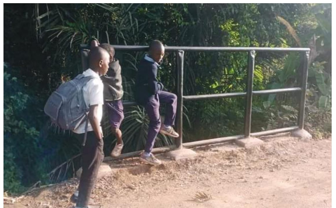
Mboone River Bridge In Igembe Gets Barrier Rails To Enhance Safety.