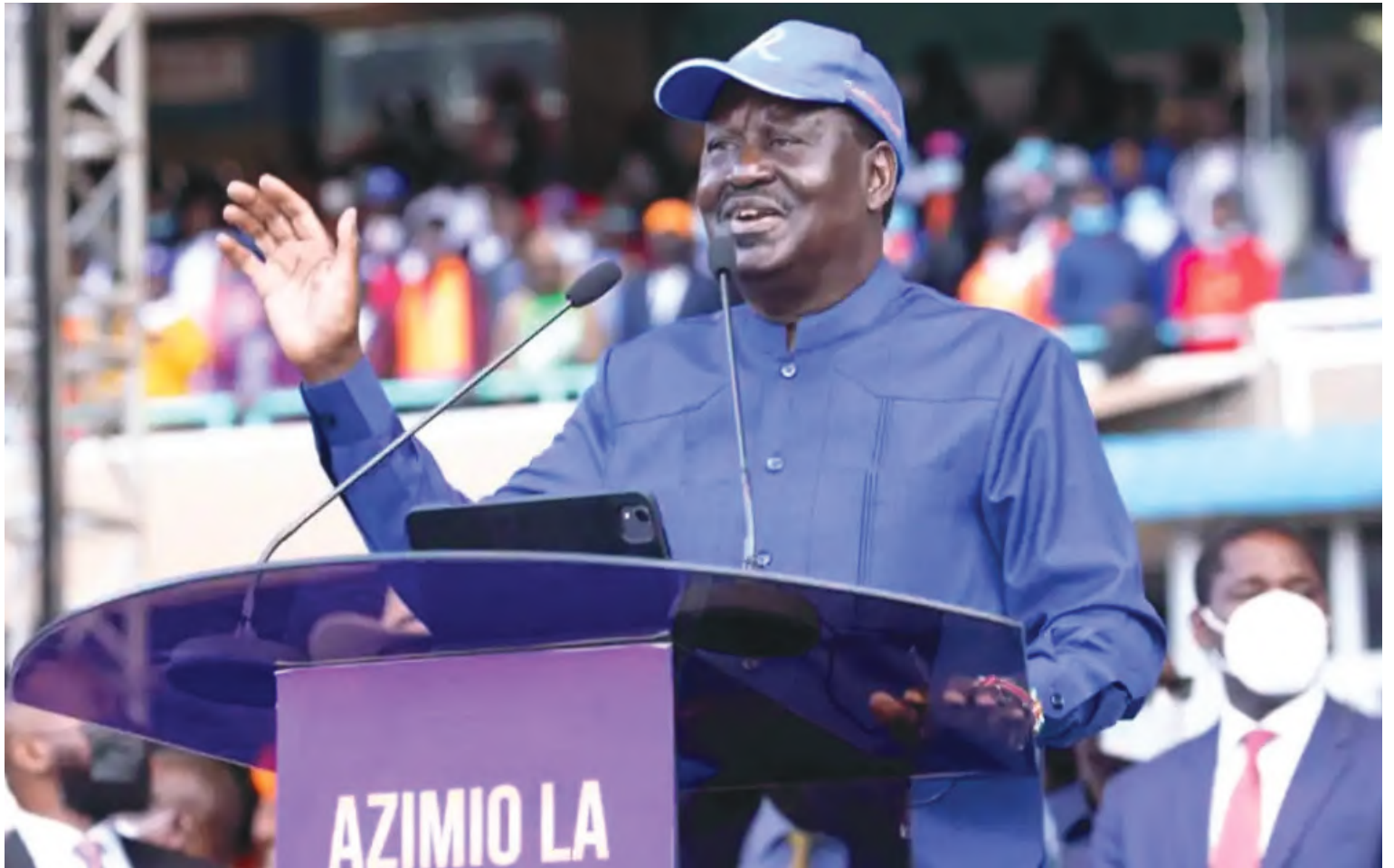
Azimio La Umoja-OKA party leader Raila Odinga .

The question of whether the Azimio La Umoja-OKA party leader Raila Odinga should be arrested or not continues to elicit mixed reactions.