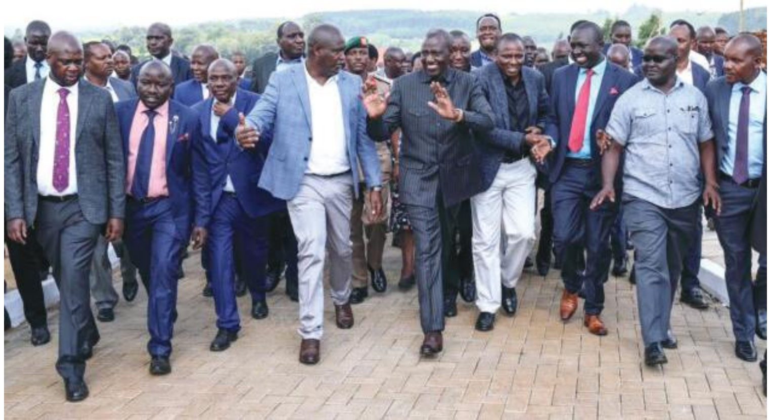
President William Ruto in black suit