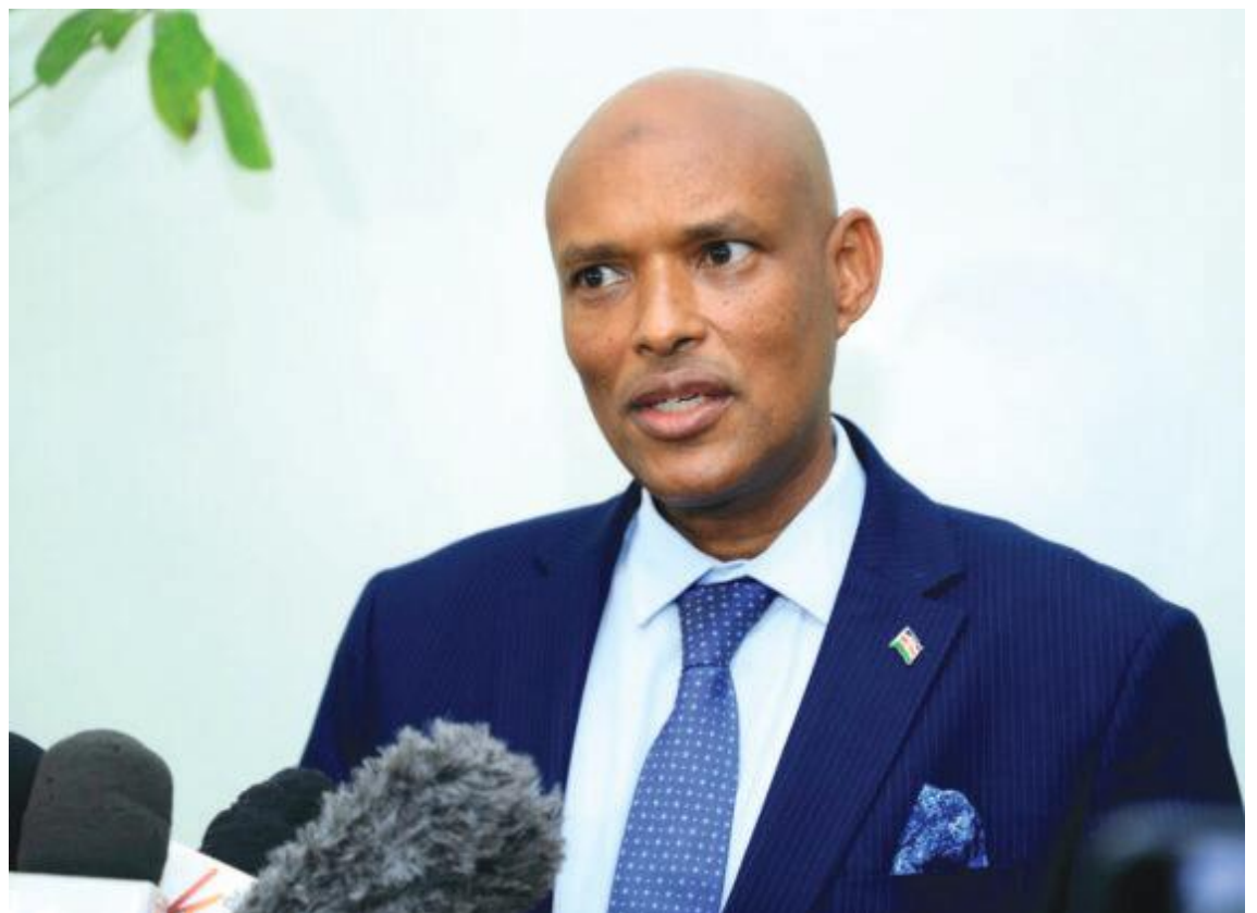
DCI boss Mohammed Amin.

Section 23 states that an offender shall on conviction, be liable to a fine not exceeding 5 million shillings or to imprisonment for a term not exceeding ten years, or to both.”