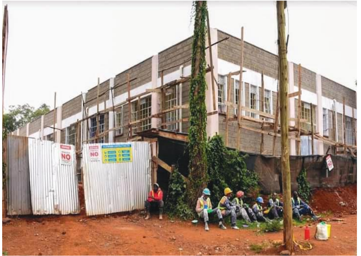
Nyeri Town Residents Welcome New Maternity Block.

He also expressed his gratitude to the key partners for their immense support in the planning, funding, and actualization of the project.