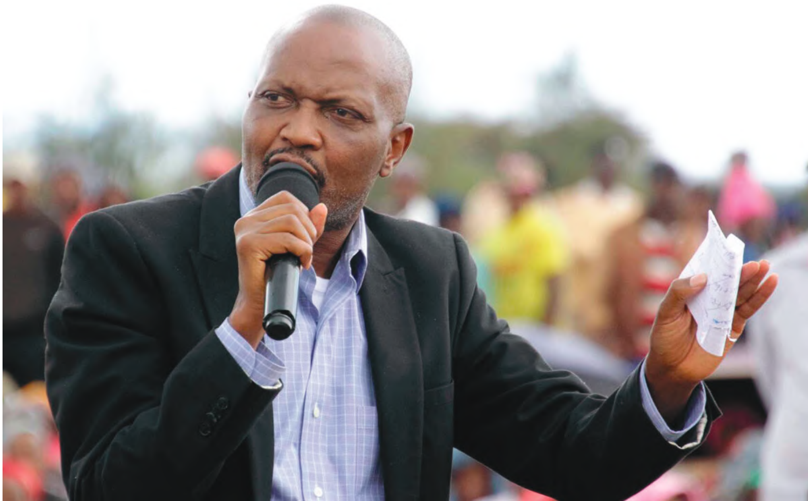
Industrialization, Trade and Investment Cabinet Secretary Moses Kuria.