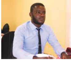
By: Danstan Akwiri @themtkenyatimes