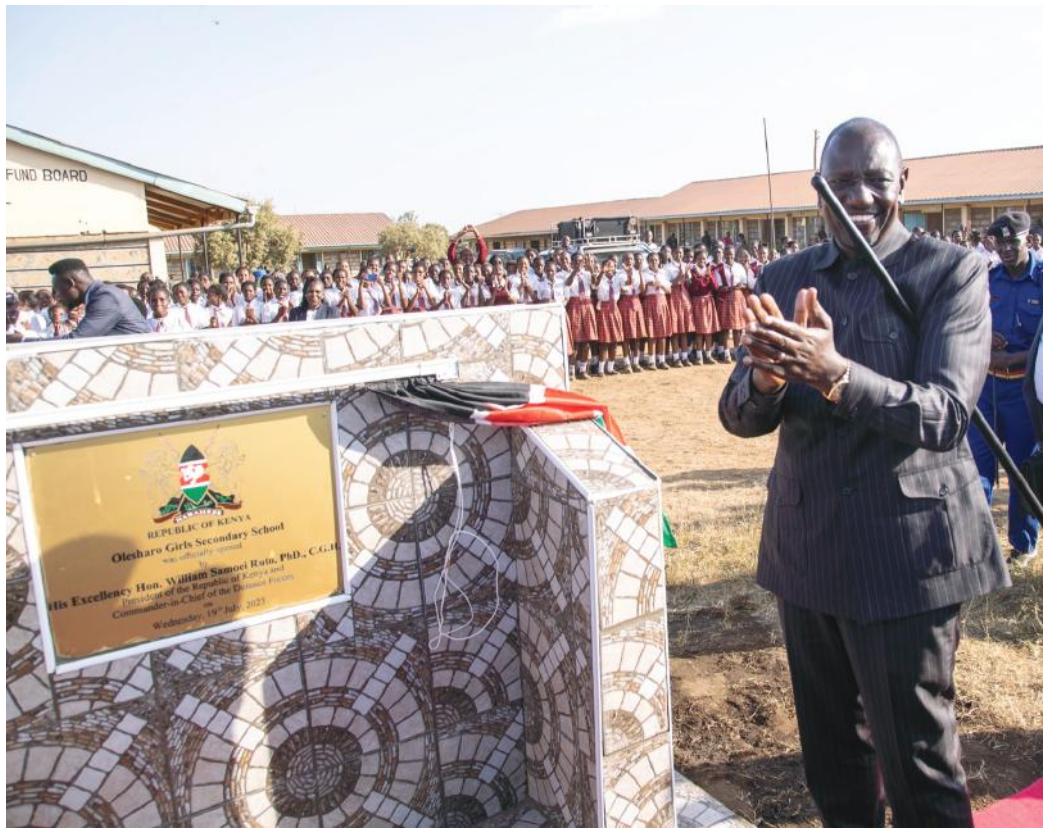
President William Ruto in black suit

President Ruto implored upon all Kenyans to obey the rule of law, noting that the country was guided by the Constitution. He asked police to deal firmly with unruly individuals who destroy other people's property. "Police have firm instructions to take action against those who destroy other people's property," said President Ruto.