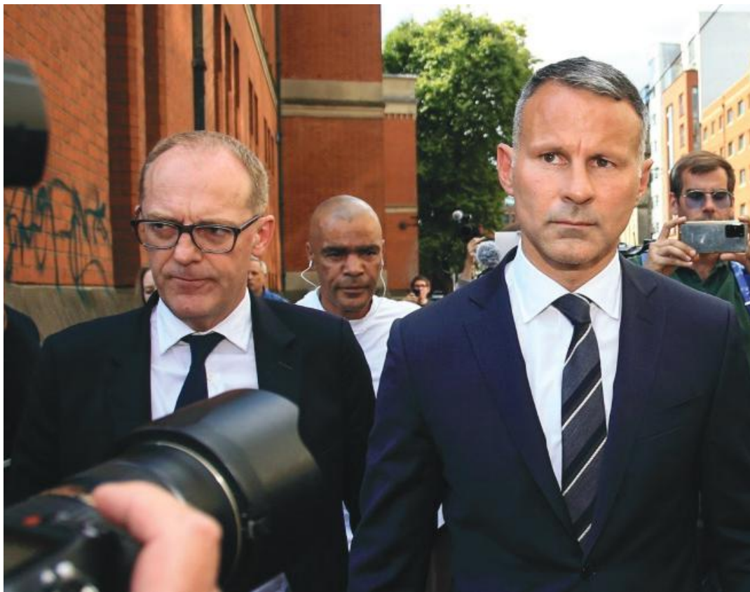
Former Manchester United star and Wales manager Ryan Giggs leaves the Manchester Minshull Street Crown Court, in Manchester, on August 8, 2022 after attending his trial for assaulting his ex-girlfriend.