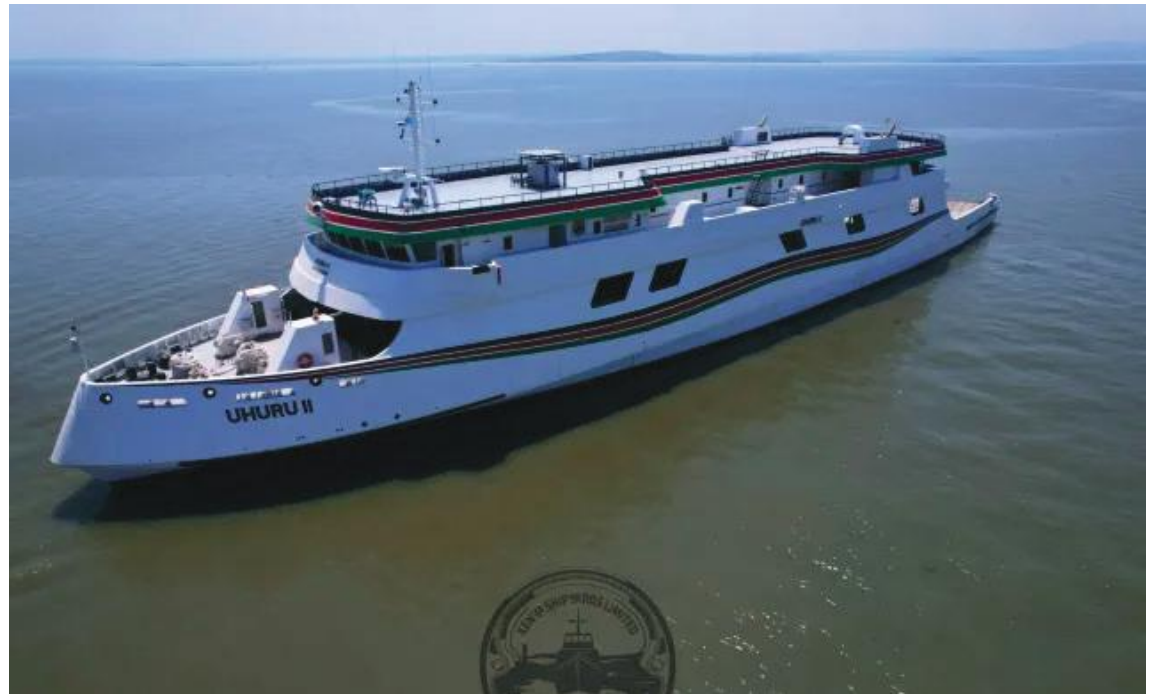
Mv Uhuru II.

They are equipped with Caterpillar 3500 series four-stroke, V-type, turbocharged marine diesel engines that are well suited for the demands of