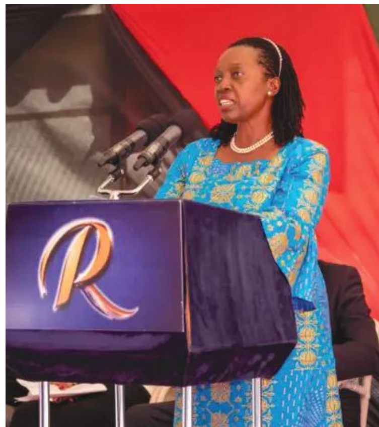
Azimio la Umoja -One Kenya co-principal Martha Karua.

In Migori County two men are nursing injuries at Migori County Referral hospital after allegedly being shot during the protests.