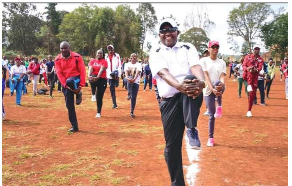
Nyeri Governor Mutahi Kahiga.

The Department of Health carried out various health checks on non-communicable diseases during the event.