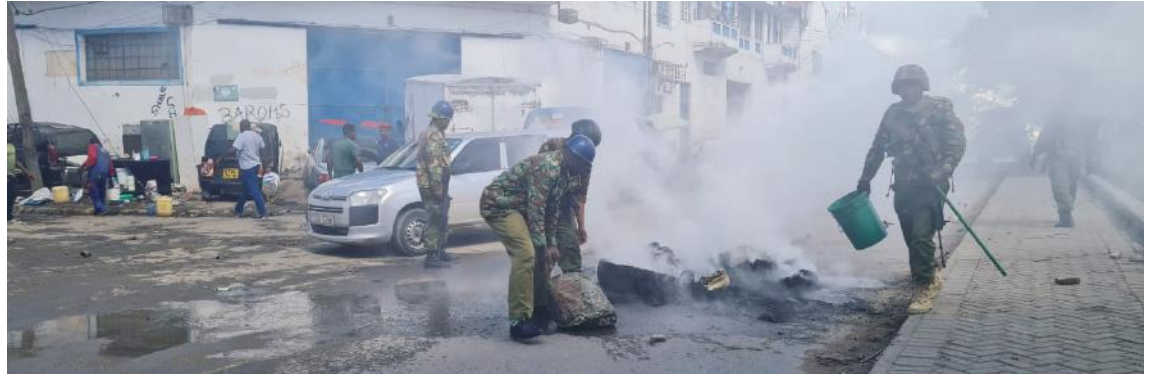
In Mombasa, demonstrators engaged police in running battles on July 19, 2023 during protests against the high cost of living which was banned by the government..

stration, police described the protests as a "threat to national security" and the government declared it would not allow lawlessness to go unchecked.