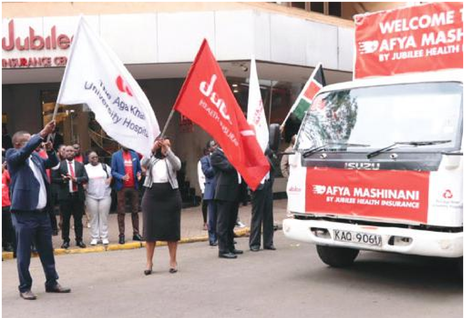
The initiative seeks to reinforce the company's commitment to improving healthcare access and promoting overall well-being for all Kenyan citizens.

Jubilee Health Insurance has today launched a one week Afya Mashinani initiative in a bid to advance accessible and affordable healthcare services to underserved communities.