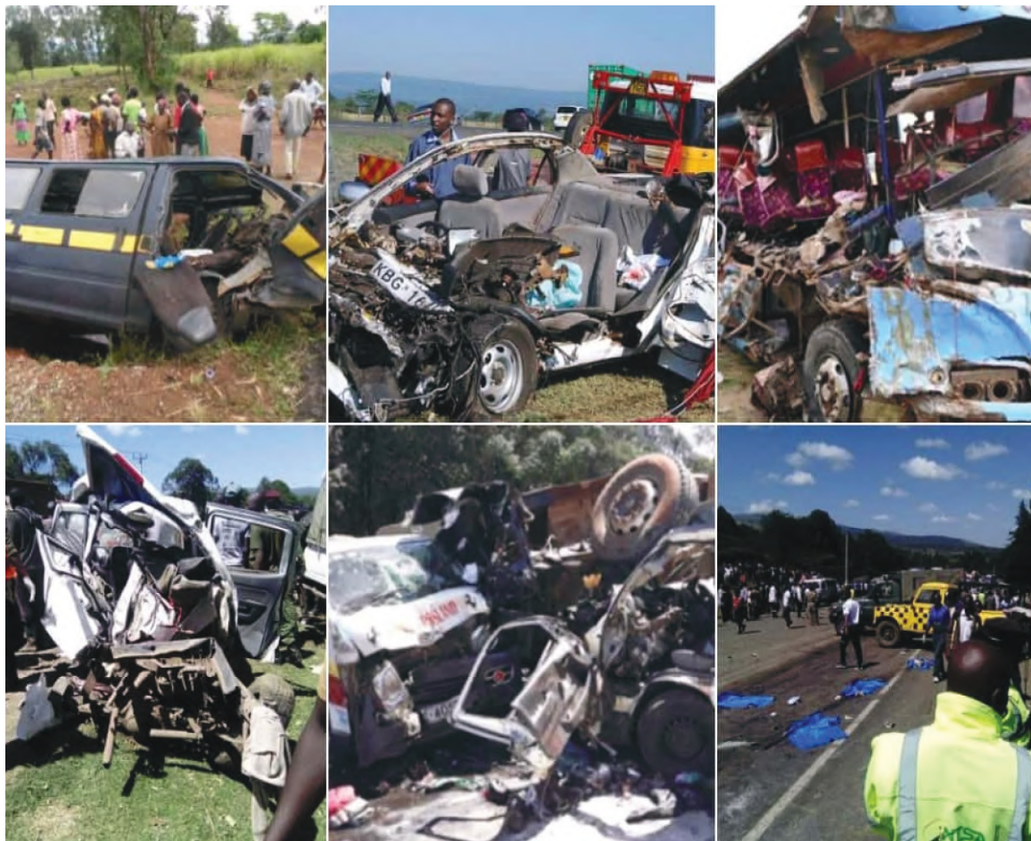
Increased Road Accidents In Kenya.

Kenya, like many other developing nations, is facing a persistent challenge of escalating road accidents. These tragic incidents not only claim countless lives but also impose a significant economic burden on the nation. Of late, the Nakuru-Kericho Highway has been on the headlines where tens of people have lost their lives and others injured. To reverse this alarming trend, it is crucial for the government, communities, and individuals to come together and implement effective measures aimed at improving road safety. In this opinion piece, I will explore actionable solutions that can make a tangible difference in reducing road accidents and creating a safer driving environment in Kenya.