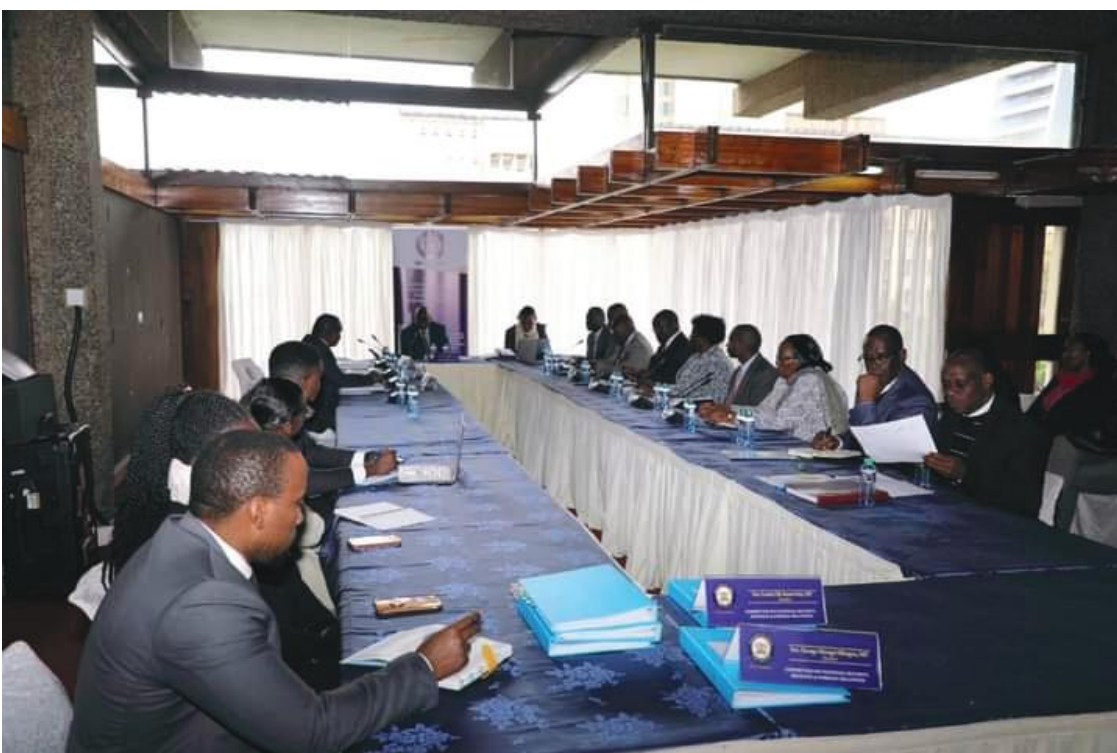
The Senate Committee during yesterday's session.

The Commission requested the Senate Committee on Security in the spirit of creating harmony in the security sector to invite the Inspector General of Police to explain why he is unable to comply with the law, the request was accepted by the lawmakers in order to solve the misunderstanding between the Commission and NPS.