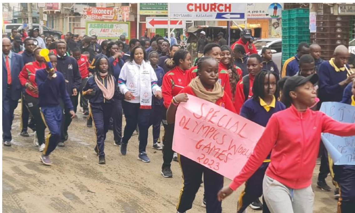
Kipipiri Member of Parliament Wanjiku Muhia in while during a walk.

Wanjiku is the architect of different pieces of legislation centrally designed to dignify the PwDs. For instance, she is celebrated for midwiving the implementation of the law for persons with disabilities. The law stipulates that all TV stations must provide a sign language interpreter for the news and other necessary programmes geared towards including the persons with hearing