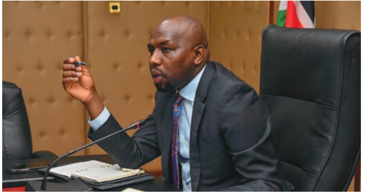
Transport Cabinet Secretary Kipchumba Murkomen .

He also stated that the interlinking of the dashboard cameras and vehicle