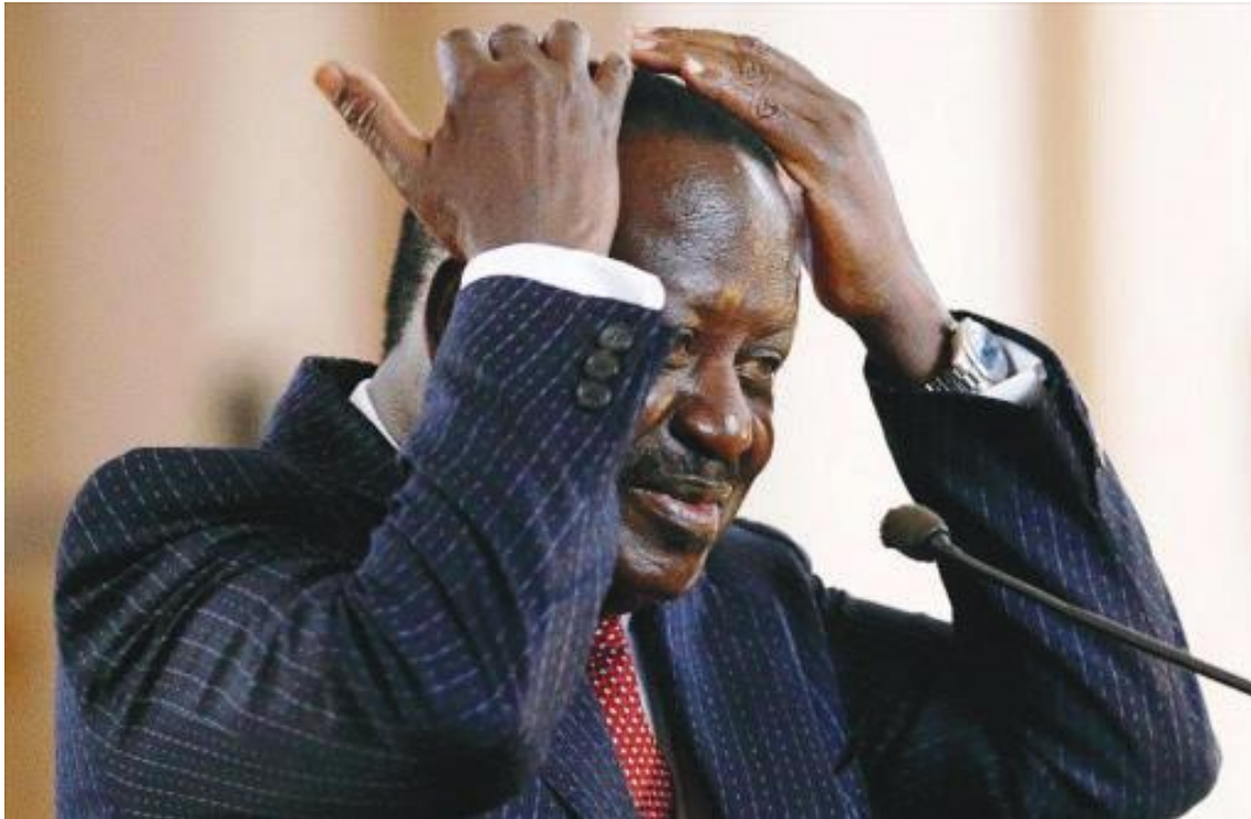
Azimio La Umoja One Kenya Party leader Raila Odinga .

I doubt he stands any chance of having his way. First, majority of Kenyans were not yet born when the first Saba