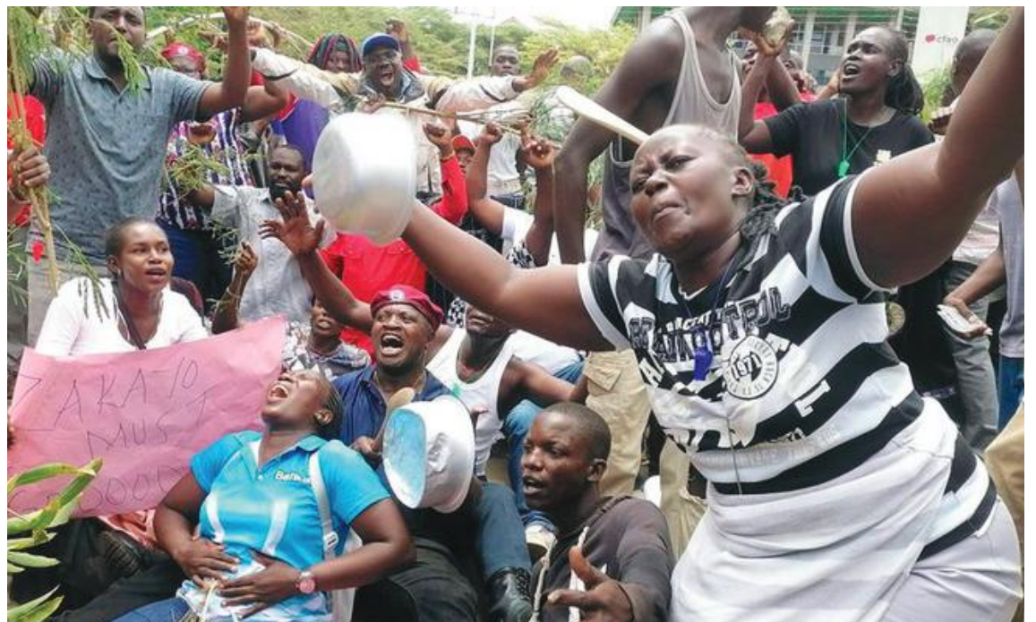
Kisumu residents take to the streets to protest against the rising cost of living

Among the minority who are able to save, the funds are used for various purposes, with the most common being general saving/investment accounts to earn interest (19 percent) unexpected/emergency needs (16 percent), and periodic education costs.