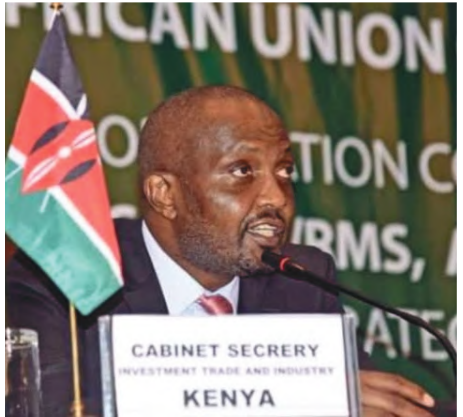
Investments, Trade and Industry Cabinet Secretary Moses Kuria during a past event.