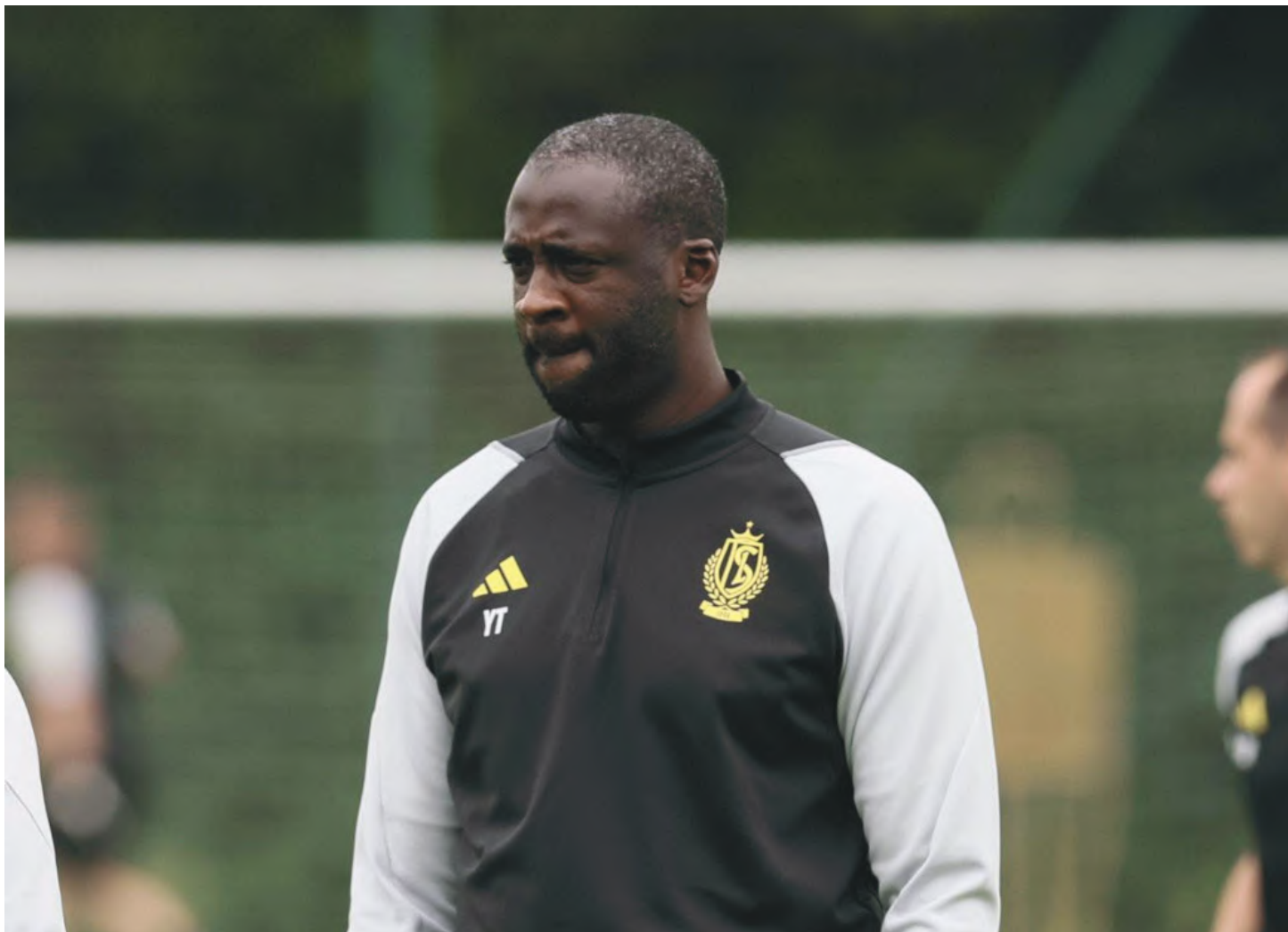
Yaya Toure.

Yaya Toure hopes the assistant coach job at Standard Liege will help him move one step closer to managing in the Premier League in the future.