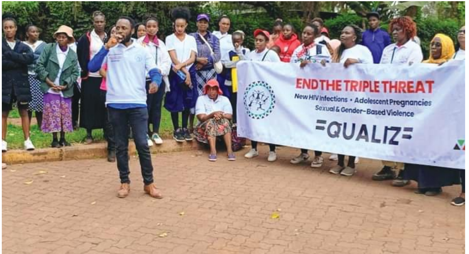
Kiambu County Conducts Sensitization Walk To Address Triple Threat.

Department of Health in Kiambu County has conducted a sensitization walk to address the Triple threat of New HIV infections, Adolescent Pregnancies and sexual and gender-based violence in the community.