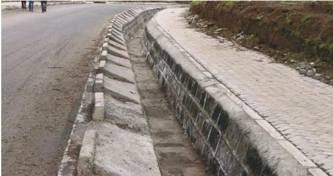
Nakuru City Undergoing Roads Improvement

He said enhancing road connectivity and improving the overall transport infrastructure would address traffic congestion and intensify security in various neighborhoods within the city, emphasizing that street lights will be installed along the roads to enable long hours of business.