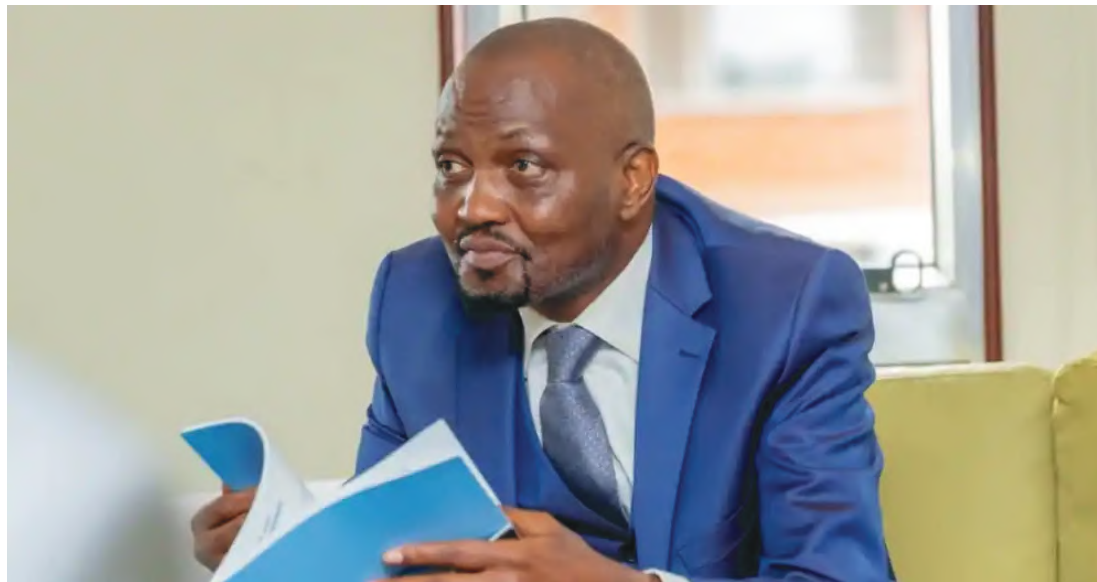
Investments, Trade and Industry Cabinet Secretary Moses Kuria during a past event.

The meeting represents a significant opportunity for African nations to collaborate, strengthen regional inte-