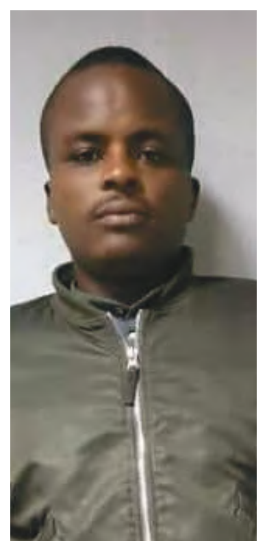
Motorcycle Theft Suspects.