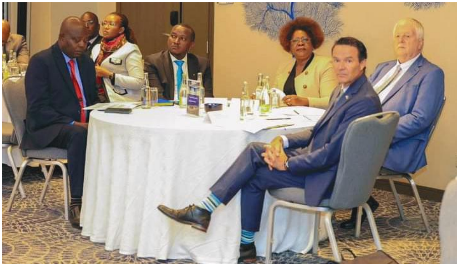
Cabinet Secretary Alice Wahome and Maarten Brouwer who is the Kenya's Ambassador of the Kingdom of the Netherlands among other guests during yesterday's event..

The Ministry of Water, Sanitation, and Irrigation (MoWSI), with the support of the Government of the Kingdom of the Netherlands and the Water and Sanitation Development Partners Group, commissioned a water sector study in July 2022 with the overarching objective of unlocking the local capital market to fund the development of water and sanitation infrastructure in Kenya.