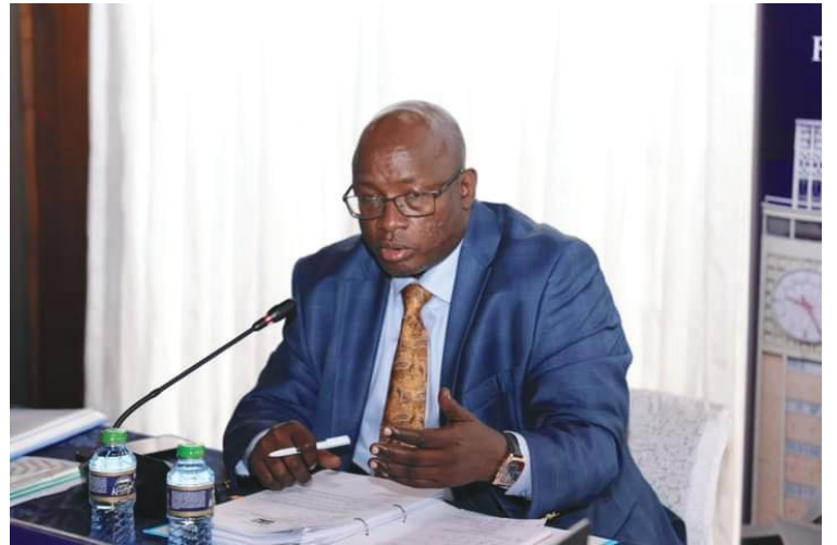
Baringo Senator William Cheptumo.