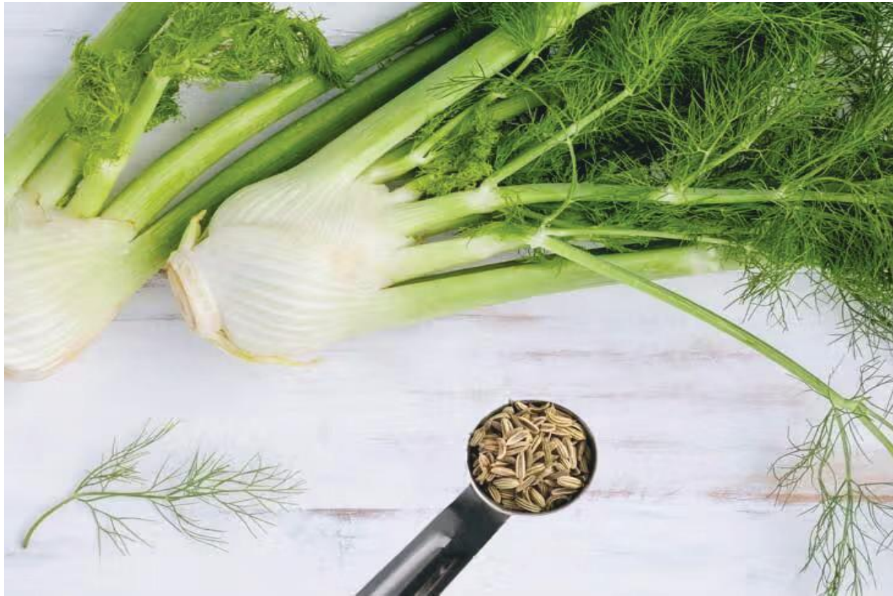
Fennel and Fennel Seeds