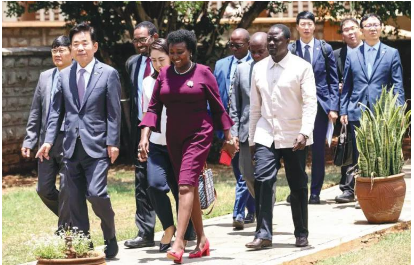
Kenya – Romania parliamentarians