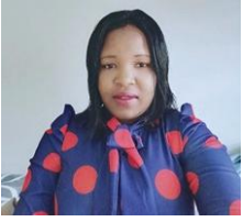
By: Abigirl Phiri @themtkenyatimes