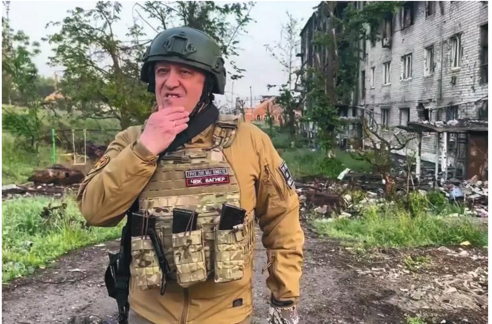
Yevgeny Prigozhin, the late chief of the Wagner mercenary force, is seen in Bakhmut, Ukraine, in May 2023

Russian leader says grenade fragments were found in the bodies of those killed in the jet crash in which Wagner's Yevgeny Prigozhin died.