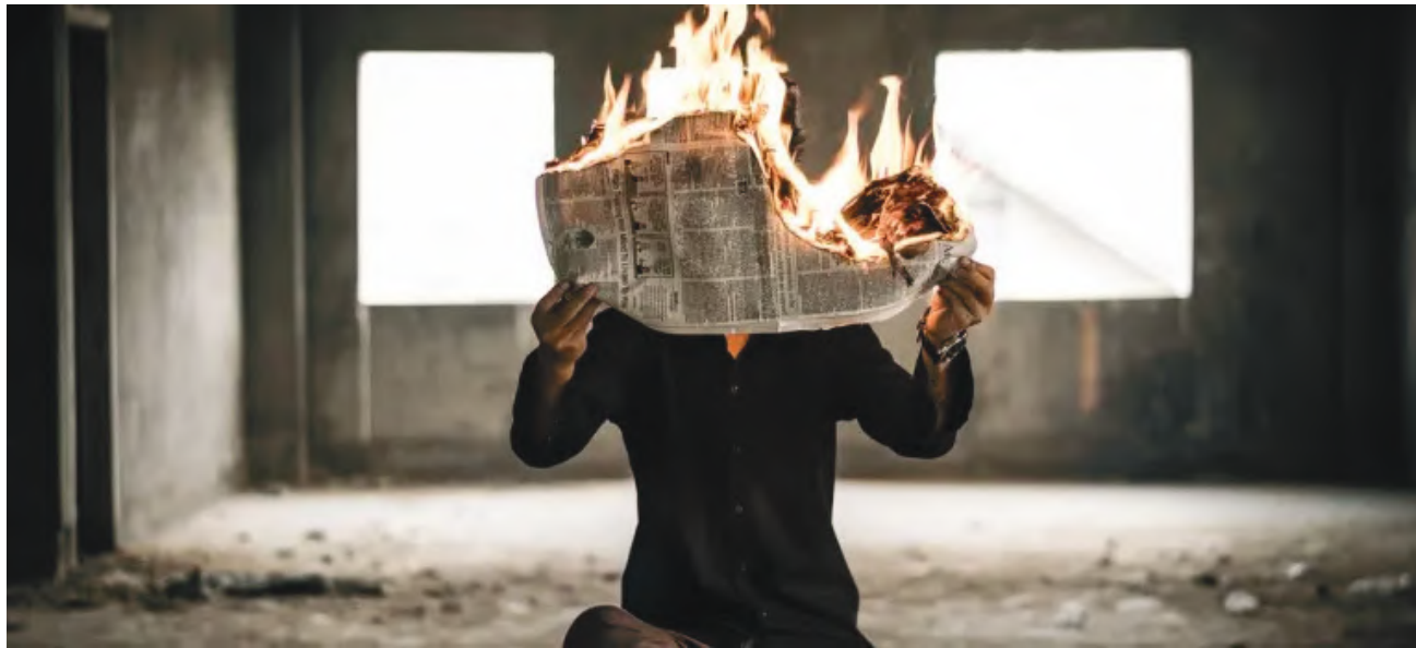
Fake news - news articles that are intentionally and verifiably false and designed to manipulate people's perceptions of reality - has been used to influence politics.