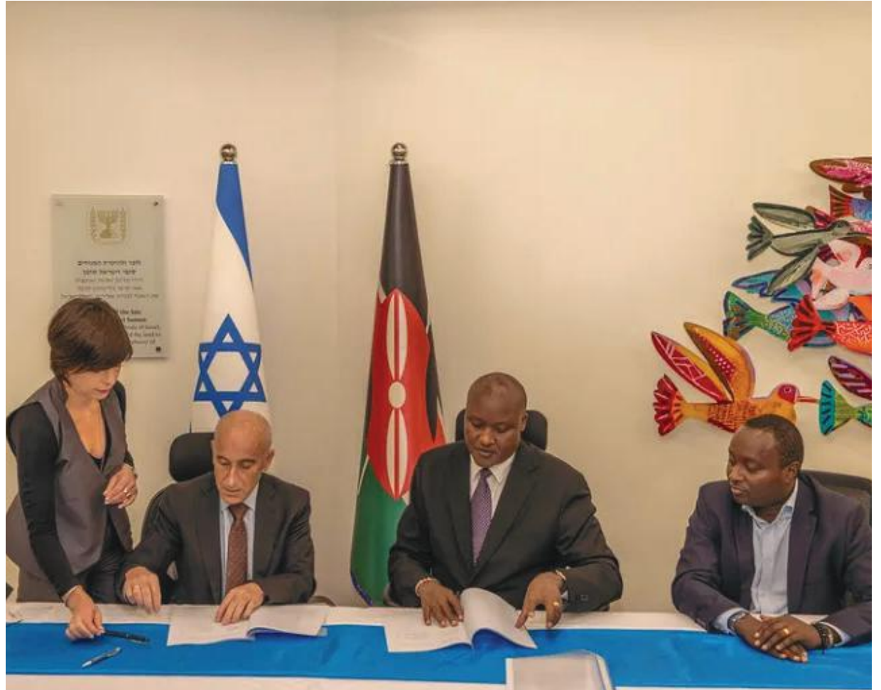
The Embassy of Israel in Kenya has signed a Memorandum of Understanding with Mama Doing Good, the organisation that implements the programs of the First Lady of the Republic of Kenya, towards the establishment of "Zion Gardens" in Machakos County.