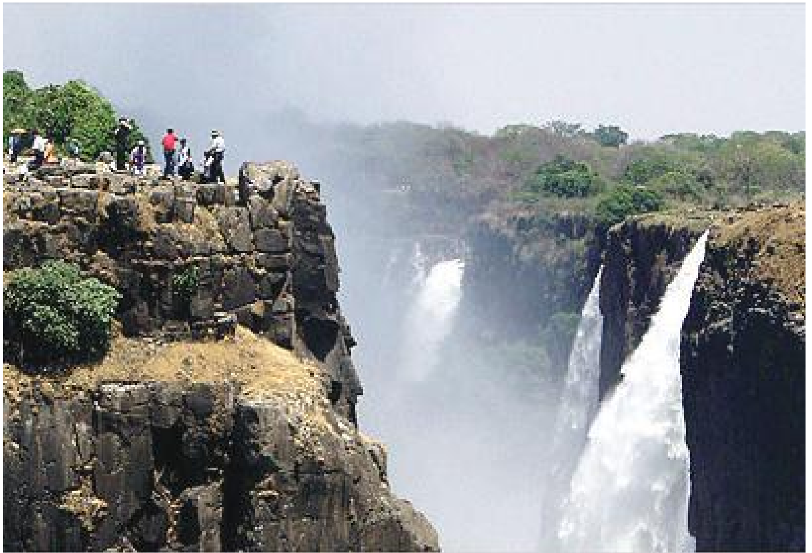
Tourism in Zimbabwe

There are two sides to every question and it's better to weigh them so as to pass judgement. Tourism impacts be it positive or negative requires constructive criticism because a blame game will only worsen the issue. It's true that boat oils and kapenta rigs affect aqua life thereby causing water and noise pollution in their wake. Furthermore, strewing litter all over the shore poses a threat to human health driving all and sundry to fear for dear life. Ironically, tables are bound to turn here and there but it's sad to say that this time around our tourism cage has been rattled to staggering heights when looking at Kariba. In-