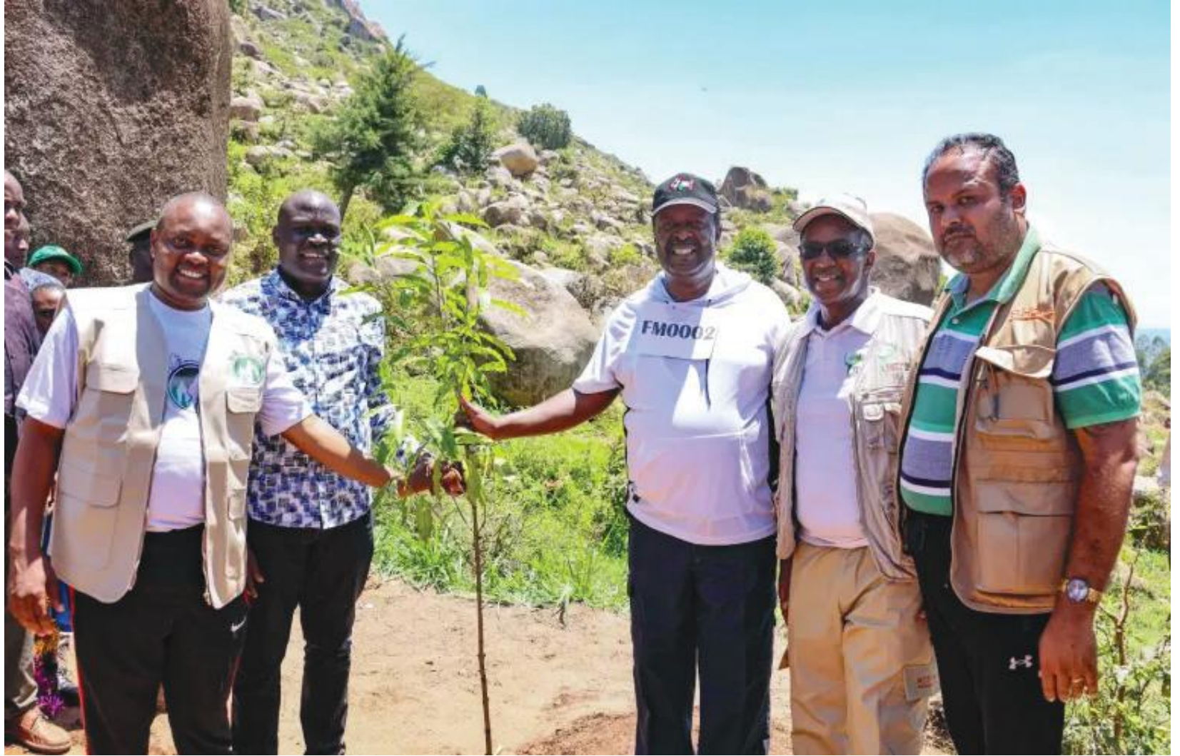
Prime Cabinet Secretary Musalia Mudavadi third right