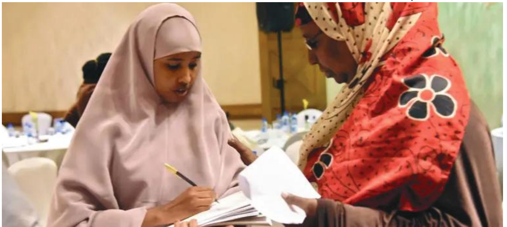
Two women seeking to become part of the political process in Kenya exchange ideas.

But, we can't stop here. Beyond the election, it's incumbent on all international partners like the UN to help Kenya further deepen her remarkable democracy. A big part of doing that is the ongoing fight to strengthen accountability mechanisms and bolster the Government's long-term capacity to stop the spread and mitigate the pernicious impact of hate speech on Kenya's public life."