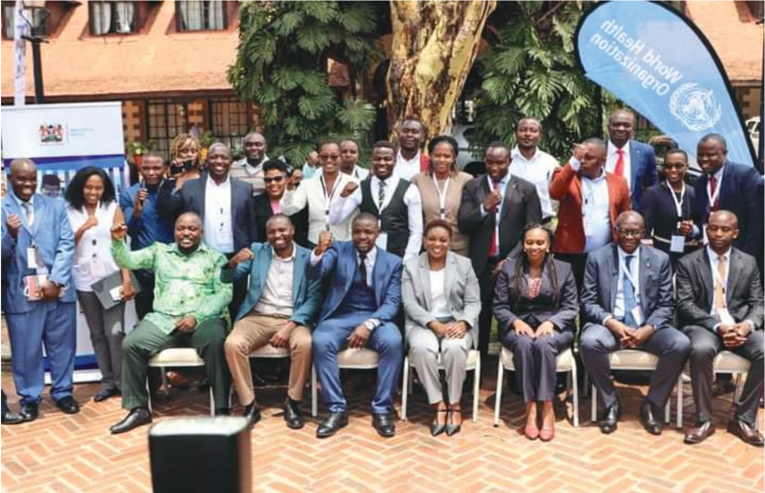
Participants pose for a photo after the event.

The official opening of the Pre-National Human Resources for Health Dialogue meeting marked a significant step forward in Kenya’s healthcare system. The event, graced by Susan Nakumicha, Cabinet Secretary for Health, brought together a diverse group of healthcare professionals, signaling the beginning of a series of dialogues aimed at enhancing the development and management of the country’s healthcare workforce. During the event, the Cabinet Secretary announced that the ministry will not renew the agreement with the Cuban doctors.