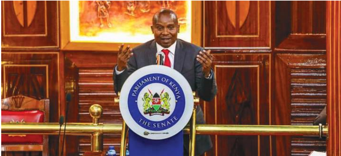
Cabinet Secretary Prof. Kithure Kindiki when he appeared before the Senate yesterday.

with Nyeri, Kiambu, and Murang’a recording significant seizures from January to June 2022,” he informed the Senate. Yet, he also expressed concerns regarding the absence of clear data on Ketamine misuse in the Central region. Understanding the gravity of the “Kete” misuse problem, the government has taken numerous actions. These steps encompass launching public educational and awareness campaigns that address the repercussions of drug consumption, targeting various groups from schools to workplaces. They’ve also facilitated training for addiction experts in rehab centres to apply evidence-backed interventions, set up National Standards for Treatment and Rehabilitation for those suffering from Substance-Use-Disorder, and created inspection guidelines for rehab facilities. These facilities are now subject to accreditation, guidance, and potential closure if they fail to meet the given standards.