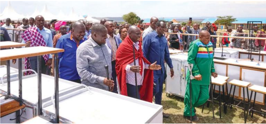
Deputy President Rigathi Gachagua (C).

The Deputy President also presided over the commissioning of 38 mobile laboratories for Junior Secondary Schools and the official opening of Kishermoruak Boys Secondary School.