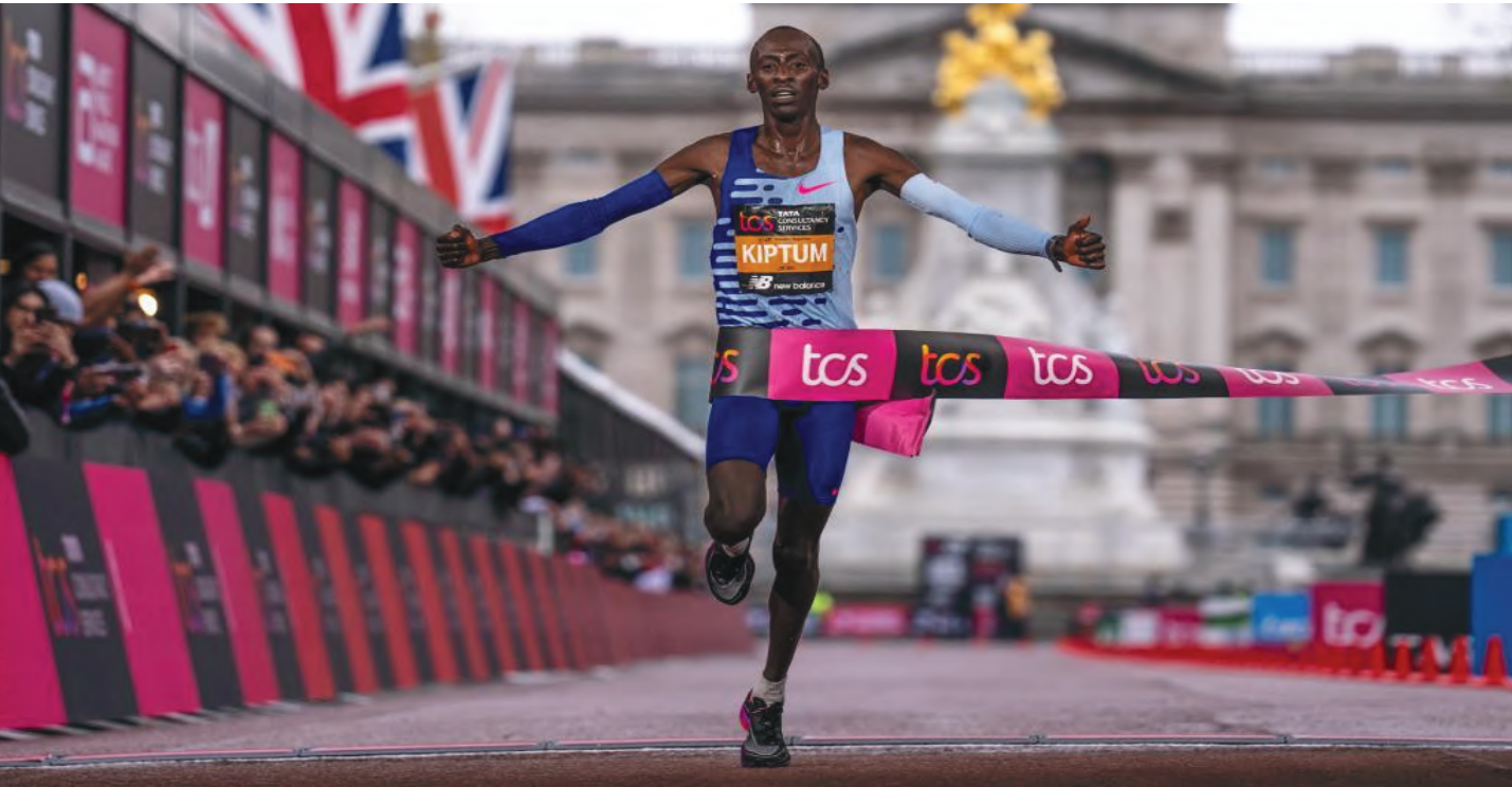
Kelvin Kiptum crosses the finish line to win the London Marathon.