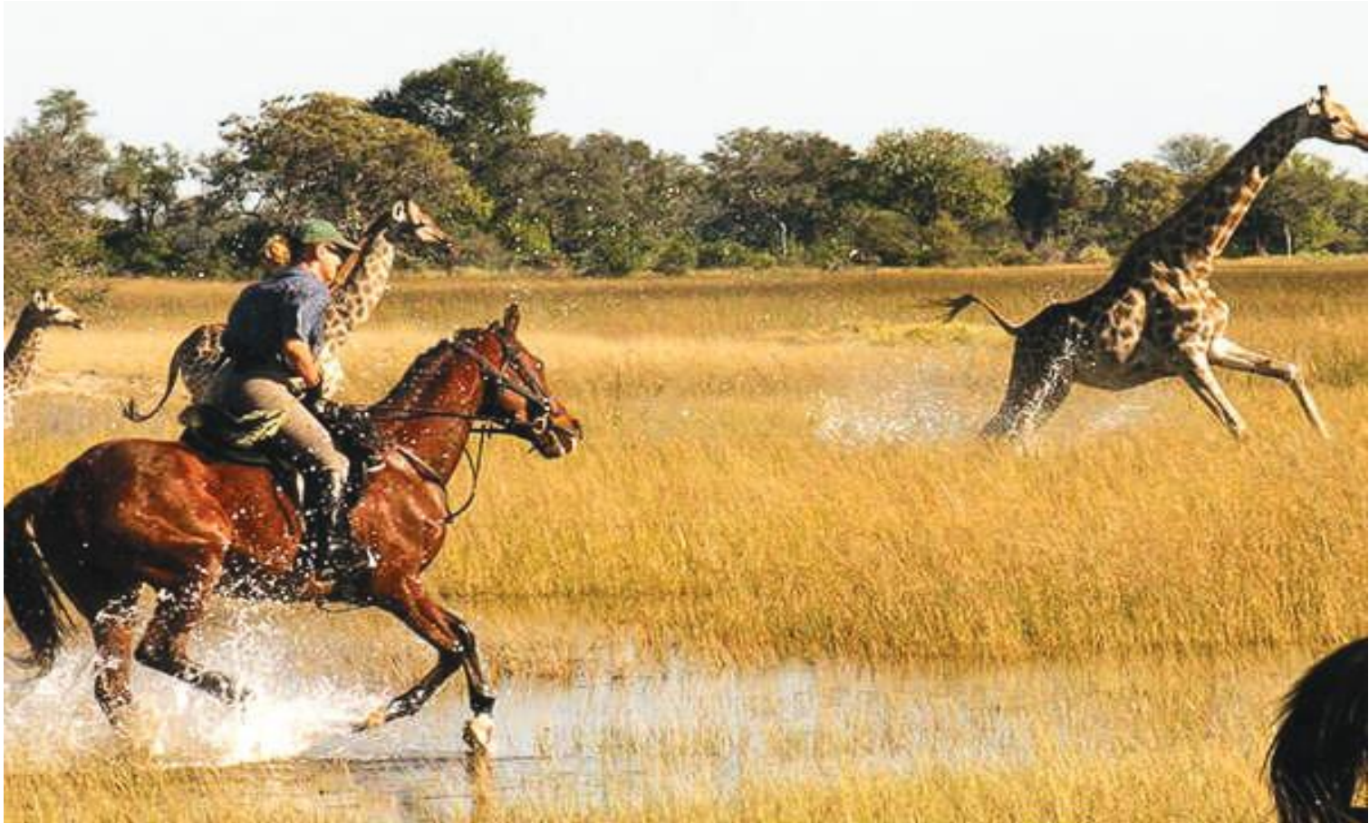
Horse Riding Safari.