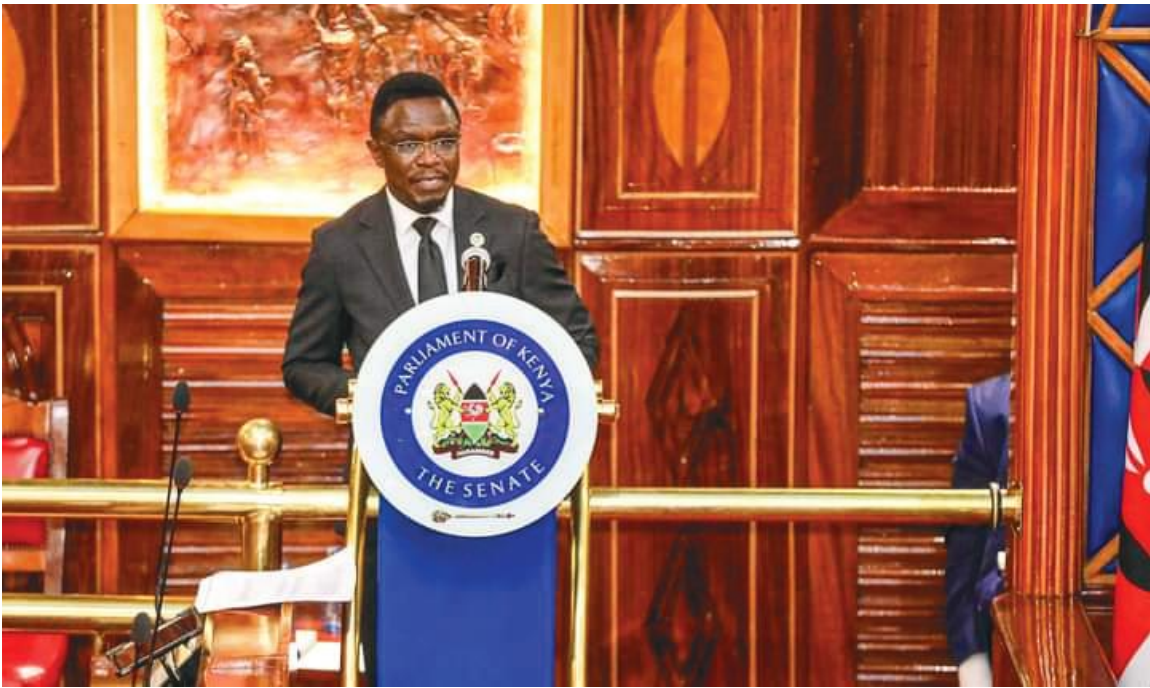
Cabinet Secretary Ababu Namwamba when he appeared before the Senate yesterday.

The Cabinet Secretary for Youth Affairs and Sports, Ababu Namwamba told the Senate that the Government spent KSh147,299,127 for the facilitation of Team Kenya's participation in the World Athletics Championship in Budapest. While responding to Nandi Senator Samson Cherarkey's question on the Floor of the House, the Sports CS notified the Honourable Senators that his Ministry has already paid allowances and cash rewards to all the athletes who participated in the championship where Kenya emerged 1st in Africa and 5th in the world. He further clarified that the Ministry of Youth Affairs and Sports didn't provide uniforms to the Kenyan athletes as earlier alleged since Team Kenya is kitted by NIKE. "My Ministry spent KSh36,697,296 on allowances for teams;