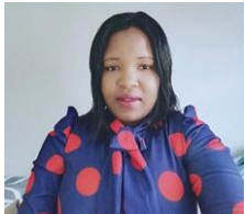
By: Abigirl Phiri @themtkenyetimes