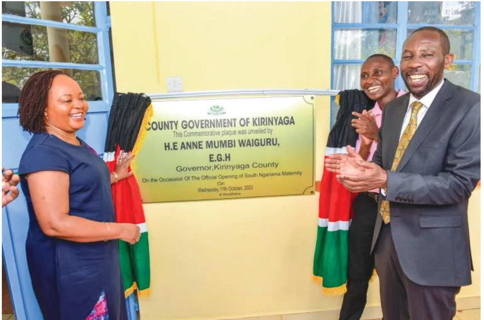
Kirinyaga County Governor Anne Waiguru has opened a 21-bed capacity maternity ward at South Ngariama Health Center in Mwea constituency.

Kirinyaga County Governor Anne Waiguru has opened a 21-bed capacity maternity ward at South Ngariama Health Center in Mwea constituency ahead of the rolling out of the M-Mama emergency referral system for pregnant mothers and newborns.