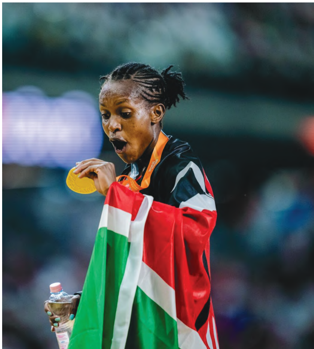
Faith Kipyegon admires her 1500m gold medal at the World Championships in Budapest.

Other nominees are Venezuelan Yulimar Rojas (triple jump world champion, Diamond Trophy winner), Spanish racewalker