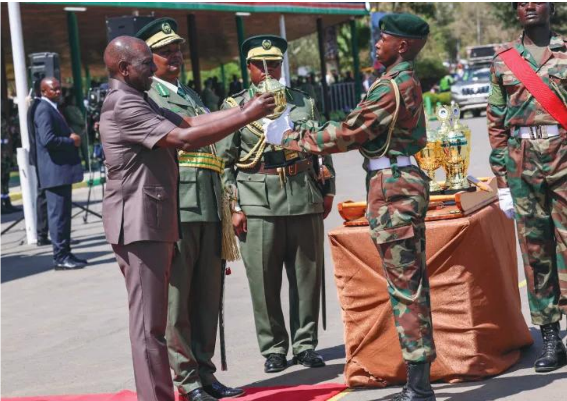
President William Ruto (L).