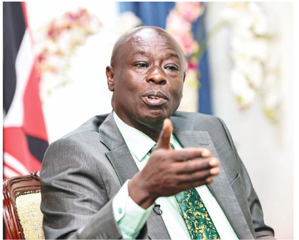
Deputy President Rigathi Gachagua

This is even as he warned the administrators over complacency and laxity in the government-ordered crackdown against illicit brews.