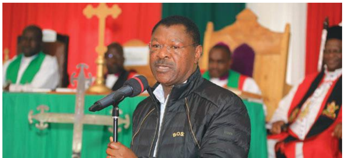
House Speaker Moses Wetang'ula.

providing students and teachers with improved access to education.