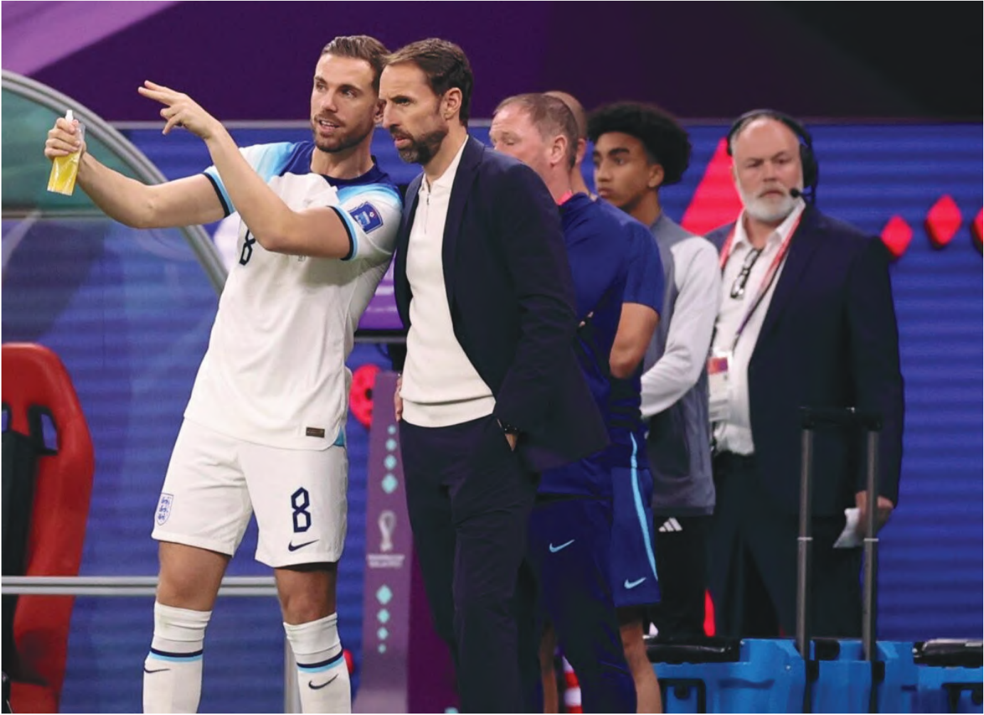
Gareth Southgate and Jordan Henderson.

Gareth Southgate has said criticism of Jordan Henderson "defies logic" after the midfielder was booed by some England fans during Friday's 1-0 friendly win over Australia.