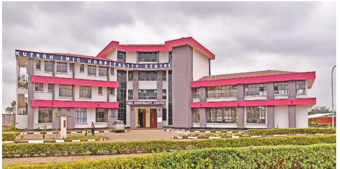
the Kenyatta University Teaching, Referral and Research Hospital (KUTRRH).

As per legal Notice No. 4 of 2019, KU Medical Students will also enjoy priority access to medical education support facilities, including three auditoriums, shared office spaces, semi-