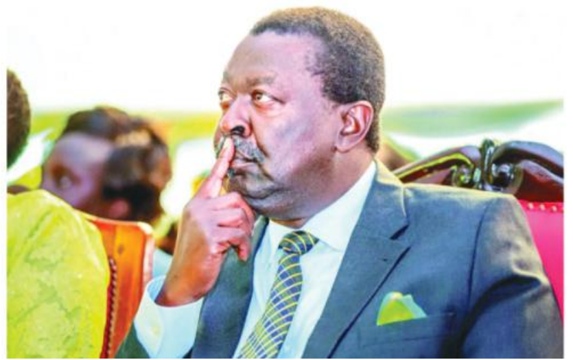
Public Service Cabinet Secretary Moses Kuria and Prime Cabinet Secretary Musalia Mudavadi .