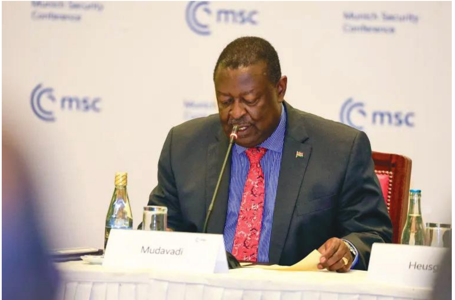
Prime Cabinet Secretary Musalia Mudavadi .

Countries must commit to work together to confront the spouting insecurities witnessed in different parts of the world, Prime Cabinet Secretary Musalia Mudavadi has said.