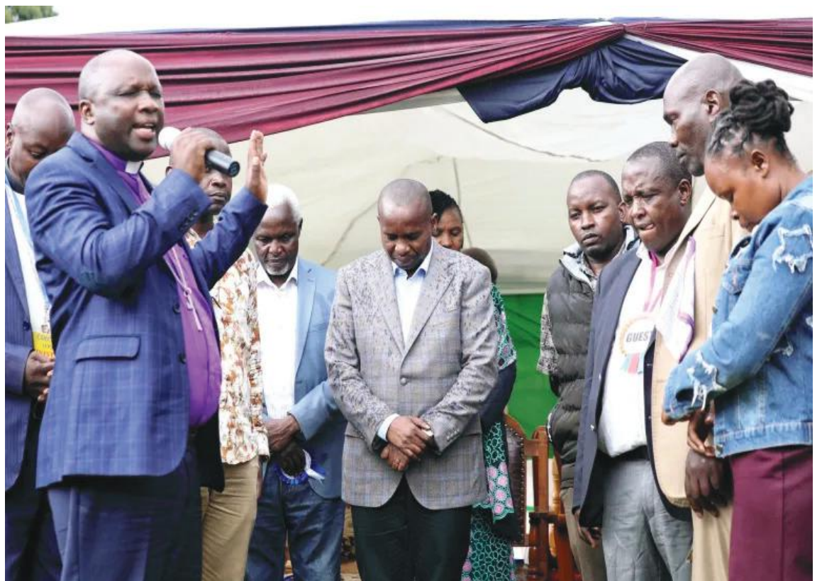
Interior CS Kithure Kindiki (centre) during a fundraiser for the construction of a new church building in Meru County.

The CS said that the whole process of taking Kenya police officers will follow due process where both the National assembly and the Senate will be involved.