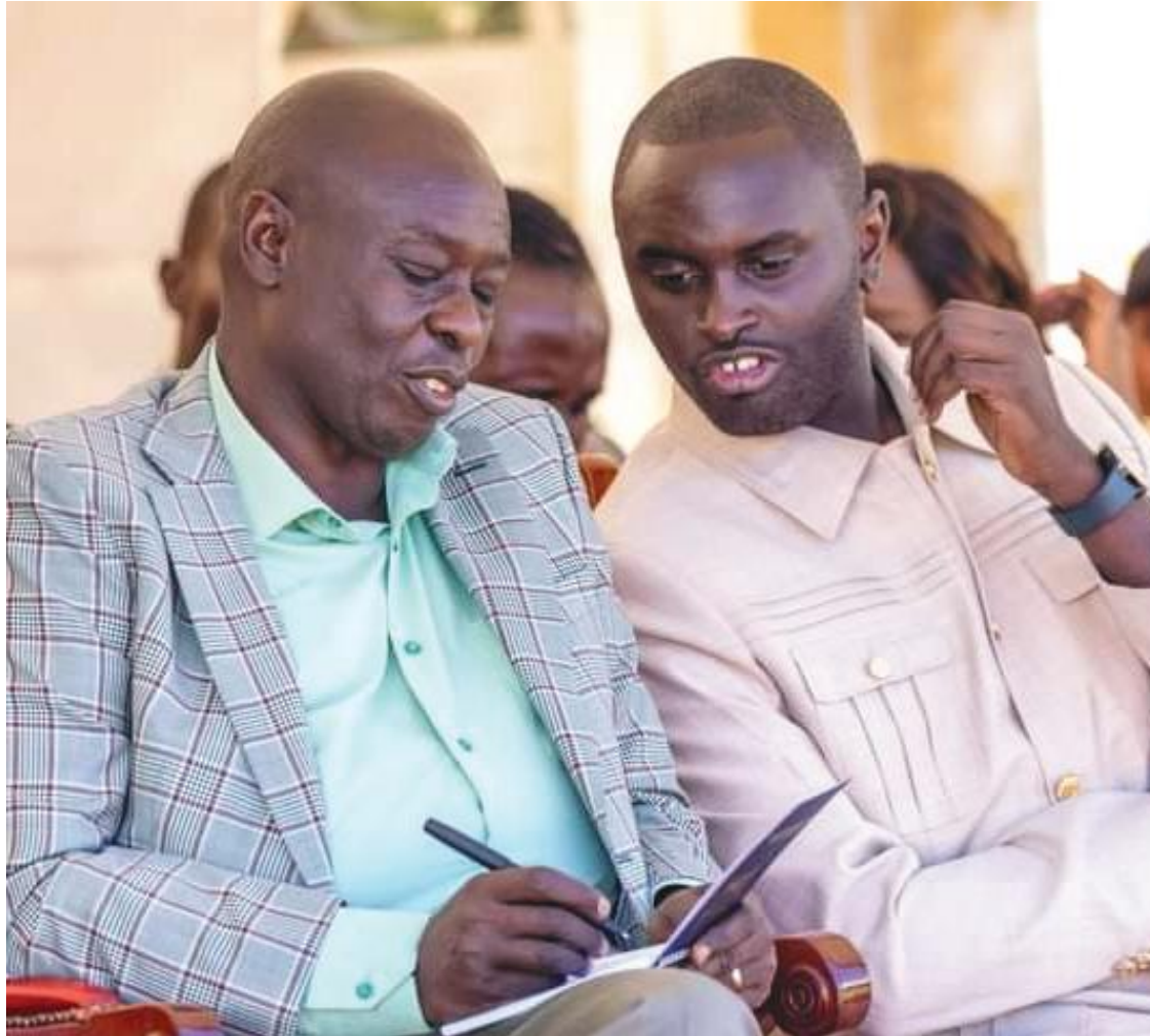
Deputy President Rigathi Gachagua confers with Nyandarua County Senator John Methu.