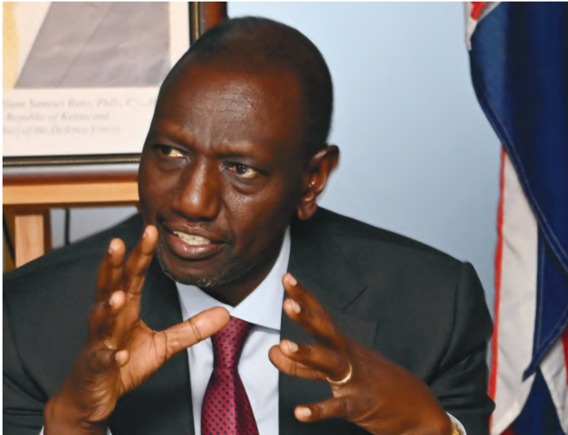
President William Ruto .

President William Ruto has in the recent past shown that he was truly committed to walk the talk in slaying the dragon of corruption.