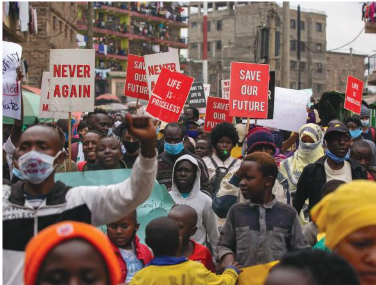
Civil Society In Safeguarding Constitutionalism In Kenya.