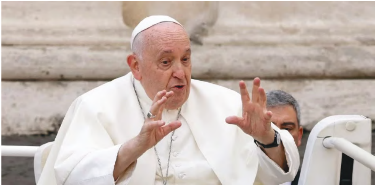
Pope Francis gestures as he leaves after the weekly general audience, in Saint Peter's Square at the Vatican, November 15, 2023.