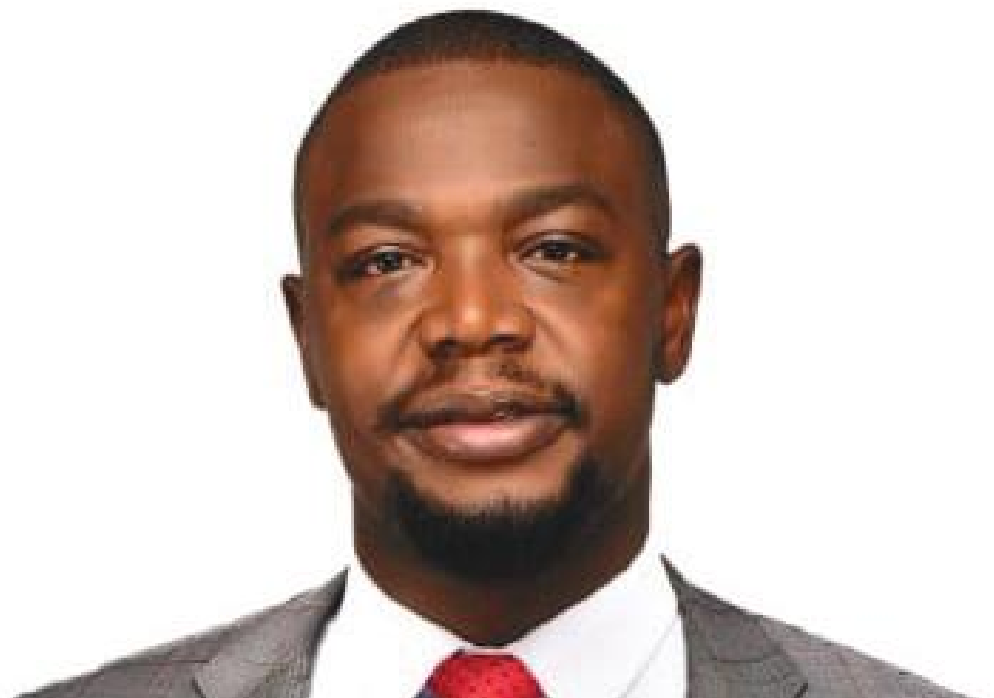
CEO of KMPDU Davji Bhimji Atallah

Additionally, the unions plan to petition the Senate for legislative amendments to strengthen security measures in health facilities. The call is for collaboration between authorities and healthcare institutions to ensure the safety of healthcare providers and patients.”