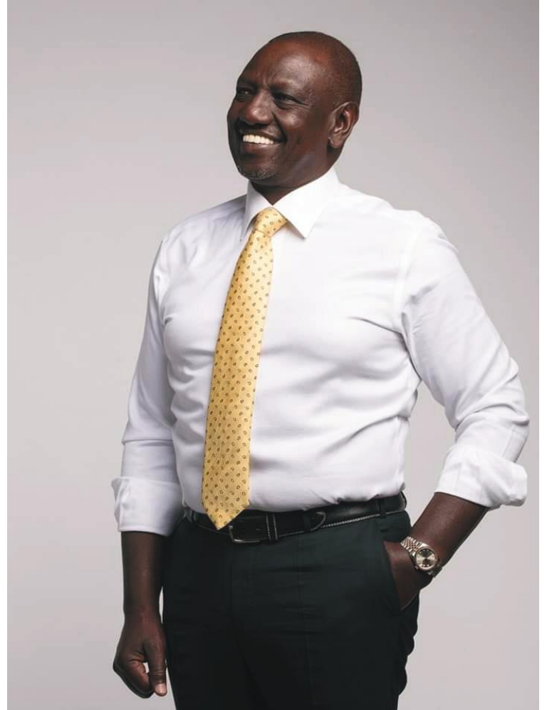
President William Ruto .

As of now, we cannot tell whether what the former President said is true or not.