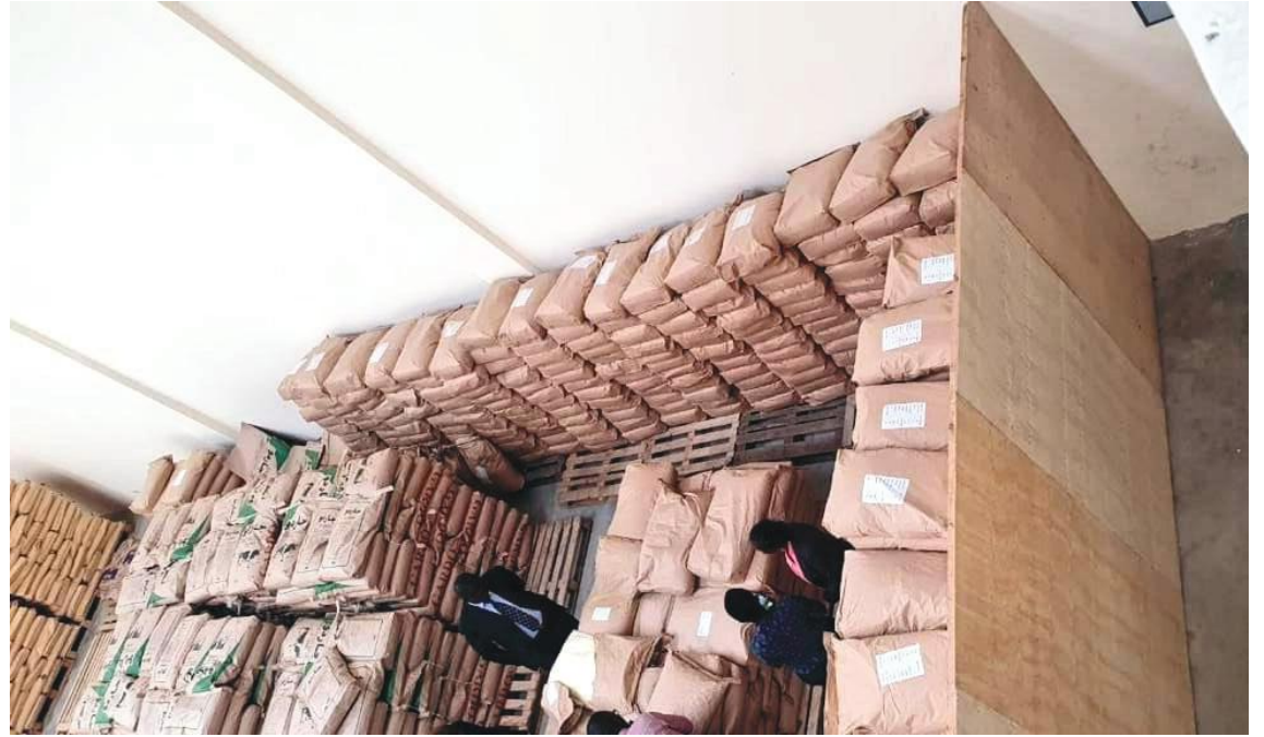
Detectives Nab Over 32 Tonnes Of Milk Powder.

The brands of the milk powder include: 181 bags branded Fresh Dairy product of Brookside Uganda, 421 bags branded Gardo product of New Zealand, 485 bags of Non Dairy Creamer product of China, 56 bags branded SAMA product of