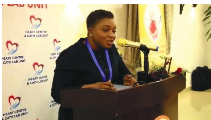
Health Cabinet Secretary Susan Nakhumicha

"This recent case of assault on a healthcare worker is not just an attack on an individual; it is an assault on the entire healthcare system and the principles that guides it. Assaulting a healthcare worker not only endanger their lives but also disrupt the vital services they provide to other pa-