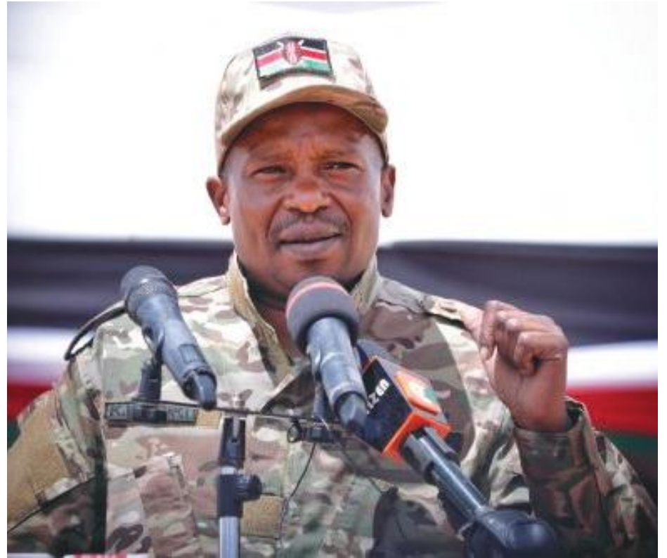
Cabinet Secretary for Interior Prof Kithure Kindiki

“The government is committed to provide a firm policy framework for eradication of banditry, encouraging and rewarding security officers who demonstrate exceptional valour, risking their lives to ensure banditry threats are neutralized and stolen livestock is recovered.”.