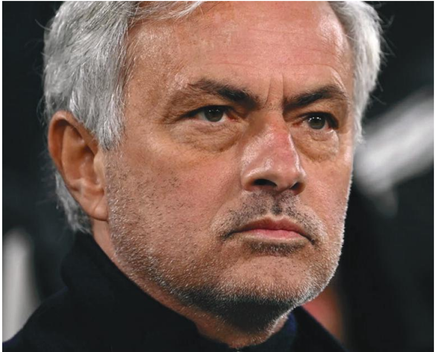
Roma's Portuguese coach Jose Mourinho looks on during the warm up ahead of the Italian Serie A football match between Juventus and Roma at the Allianz Stadium in Turin, on December 30, 2023.

Roma coach Jose Mourinho has dismissed any notion of becoming Brazil's next manager, saying his allegiance is with his Italian Serie A side. "Brazil haven't spoken to me directly," he said after Roma's Italian Cup last 16 win on Wednesday evening. "I told my agent not to speak to anyone before we know if Roma want me to stay on or not," added the Portuguese. "I don't believe in the rumours linking other managers to this job. I've got confidence in the Friedkin Group (Roma's American owners).