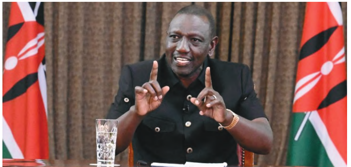
President William Ruto.

The President had on Tuesday claimed that Judiciary has been taken captive by persons keen to sabotage