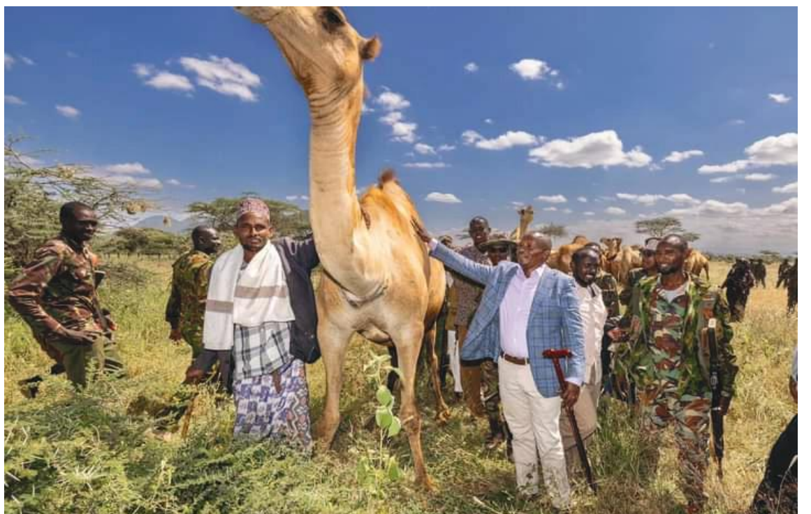
Cabinet Secretary for Interior Prof. Kithure Kindiki admiring one of the recovered camels at Mulango area in Isiolo County..

The CS was accompanied by among others; Regional, County and local security heads, Formation Field Commanders, Political Leaders and members of the public.