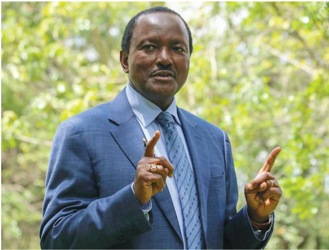
Wiper Party leader Kalonzo Musyoka.