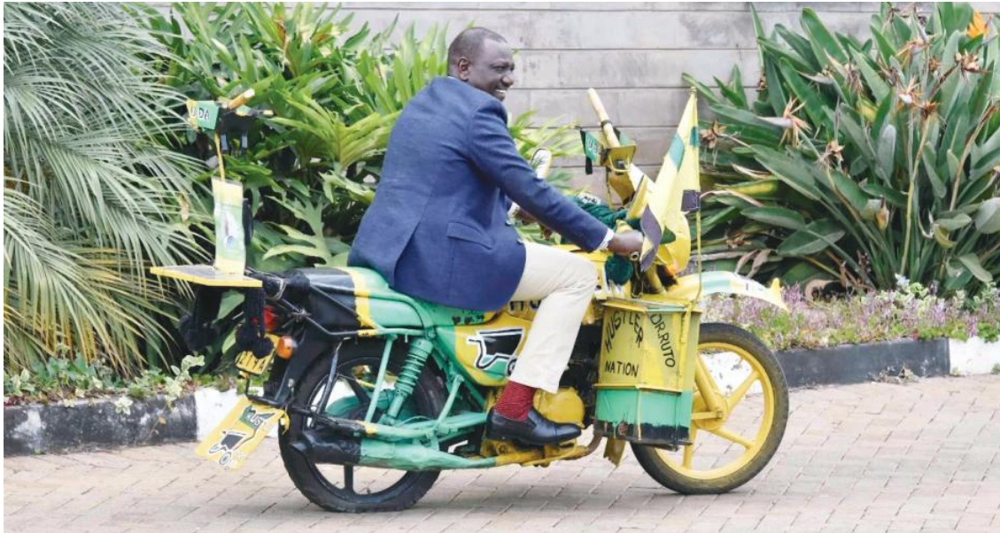
President William Ruto pictured riding a UDA-branded boda boda during the pre-election period on September 23, 2021.

"THAT as a result of the impugned utterances by the Members of the 1st Respondent political science party, the people engaged in boda boss