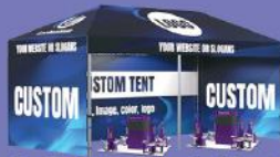
An Exclusive Branded Tent