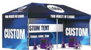
An Exclusive Branded Tent