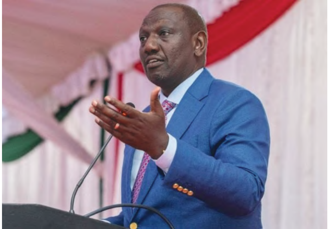
President William Ruto