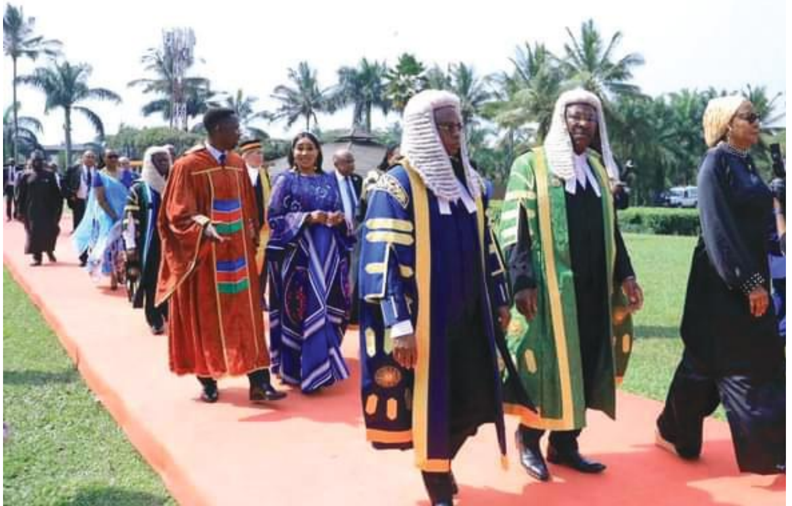
Speakers walking to the meeting convention

National Assembly Speaker the Moses Wetang’ula has urged African countries to enhance their fight against adverse effects of climate change in the ongoing spirited effort to safeguard the environment.