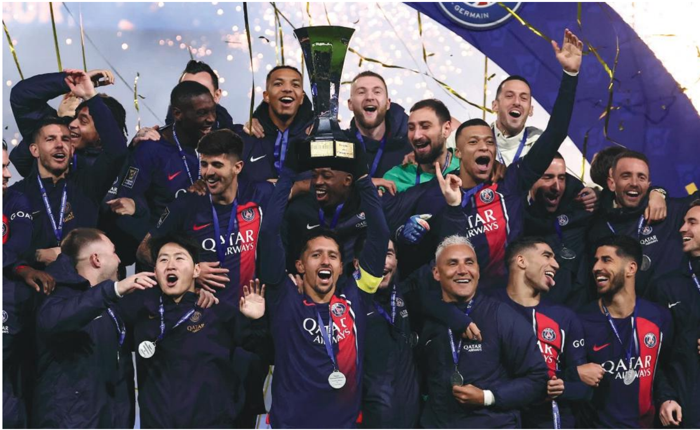
Paris Saint-Germain players celebrate with the trophy after winning the French Champions' Trophy (Trophee des Champions) football match between Paris Saint-Germain (PSG) and Toulouse FC at the Parc des Princes stadium in Paris on January 3, 2024.

Lee Kang-in and Kylian Mbappe scored first-half goals as Paris Saint-Germain won the first silverware of the French season on Wednesday, beating Toulouse 2-0 to claim the Champions Trophy. Lee, playing his final game before heading off to the Asian Cup in Qatar with South Korea, put PSG ahead in the third minute, leaving Toulouse with an uphill battle at the Parc des Princes. Mbappe then added a superb second goal just before half-time, as Paris claimed the Champions Trophy for the 10th time in the last 11 seasons. "We were exceptional in the first half. It was our best 45 minutes of my time here," said PSG coach Luis Enrique after claiming his first silverware as a coach since leaving Barcelona in 2017. France's version of a Super Cup is habitually the curtain-raiser to