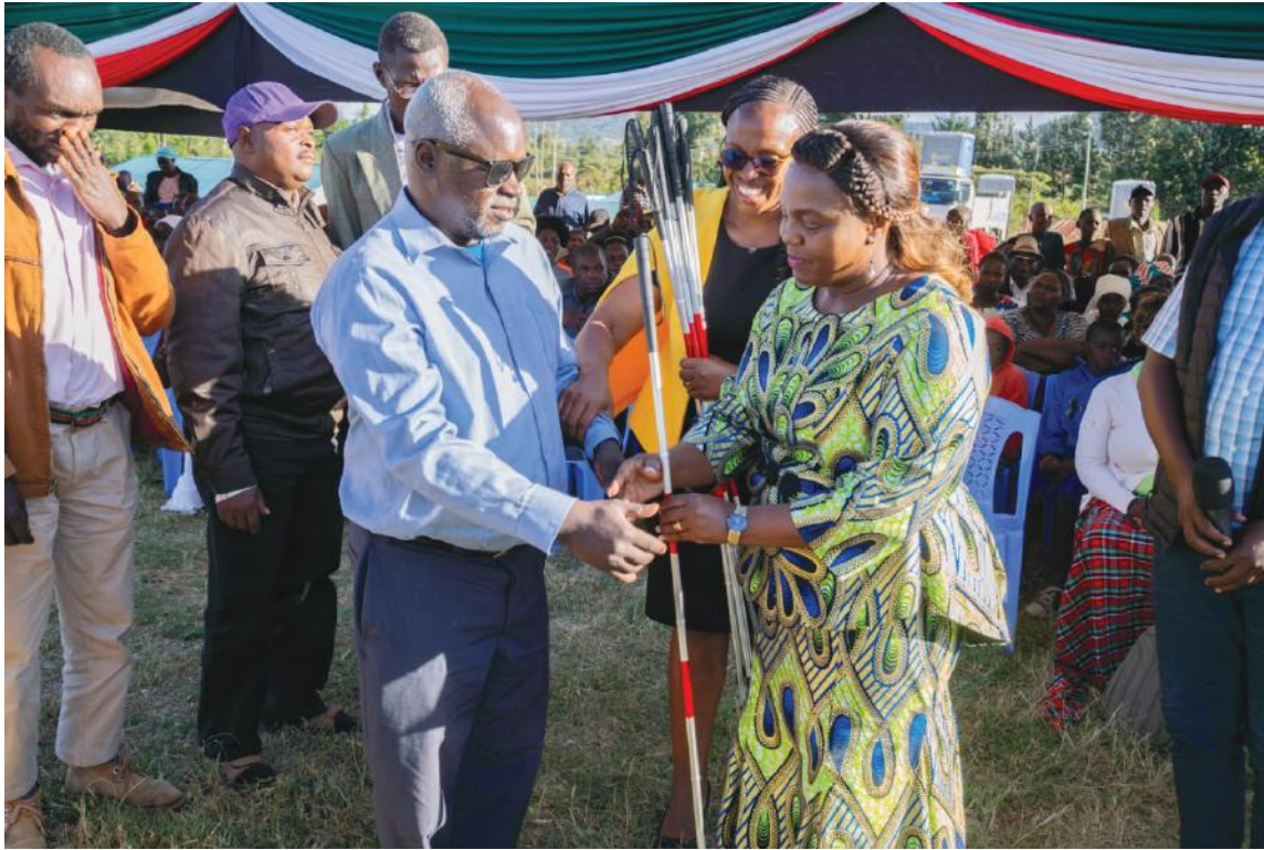
The spouse of the Deputy President Pastor Dorcas Rigathi donates white canes to those with visual impairment in Ol'ngarua special school in Laikipia County during a meeting geared towards empowering and advocacy for those with disability yesterday