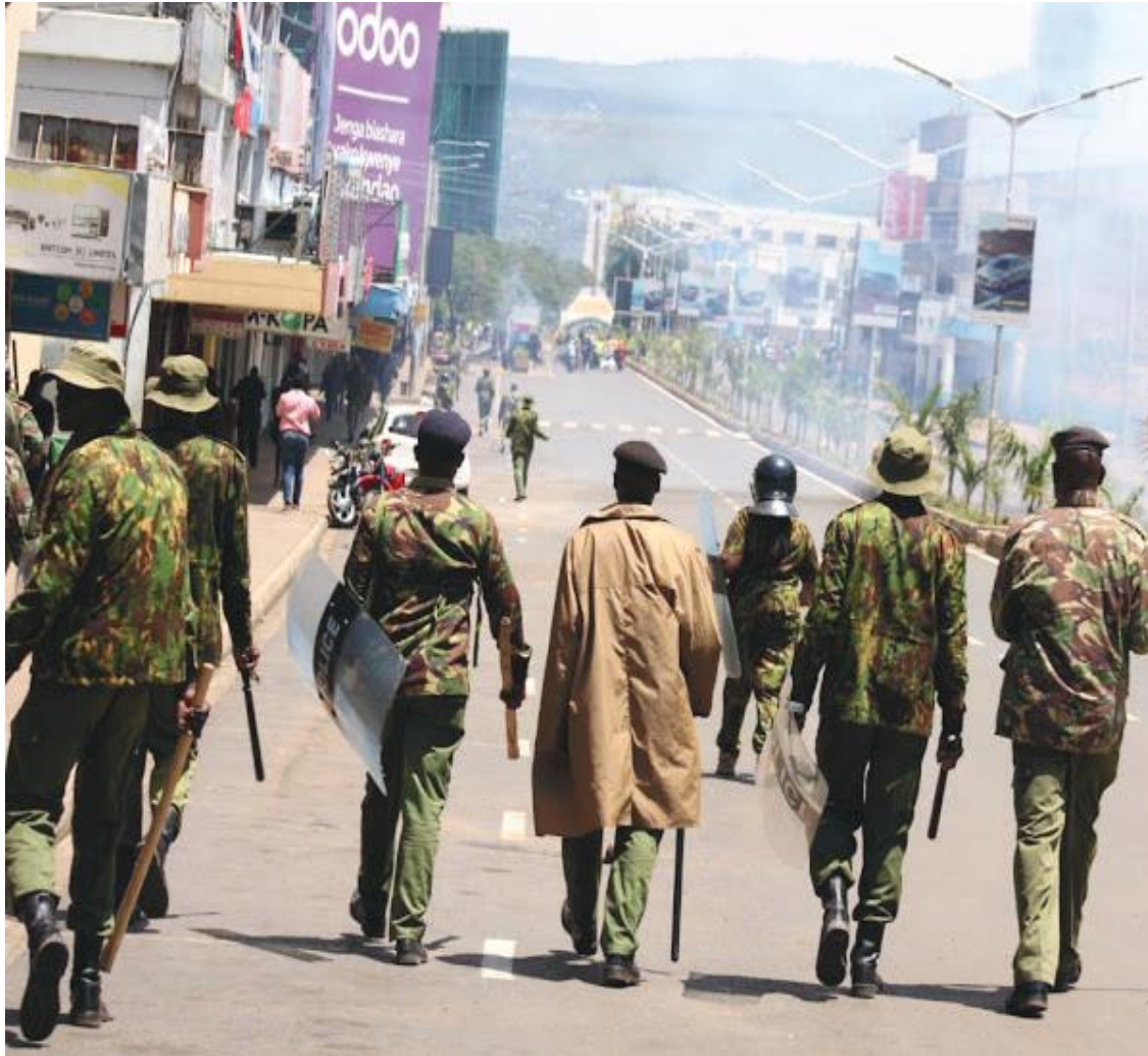
Kenya Police Officers.

The reasons cited by Foreign Affairs Principal Secretary Korir Singoei when he announced that the government had put on hold the anticipated deployment of 1,000 police officers to Haiti were very clear. The government of Haiti had collapsed following the resignation of the Prime Minister Henri Ariel. Some ministers and top police officers had been forced to resign by the Haitian gangs. So, there was no government in place to receive our officers and direct them on how to carry out the operations, the PS reiterated. Contrary to the critics, this did not mean the government had developed cold feet. The Government of Kenya believes in the constitution and rule of law. So, in Haiti, it looked forward to work with a constitutional authority. This is position would be adopted by other countries across the world which had agreed to join the United Nation led Multinational Security Support Mission (MSS). Earlier, I had written an article that goes. I had been following with interest the debate surrounding the plan to send 1,000 Kenyan police officers to the troubled nation of Haiti. The critics of President William Ruto want Kenyans to believe that Kenya is the only country sending officers to that country. This is not true. A number of