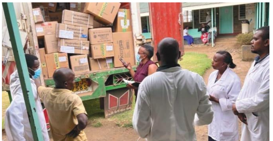
Health officials inspecting some of the drugs