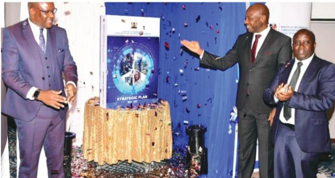
Cabinet Secretary Eliud Owalo (left) during the launch of the Strategic Plan yesterday