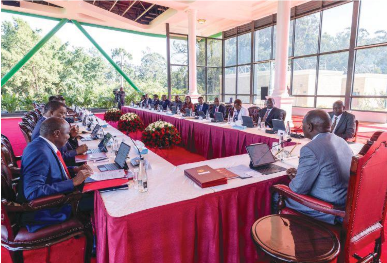
Cabinet meeting chaired by President William Ruto at State House Nairobi yesterday.

The Cabinet has endorsed measures the government has taken in the fight against illegal brews and narcotic drugs.