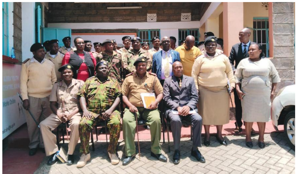
More than 20 Ngao officers attended the meeting..

Murugu called upon the NGAO officers to handle succession disputes without compromise and write succession letters without any favouritism.