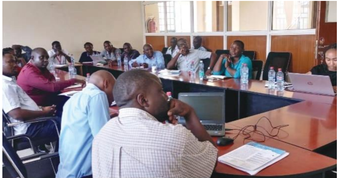
Stakeholders during the forum

Aseyong added that the Centre registered six leprosy clients in 2020 but