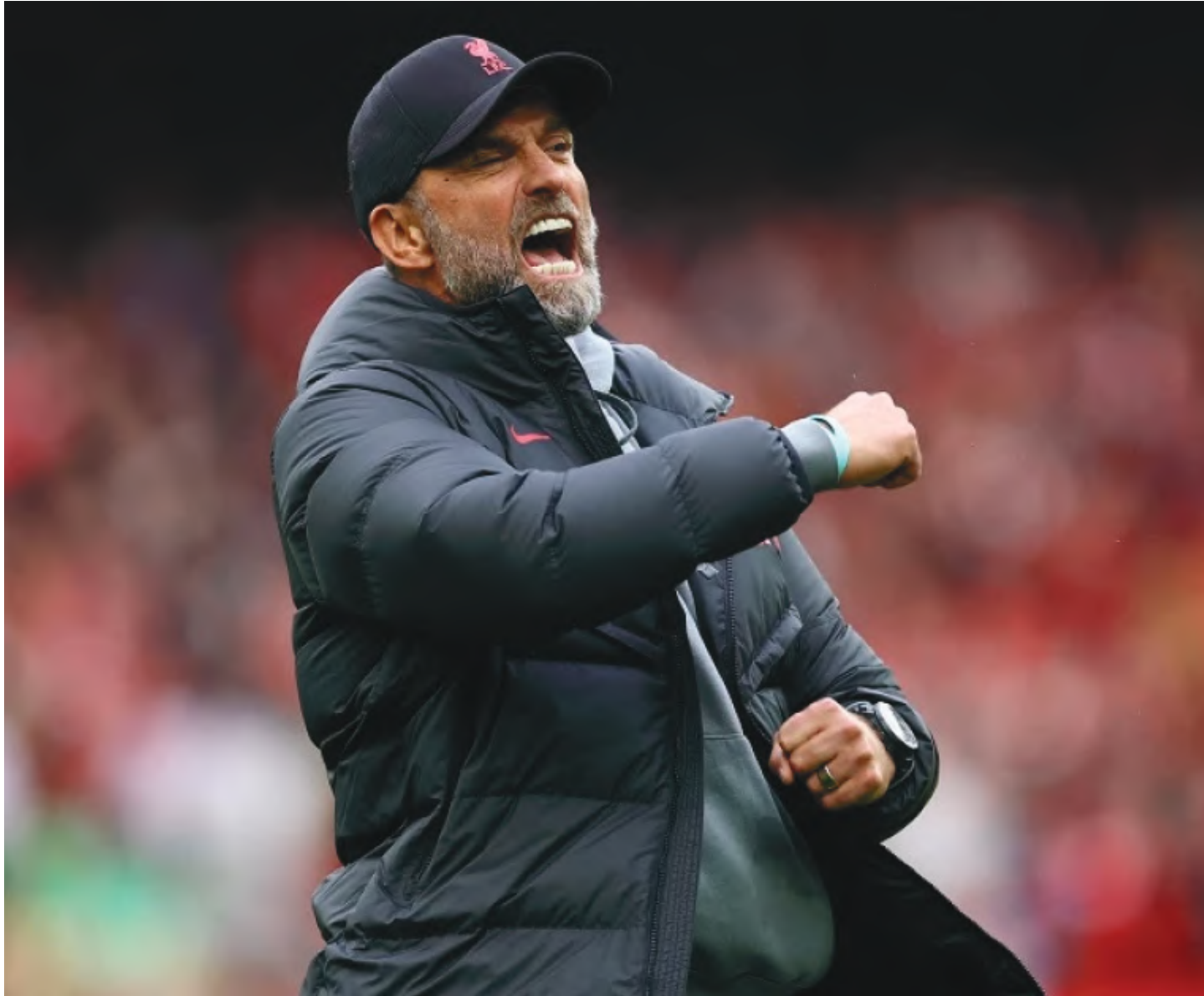
Soccer Football - Premier League - Liverpool v Tottenham Hotspur - Anfield, Liverpool, Britain - April 30, 2023 Liverpool manager Juergen Klopp celebrates after the match