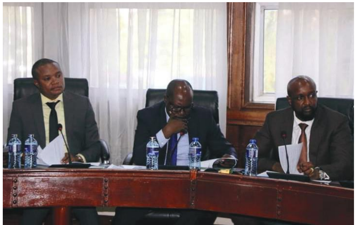
Some of the committee members during yesterday’s session.

Yesterday’s session was held in a bid to enrich the anticipated mediation process whereby, the two Houses are expected to nominate an equal number of Members to jointly review the amendments.