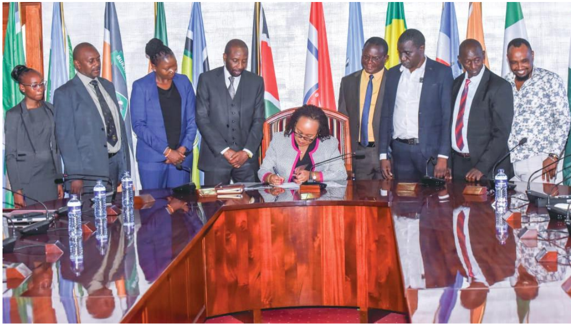
Kirinyaga County governor Ann Waiguru assenting to the Bill yesterday.