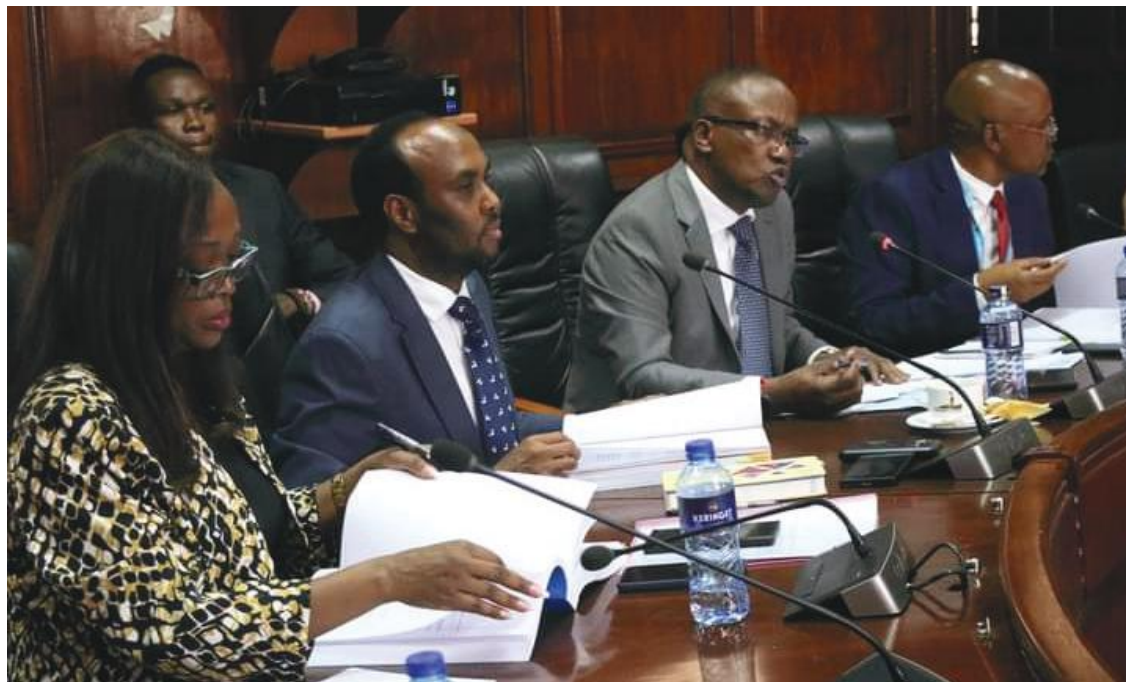
Some of the committee members during yesterday's meeting.