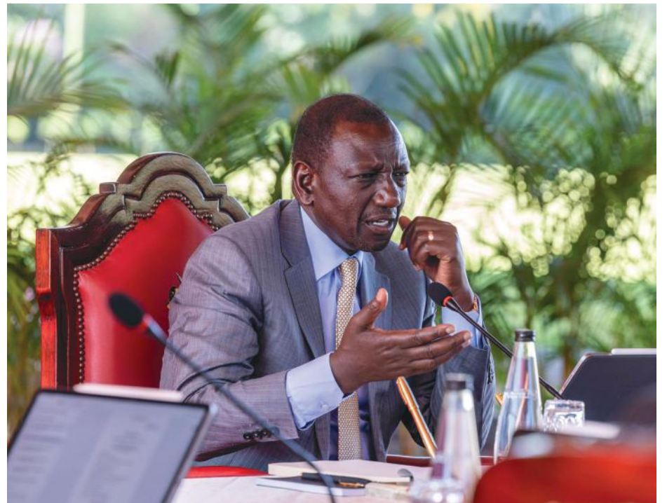
President William Ruto at State House Nairobi

These measures, announced by the Interior ministry, include a 21-day suspension of all the 52 licences and permits issued to manufacturers and distillers of second generation alcohol, revocation of all bar licences issued by counties against the law and an audit of conflict of interest within the ranks of enforcement agencies.