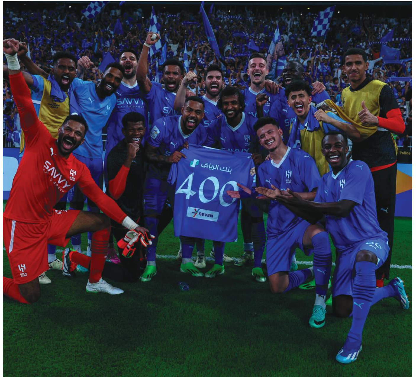
Al Hilal players celebrate after their win.

Saudi Pro League side Al-Hilal have broken the world record for most consecutive wins by a top-flight team.