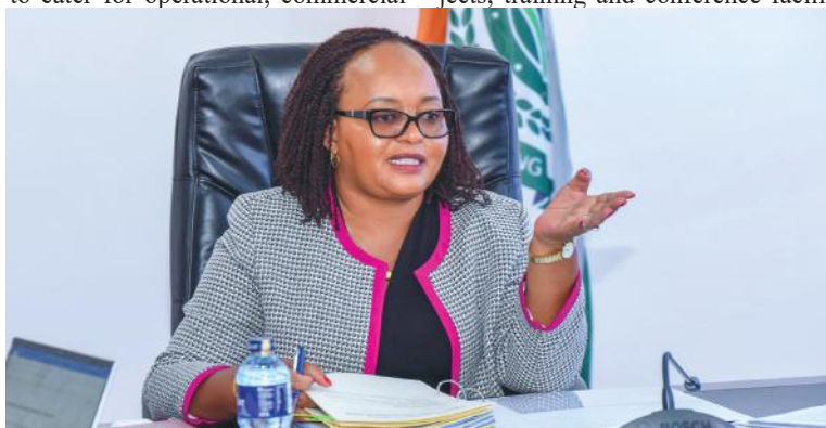
Kirinyaga County governor Ann Waiguru

Through the Wezesha Program, the county government supports farmers through initiatives such as training and establishing of various value chains.