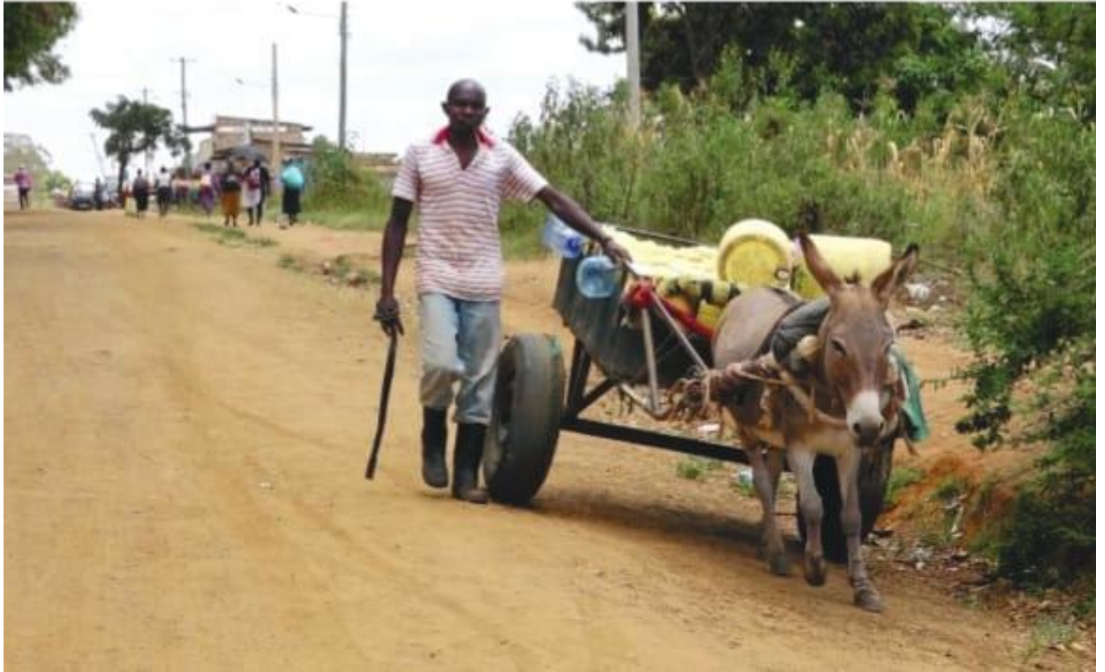
Resident fetching water with donkey..