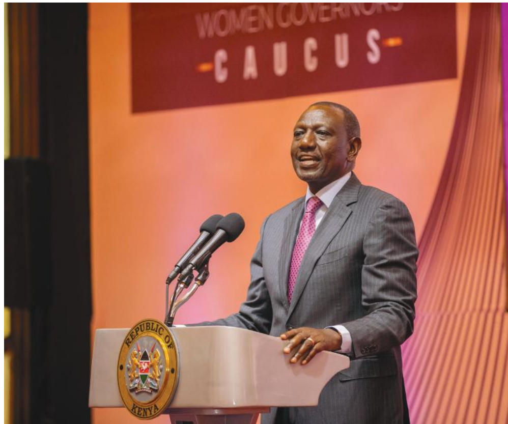
President William Ruto