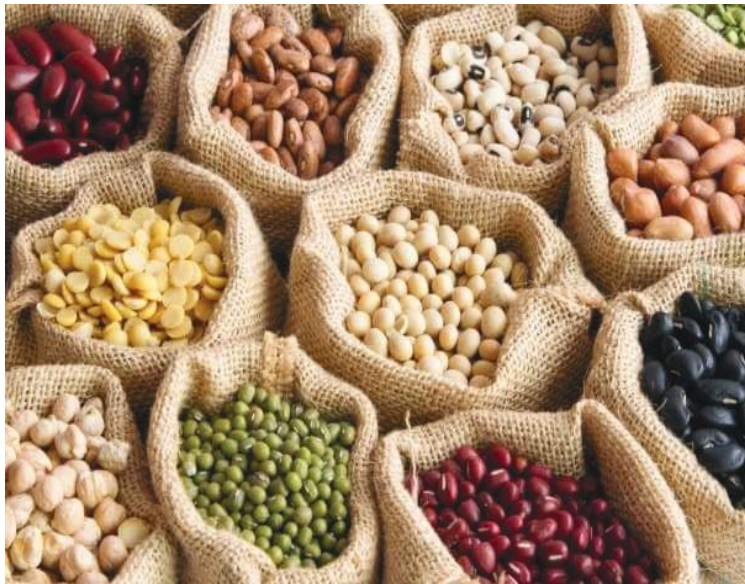
Some cereals on display in a market.