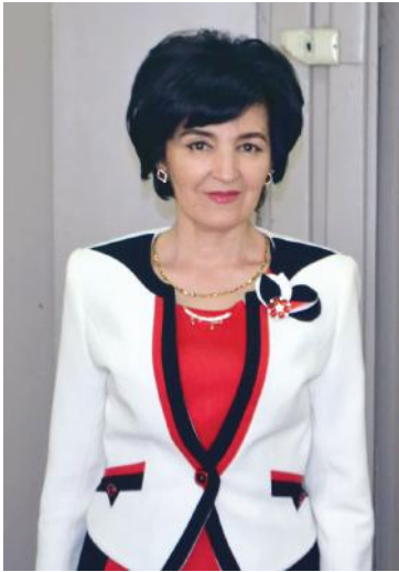
By: Nigina Niyoz

Everyone loses mobile phone at least one time. Especially, if it is valuable, it will lose surely. At that time, I also lost my mobile phone brought from Japan