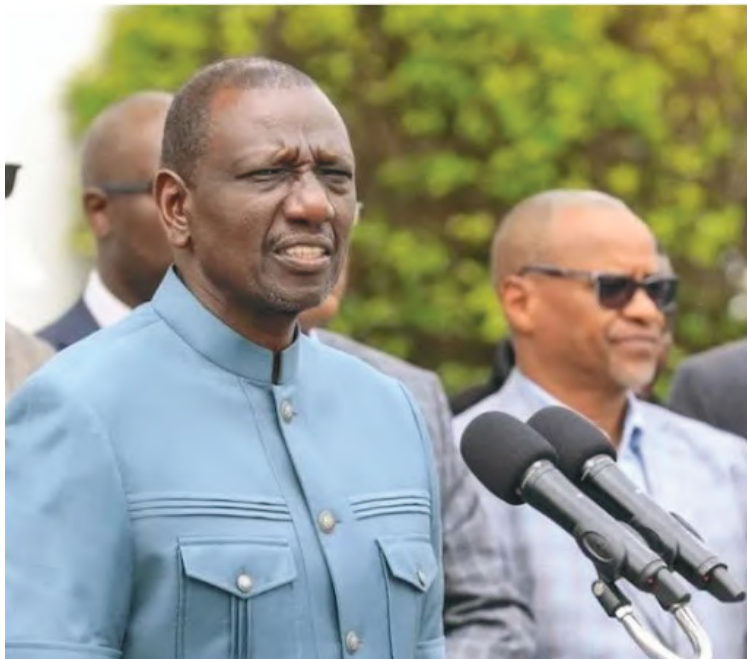
President William Ruto .

The recommendations will now be tabled on the floor of Parliament and senate for debate and adoption. This is in line with one of the clauses con-