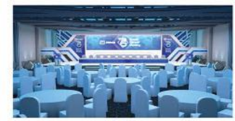
Gala Dinner Venue Co-Branding