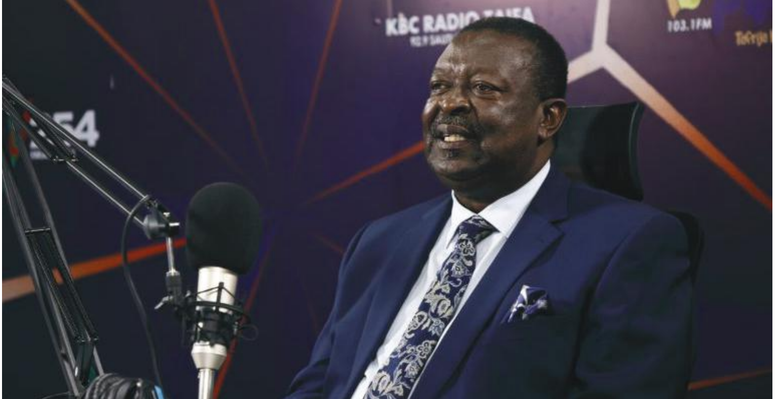
Prime Cabinet Secretary Musalia Mudavadi

The Korea-Africa Summit is scheduled to take place on the 4th and 5th of June, 2024, under the theme: "The Future We Make Together, Shared Growth, Sustainability and Solidarity."