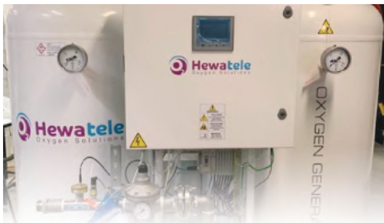
American, Finnish and Canadian governments fund an oxygen plant at Tatu City SEZ Kenya.