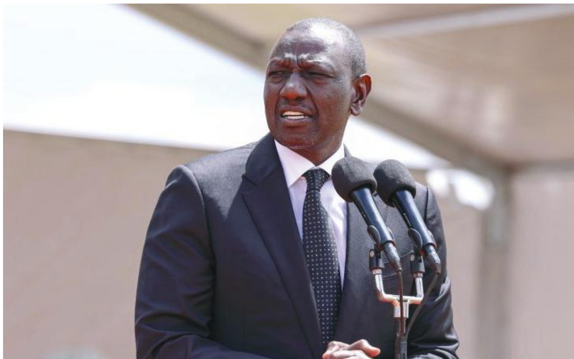
President William Ruto

According to Ruto, majority of political leaders who made the decision