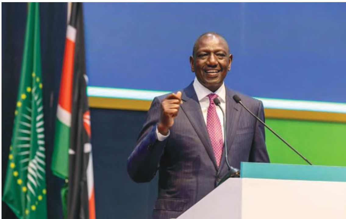
President William Ruto.

According to the Kenyan Demographic & Health Survey (KDHS) data for 2022, the prevalence of FGM is 15pc in the country, meaning that 15pc of girls and women aged 15 to 49 years have been circumcised.