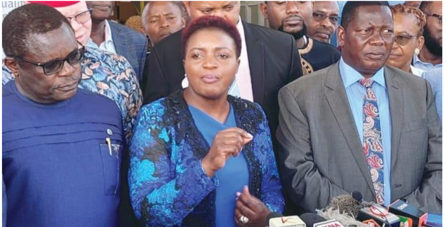
Health Cabinet Secretary Susan Nakhumicha addressing the media.