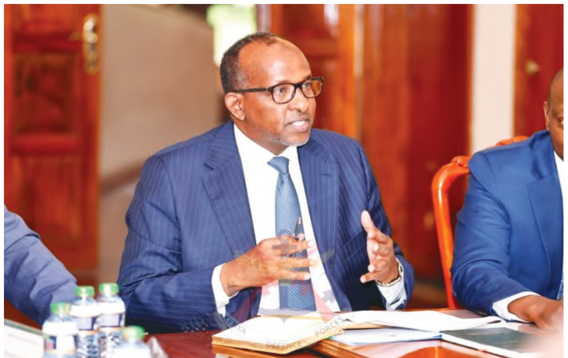
Defence Cabinet Secretary Aden Duale

CS Duale was received by President Abdel Fattah El-Sisi during his three-day visit to Egypt. The meeting was also attended by Minister of Defense and Military Production, General Mohamed Zaki.