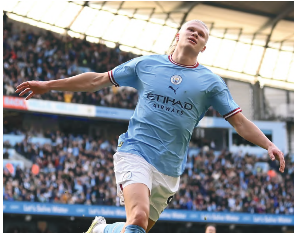
Erling Haaland celebrates his milestone.

Manchester City enjoyed the perfect warm-up for Sunday's crucial Premier League trip to Liverpool as they cruised 3-1 past Copenhagen to reach the Champions League quarter-finals for a seventh successive season.