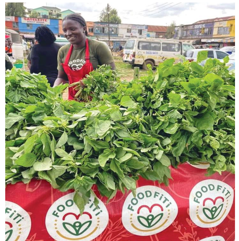
A lady selling different varieties of vegetables.

Last year in November, Jomo Kenyatta University of Agriculture and Technology launched a national food fortification reference laboratory, equipped with modern tools for analysis to aid government’s efforts to reduce malnutrition among vulnerable groups through addition of essential micronutrients in widely consumed staple foods such as maize and wheat flour, edible oils and salt.