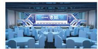
Gala Dinner Venue Co-Branding