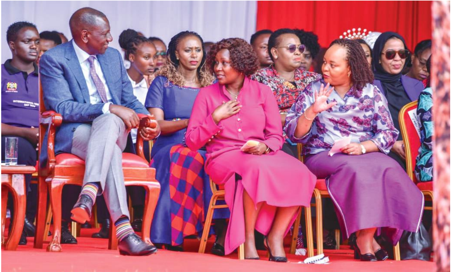
President William Ruto with Embu governor Cecily Mbarire and her Kirinyaga counterpart Ann Waiguru in Embu yesterday.