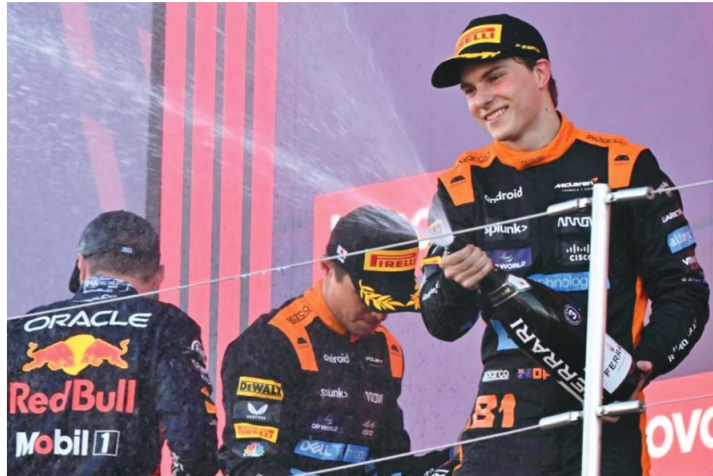
Files: Third-placed McLaren's Australian driver Oscar Piastri (R) celebrates on the podium with winner Red Bull Racing's Dutch driver Max Verstappen (L) and second-placed McLaren's British driver Lando Norris at the end of the Formula One Japanese Grand Prix at the Suzuka circuit, Mie prefecture on September 24, 2023...

Max Verstappen topped Friday's Saudi Arabian Grand Prix third and final practice for the troubled Red Bull team after British teenager Oliver Bearman was handed a dramatic debut for Ferrari.