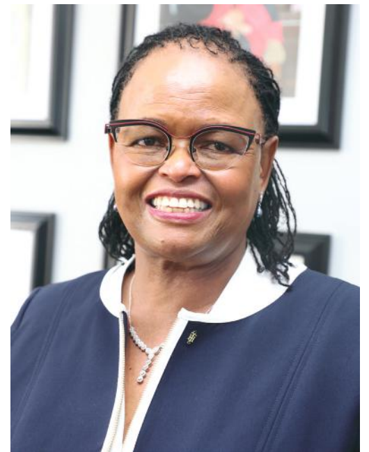
News: Women Are Striving Towards Their Societal Reflections To Men P.11