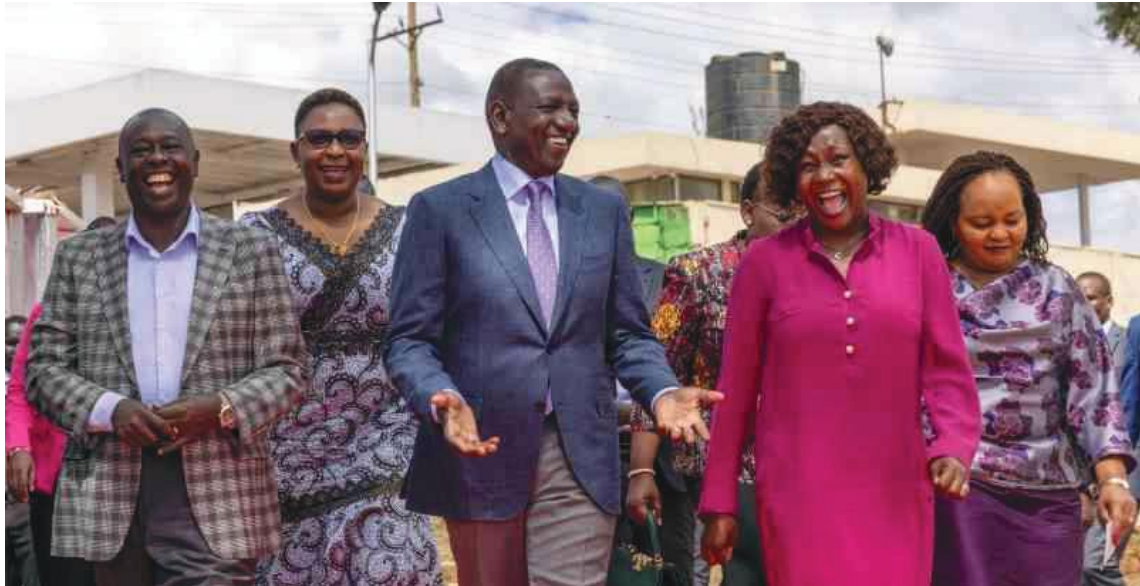
President William Ruto during the International Women Day celebrations.

It should not look as a competition between men and women, but women have emphasized on a phrase mostly used that, 'what a man can do a woman can do it better'. As a result in 2017, three women won gubernatorial