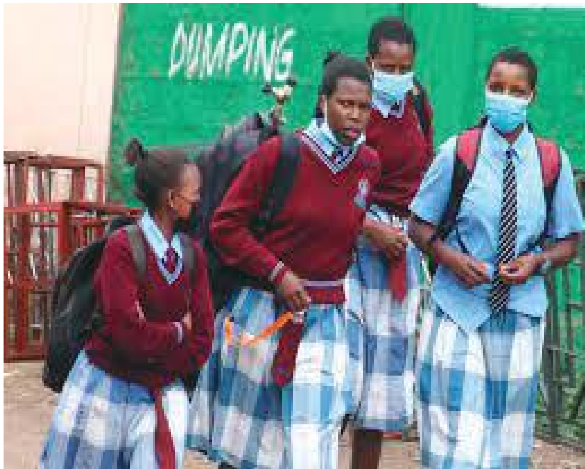
General Learning Skills in Junior High School Students .