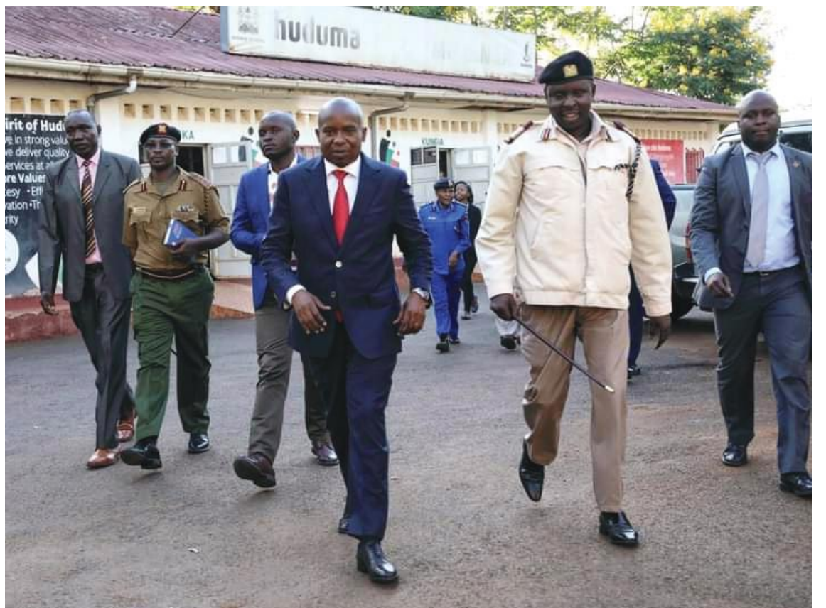
Cabinet Secretary Kithure Kindiki with security officers from Murang’a County.

Since Wednesday this week, security officers in Murang’a have carried out a crackdown in various parts of the county and arrested scores of bar owners, found breaching liquor laws.