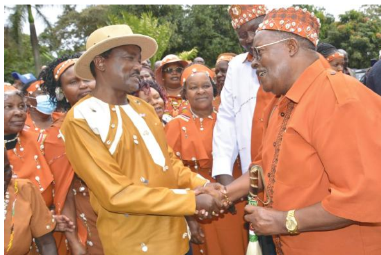
Wiper Democratic Movement leader Kalonzo Musyoka engaged in a significant with representatives from the Kikuyu and Kamba Council of Elders

The Kikuyu and Kamba Council of Elders expressed their support for Kalonzo Musyoka's leadership and vision for a united Kenya. They commended his efforts in advocating for