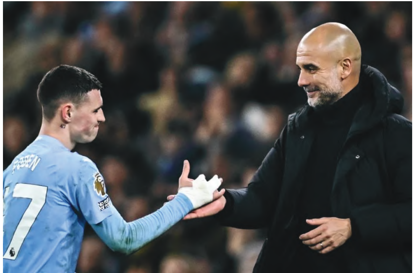
Manchester City's Spanish manager Pep Guardiola (R) congratulates Manchester City's English midfielder Phil Foden as he leaves the pitch during the English Premier League football match between Manchester City and Aston Villa at the Etihad Stadium in Manchester, north west England, on April 3, 2024.

Manchester City manager Pep Guardiola has told his side to prepare for another Premier League title race that goes all the way to the last day of the season. Reigning champions City have been playing catch-up this term in a three-way clash with Arsenal and Liverpool. City maintained their charge by drawing level on points with second-placed Liverpool, and moving just one behind leaders Arsenal, with a commanding 4-1 win at home to Aston Villa on Wednesday featuring a hat-trick from England midfielder Phil Foden. Liverpool, however, can regain top spot when they play their game in hand against bottom-of-the-table Sheffield United later Thursday. Guardiola continues to insist his