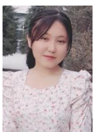
By: Kholturayeva Ugilyov Urol @themtkenyatimes