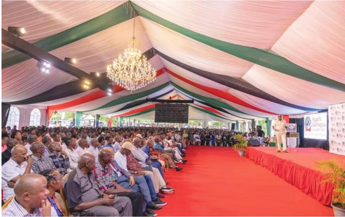
Deputy President Rigathi Gachagua addressing Pwani University students and leaders who accompanied him yesterday.

By: DPCS and MKT Reporter @themtkenyatimes