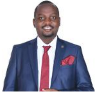
By: Erick Kamau Kahura @themtkenyatimes