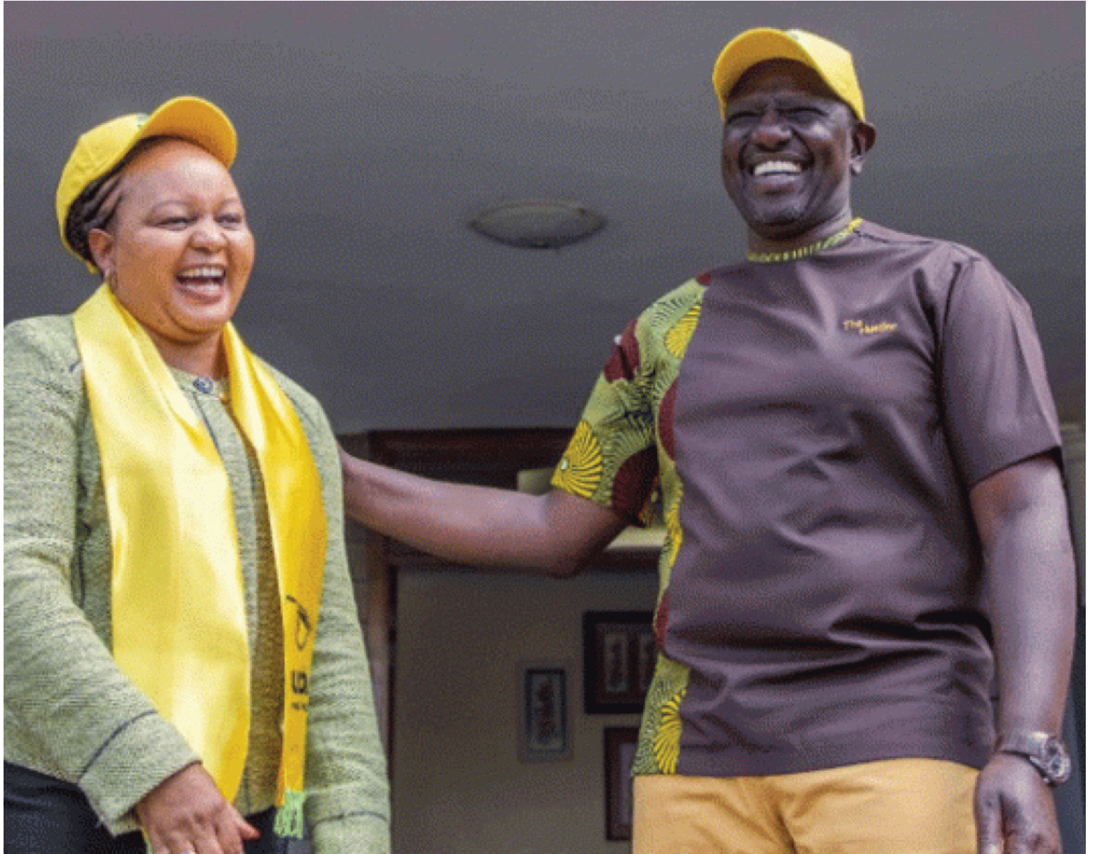
Kirinyaga Governor Anne Waiguru and President William Ruto at a past event.

It seems she breathed a sigh of relief when the outgoing President Uhuru Kenyatta convinced Azimio La Umoja One Kenya Coalition leader Raila Odinga to pick her as his running mate.