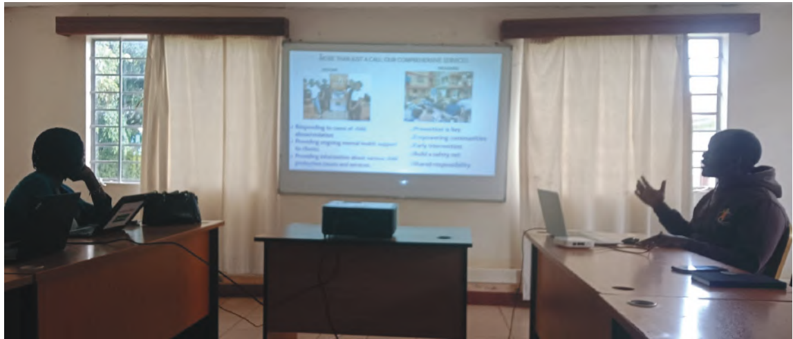
An open line for protecting children; Helpline counselors are addressing mental health issues and violence against children

In addition to its hotline services, Childline Kenya also operates community outreach programs aimed at raising awareness about child rights and protection. Through workshops, seminars, and educational campaigns, the organization strives to empower children with knowledge and skills