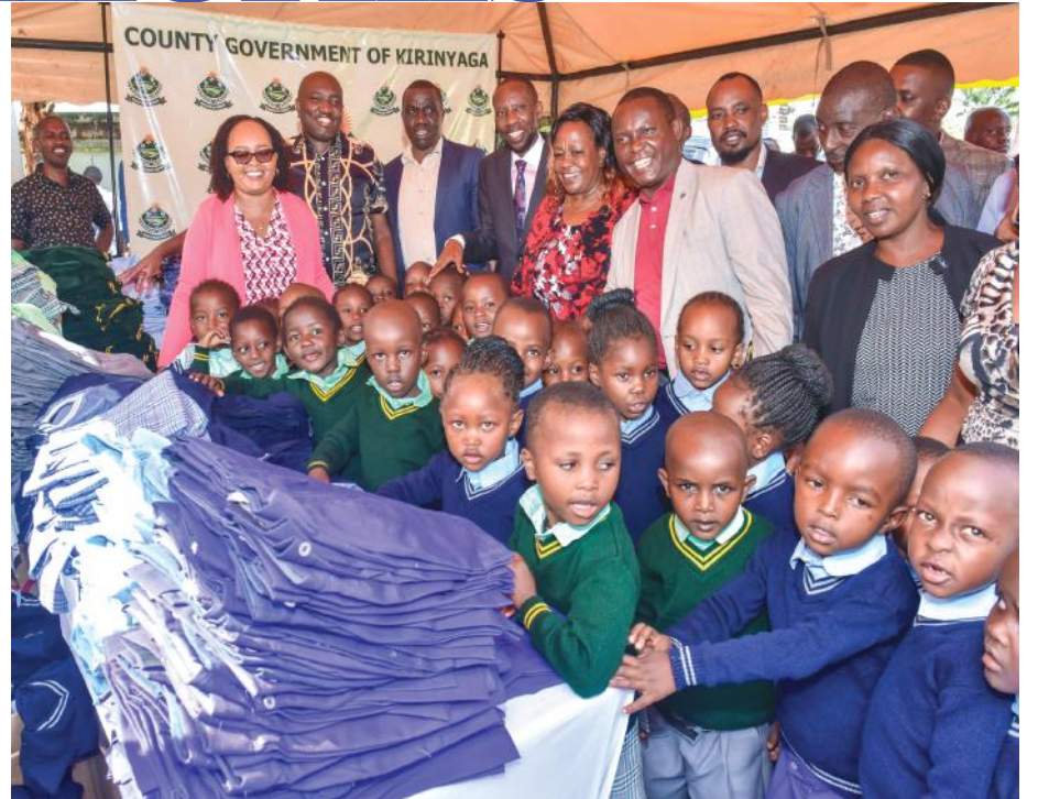
Kirinyaga County Governor, Anne Waiguru (in pink) with her cabinet posh for a photo during uniform distribution event

Kirinyaga County Governor, Anne Waiguru has made history as the first governor to issue free uniforms to all Early Childhood Development and Education (ECDE) learners. In an event held at the County Headquarters in Kutus town yesterday, Waiguru issued 15,000 complete sets of uniforms to be distributed to all the ECDE learners. The sets consisted of shorts, shirts, sweaters and socks for boys and tunics, blouses, sweaters and socks for girls.