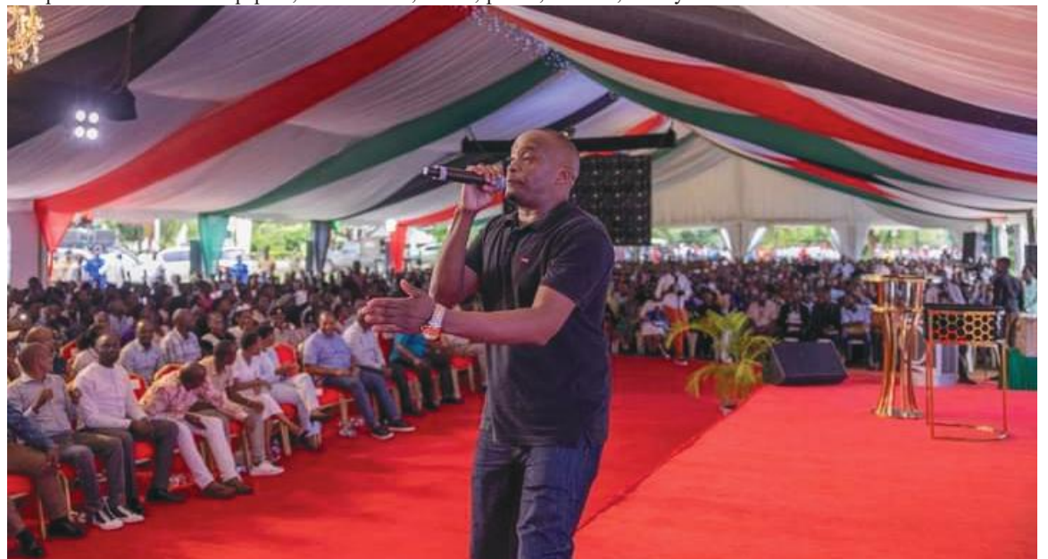
Former Starehe MP Charles Njagua showing his artistic prowess at Pwani University where he accompanied Deputy President Rigathi Gachagua yesterday.

Some of the young leaders and academicians were given an opportunity to address hundreds of the coast based students.