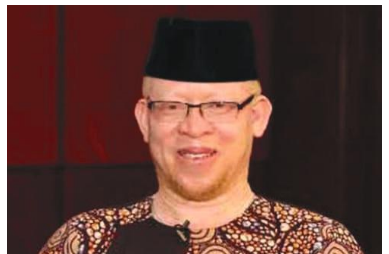
Government Spokesman Dr. Isaac Mwaura.

"In this regard, the Board entered into a commercial agency agreement with 51 Capital (K) in April 2022 to distribute a product called GPC. In the agreement, 51 Capital as the Principal was to sell a variety of products among them GPC Soil Conditioner (the subject matter of 'the fakes ex-