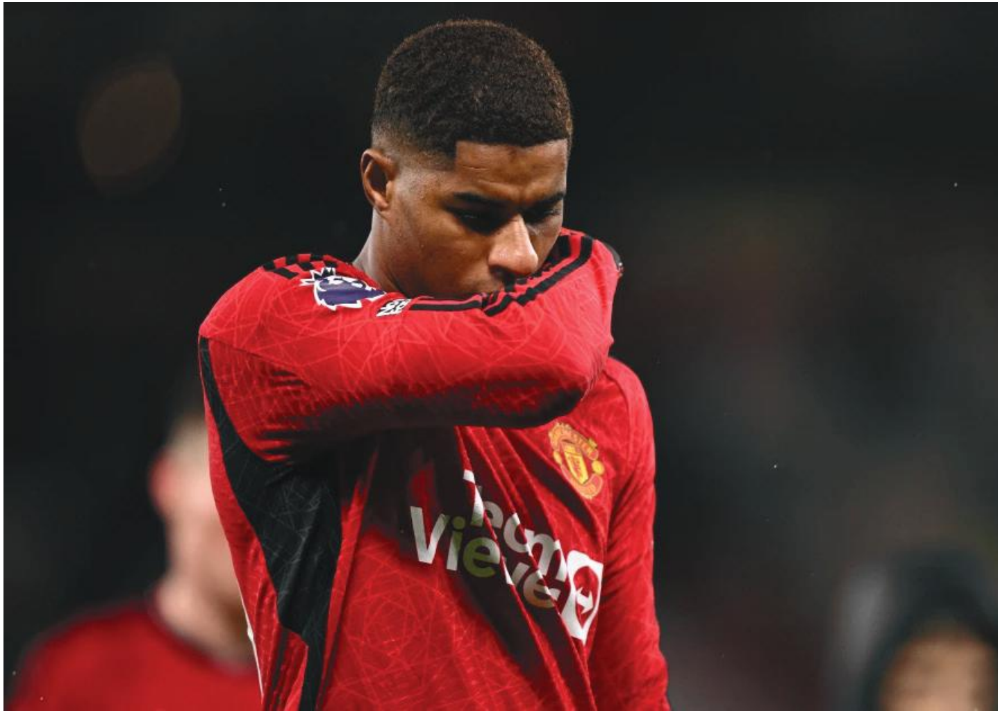
Manchester United's English striker #10 Marcus Rashford reacts to their defeat on the pitch after the English Premier League football match between Manchester United and Bournemouth at Old Trafford in Manchester, north west England, on December 9, 2023. Bournemouth won the game 3-0.

Rio Ferdinand believes Marcus Rashford may have to leave Manchester United if the England forward is to revive his faltering career.