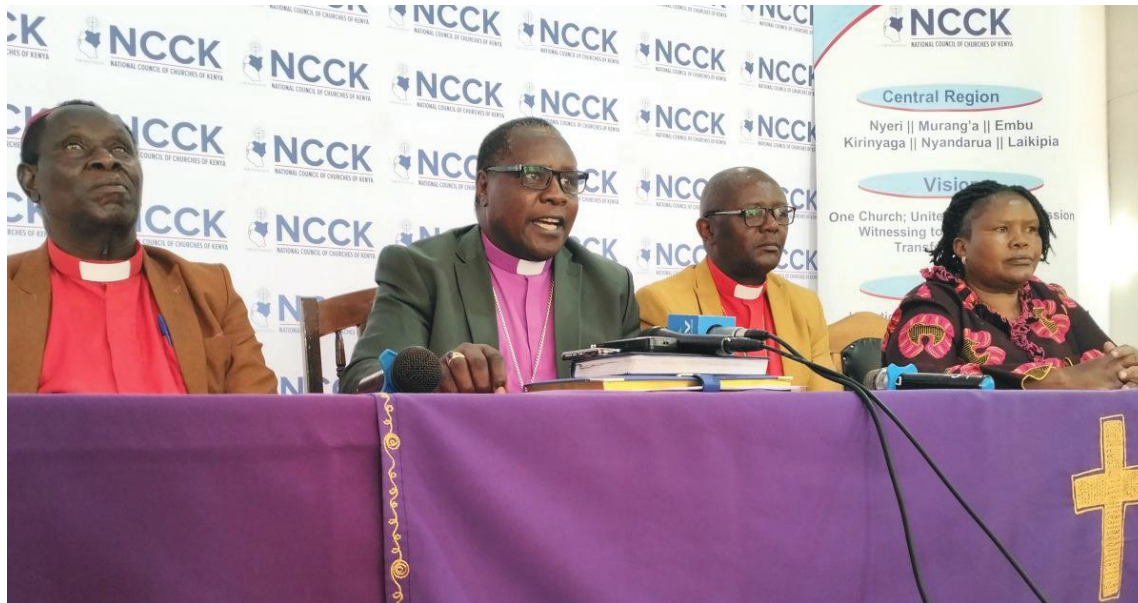
NCCCK Calls For The Resignation Of CS Nakhumicha, Murkomen And Linturi.