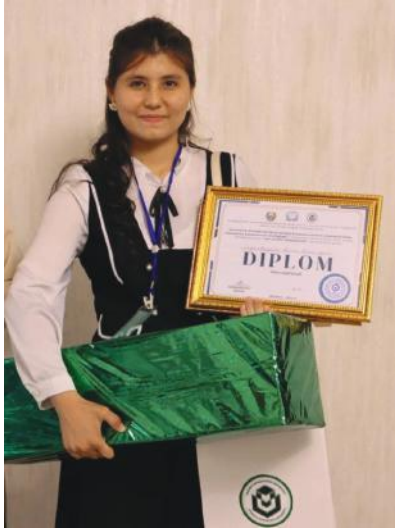
By: Aziza Saparbaeva xxxxxxxxxxxxxx