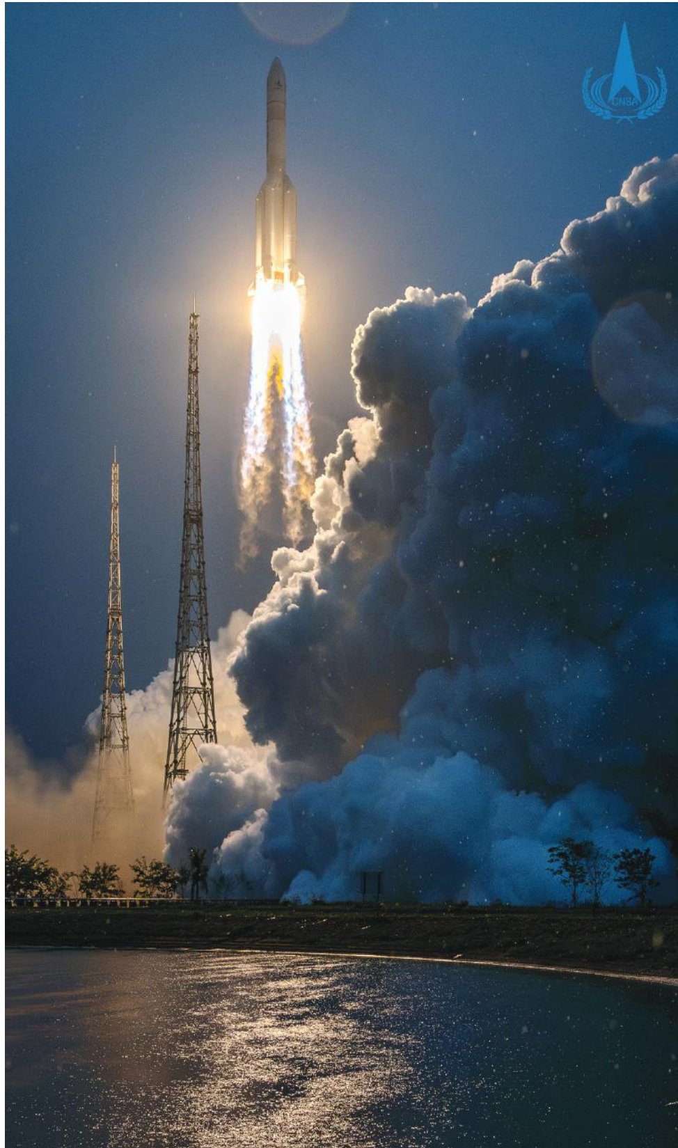
A Long March 5 heavy-lift rocket, carrying the Chang'e 6 robotic lunar probe, blasts off on Friday from the Wenchang Space Launch Center in Hainan province.

materials recovered from the far side will be made available to the international science community, to give more scientists access to these samples, like it was done in case of Chang'e 4," he added.