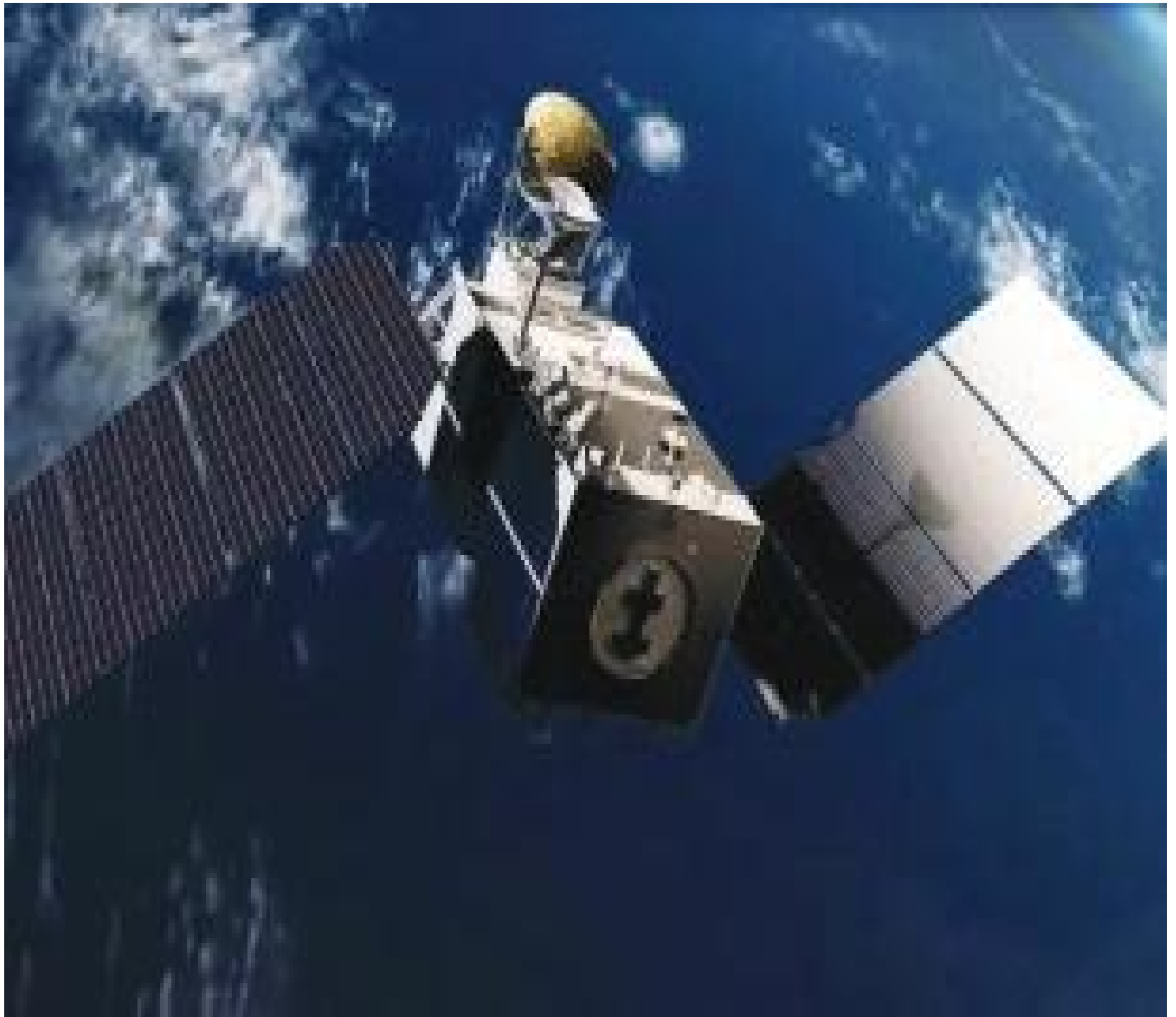
Chen Lin, deputy chief designer of the FY-3G ground system, said global observation of precipitation, particularly that of three-dimensional structures, has been a challenge in meteorological detection

As the 20th satellite in the Fengyun system, FY-3G is the world's first satellite to deploy the combined detection of active precipitation measurement radar with passive microwave and optical remote sensing, marking a transition from passive observation to active probing.