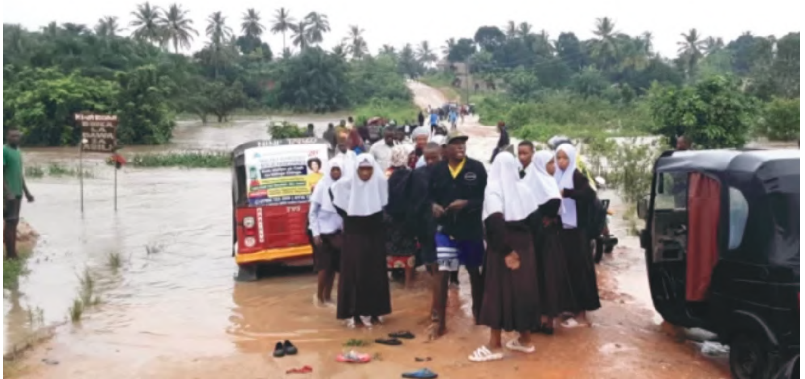
Schoolchildren are stranded on a damaged River Zingiziwa bridge in Dar Esalaam, Tanzania, on April 25, 2024. Flooding in Tanzania caused by weeks of heavy rain has killed at least 150 people as of May 4, 2024, and affected hundreds of thousands more.

Tanzania, where the ground is already absolutely sodden. Tanzania, which has suffered flooding, is about to get hit with more heavy rains falling ... from this system.