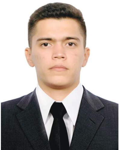
By: Davlatnazarov Davlatnazar xxxxxxxxxxxxxx