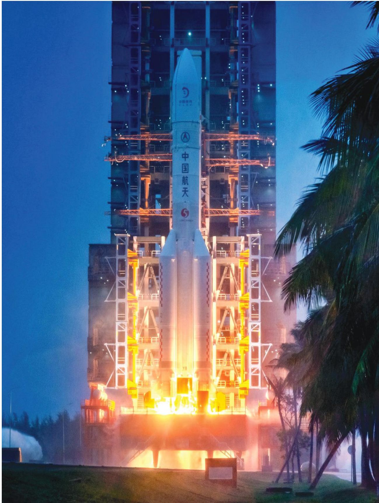
A Long March 5 heavy-lift rocket, carrying the Chang'e 6 robotic lunar probe, blasts off on Friday from the Wenchang Space Launch Center in Hainan province.

an unfortunate failure — as a symbol of audacious and pioneering work in the history of humankind's lunar exploration.