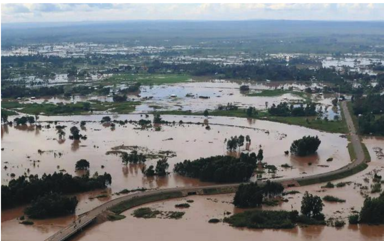
Floods on Tanzania and Kenya's coast