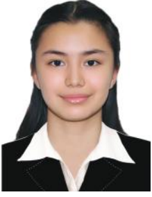
By: Ne'matova Farangiz xxxxxxxxxxxxxx