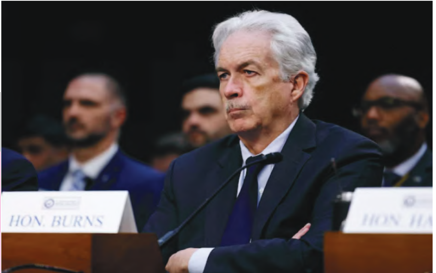
Director of the Central Intelligence Agency William Burns testifies at a Senate Intelligence Committee hearing on worldwide threats to American security, on Capitol Hill in Washington, U.S., March 11, 2024.

• The war began after Hamas stunned Israel with a cross-border raid on Oct. 7 in which 1,200 people were killed and 252 hostages taken, according to Israeli tallies.