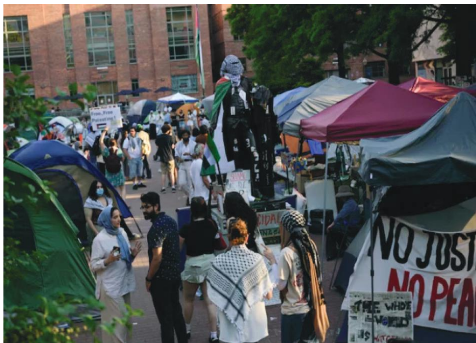
People stand around a statue of George Washington tied with a Palestinian flag and a keffiyeh inside a pro-Palestinian encampment at George Washington University in Washington, DC, U.S., May 2, 2024.