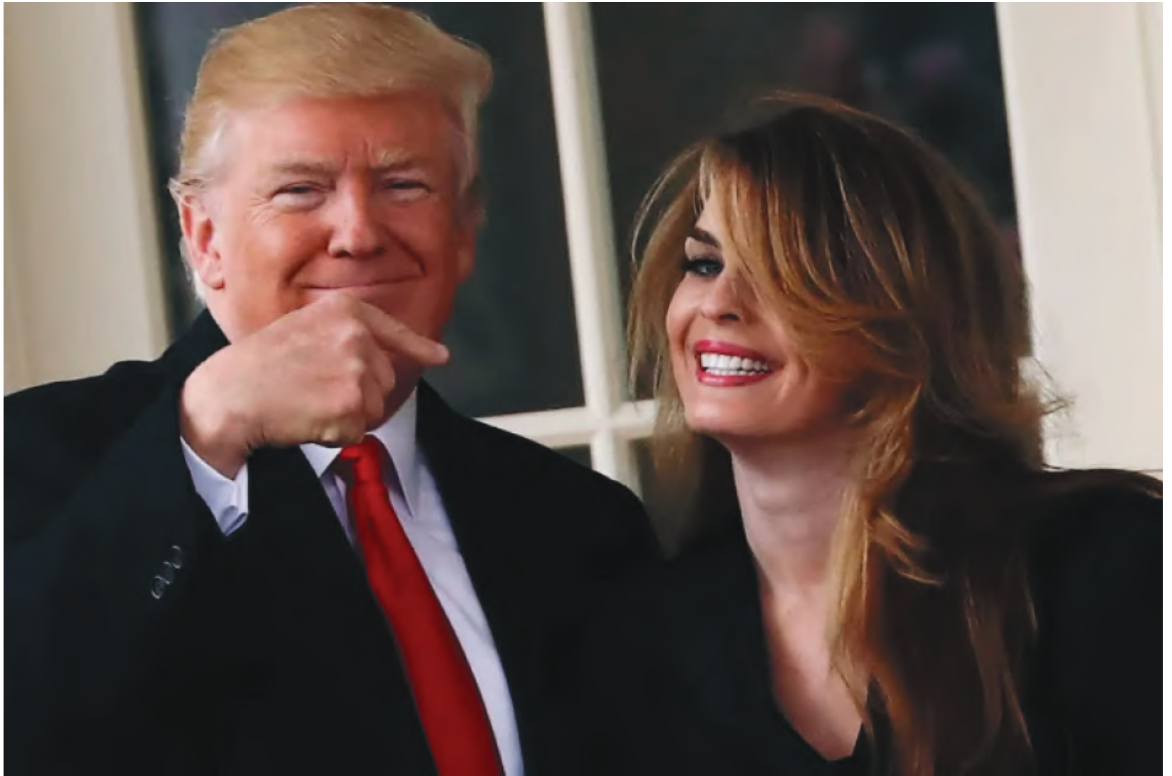
President Donald Trump with former White House Communications Director Hope Hicks in Washington, March 29, 2018.

By: Reuters dilnurasotimboyeva@gmail.com xxxxxxxxxxxx