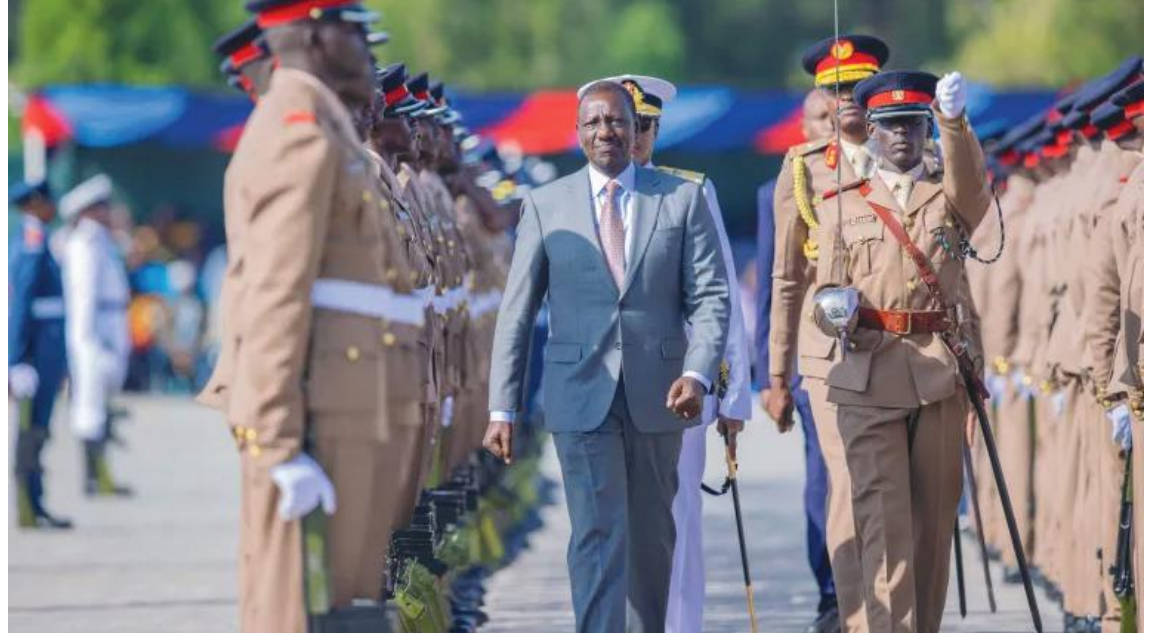
President William Ruto

The new cadets are the last cohort to graduate with degrees from KU following the acquisition of a university charter by the National Defence University which now be providing the courses to KDF.