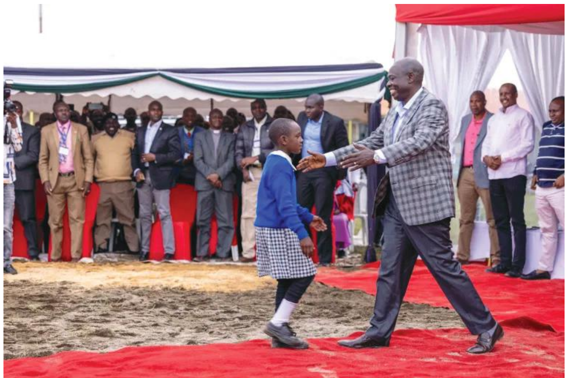
Deputy President Rigathi Gachagua .

"It will be a mistake to undermine the office of the Deputy President and the holder of that office like it happened during the previous Jubilee Party regime. I appeal to MPs