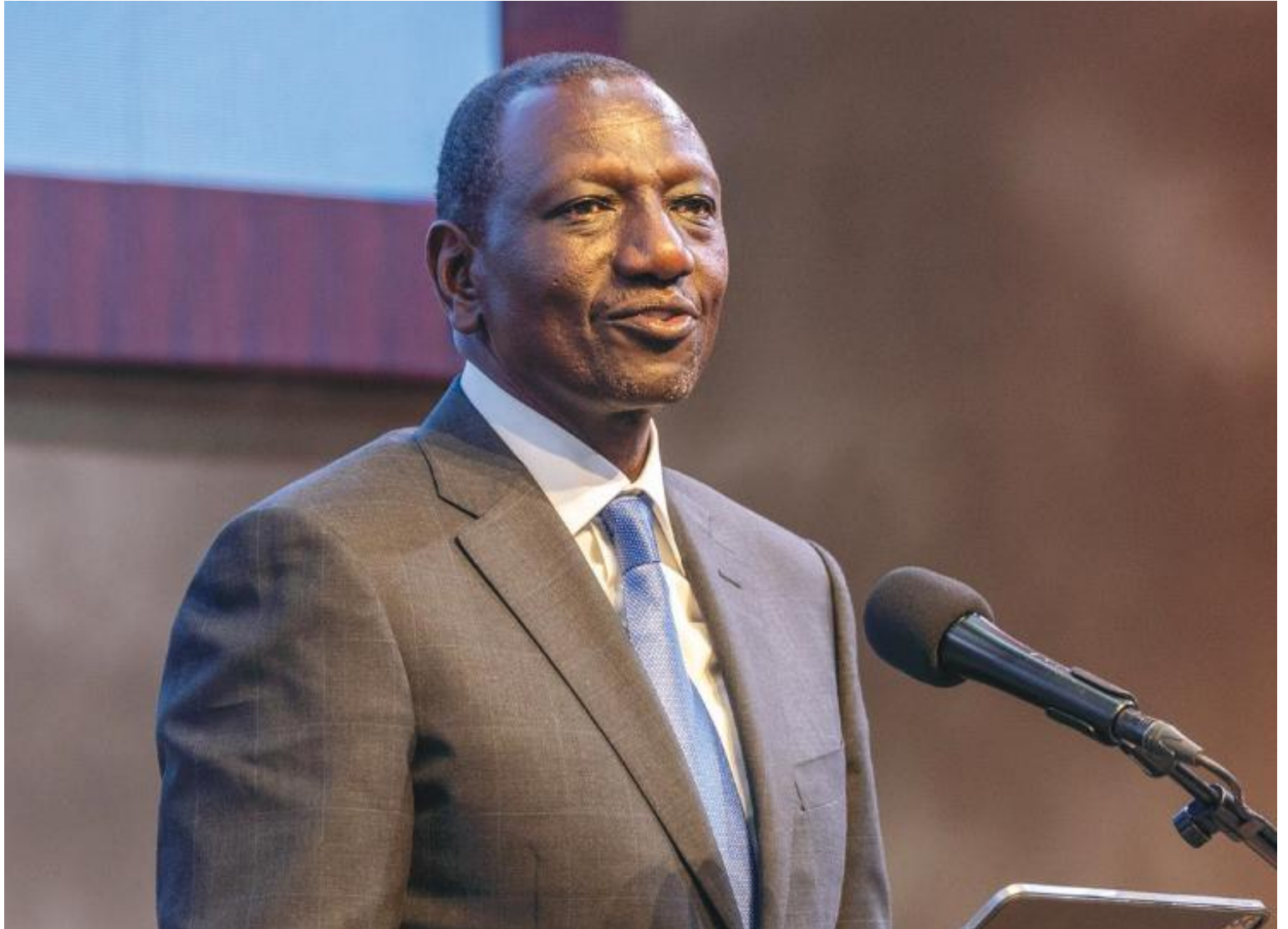
President William Ruto

Recently, I listened to President William Ruto's speech as he led the nation to mark this year's Labour Day.