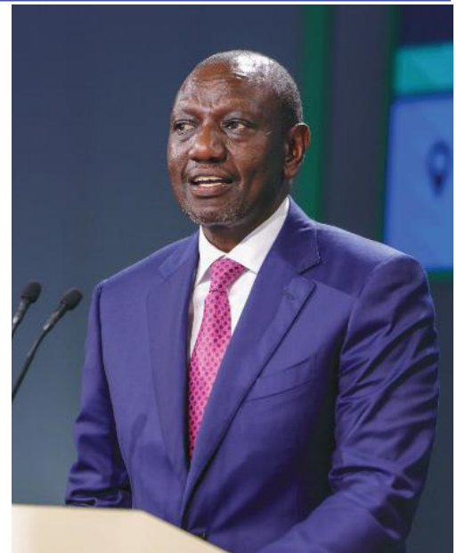
Deputy President Rigathi Gachagua

Political Opinion: Ruto's 'Zakayo Is Just A Name' Remark Was Well Understood P.11