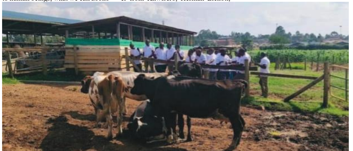
Veterinarians monitor cows at the Bukura Smart Dairy Farm during a learning tour as part of training on animal health through the Africa Livestock Productivity and Health Advancement Initiative (ALPHA plus) conducted by Ripple Effect and Zoetis.

“Out of these animals, we are milking 13 with an average of 8 liters per cow, per day. We sell the milk that we produce to locals at Sh60 per liter. The demand for milk is very high,” she disclosed.