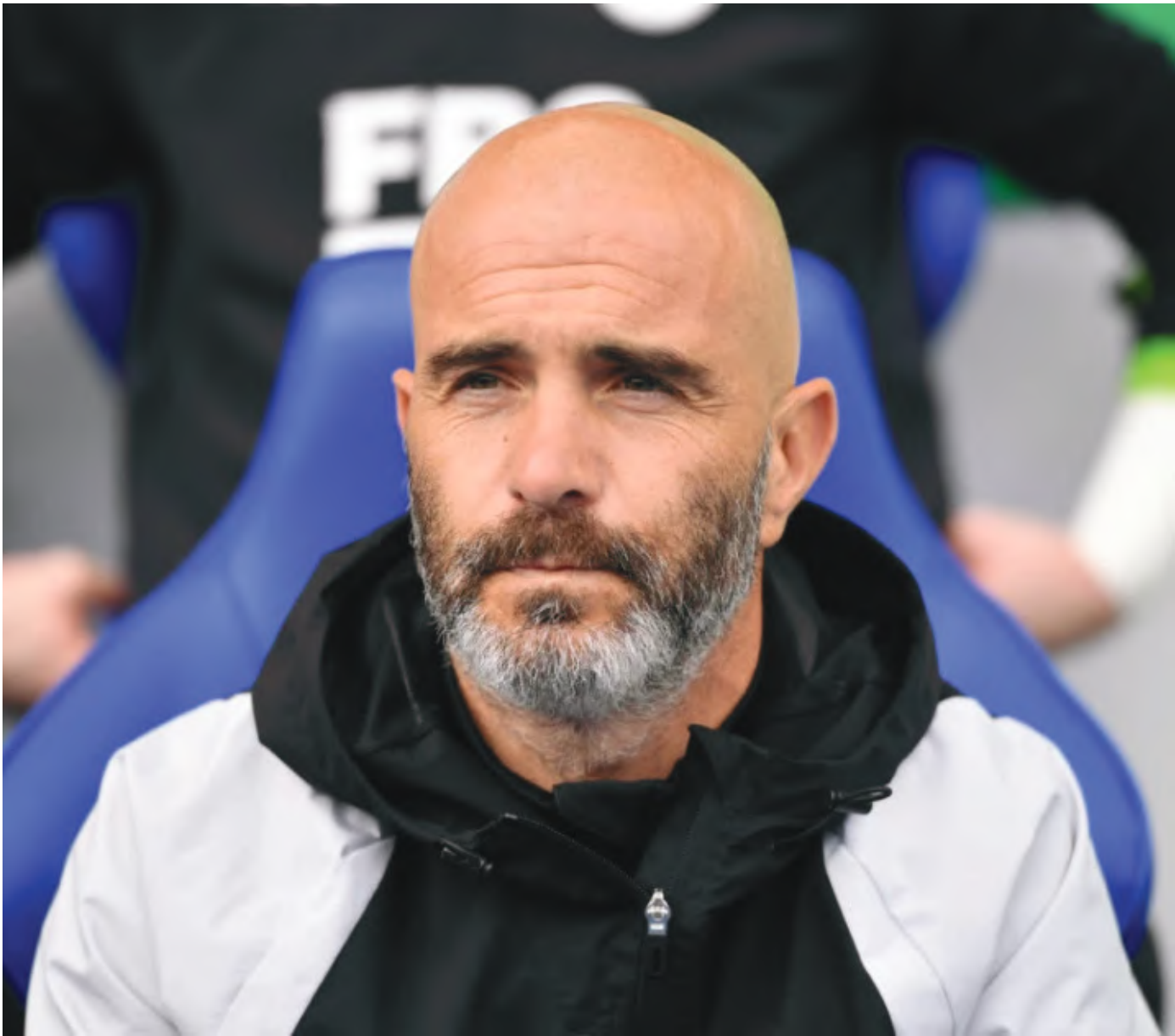
Enzo Maresca in a past match at Leicester City. Photo by Plumb Images/Leicester City FC via Getty Images..