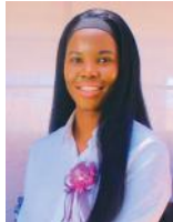
By: Paula Otukile Gaborone, Botswana

In the dusty village of Mahalapye, relatively approximately 5km from the center of the village lays an area name Tshikinyega 2, a mile from Di-laene ward, a mile from Parwe ward, in fact kind of no man's land of it was overseas, or by the borders.