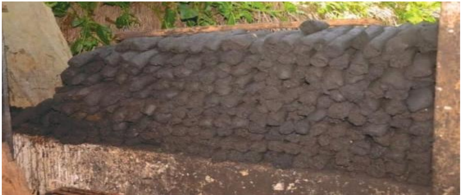
Finished end product of charcoal briquettes placed on a raised flat surface to dry before its viable for use.

In a bid to curb deforestation and environmental degradation in Kenya, traditional charcoal production is no longer a viable option.