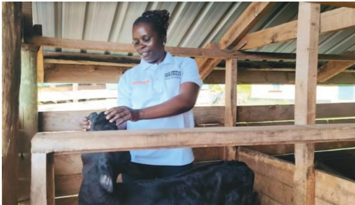
A veterinarian examining a calf