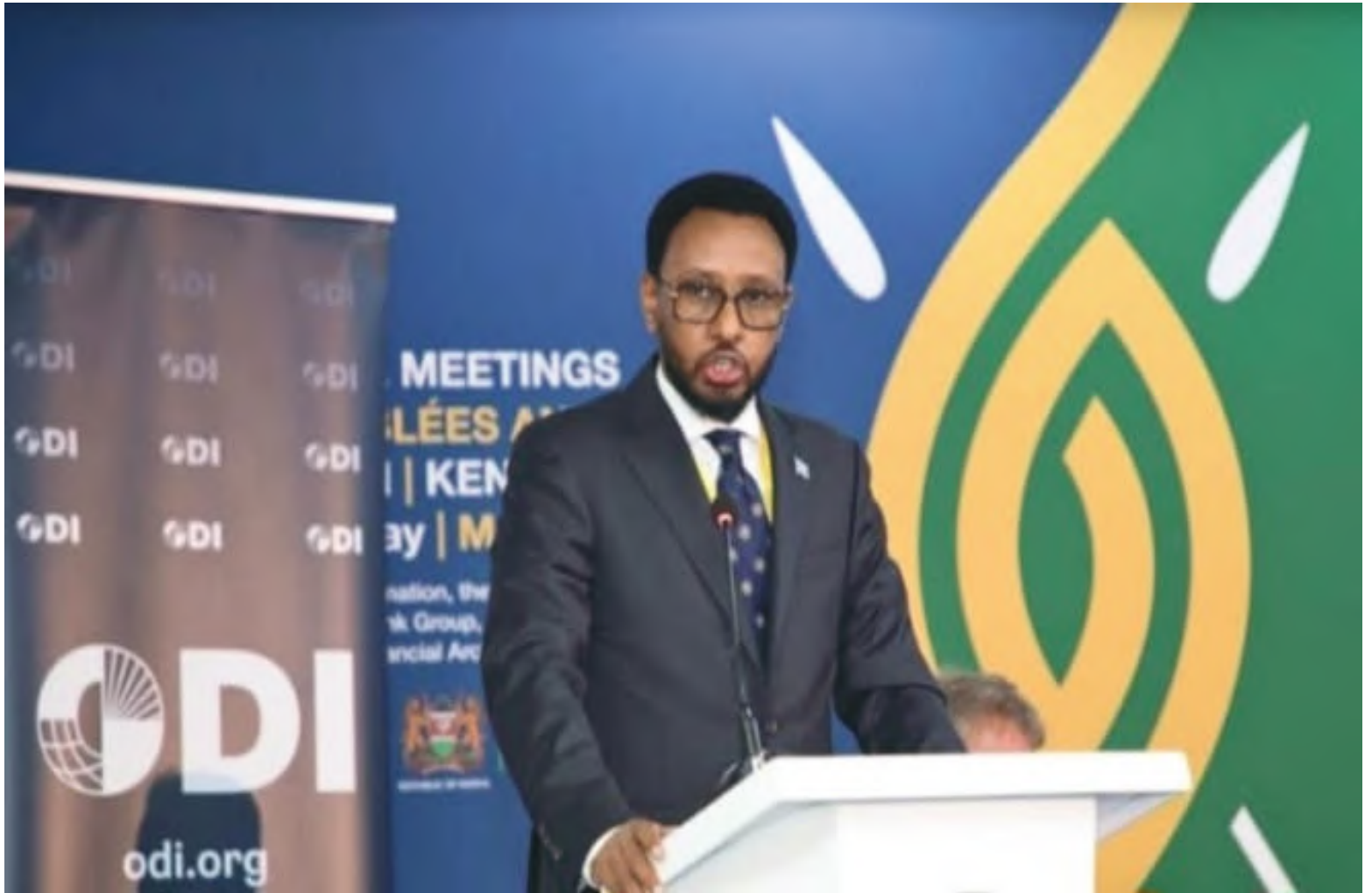
Somalia Minister of Finance, Bihi Iman Egeh addressing the forum yesterday.

Countries in Africa have been called upon to build resilient economies through collaborative action in efforts to face ever-emerging global shocks.