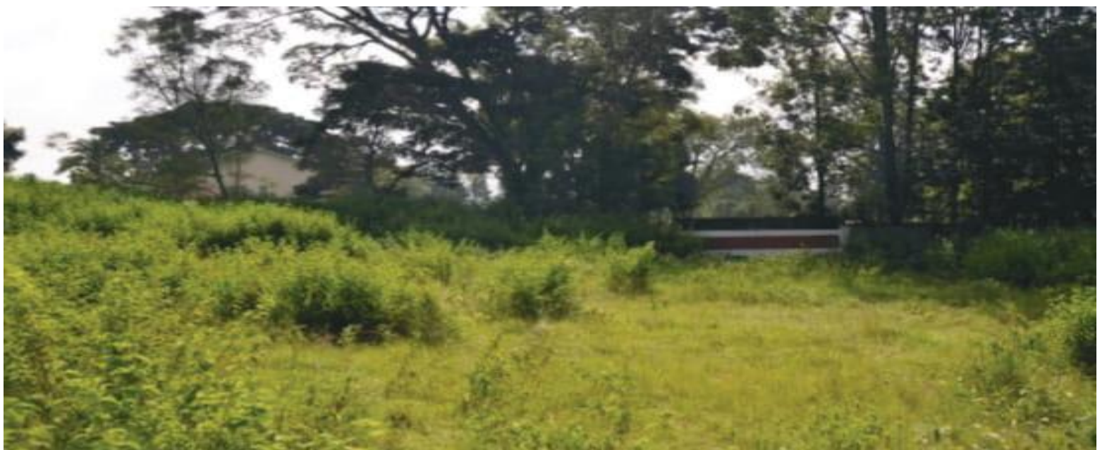
A section of the parcel of land, in the official residence of the Central Regional Commissioner in Nyeri that was hived off and sold to a private developer. The land is part of government land and houses valued at KSh5.2 billion that the Ethics and Anti-Corruption Commission (EACC) is seeking to repossess from the hands of grabbers in Central region.