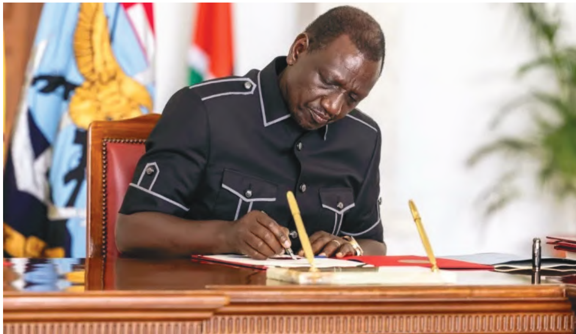
President William Ruto .

Treasury was also instructed to direct all accounting officers to ensure that only critical and essential services are funded, using no more than 15pc of the budget, until the supplementary budget is approved.