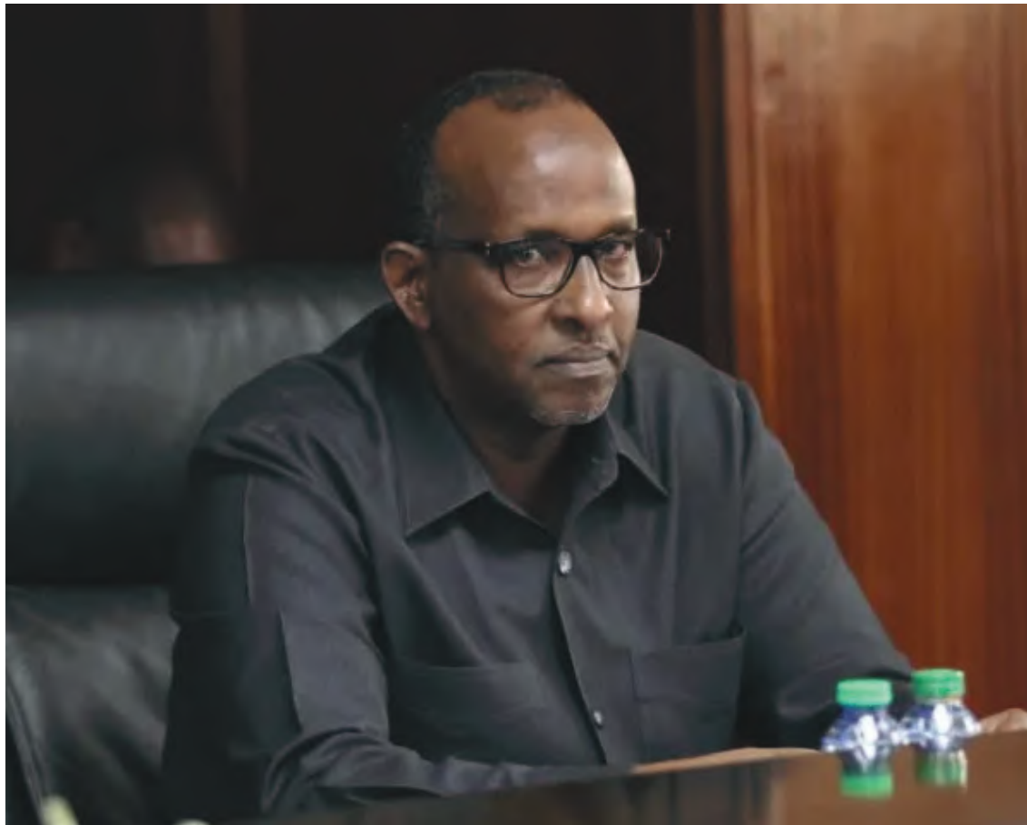
Defense Cabinet Secretary Aden Duale

“Deploying the military in a blanket manner without defining the scope or nature of the intervention, the duration of such intervention, is a dangerous trend that can bring about militarization of the country which is antithetical to the enjoyment of rights and freedoms,” he argued