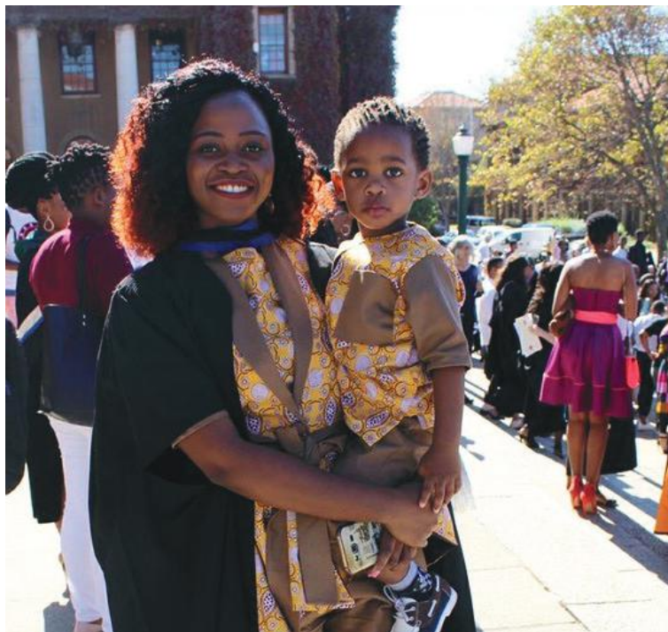
Student mothers interviewed for the research paper about their experiences of institutional culture at UCT reported receiving some support, but said it wasn't consistent.