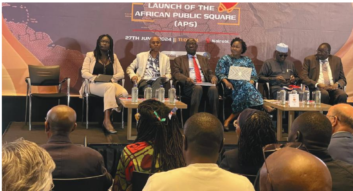
The APS convened a public debate on key discussions along with key partners, an initial intergenerational group of African public intellectuals.