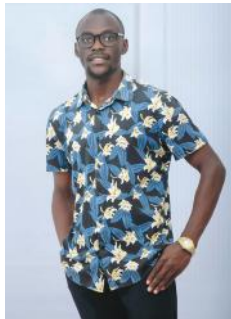
By: Nagwere Gerald @themkenyatimes