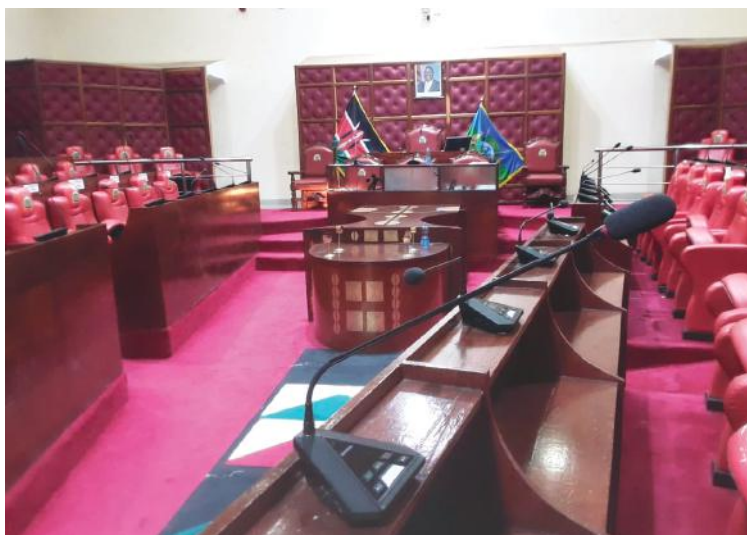
Laikipia County Assembly chambers in Nanyuki town. Protesters stormed the facility, damaged and stole properties.