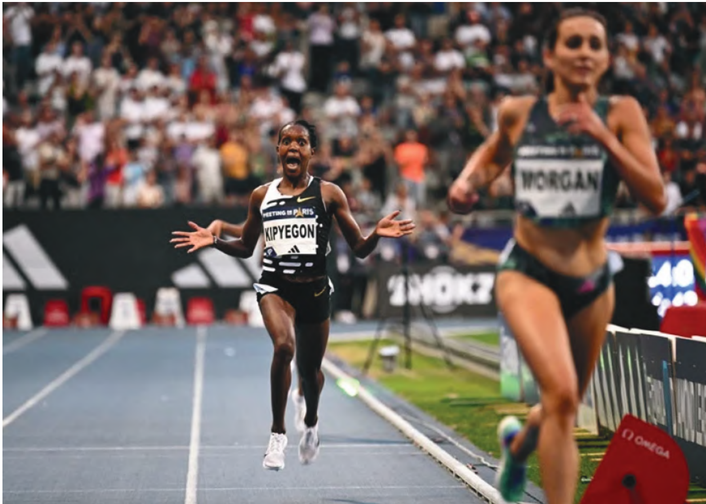
(FILES) Kenya's Faith Kipyegon reacts as she breaks the World record in the women's 5000m event during the IAAF Diamond League "Meeting de Paris" athletics meeting at the Charlety Stadium in Paris on June 9, 2023.

Double world record holder Faith Kipyegon will make a sensational return to the Meeting de Paris where she broke the 5000m world record last year after the Kenyan was confirmed for the eighth Diamond League of the season set for July 7.