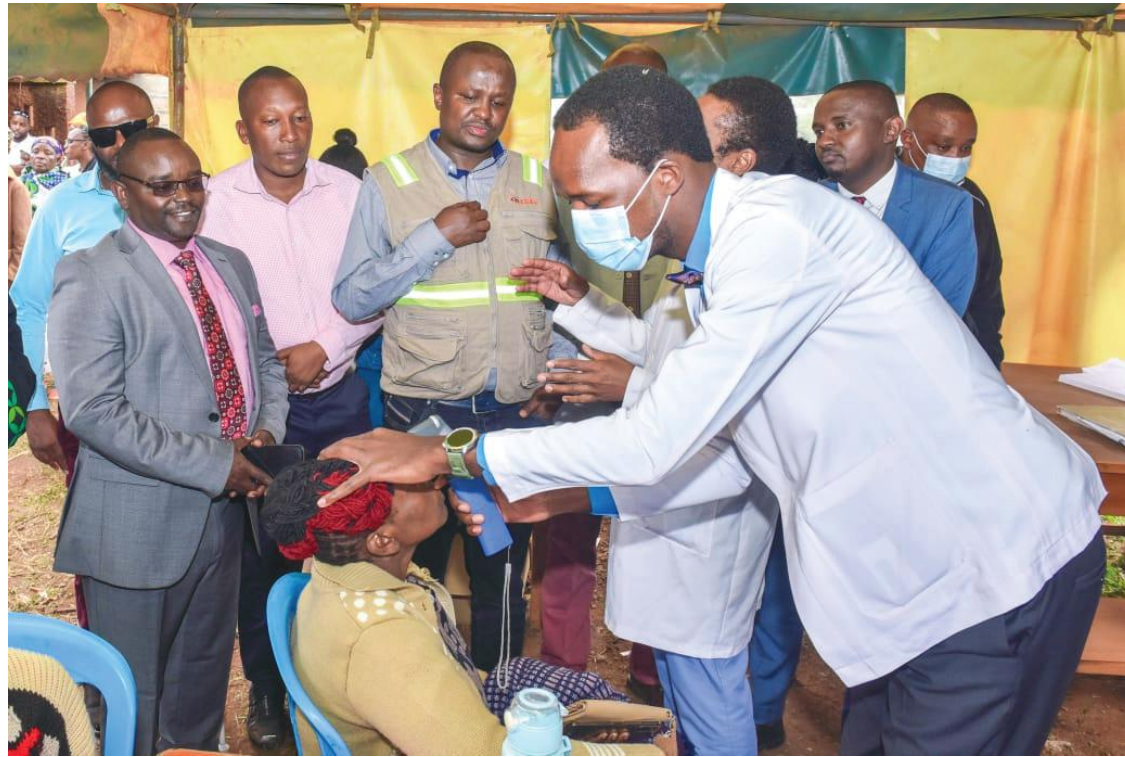
A Medic attends to a patient as officials look on