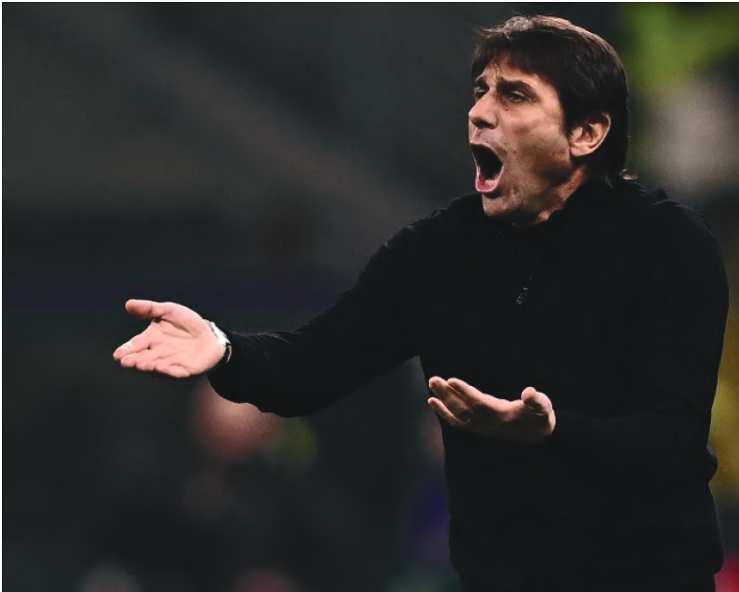
Tottenham Hotspur's Italian head coach Antonio Conte reacts during the UEFA Champions League round of 16, first leg football match between AC Milan and Tottenham Hotspur on February 14, 2023 at the San Siro stadium in Milan. Antonio Conte was named new Napoli coach on June 5, 2024 announced the president of the club Aurelio De Laurentiis on X, formerly Twitter.

Former Chelsea and Tottenham coach Antonio Conte was hired by Napoli yesterday as the deposed Serie A champions try to bounce back from their disastrous league title defence.