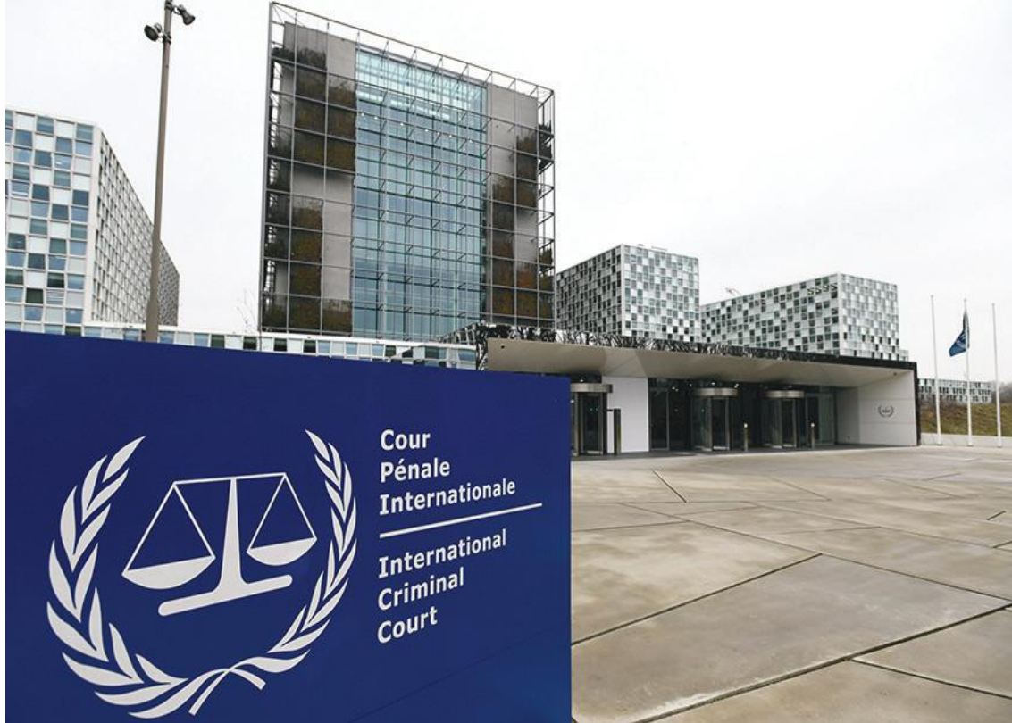
International Criminal Court (ICC)