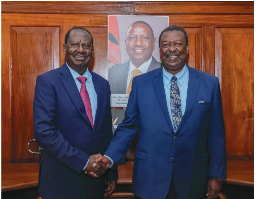
Prime Cabinet Secretary Musalia Mudavadi (Right) alongside former Prime Minister Raila Odinga addressed the media Wednesday regarding Kenya's candidacy for the African Union Commission (AUC) chairmanship.