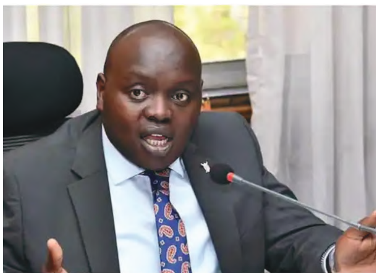
Senator Samson Cherargei .

If enacted, the bill will enhance the mandate of county assemblies to