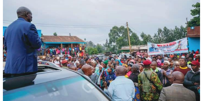
Deputy President Rigathi Gachagua addressing residents of Gikondi trading centre last evening