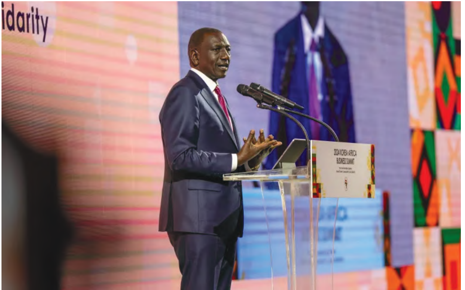
President William Ruto.