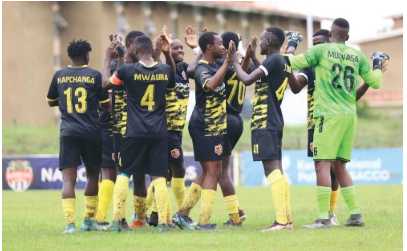
Murang'a Seal FC players reacts against Nairobi City Stars FC during their FKF Premier League match at Police Sacco Stadium. City Stars won 3-0.