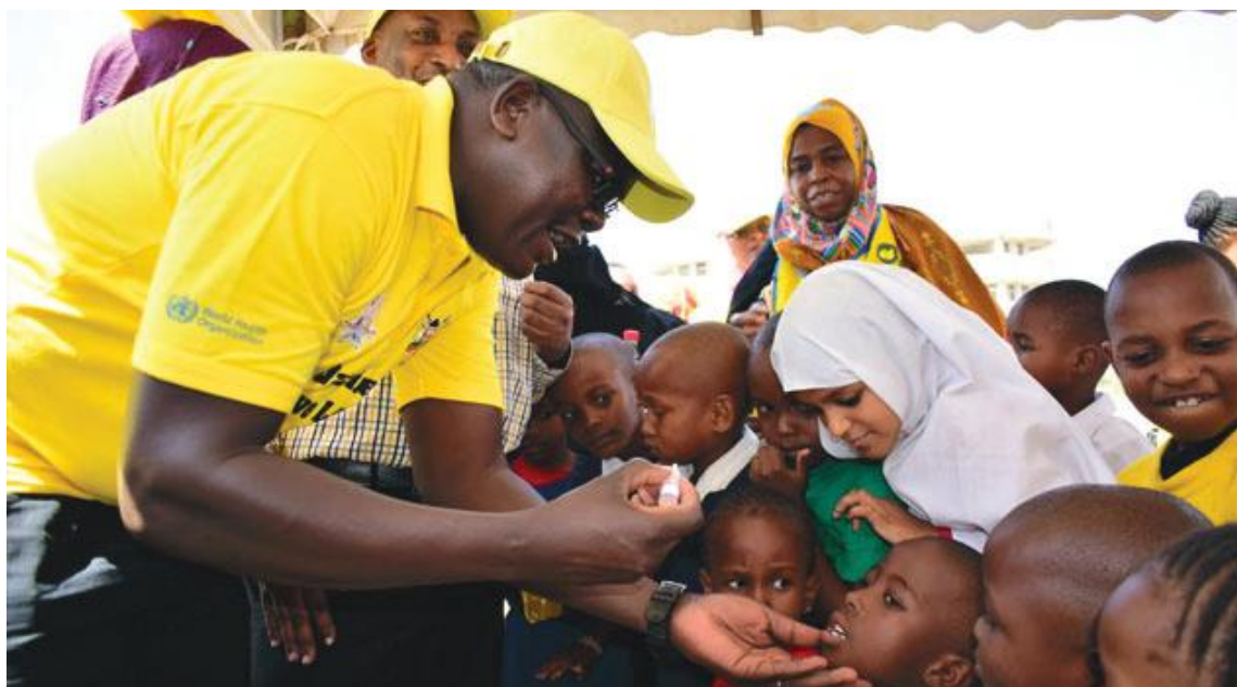
MoH said it had acquired additional refrigeration capacity to transport the vaccines to nine regional vaccine hubs for last-mile distribution

"Ring-fencing domestic resources will guarantee sustainable financing