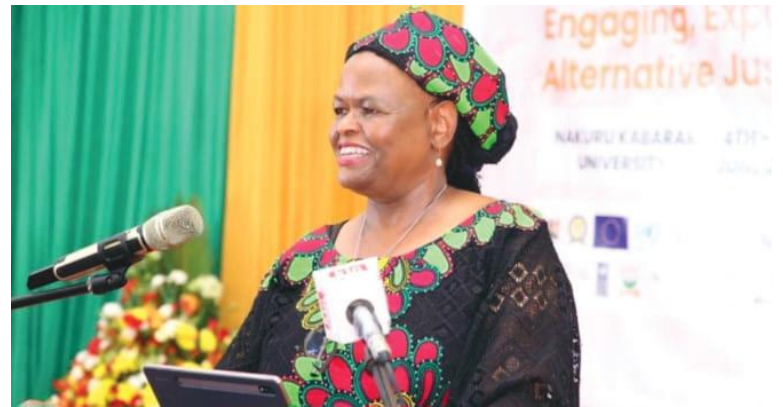
Chief Justice Martha Koome .

Those in the panel get the root cause of disputes by hearing opposing parties vent, disagree, and offer solutions themselves. The panel gives advice and recommendations only.