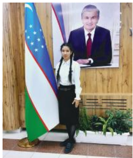
By: Khusanova Nargiza Farkhod