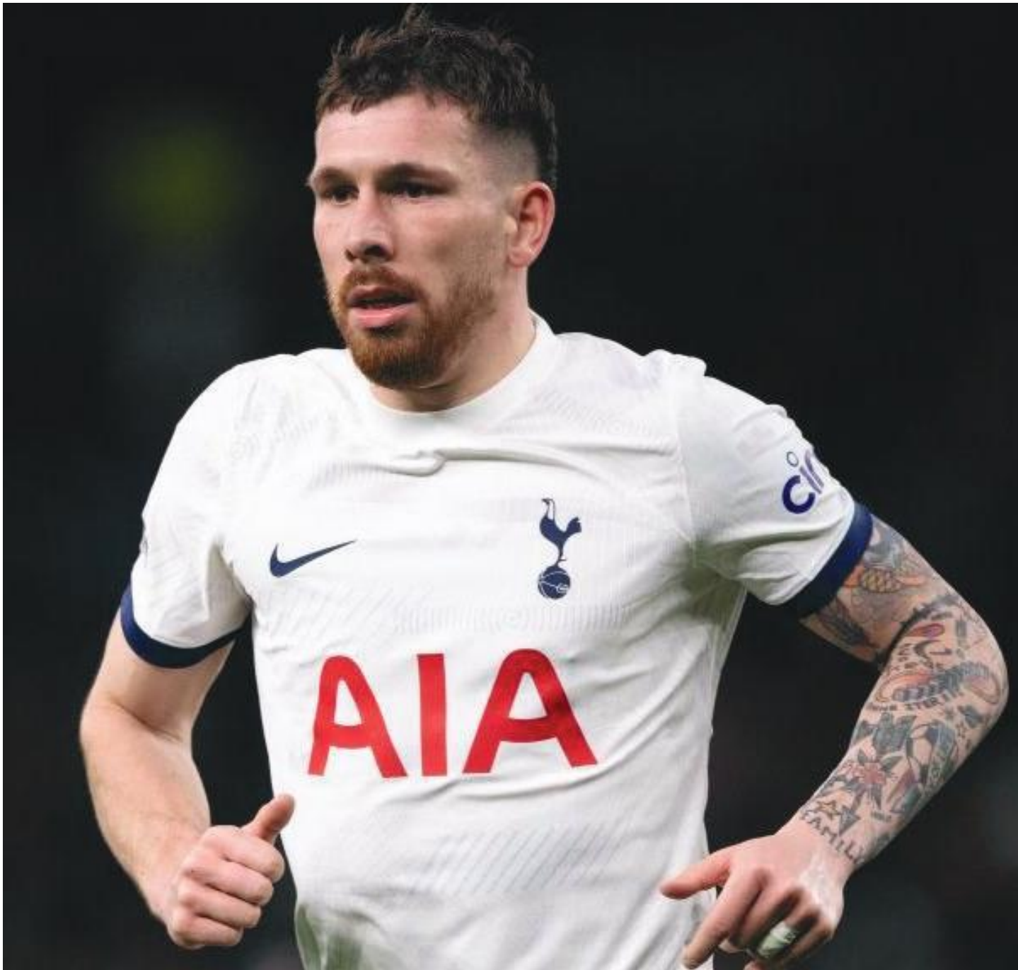
Hojbjerg joined Spurs in 2020 in a £15m deal from Southampton, when Jose Mourinho was in charge

French club Marseille have opened talks to sign Tottenham and Denmark midfielder Pierre-Emile Hojbjerg.