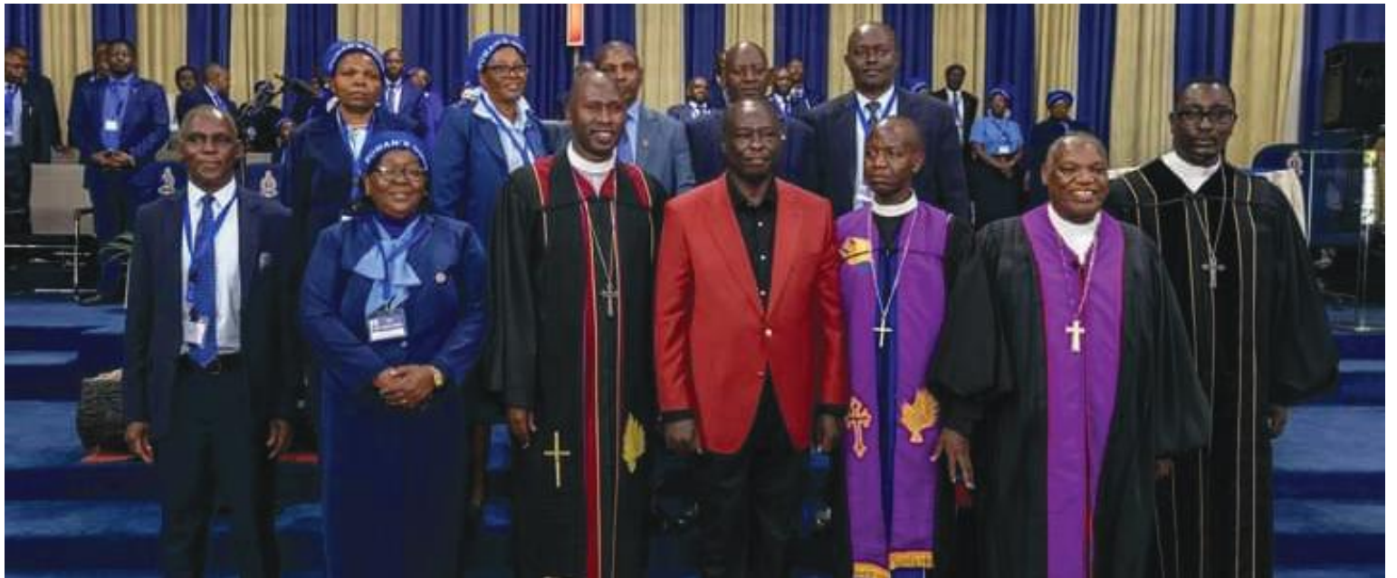
Deputy President Rigathi Gachagua with PCEA Kayole leadership yesterday.