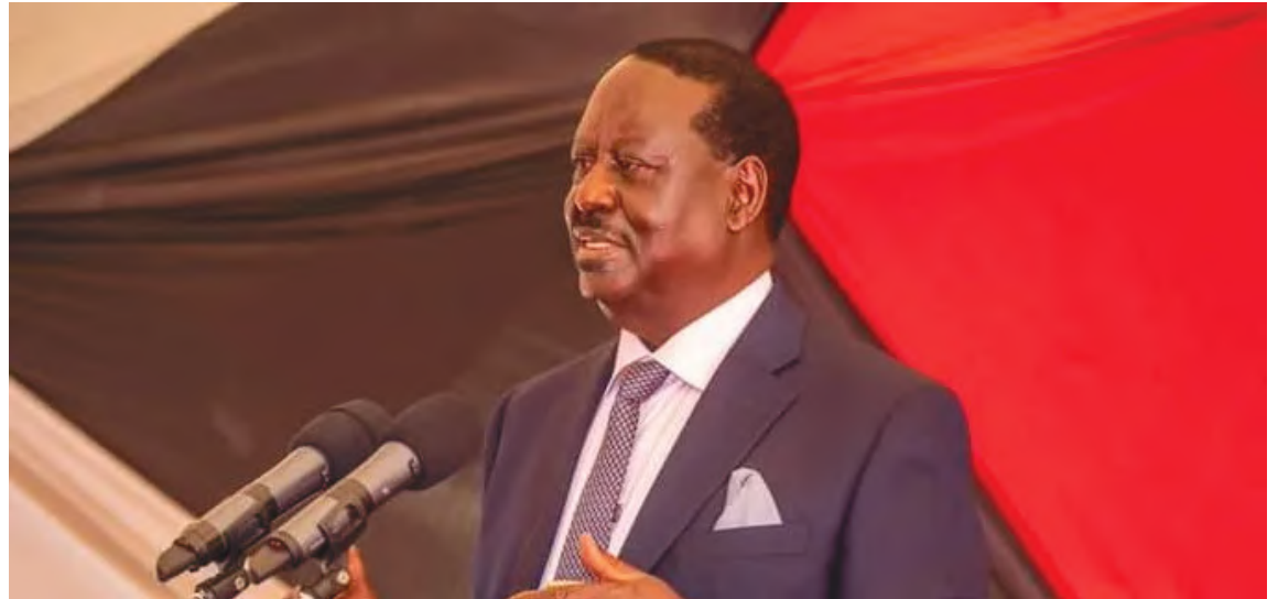
Azimio la Umoja Coalition leader Raila Odinga.

“Discussions are ongoing within both sides. As you may be aware, the opposition has its supporters, and