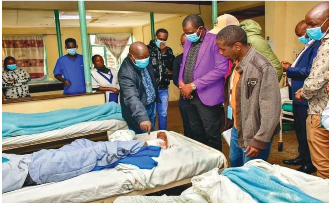
Nyeri County governor Mwalimu Mutahi Kahiga (in black jacket) with other officials when he visited Karatina Level IV hospital on Saturday..

Kahiga said that what started as a good gesture of holding the government accountable was now being infiltrated by criminals, which, if left unchecked, would erode the gains realised from the protests.