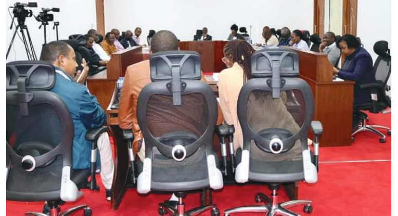
Committee during the Saturday sitting at the Parliament Buildings.