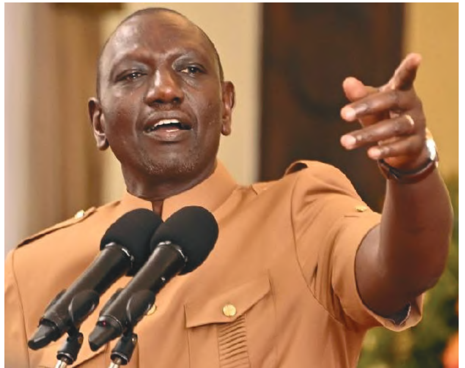
President William Ruto

President William Ruto has declared "enough is enough" after weeks of protests that have claimed over 50 lives across the country. Speaking in Bomet County yesterday, Ruto emphasized that he has given ample concessions to the "leaderless" protests by Gen Z, and any further continuation will only serve to disrupt the nation's fabric. "I have said going forward, I will protect the nation," he stated, addressing a roadside gathering after attending a church service.