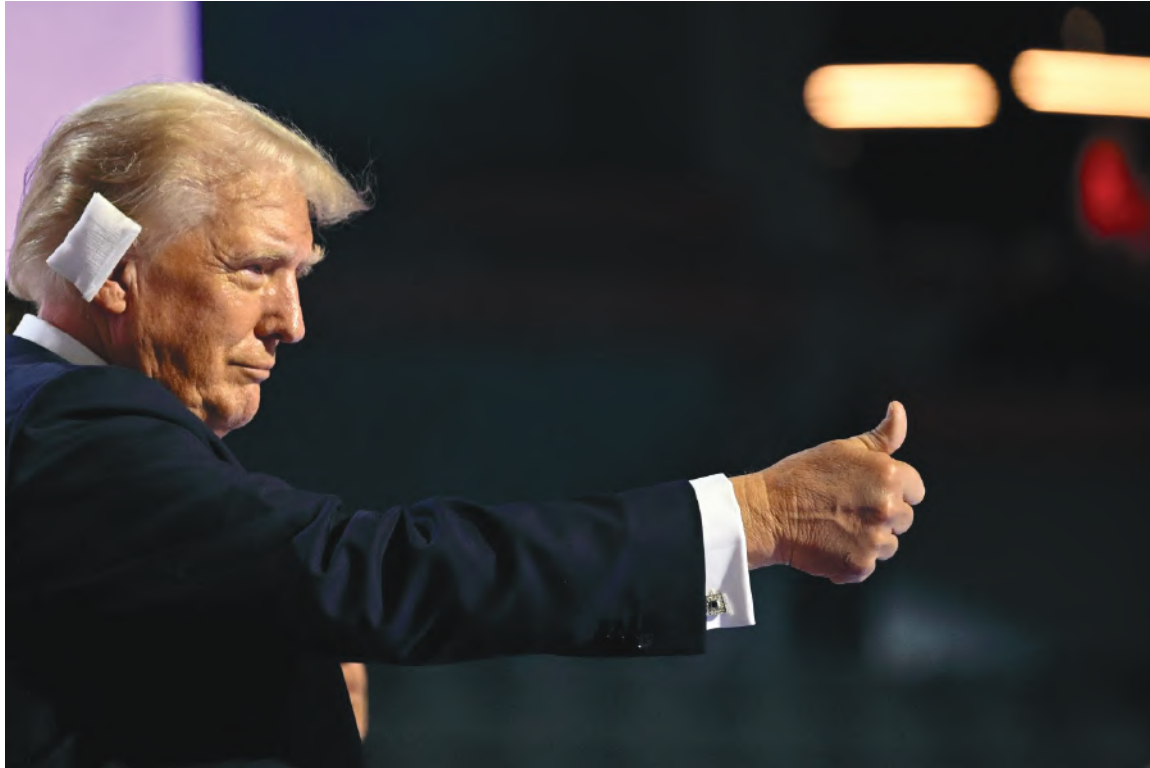
Former US President Donald Trump.