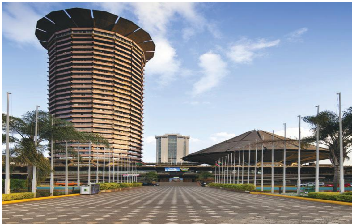
Kenyatta International Convention Centre

The post will also provide Kenya with access to valuable industry data, research, and insights, enabling it to make strategic decisions and increase global visibility.