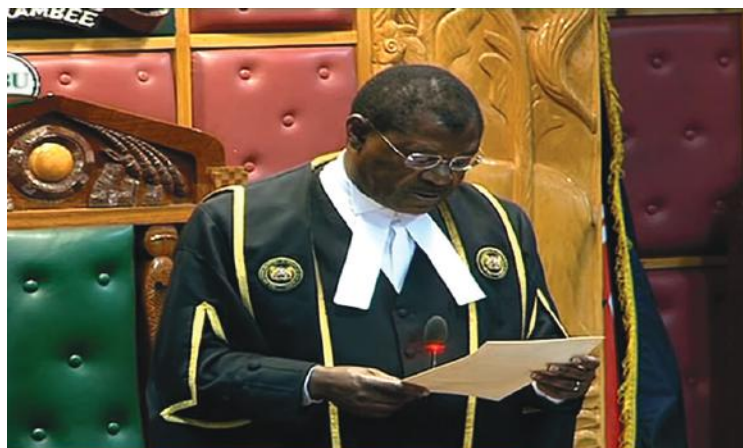
National Assembly Moses Wetang'ula

The Committee is now expected to notify the nominees and the general public of a date from when it shall commence the necessary approval hearings before tabling its report for consideration by the House.