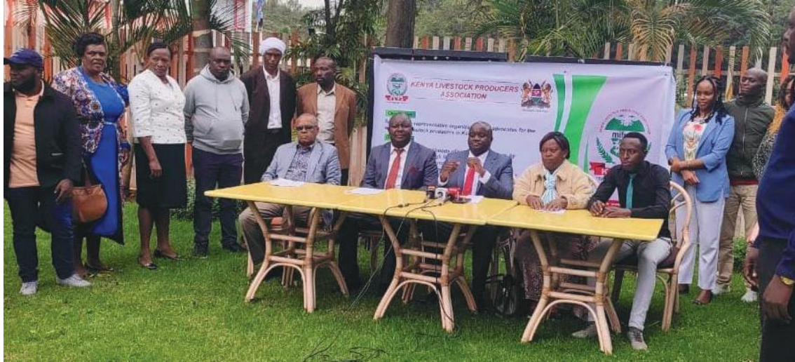
In picture, Members of the Kenya Livestock Association, addressing the media in a joint statement in Nairobi.