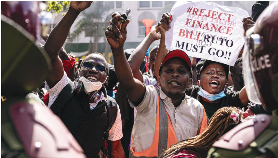
Kenyan Gen Z