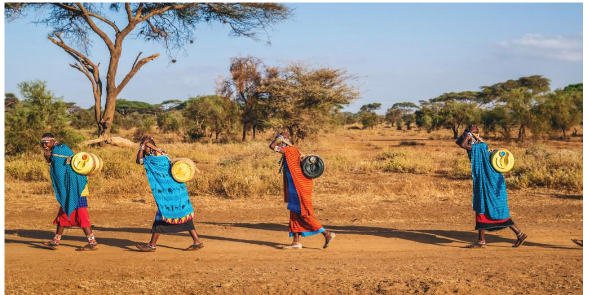
Women's Voices To Mitigate Climate Impacts.

funding and Support of women initiatives to mitigate and adapt climate change impacts especially locally led solutions. Direct resources towards women-led climate initiatives, acknowledging their unique needs, challenges and their contributions to climate solutions.