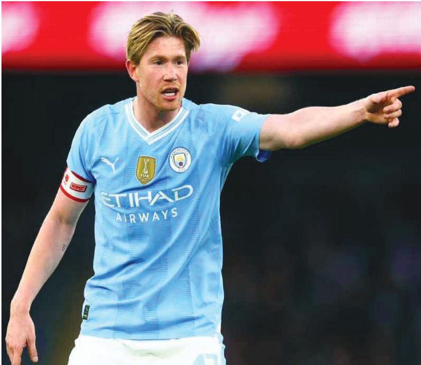
Kevin de Bruyne in action for Manchester City on his return from injury.

Manchester City manager Pep Guardiola has said influential midfielder Kevin de Bruyne will stay at the club.