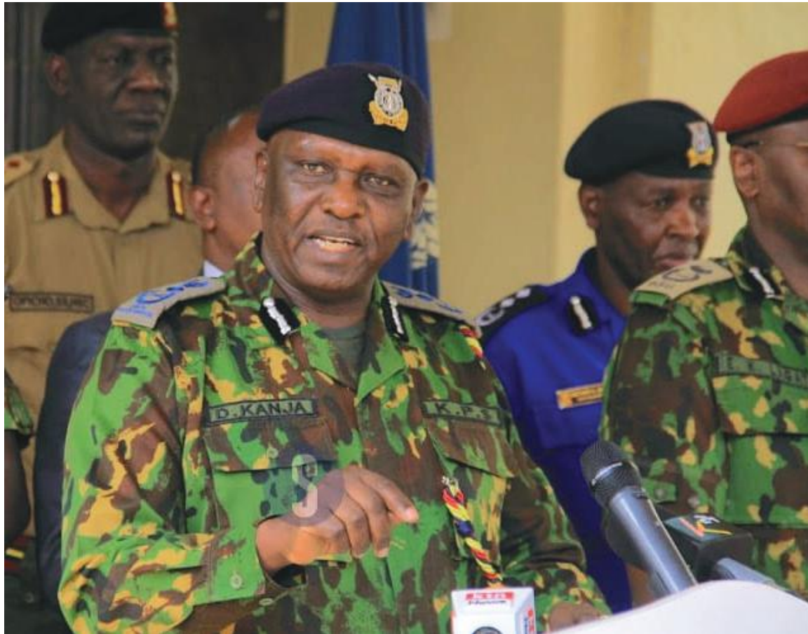
Acting Inspector General Douglas Kanja addresses the media outside Jogoo House on July 23, 2024.

In the recent weeks, Kenya has witnessed a surge in Generation-Z protests, which have become a focal point for national debate. Acting Inspector General of Police, Douglas Kanja has labelled these protests as a haven for goons.