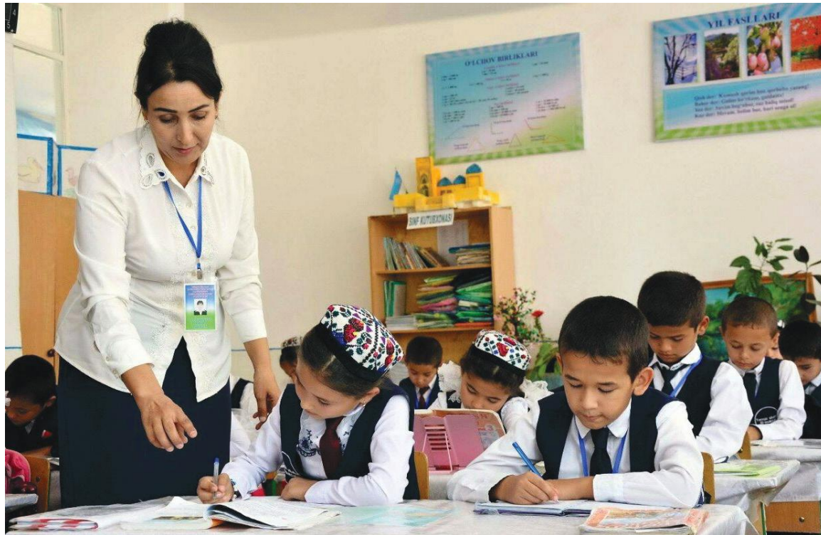
Primary Class Teachers in Uzbek