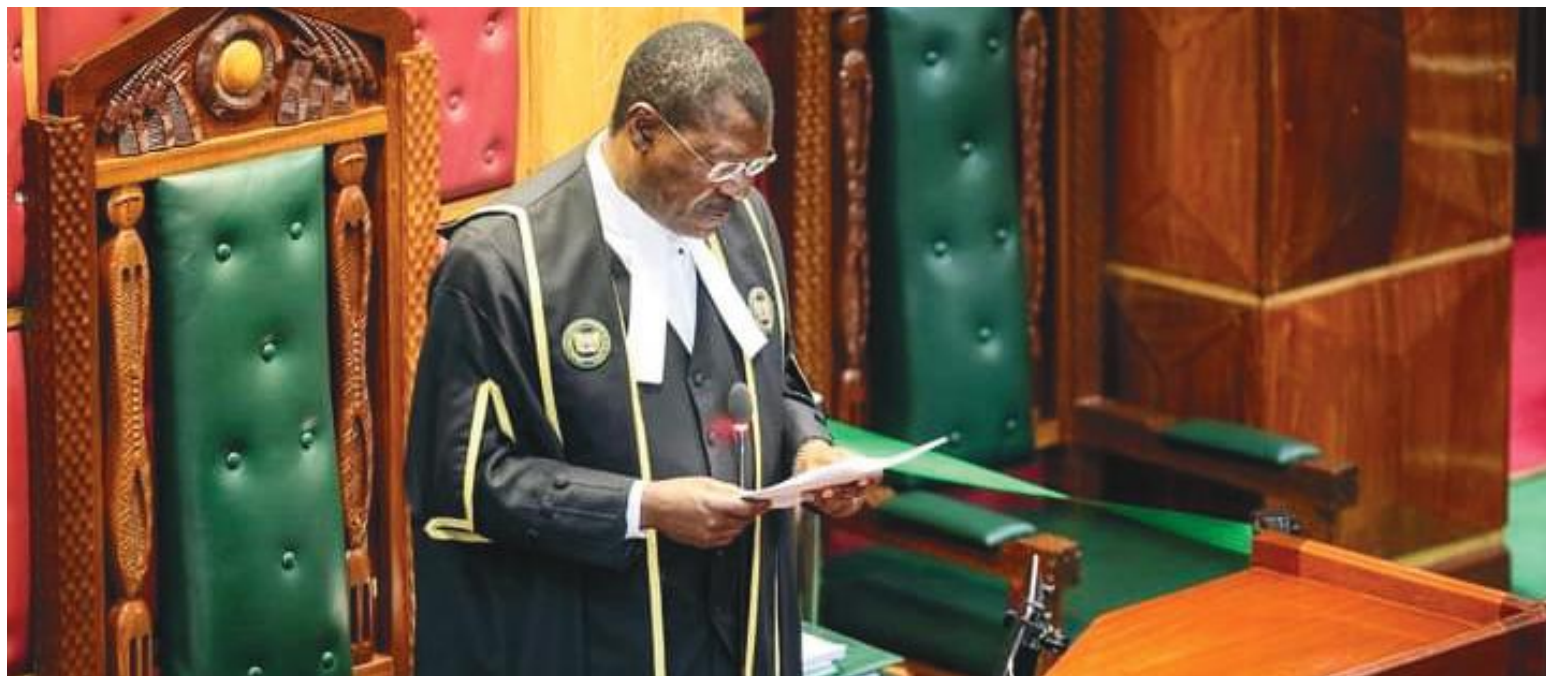
National Assembly Speaker Moses Wetang'ula

“The Chairperson of the Budget and Appropriations Committee, Hon. Ndindi Nyoro is expected to introduce a Bill to effect necessary amendments to the Division of Revenue Act, 2024,” added Speaker Weta’ngula.