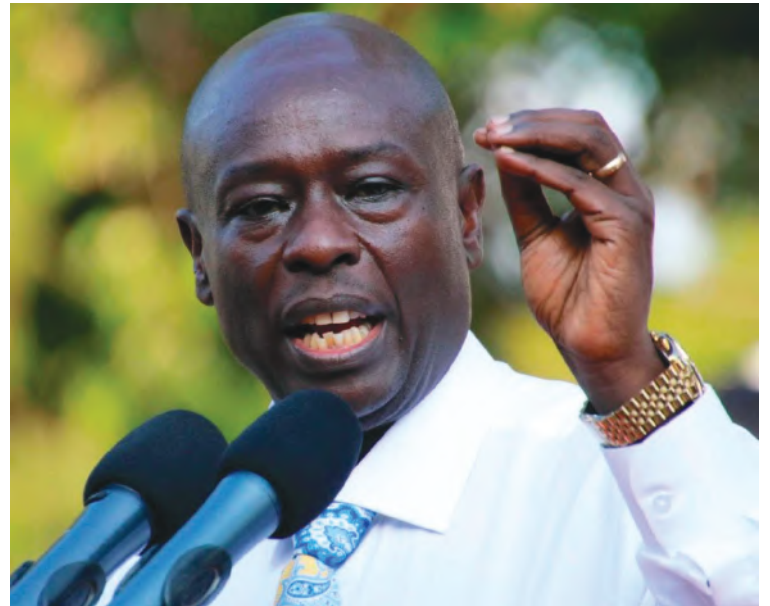
Deputy President Rigathi Gachagua.

As we know, the people of Mount Kenya region voted for President Ruto to the last man and woman during 2022 polls. He garnered 87 percent and these are the votes that catapulted him to the