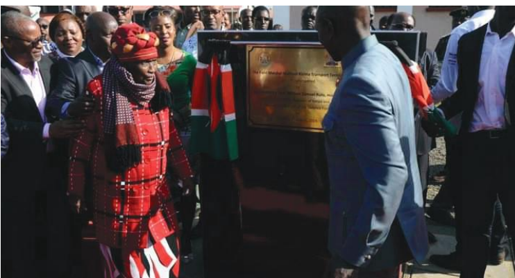
President William Ruto while officially opening the Field Marshall Muthoni Kirima Terminus last year.

"After wide consultations with the majority of stakeholders, it was found that the best method of allocation of these trading spaces is through open balloting which is fair and transparent. This is therefore to notify all traders who applied for the trading spaces that balloting will be conducted on Wednesday 21, July 2024 at Nyeri, Kamukunji grounds along temple road from 8.00 am to 5pm," reads part of the notice by the Department of Trade, Co-operatives,