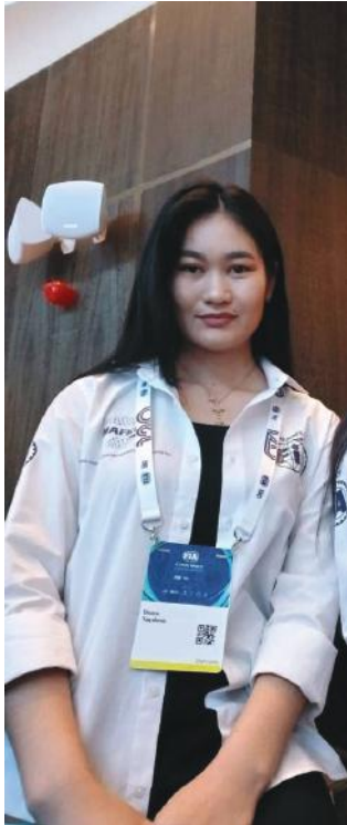
By: Yakubova Dinara @themtkenyatimes