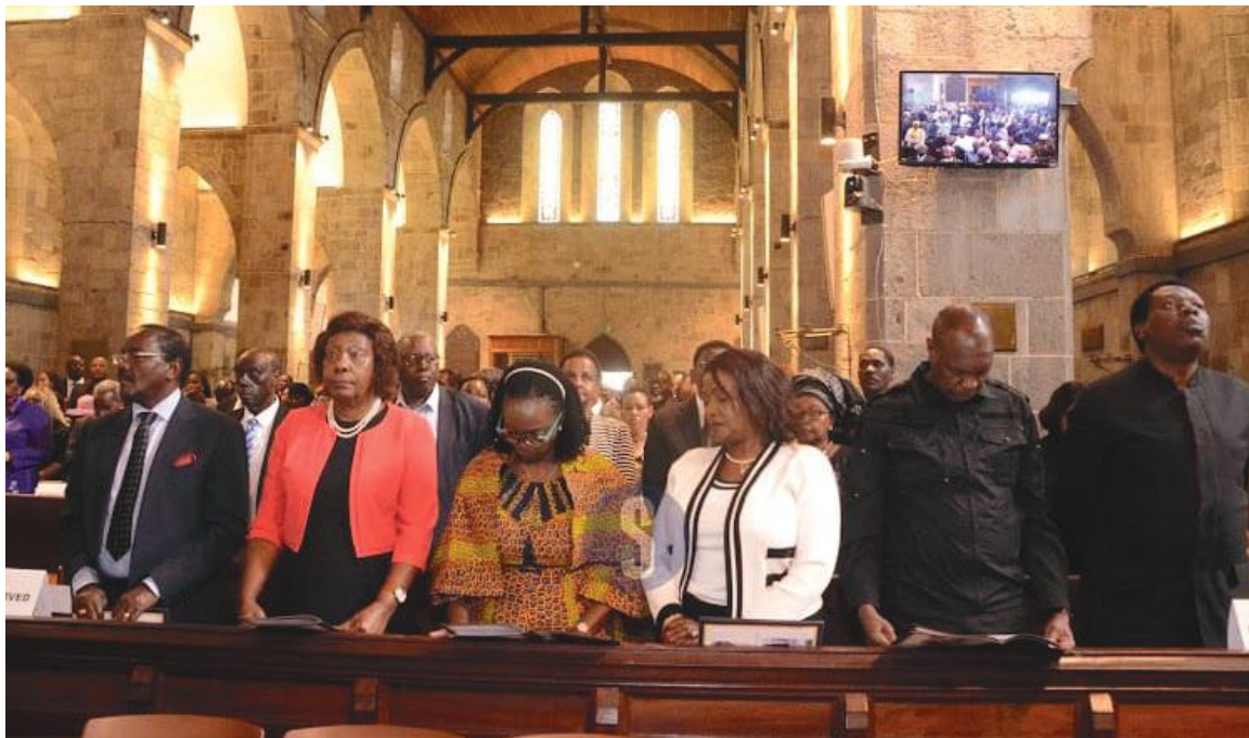
Wiper leader Kalonzo Musyoka, former Kitui Governor Charity Ngilu, Narc Kenya leader Martha Karua, Machakos Governor Wavinya Ndeti, Jubilee Secretary General Jeremiah Kioni and former Defence CS Eugene Wamalwa at the memorial service of former politician James Maina Wanjigi at the All Saints Cathedral, Nairobi on July 3, 2024.