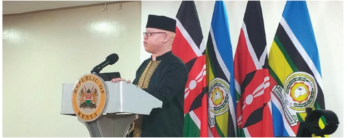
Government Spokesperson Isaac Mwaura addressing journalists in Nairobi.

The Hustler Fund, launched in 2022, was another major initiative lauded by Mwaura, providing crucial financial support and fostering entrepreneurship.