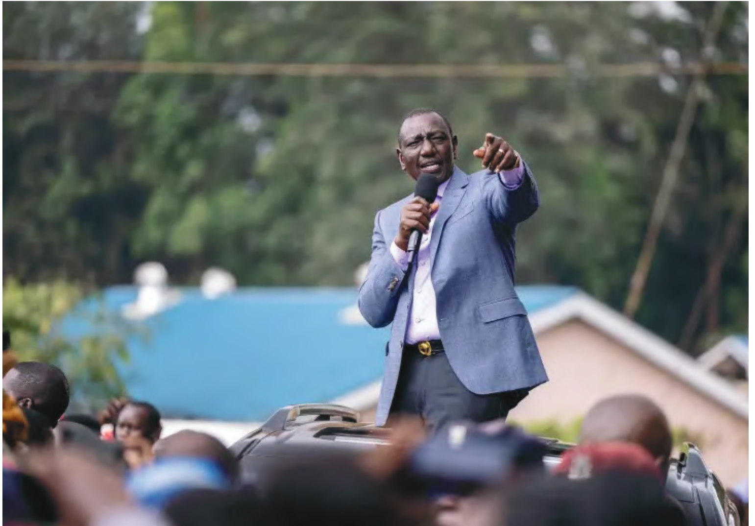
President William Ruto.

President William Ruto was in China when the fire that gutted a dormitory at Endarasha School Academy snuffed out life of 21 learners.