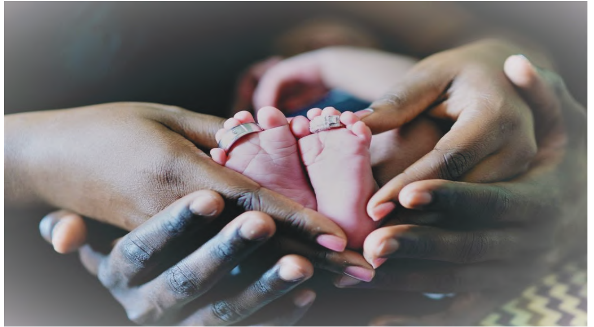
Surrogacy In Kenya.