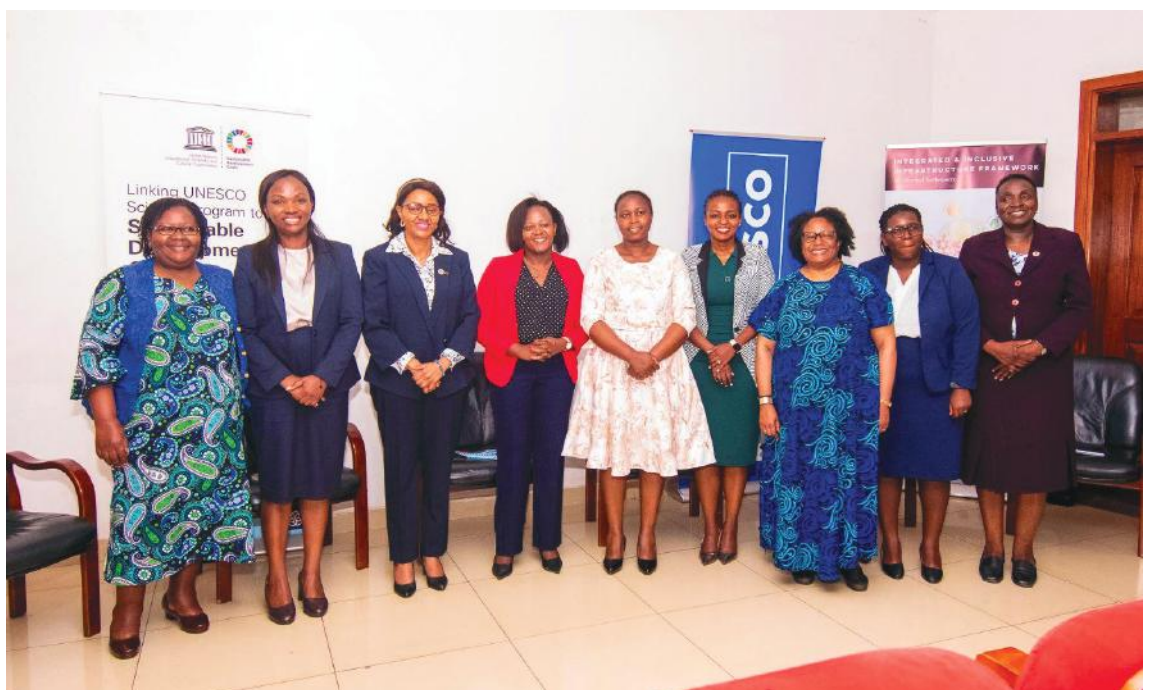
Cross-section of Women in Tech the who attended the 10th Annual UNESCO Africa Engineering Week in Nairobi- Kenya