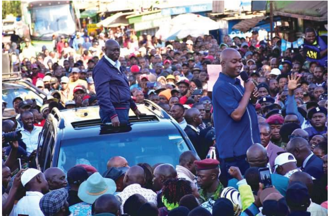
Embakasi Central MP Benjamin Gathiru Meja Donk addressing Nyeri town residents as Deputy President Rigathi Gachagua listens.

Attempts to undermine or sabotage him will not succeed. We support him in national unity and pushing for