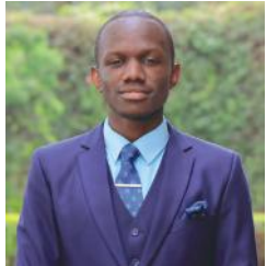
By: Odhiambo Jerameel Kevins Owuor @themtkenyatimes