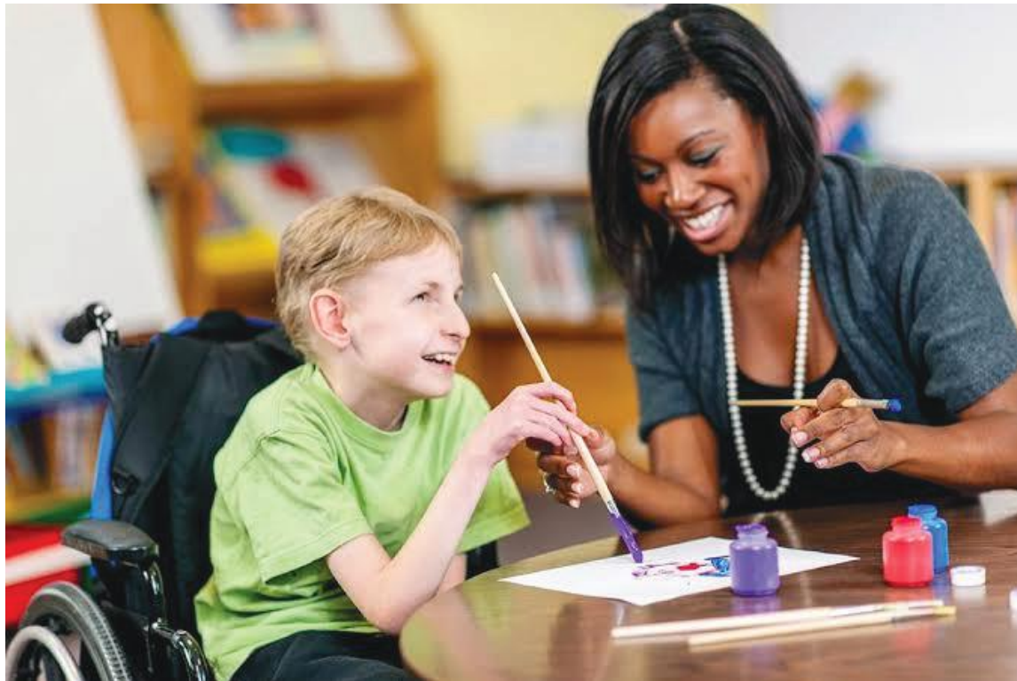
Education Of Special Needs Children.

A kid is a one-of-a-kind individual with their own personalities, quirks, and qualities. As a result of this natural variety, the mental capacities of all infants, even sets of identical twins, are distinct. Every youngster has their own special identity. It is not always the case that the individual traits of children are proportionate to one another. Every youngster is born with the intrinsic capacity to learn new things and grow in their own special manner. Some children are born inherently intelligent and responsive to learning, while others can need more time to fully comprehend new information. It is for this reason that it is not a good idea to treat all children in the same manner. Children who are inclined to succeed in one area but suffer in another, as well as those who have other issues in their development, are both included in the group of children who are considered to have special needs. This category is a wide one.