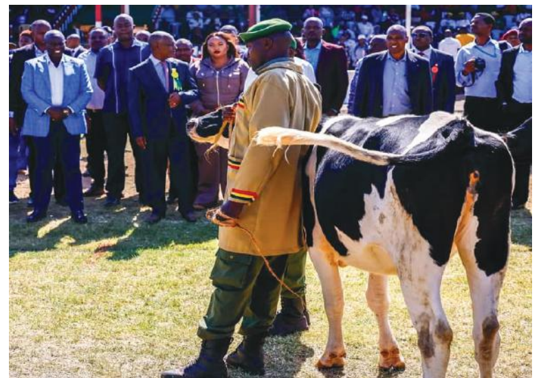
Deputy President Rigathi Gachagua with other officials admiring one of the dairy cattle at the Kabiru-ini show ground on Friday.

On dairy farming, the Deputy President said the Ruto administration is reforming the sub-sector and is implementing the minimum pay per litre at Ksh50, alongside prompt payment.