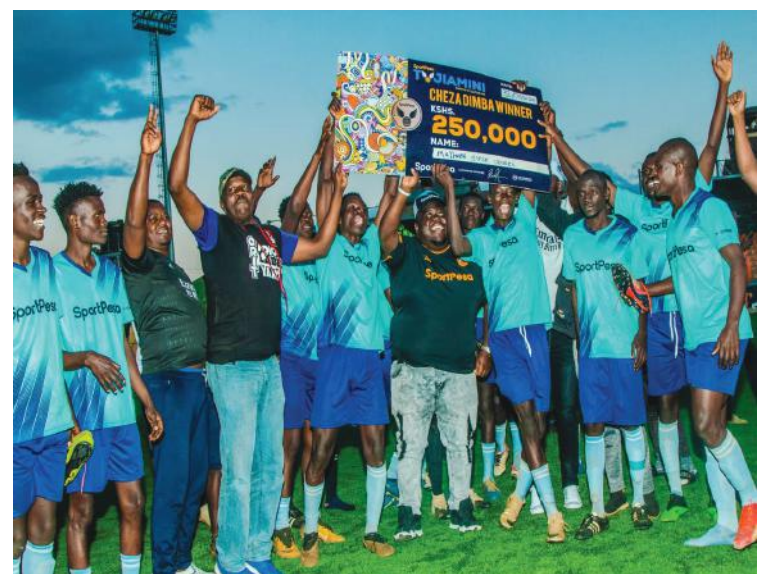
Mathare North United celebrating after winning the Nairobi Region Tujiamini Cheza Dimba Tournament.

The Tujiamini initiative by SportPesa now heads to Nyanza region as it nears the culmination in three months time.