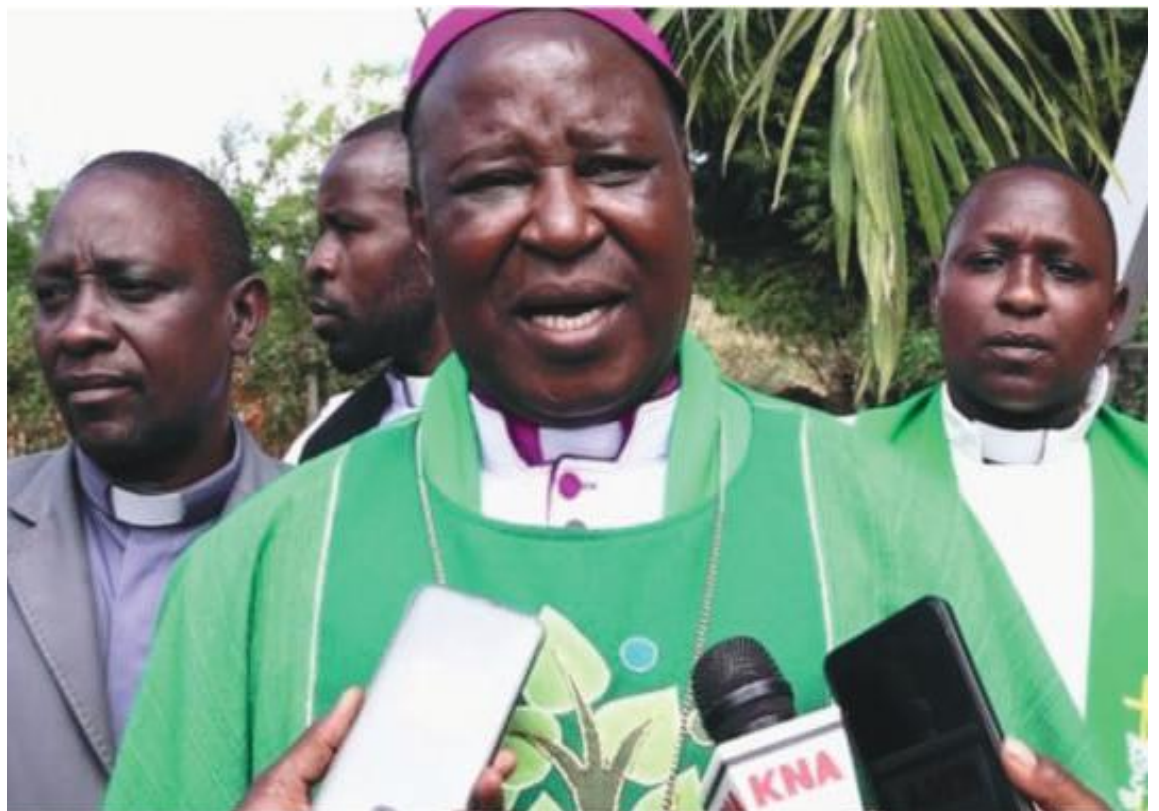
Bishop Moses Masamba addressing the media.

The teachers have been on strike since Monday last week agitating among other things, promotion of teachers who have stagnated, delay in employment of 20, 000 new teachers and conversion of 46, 000 JSS and primary teachers to permanent and pensionable terms.