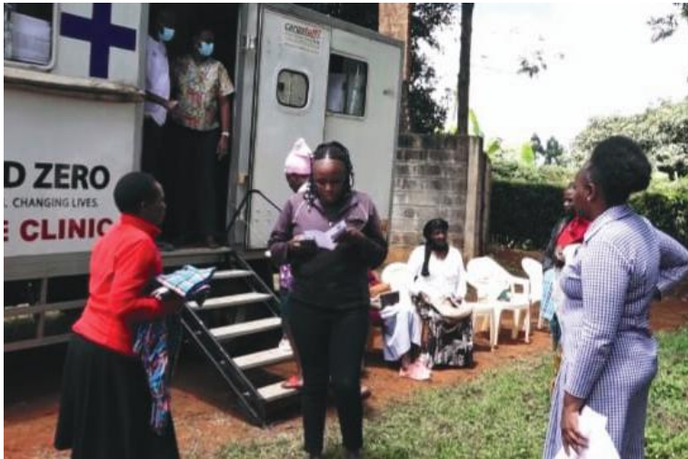
Beyond Zero officials.