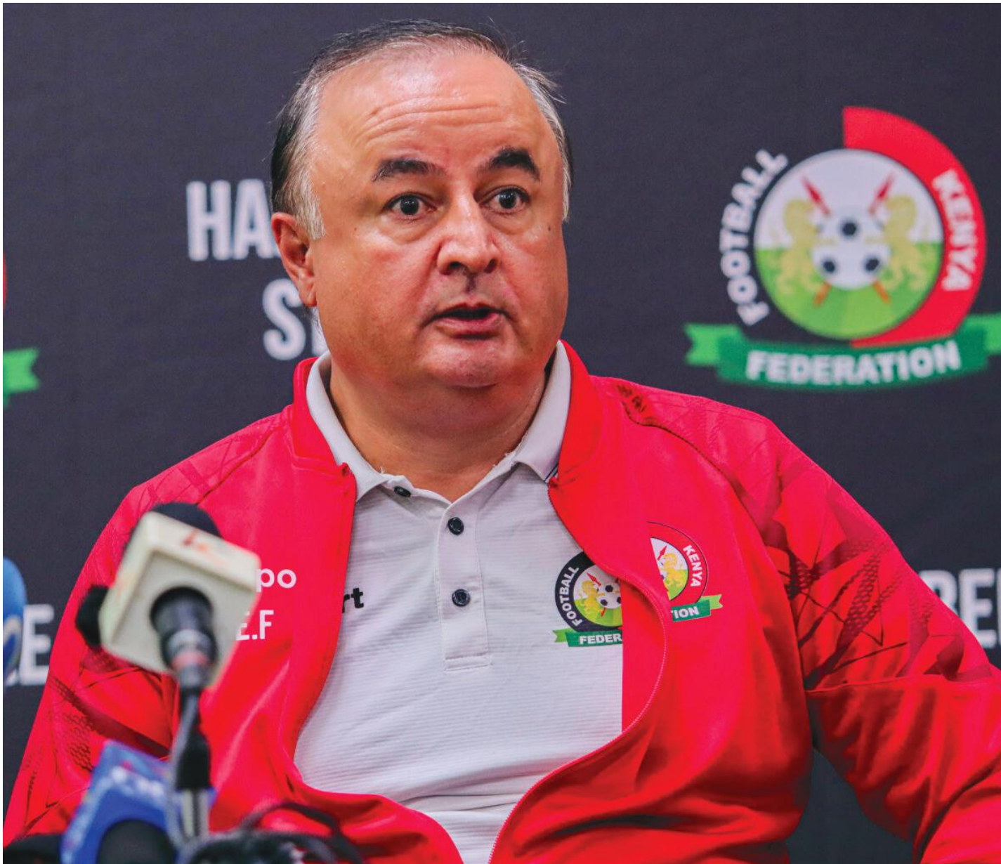
Harambee Stars head coach Engin Firat.

Harambee Stars coach Engin Firat believes the national team is more than capable of qualifying for next year's Africa Cup of Nations in Morocco.