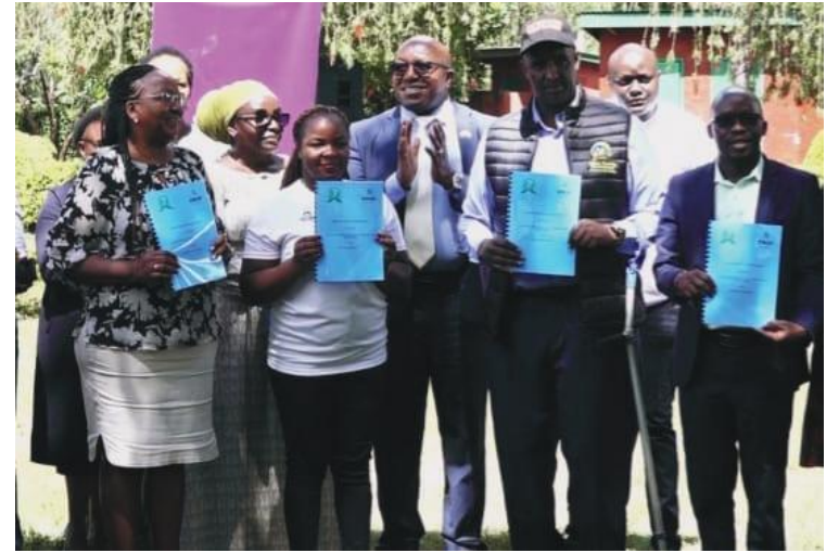
Embu County and Beyond Zero Foundation officials display partnership documents after signing an MOU in the fight against cervical and breast cancer

Embu County Government has entered into a three-year partnership programme with Beyond Zero Foundation in the fight against cervical and breast cancer.