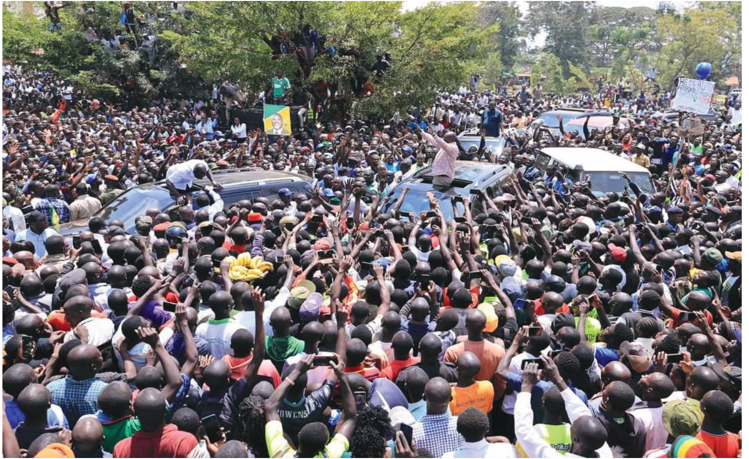
Deputy President Rigathi Gachagua in Nyanza