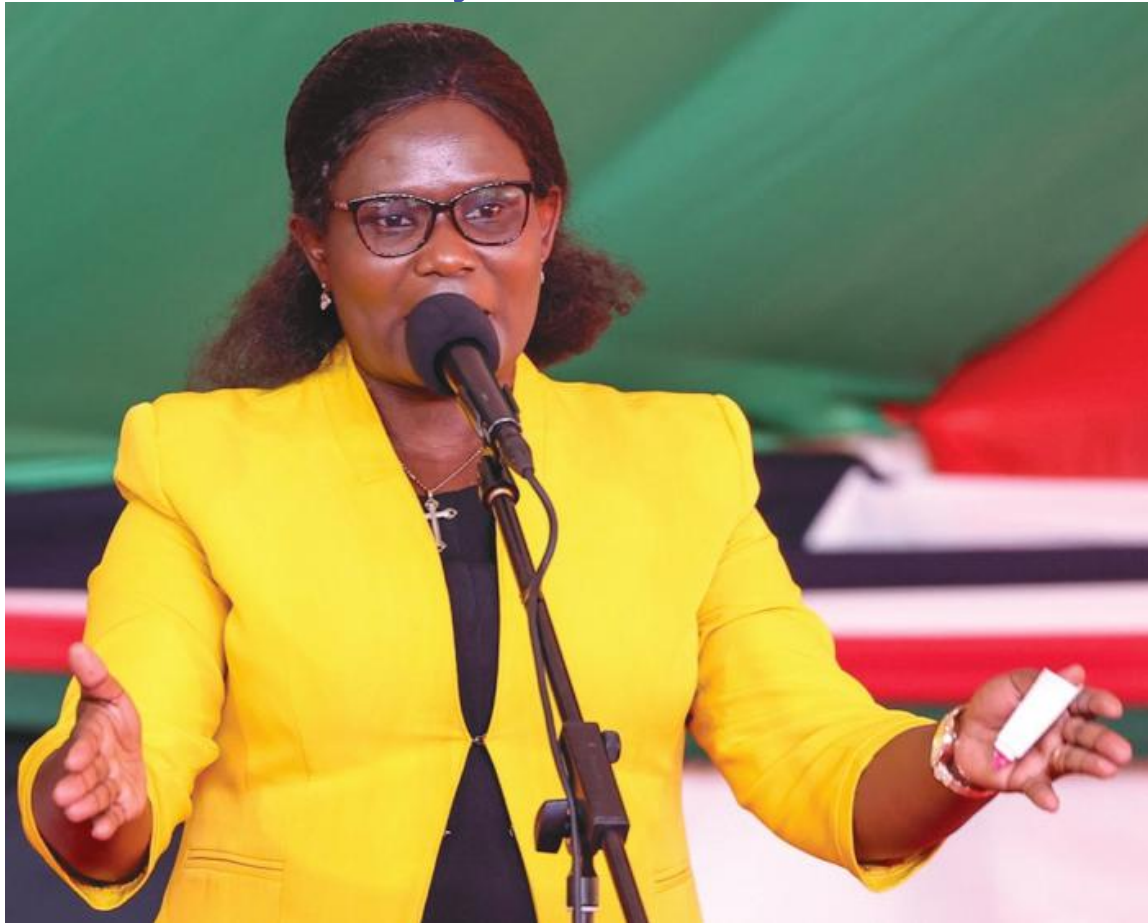
Governor Kawira Mwangaza