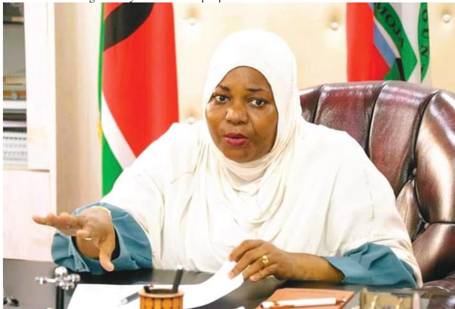
Kwale County has shifted focus from building new health facilities to revitalizing and upgrading existing ones. Governor Fatuma Achani stated that the devolved government will provide equipment, drugs, and personnel to existing health facilities to ensure they function optimally. Before devolution in 2013, Kwale had only 35 health centres, but now it has 162 spread across six subcounties: Matuga, Msambweni, Kinango, Samburu, Shimba Hills, and Lunga Lunga.