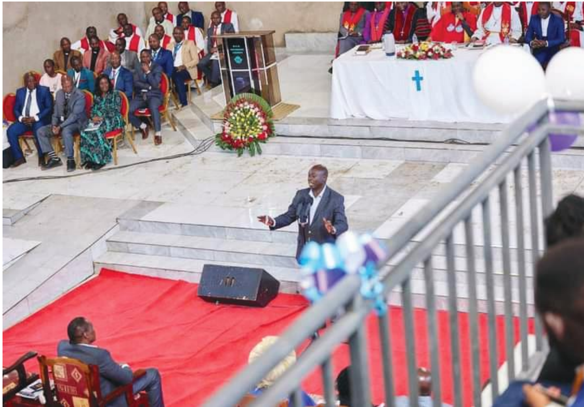
Deputy President Rigathi Gachagua addressing Methodist Church of Kenya faithful at Mikumbune in Meru..