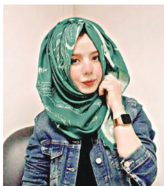
By: Tajalla Qureshi

All were fated to find her roads to glory All were picturized to pick her up with a story