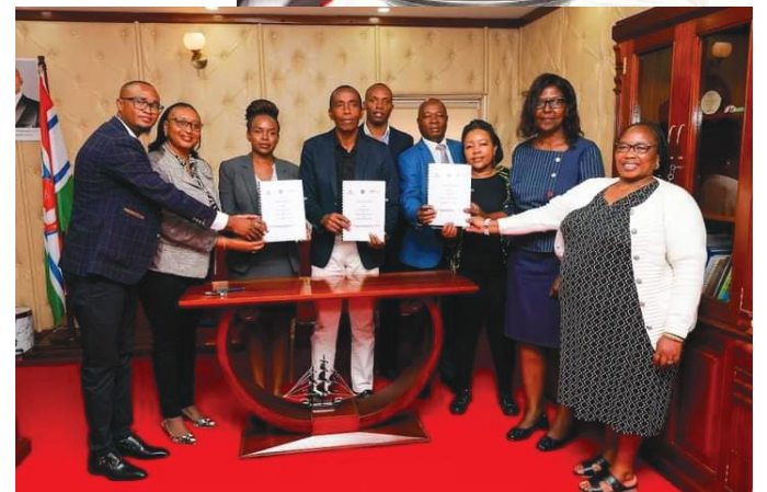
Kiambu County has partnered with the Nation Media Foundation and Kenya National Library Services (KNLS) to construct a state-of-the-art public library in the county. The project is part of the foundation’s initiative to establish public libraries in 14 counties lacking educational resources, aiming to enhance education and literacy across Kenya. The Nation Media Library Kiambu will be built in Ngewa Ward, Githunguri Sub-County, and is expected to take 24 weeks to complete. The library will serve as a prototype for the other 14 libraries planned for the region. The library aims to accommodate a minimum of 500 users daily. The Kiambu Governor, Kimani Wamatangi, announced that the county government had allocated land to support the project.