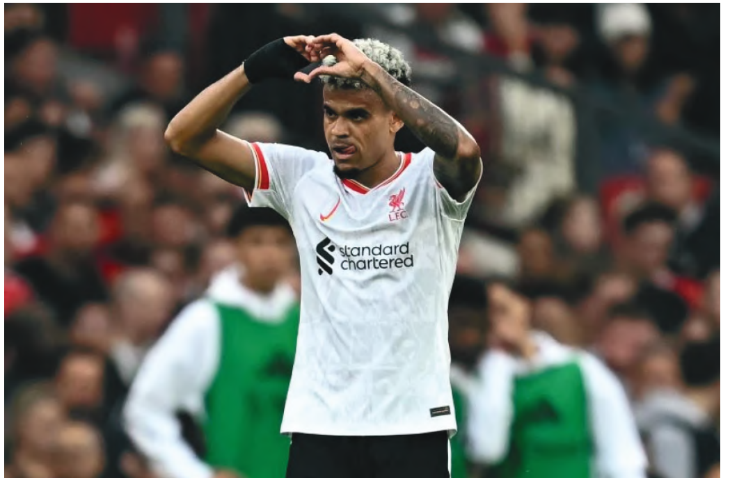
Liverpool's Colombian midfielder Luis Diaz celebrates scoring the opening goal of the English Premier League football match between Manchester United and Liverpool at Old Trafford in Manchester, north west England, on September 1, 2024. (Photo by Paul ELLIS / AFP).

While Slot soaks up his dream start, United boss Erik ten Hag is under pressure after a woeful display that came hot on the heels of their 2-1 defeat at Brigh-