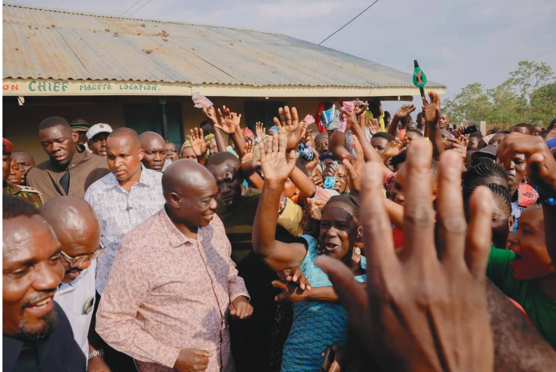
Deputy President Rigathi Gachagua in Nyanza

The wish of the critics of Deputy President Rigathi Gachagua particularly those drawn from the Mount Kenya region was to see him being heckled and humiliated in the just-concluded four-day tour of President William Ruto in Luo Nyanza.