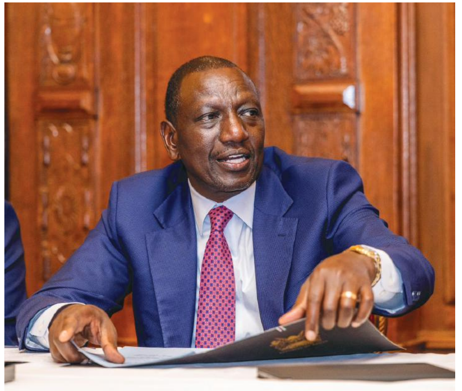
President William Ruto

President William Ruto has called on African leaders to present a united front at the upcoming United Nations Climate Change Conference (COP29) later this year in Baku, Azerbaijan. He emphasized that Africa's primary agenda at COP29 should be advocating for a new, equitable climate financing mechanism, one that reflects the urgency and scale of the climate crisis while addressing the specific needs of Africa and other developing regions.