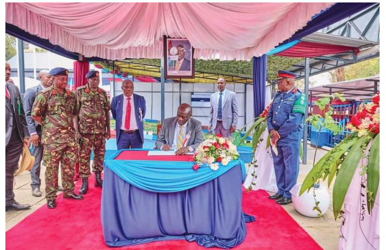
Deputy President Rigathi Gachagua signing a visitors book at the Kenya Defence Forces exhibition stand at Jamhuri Show grounds yesterday.