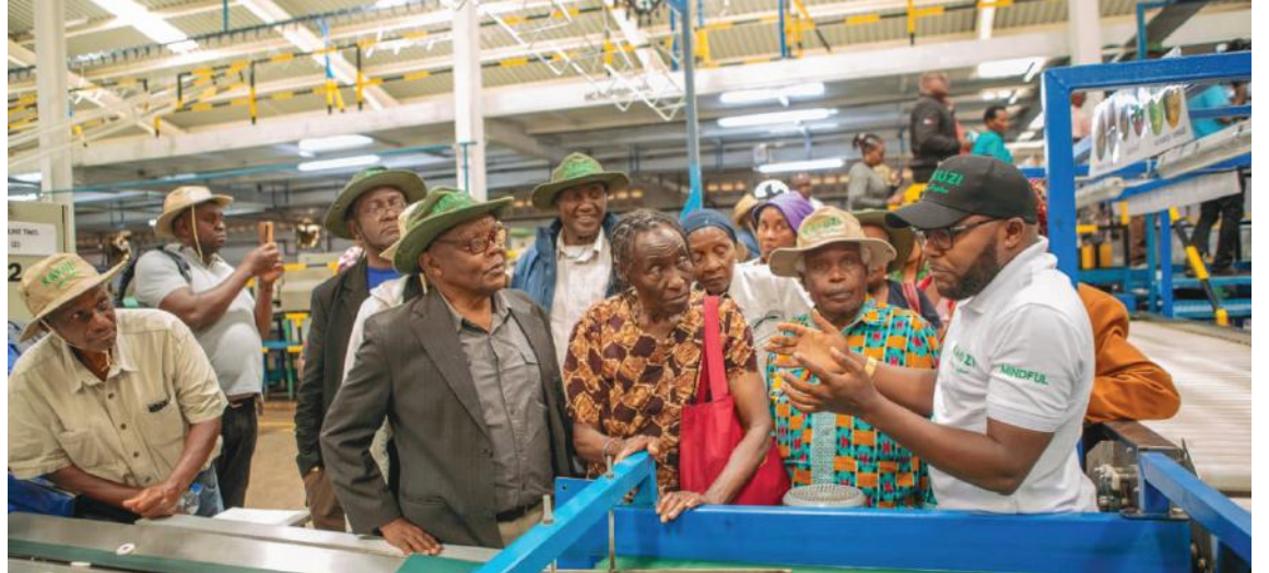
Kakuzi shareholders visit

On his part, Mr Flowers said: "Market diversification for Kakuzi is a key part of our strategy not only for export but also for the growing domestic and regional markets. Having the combination of avocado, macadamia, and hopefully, blueberries as export crops being sent to Europe, China, India, the