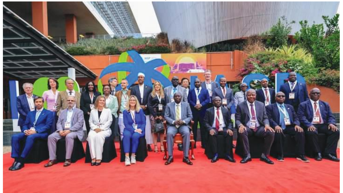
Group photo of the 41st International Association of Science Parks and Areas of Innovation World Conference in Nairobi.