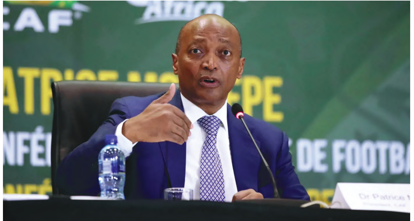
CAF President Dr. Patrice Motsepe

By: Louis Hobbs (SportsBoom) The Confederation of African Football (CAF) President Dr. Patrice Motsepe has allayed fears of Kenya losing the 2025 CHAN Championships hosting rights by giving the ongoing stadia renovation works a thumbs up.