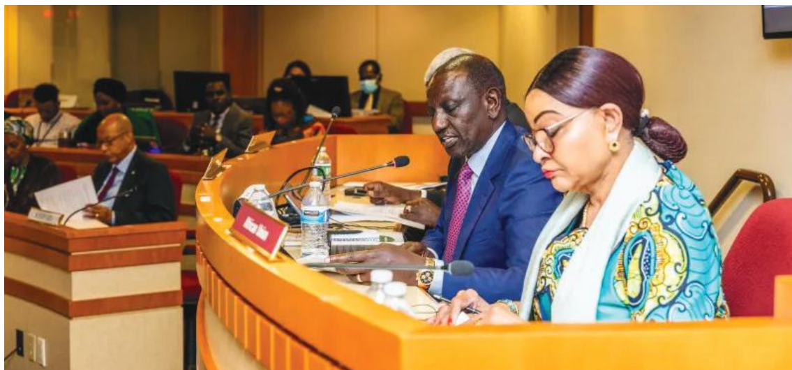
President William during an Extraordinary Meeting of the Committee of African Heads of State and Government on Climate Change (CAHOSCC) on the sidelines of the 79th Session of the United Nations General Assembly in New York.

grades have also made refinancing expensive, further constraining our financial options," he added.