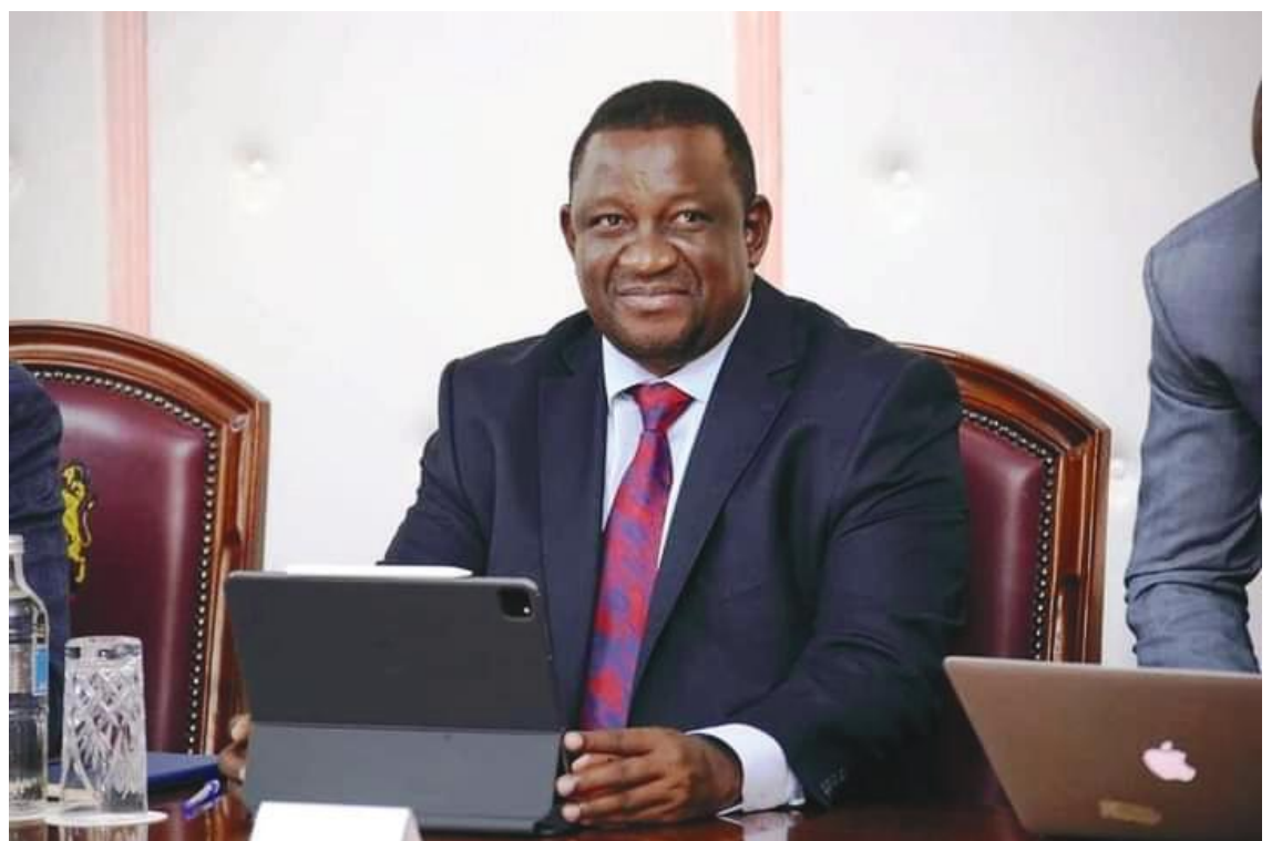
Salim Mvurya Cabinet Secretary for Investments, Trade, and Industry