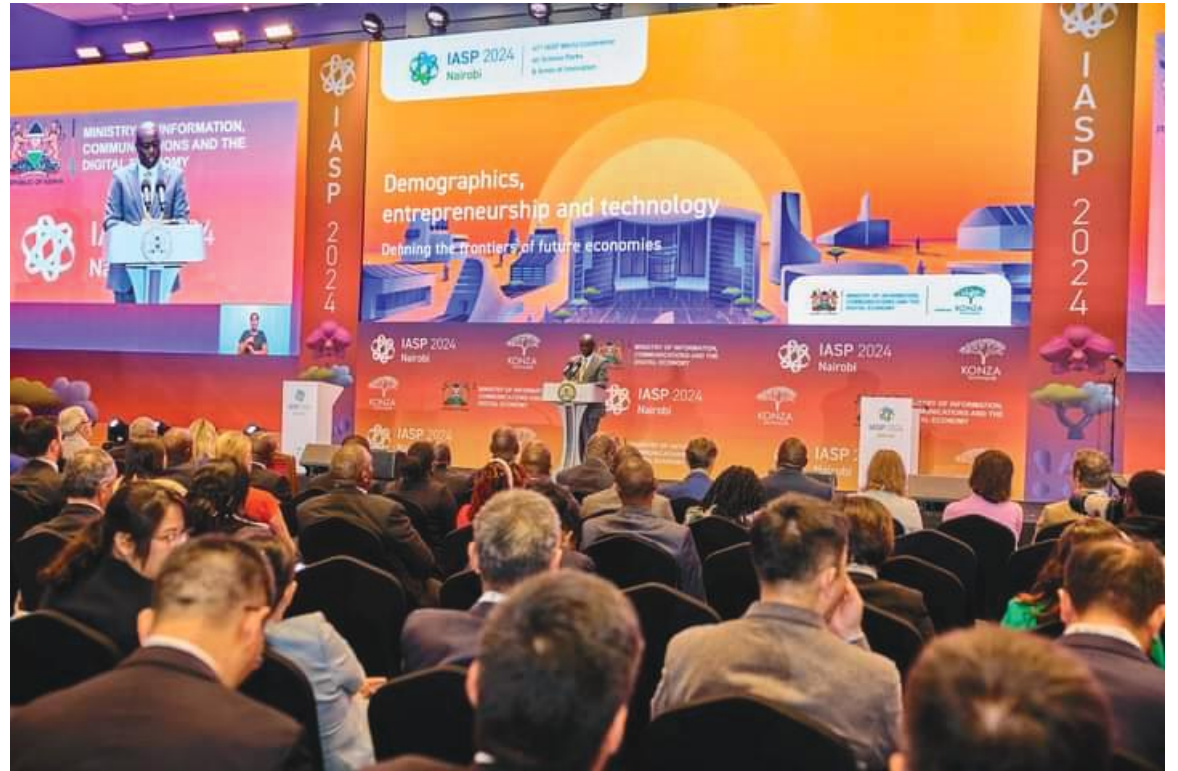
Deputy President Rigathi Gachagua during the opening of the 41st International Association of Science Parks and Areas of Innovation World Conference in Nairobi on behalf of President William Ruto

is focused on adopting and integrating ICT to power and drive sustainable socio-economic transformation.