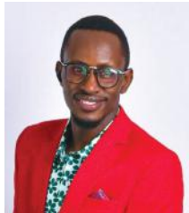
By: Wanjohi. P. Mugambi @themtkenyatimes

Actually, the existence of this delay proves that there are three levels between action and thought rather than two as some authorities' believed. First there is a sensorimotor level of direct action upon reality. After seven or eight there is the level of the operations, which concern transformations of reality by means of internalized actions that are grouped into coherent, reversible systems (joining and separating, etc.). Between these two, that is, between the ages of two or three and six or seven, there is another level, which is not merely transitional. Although it obviously represents an advance over direct action, in that actions are internalized by means of the semiotic function, it is also characterized by new and serious obstacles. What are these obstacles?