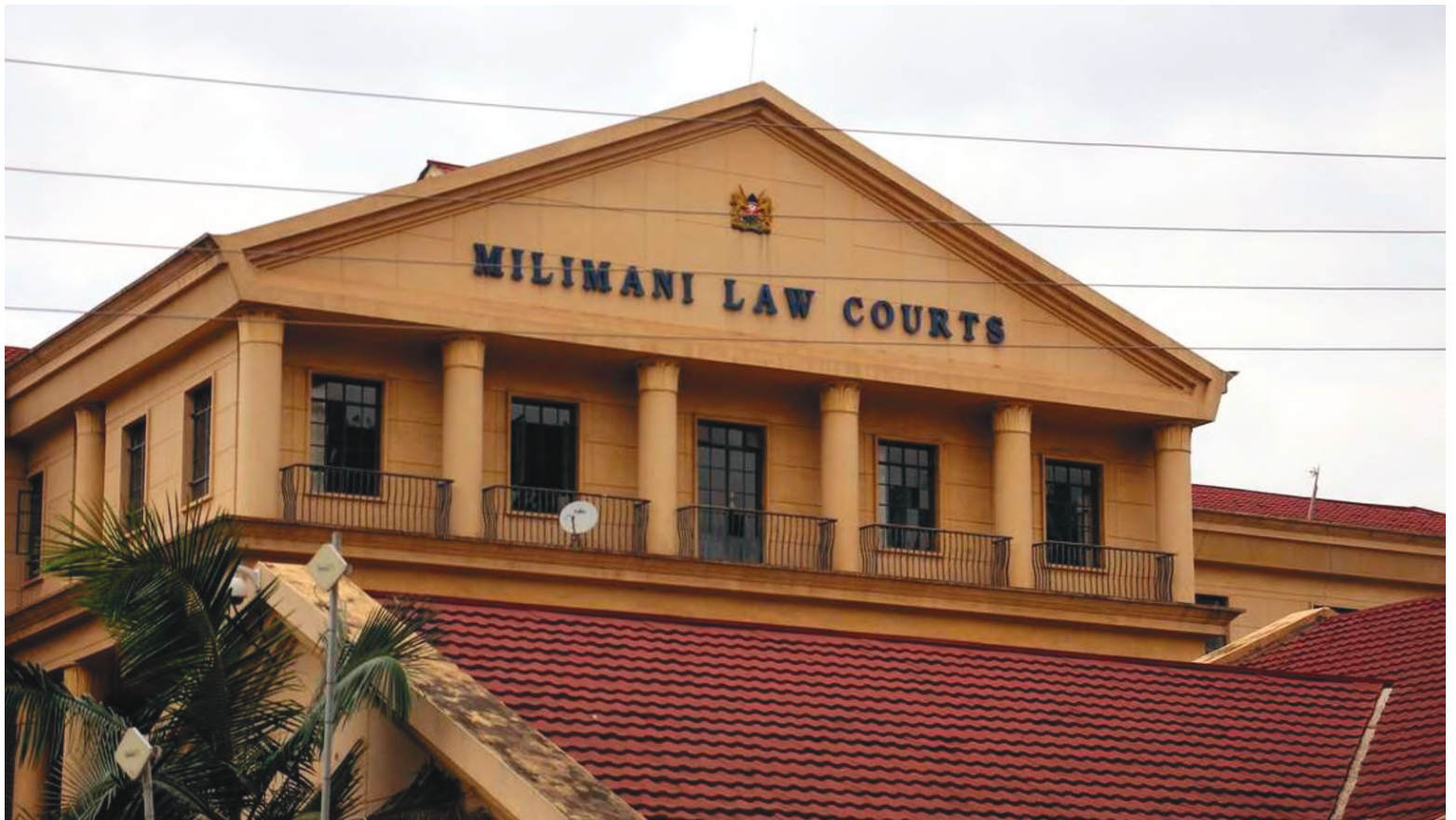
Environment And Land Court