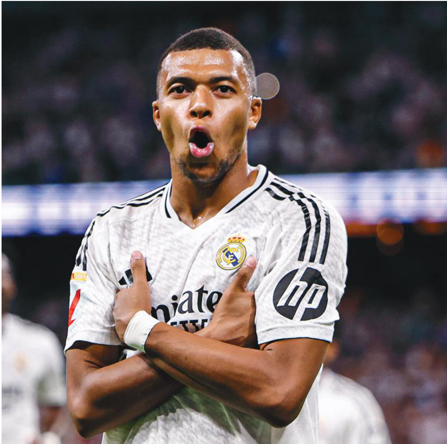
Kylian Mbappe celebrates his first Real Madrid goal.

Real Madrid forward Kylian Mbappe faces a spell on the sidelines because of a thigh injury. The France international, who joined the Spanish club in the summer after his contract with Paris St-Germain expired, scored in a 3-2 win against Deportivo Alaves on Tuesday before being substituted after 80 minutes.