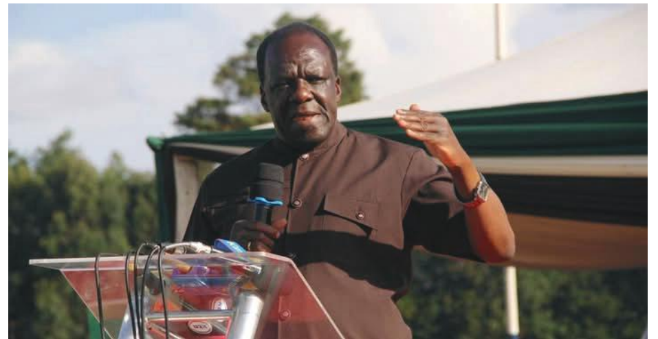
Coffee farmers in Uasin Gishu County have a reason to celebrate after the government announced a major support package aimed at revitalizing the sector. Speaking during a meeting with New Kenya Planters Cooperative Union (KPCU) members in Eldoret, the Cabinet Secretary for Cooperatives and Micro, Small and Medium Enterprises (MSMEs) Development Wycliffe Oparanya unveiled plans to distribute 200 thousand coffee seedlings this year and another 5 million in the next financial year. Oparanya further affirmed the government's commitment to support the sector in order to restore its glory in terms of increasing production from the current annual 50,000 metric tonnes to 150,000 metric tonnes by 2027. He noted that neighbouring countries like Uganda and Ethiopia have surpassed Kenya in coffee output, and the government is determined to reclaim the country's former glory in the global coffee market.