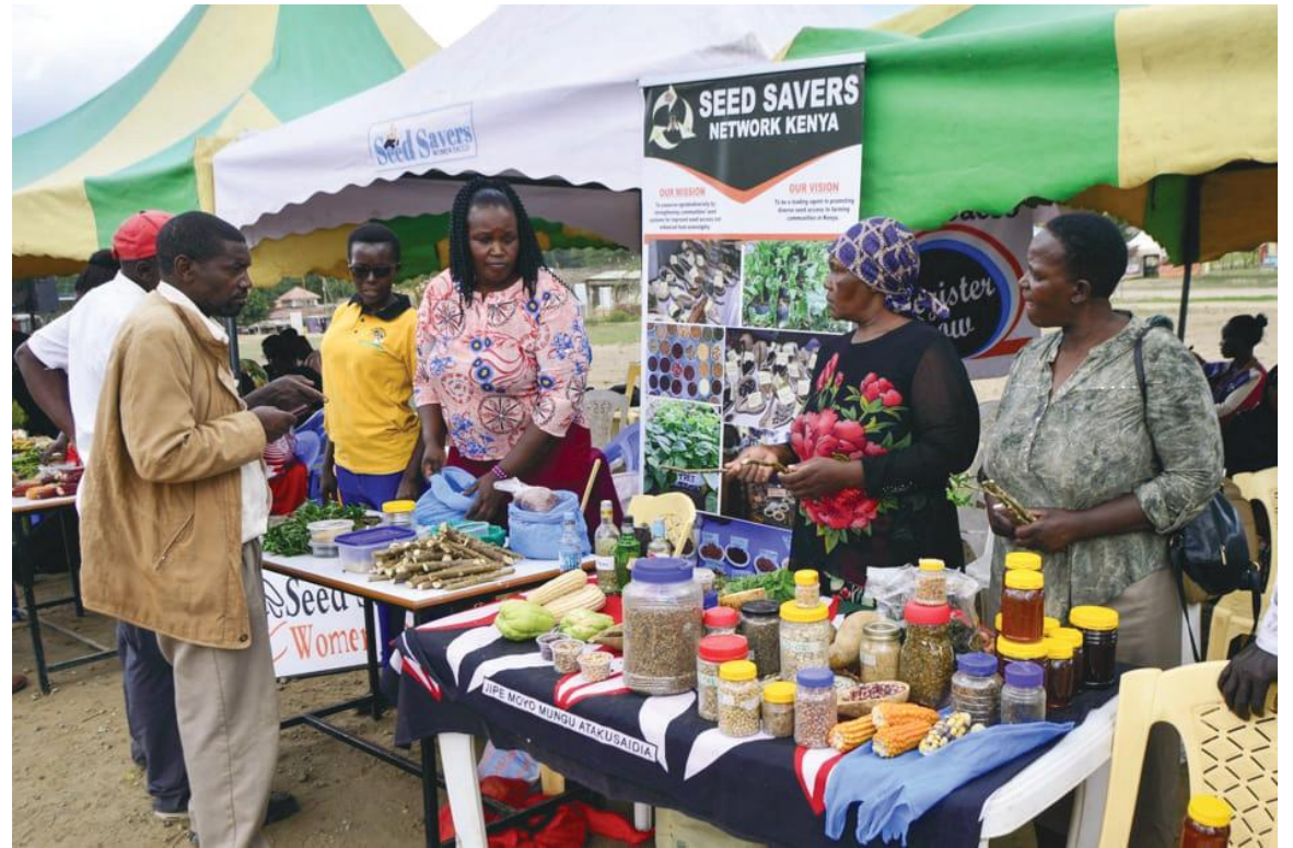
Farmers display indigenous seeds at a seed fair in Kikopey, Gilgil, Nakuru County. These traditional seeds are known for their resilience against pests and diseases.

A 2020 report by the Heinrich Böll Foundation revealed concerning lev-