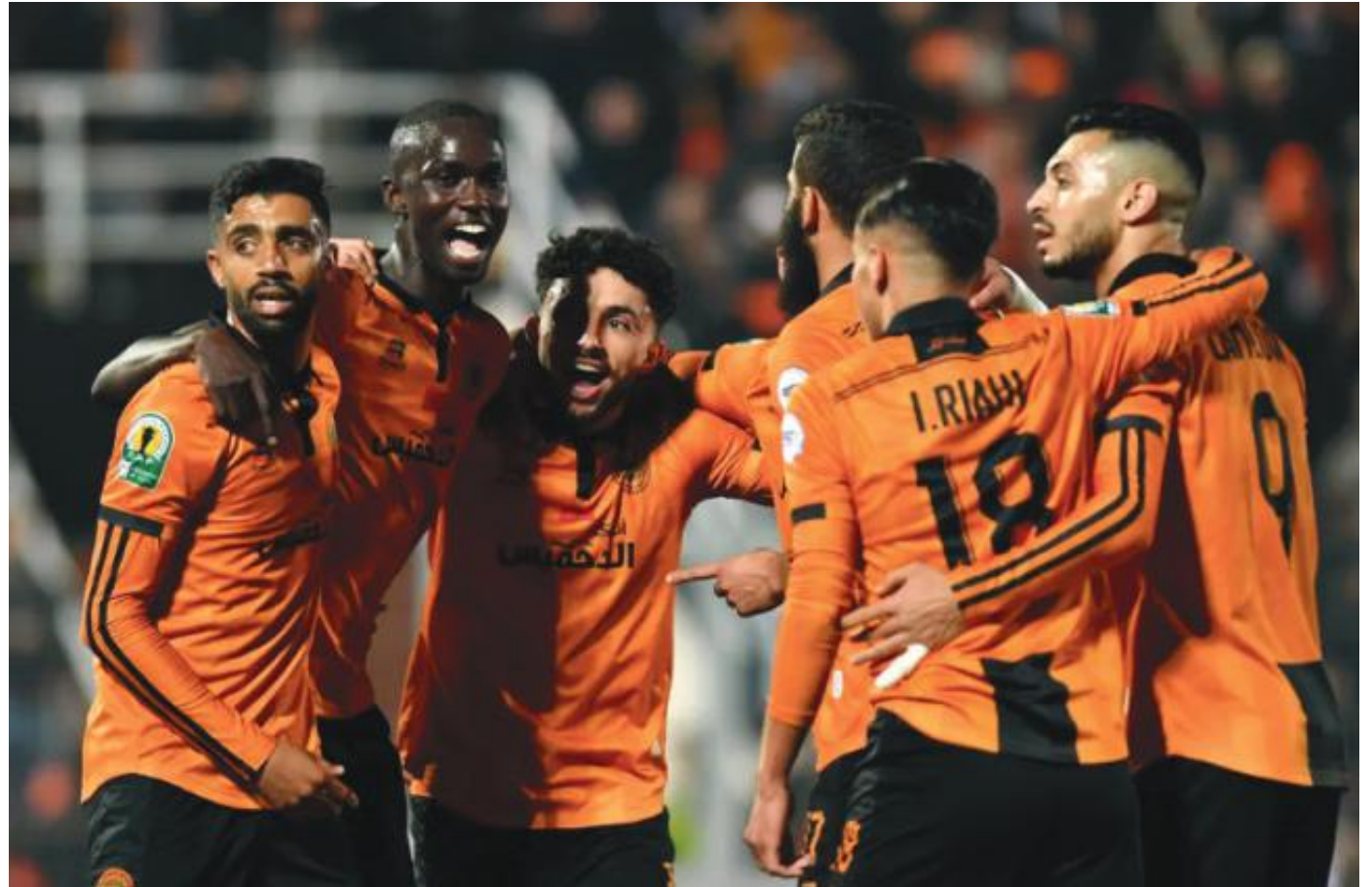
Moroccan heavyweights RS Berkane take on Tanzanian giants Simba SC

Renaissance Berkane of Morocco scored twice within the opening 14 minutes to beat Simba of Tanzania 2-0 on Saturday in the CAF Confederation Cup final first leg.