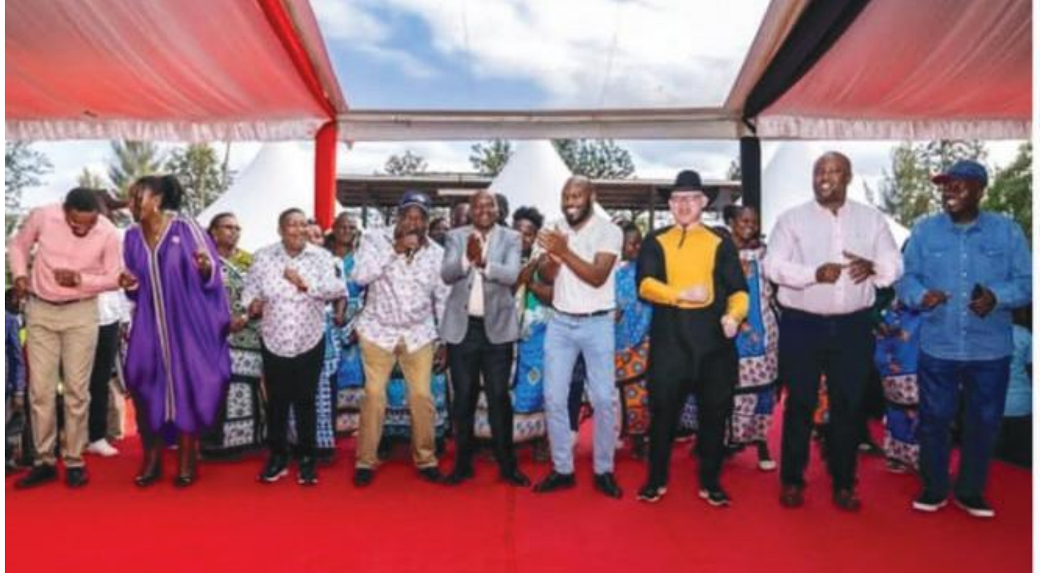
Deputy President Prof Kithure Kindiki with other leaders in Gatundu yesterday.