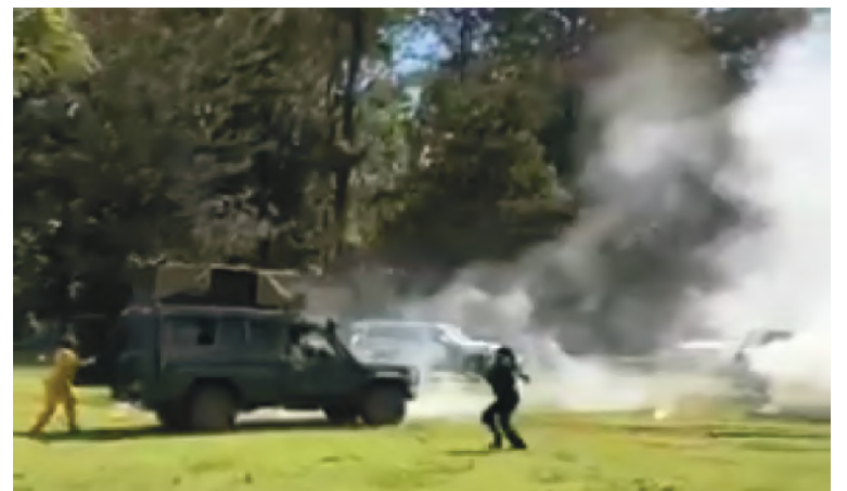
According to eyewitness accounts and statements from Mwangaza's allies, police officers fired multiple teargas canisters to disperse the crowd, bringing the event to a sudden and chaotic end. One canister was reportedly thrown into Mwangaza's vehicle while she and her husband were still inside.

"This is not the first time," her team said in the statement. "The pattern is