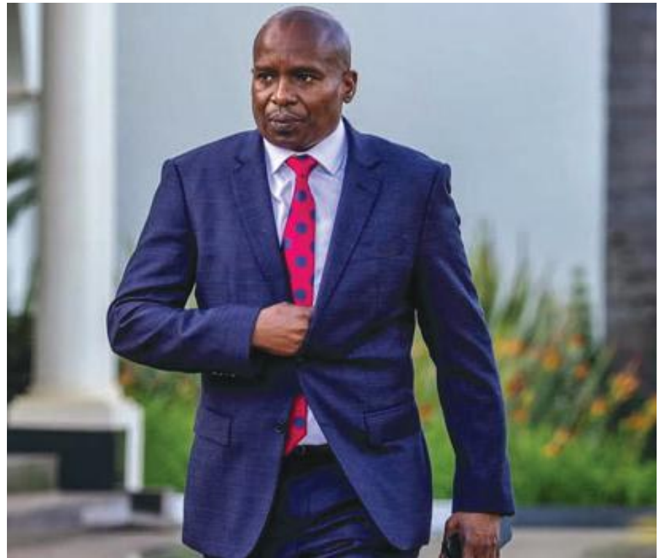
Deputy President Kithure Kindiki

The DP said Kenya will not be dragged into election-related chaos as happened in 2007, terming reckless and unpatriotic attempts to sell fear of similar happenings in the future.