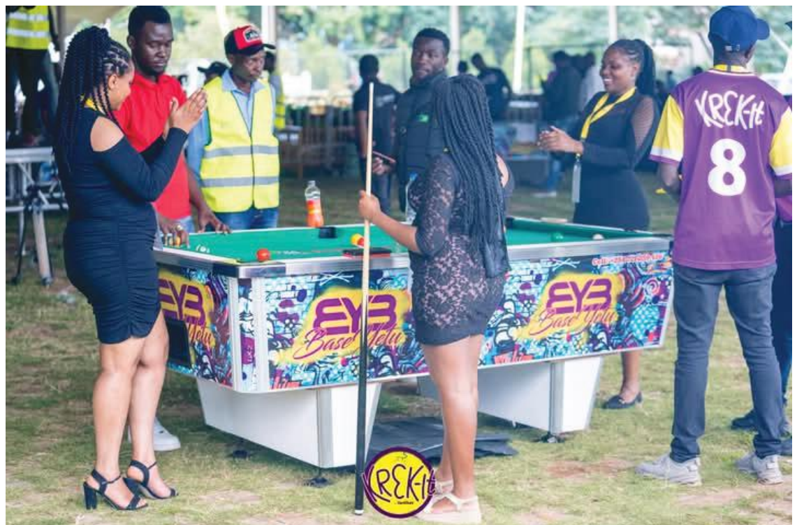
Some of the Pool Game players trying their luck.