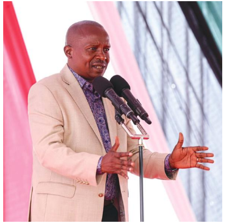
Deputy President Kithure Kindiki .