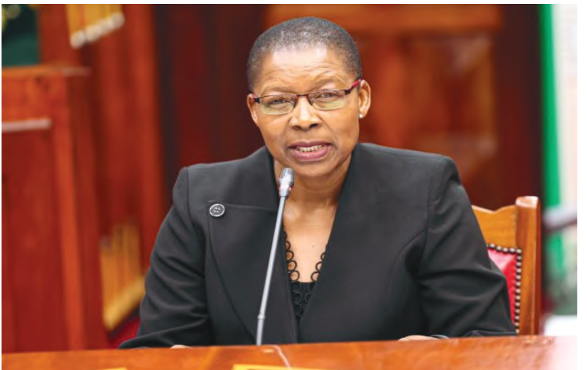
AG Dorcas Oduor/PBU

They claim there is an imminent risk that the National Assembly may proceed to vet and approve the nominees, despite the flawed nature of the nomination process.