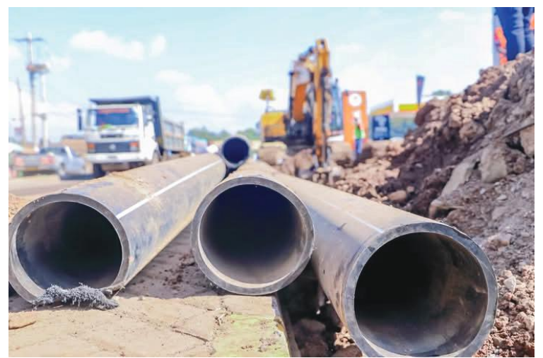
Part of the project.

He also appealed to the government to increase the supply from Karimenu Dam which stands at 40 percent to 100 percent to ensure there will never be water shortages in the area.