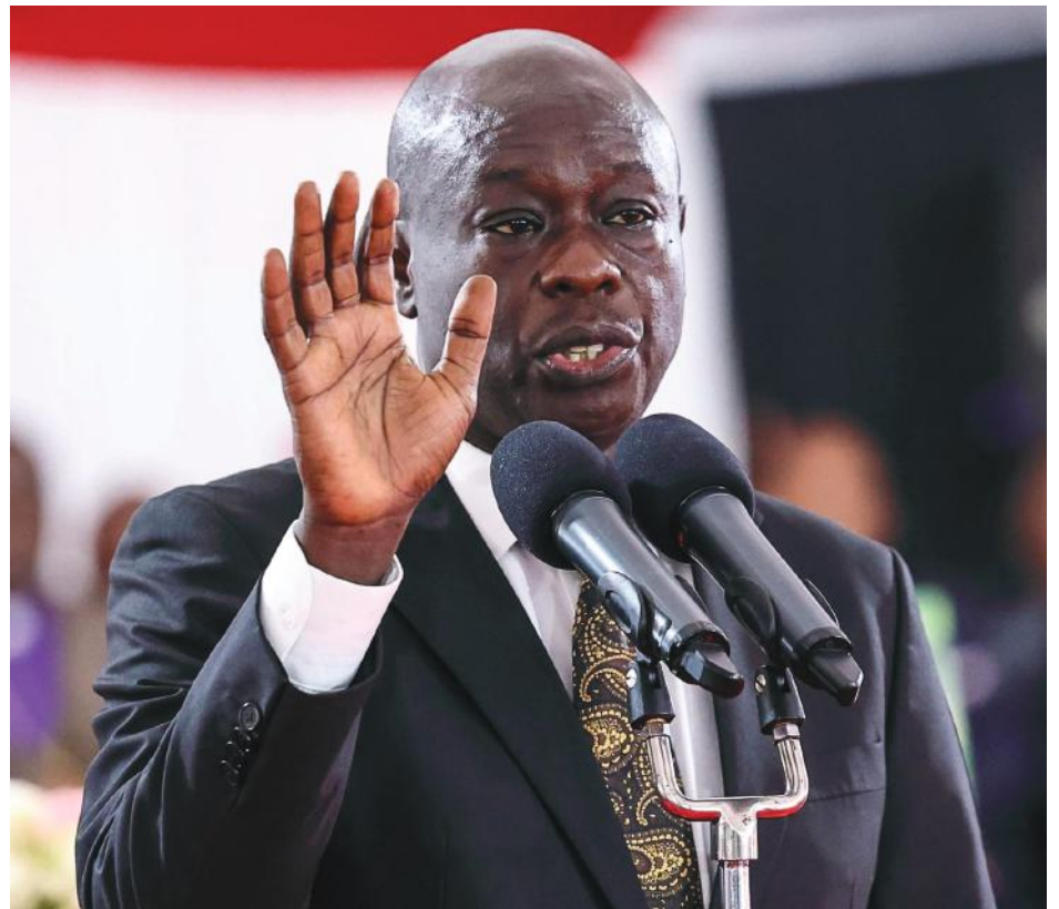
Former Deputy President Rigathi Gachagua addressing press yesterday

In a televised presser from his Karen home, where he was accompanied by several of his political allies, the Democracy of the Citizens Party (DCP) Party Leader alleged that he had impeccable intelligence to the effect that a lethal police unit had been assigned to waylay him on his way from Gataanga in Murang'a on Sunday.