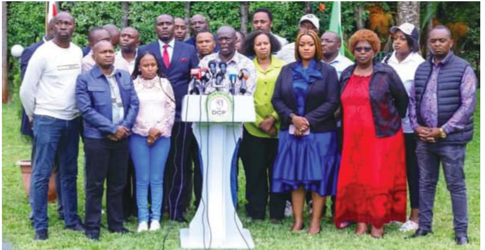
Former Deputy President Rigathi Gachagua and other leaders addressing press yesterday

Former Deputy President Rigathi Gachagua yesterday claimed that President William Ruto had issued instructions for his elimination.