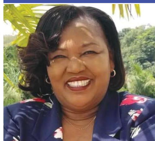
Opinion: Gender Based Violence: Forgiving The Unforgivable P.12