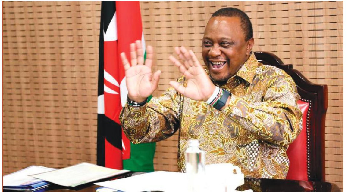
Former President Uhuru Muigai Kenyatta