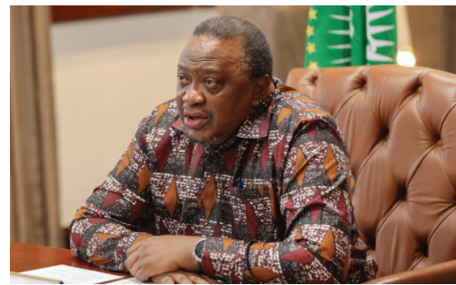
Politics: Jubilee Party: A Detailed Analysis Of The Former Ruling Party's Revival P.11