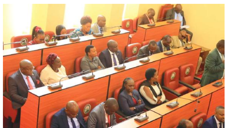
Kisii County Assembly