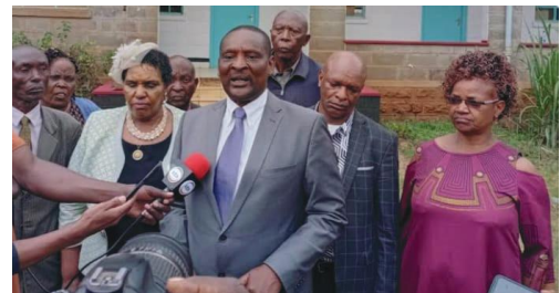
News: Mau Mau War Veterans Association Urges Members To Attend PBOs Regulations Forums P.13