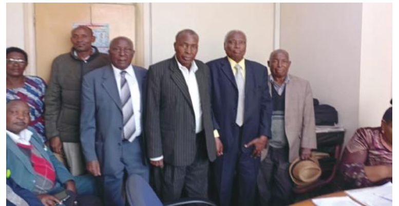
Some of the other stakeholders who have been involved in demanding former freedom fighters compensation.

On Thursday, the National Assembly approved the nominees with the Chief Justice, Martha Koome expected to