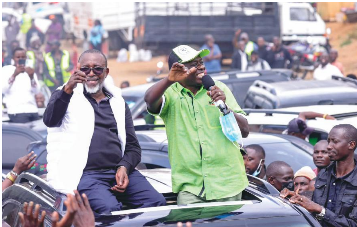
DCP party leader Rigathi Gachagua with for Cabinet Secretary Mithika Linturi in Meru town yesterday.

"We were campaigning for Ruto and Meru emerged number four in voting for President William Ruto but he