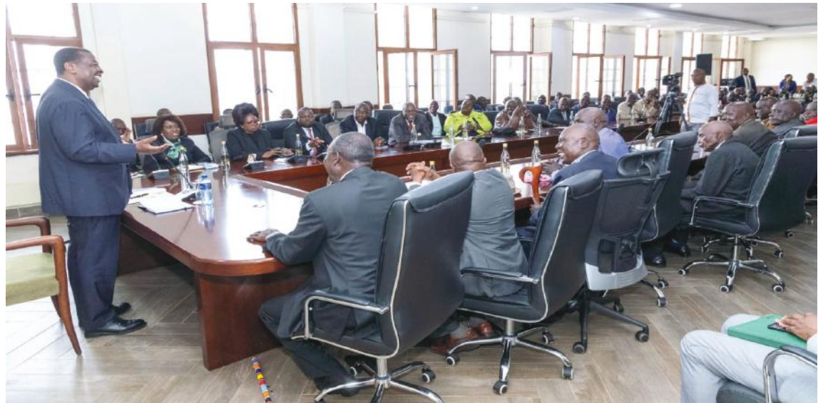
Prime Cabinet Secretary Musalia Mudavadi during a consultative session with clan elders from Malava Constituency.

firm stand, and I listened. Since then, I have walked a path of honesty, integrity, and discipline. I don't make empty promises, and I won't lead you astray. As you have held my hand in the past, I promise to walk with you in this government," said Mudavadi.