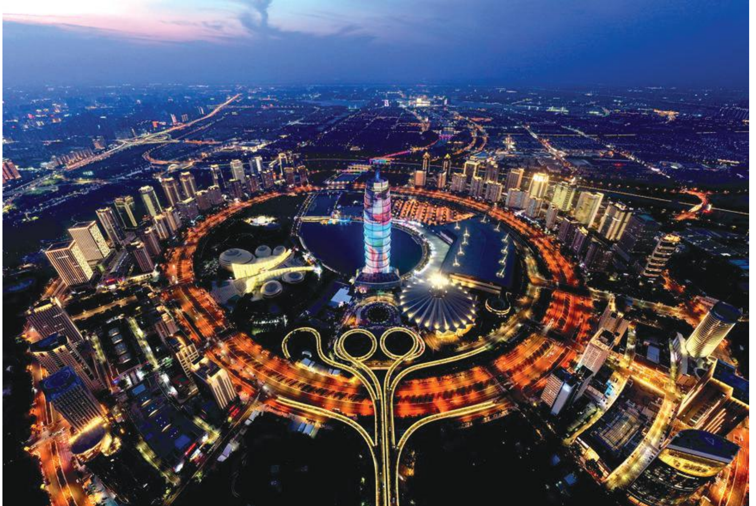
aerial drone photo taken on July 19, 2025 shows the Central Business District (CBD) in Zhengdong New District of Zhengzhou, central China’s Henan Province.