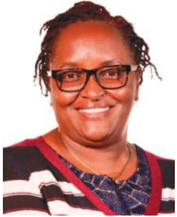
By: MKT Reporter @themtkenyatimes