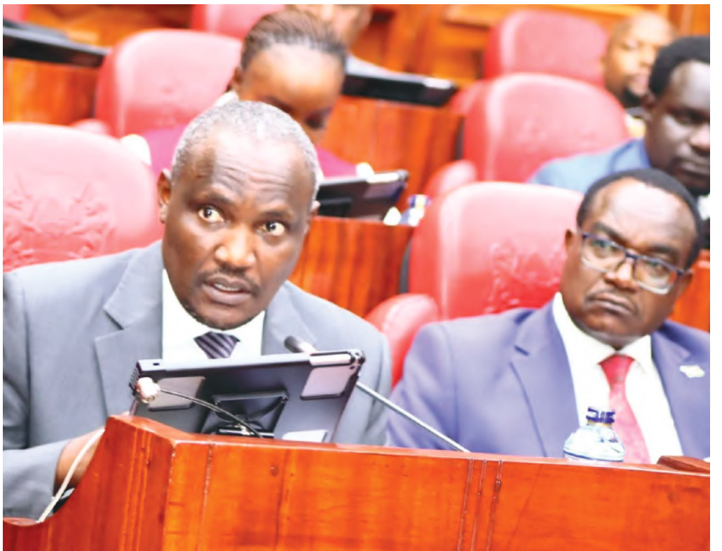
Cabinet Secretaries John Mbadi and Julius Ogamba yesterday.