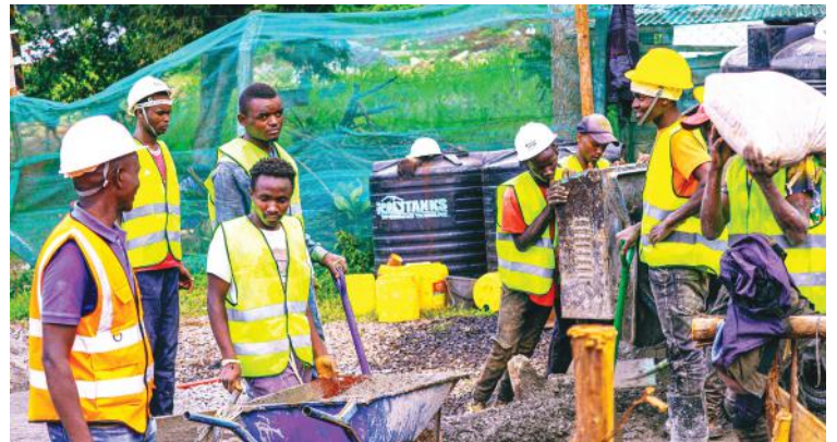
Work going on at the new market site.

using his personal and friends funds to settle fees and hospital bills.