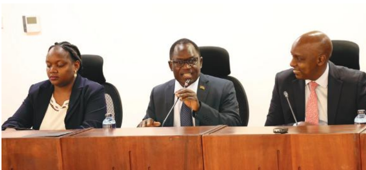
The Parliamentary Committee on Delegated Legislation.