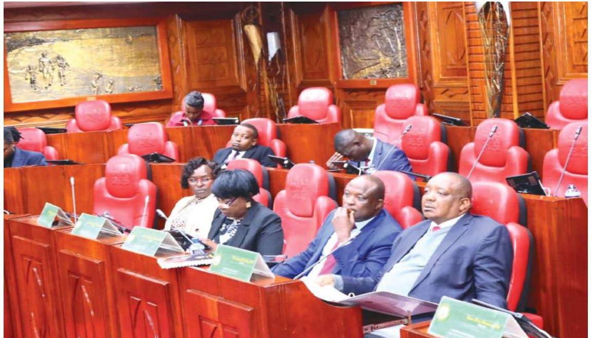
Some of the committee members during yesterday’s session.

“We are under-providing per child because of fiscal constraints. The