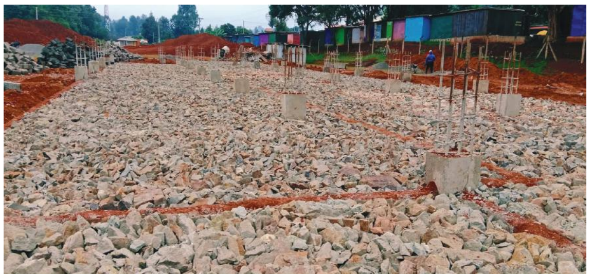
Progress at Othaya Stadium.