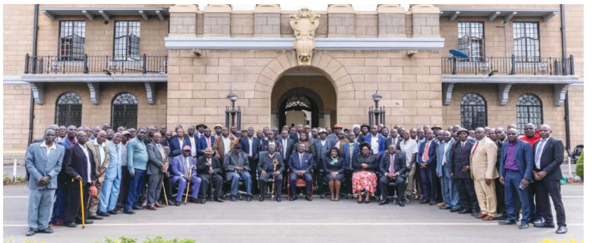
Prime Cabinet Secretary Musalia Mudavadi poses for a photo with clan elders from Malava constituency at his Railways offices in Nairobi.

As UDA positions itself to reclaim the Malava seat, Mudavadi's involvement signals a strategic blend of political experience, grassroots connection, and national ambition, anchored in the promise of delivering real change.