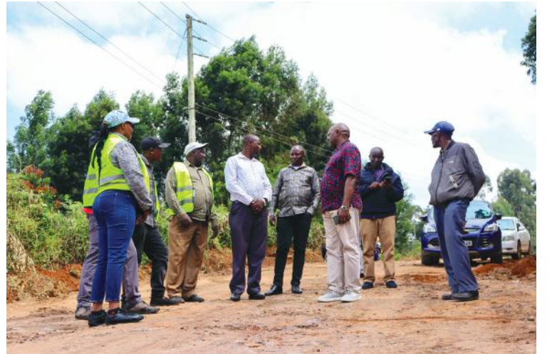
Othaya MP inspecting a road under construction.

Apart from the projects funded by the government, the MP through his foundation has been in the forefront of building decent houses to the less privileged where more than 300 households have benefited as well as