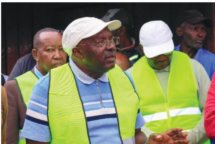
Othaya MP during the inspecting the electrification initiatives last week.

Yesterday, the MP told his constituents to wait for more development initiatives saying he was out to make sure he improved their economic and social standards of their living.