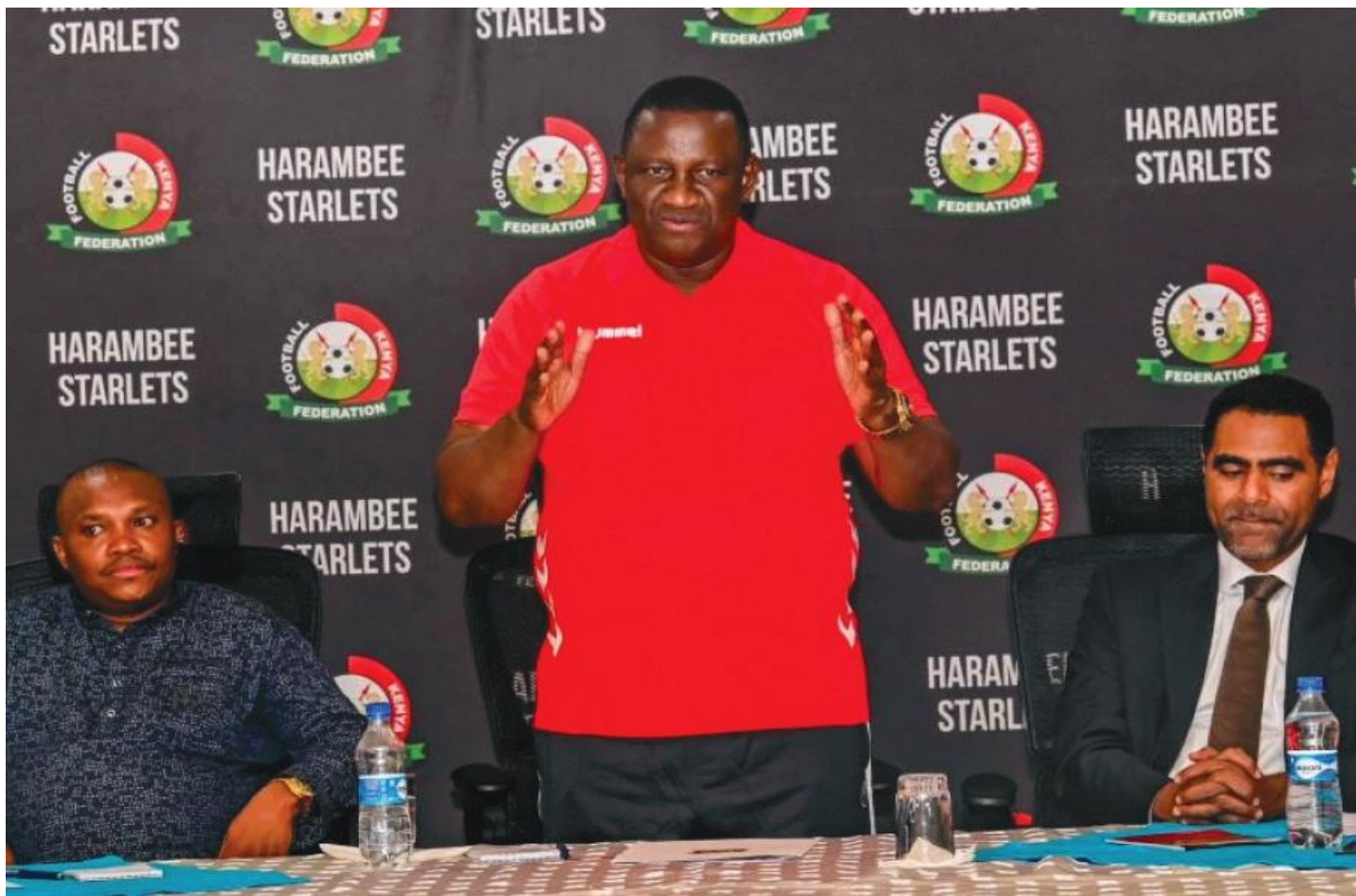
Sports CS Salim Mvurya speaking when he visited Junior Starlets at their Kasarani residential camp on Thursday March 27, 2025.

Sports Cabinet Secretary Salim Mvurya has hinted at a looming overhaul in the country's football league system, signalling potential structural changes that could transform talent development and club sponsorship across the country. Speaking on Citizen TV's Sema na Citizen yesterday, Mvurya emphasized the need for close cooperation with the Football Kenya Federation (FKF) to introduce a more effective league format. He says the proposed structure aims to support local talent growth, increase competitiveness, and attract more commercial sponsorships to both top-flight and lower-tier clubs. "We have agreed with FKF that we need a new league format