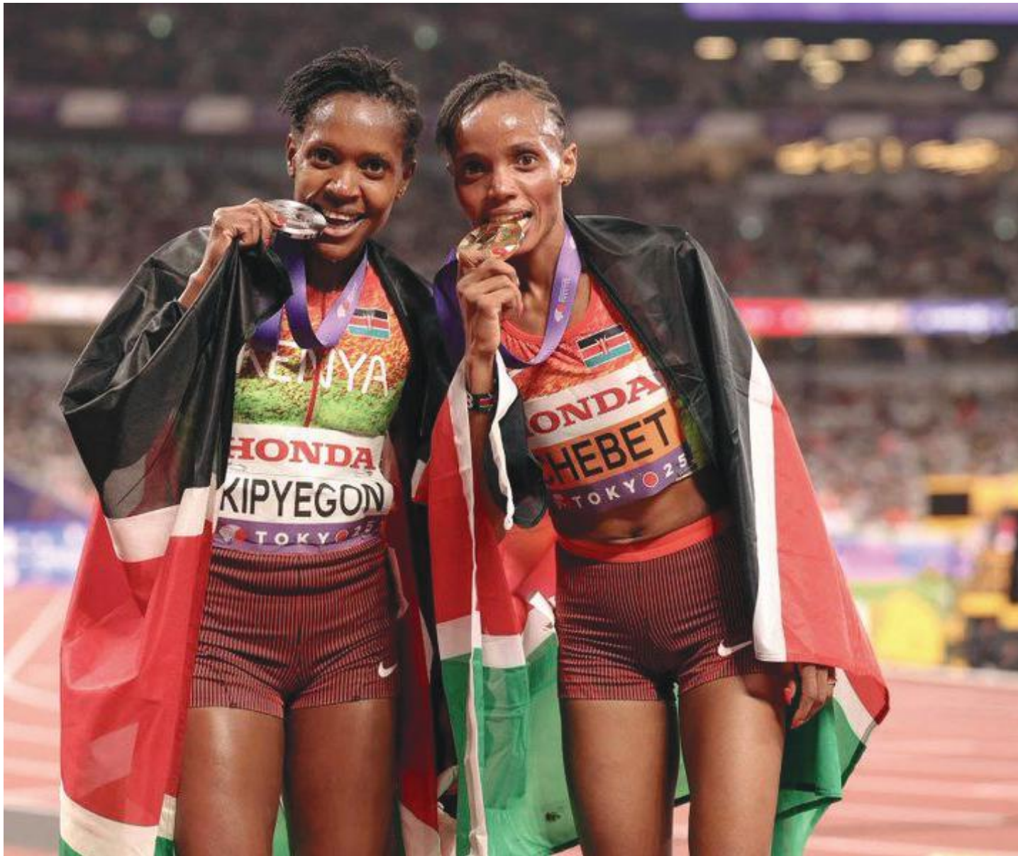
Faith Kipyegon and Beatrice Chebet after competing in 5000m Tokyo World Championships.

Global champions Faith Kipyegon, Beatrice Chebet and Emmanuel Wanyonyi are the only Kenyans shortlisted for the 2025 Track Athlete of the Year World Athletics Awards.