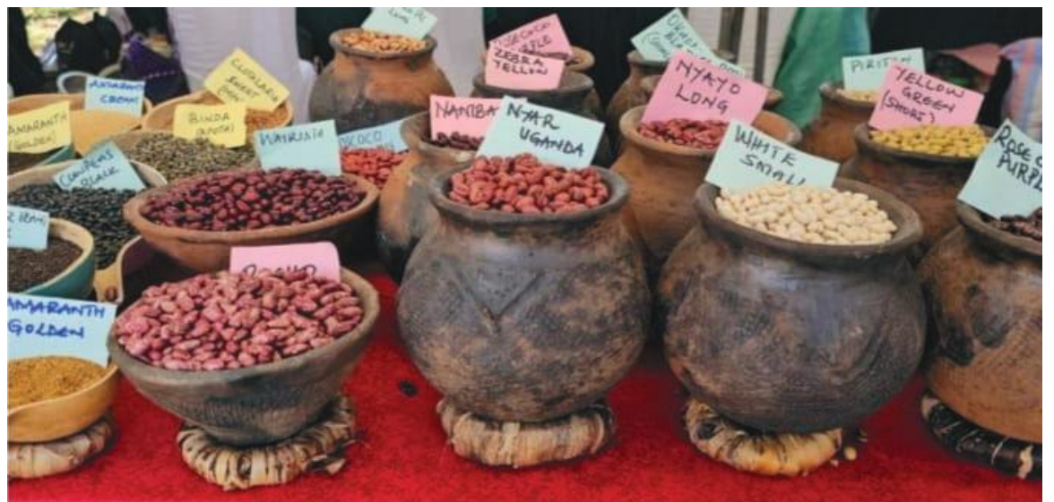
Some indigenous seeds

He said that ISFAA and other stakeholders invites participation from youth, farmers, media, policymakers, civil society, the private sector, community members and consumer organizations to collectively advocate for sustainable, inclusive and resilient food systems.