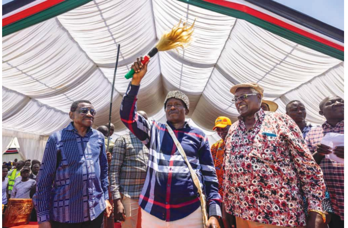
Deputy President Prof Kithure Kindiki (centre) in Siaya yesterday.

Together with the other counties along Lake Victoria, they have benefited from Sh3.1 billion for fish landing sites and associated infrastructure in Migori, Homa Bay,