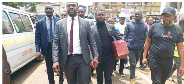
Doctors and union officials demonstrating yesterday.