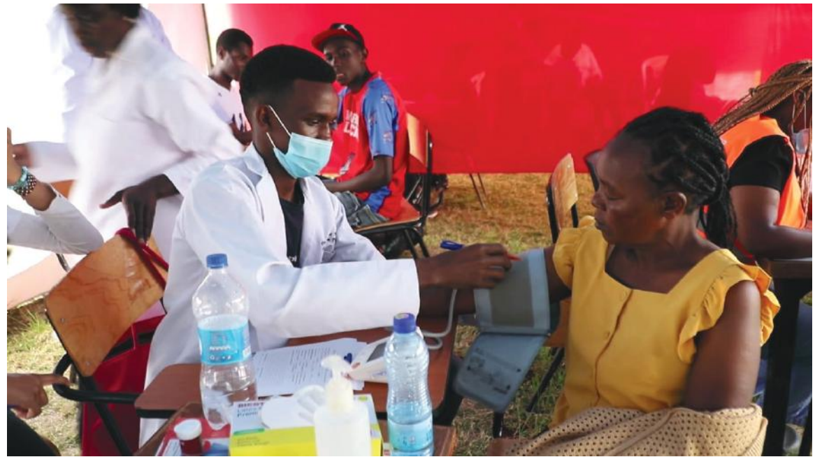
A Gatundu resident is attended to during the free medical camp organized by Mama Ngina University College.