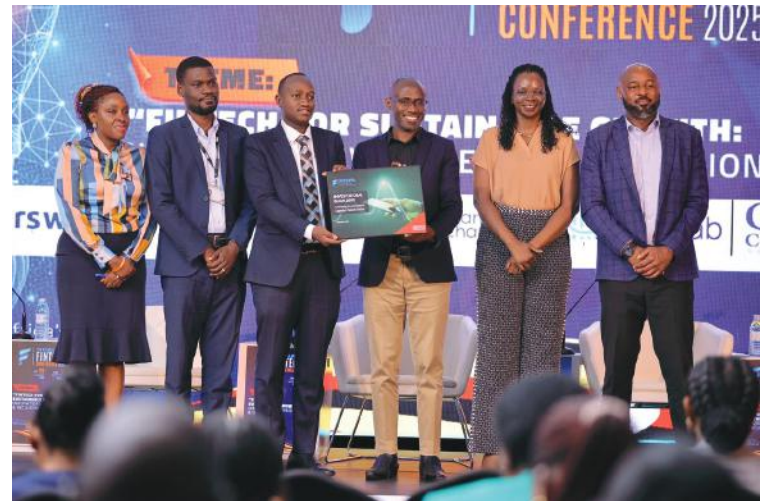
Launching the FITSPA Deal Book