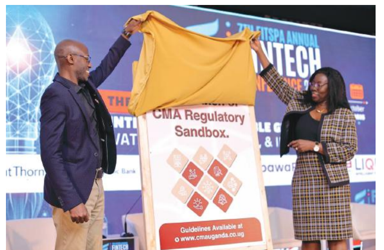
Unveiling the CMA Regulatory Sandbox