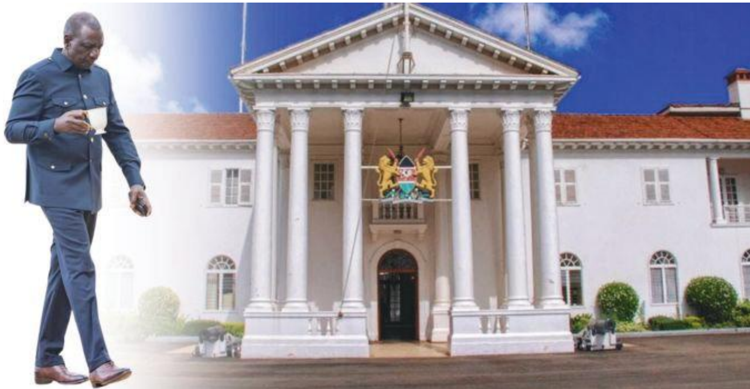
President William Ruto walking with a cup of tea at State House, Nairobi.