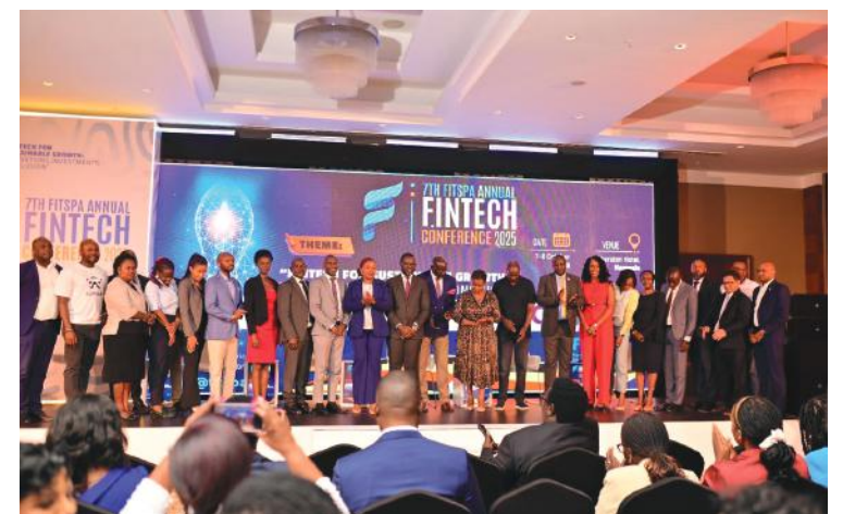
Collaboration, Compliance, and Purpose Take Center Stage at the 7th FITSPA Fintech Conference 2025

Across sessions, speakers consistently returned to one unifying message: collaboration is the lifeblood of Africa's fintech revolution. Whether between startups and banks, regulators and innovators, or telcos and insurtechs, the conference emphasized that collective effort — guided by shared purpose and responsible governance — is what will define Africa's fintech trajectory in the coming decade.