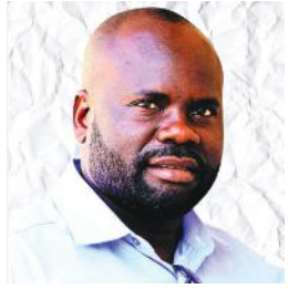
By: Silas Mwaudasheni Nande @themtkenyatimes

Polygamy In Africa: A Lost Cultural Root Or A Practice To Be Reformed?