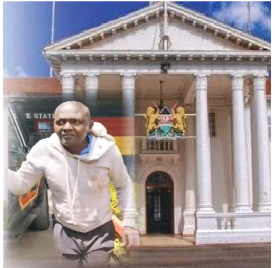
The main suspect in the arrow attack which saw the death of a GSU officer