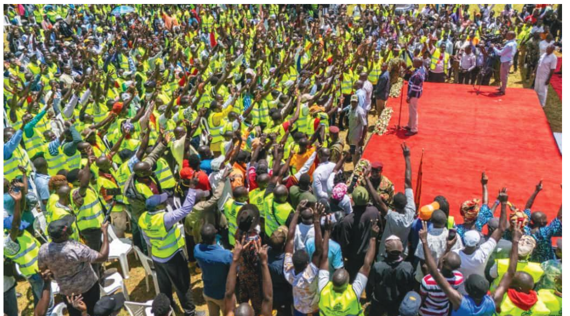
Deputy President Kithure Kindiki addressing the meeting yesterday.

The DP also urged the residents to continue registering for SHA medical cover saying 430,000 residents had already enrolled out of 995,000.