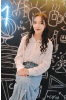
By: Kadirova Mahliyo @themtkenyatimes