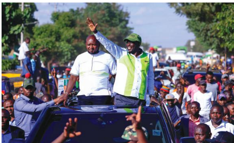
Former DP and Democracy for Citizens Party leader Rigathi Gachagua waves at the crowd during a meeting with rice farmers in Mwea, Kirinyaga county, yesterday.

His comments sparked outrage, especially among women in Kirinyaga, who rallied in Kutus town to defend Waiguru’s legacy. They hailed her as a trailblazer — the only woman elected governor twice and a two-term