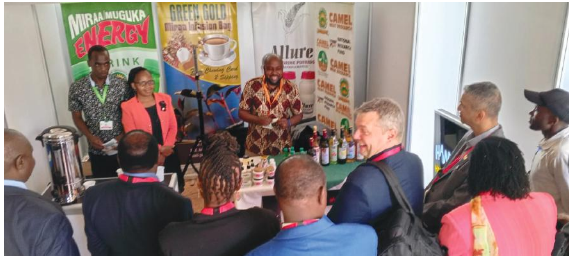
Guests are shown miraa products such as wines,energy drinks chewing gums and capsules at the Meru University of Science and Technology.

He said kenyan should find out what works for them and focus on that innovation as innovation from Europe might not be ideal for Kenya.