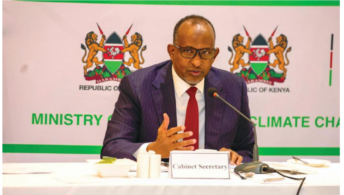
Health Cabinet Secretary Aden Duale

“This gentleman should not be in this committee,” Duale declared, signaling that the political fallout from this clash is far from over.