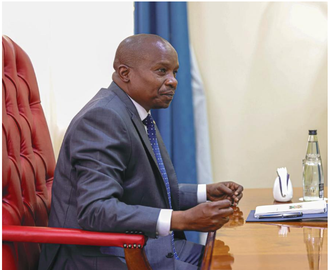
Deputy President Prof Kithure Kindiki

The DP further chaired a meeting of the Cabinet Committee on Governance, Social Sector and Public Administration that was attended by among others Prime Cabinet Secretary Musalia Mudavadi, Cabinet Secretaries Aden Duale (Health), Rebecca Miano (Tourism and Wildlife), Alfred Mutua (Labour and Social Protection), Julius Migos Ogamba (Education), William Kabogo (ICT & the Digital Economy), Salim Mvurya (Youth Affairs, the Creative Economy and Sports), Geoffrey Ruku (Public Service), Hannah Cheptumo (Gender, Culture & Children Services) and Dorcas Oduor (Attorney General).