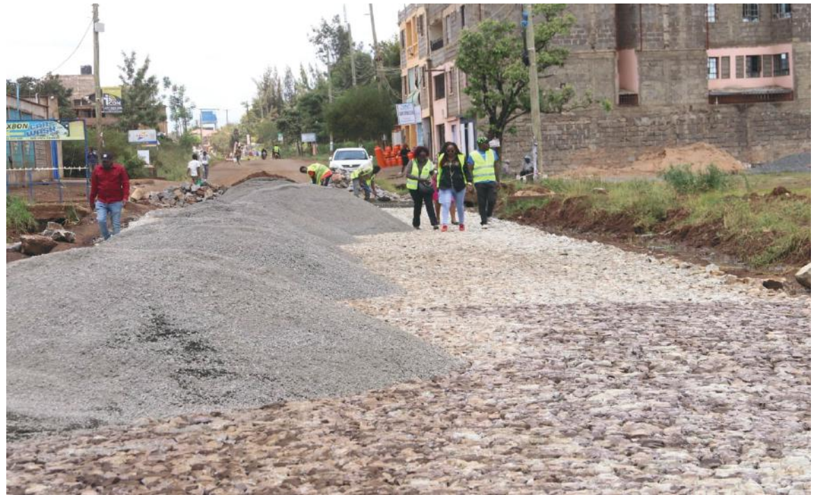
A section of the Rainbow–Juja Farm Road.