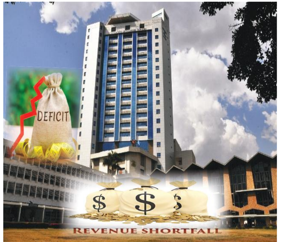
The University of Nairobi