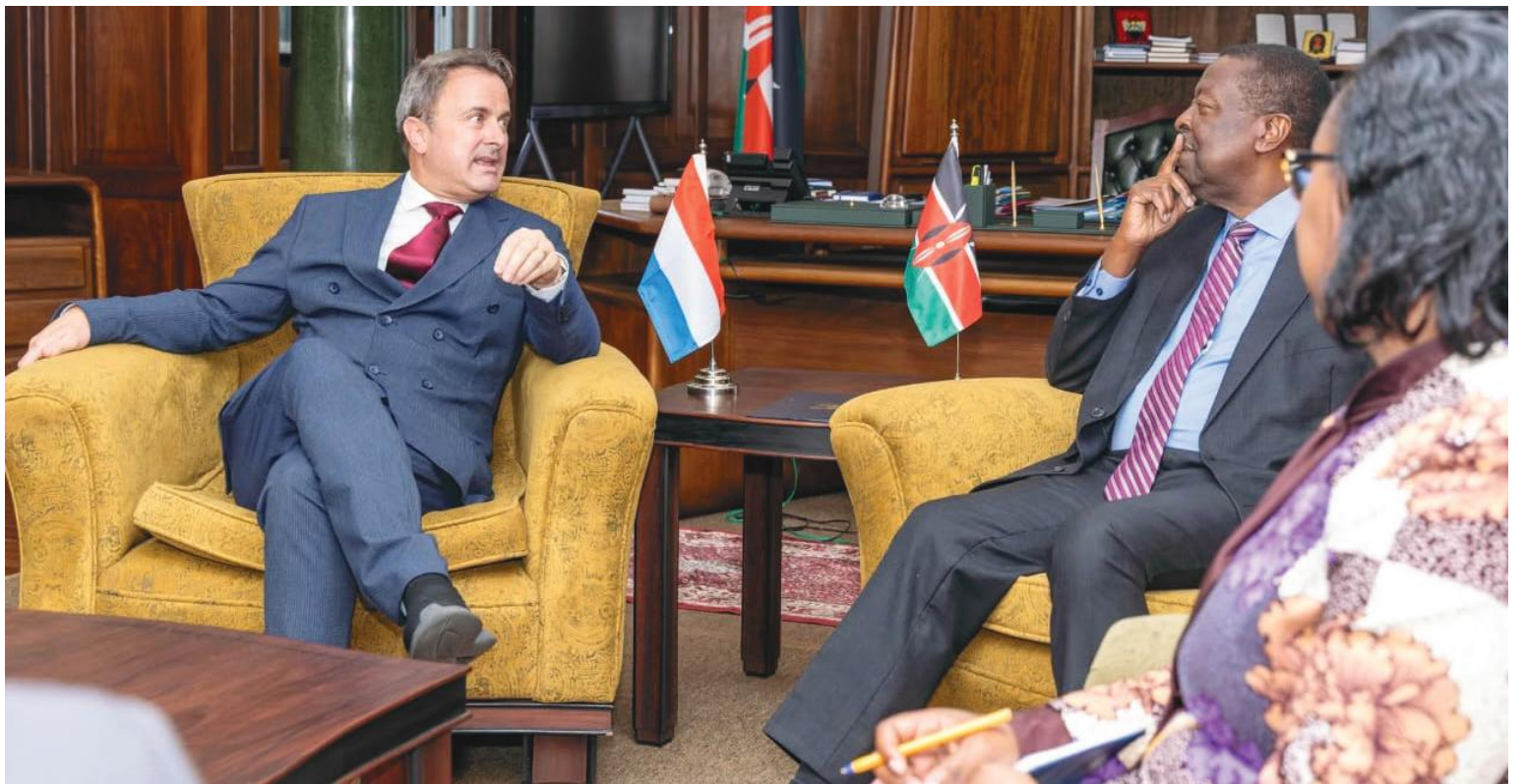
Prime Cabinet Secretary and Cabinet Secretary for Foreign Affairs and Diaspora Affairs Musalia Muadavadi with Mr. Xaver Bettel, Deputy Prime Minister and Minister of Foreign Affairs and Foreign Trade of Luxembourg.

They agreed to deepen bilateral ties and encouraged Luxembourg to establish a diplomatic mission in Nairobi to expand engagement between our nations. Prime CS also urged