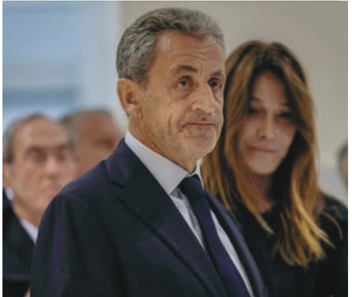
Nicolas Sarkozy entering the prison yesterday.

Sarkozy Was Convicted Of Criminal Conspiracy For Seeking Campaign Funds For The 2007 Election From Libya's Strongman Muammar Gaddafi