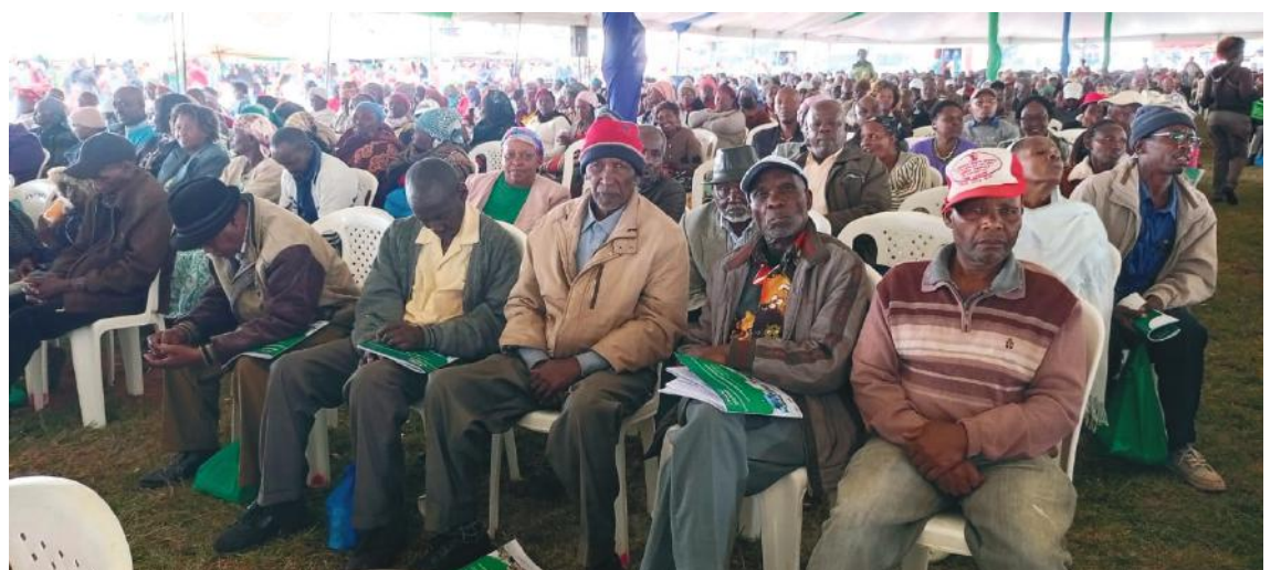
Githunguri dairy farmers shareholders follow proceedings during the annual general meeting.