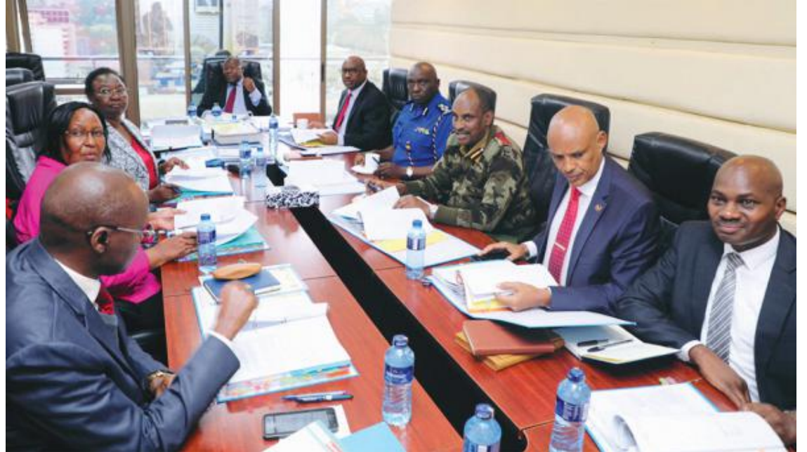
The Commission cited Section 12(1) of the Employment and Labour Relations Court Act and Article 162(2) of the Constitution, arguing that the ELRC's powers are confined to disputes between employers and employees, or involving trade unions and labour organizations

The agencies warn that allowing the ELRC to proceed with the case could disrupt the established chain of command and civilian oversight structures governing the police service.