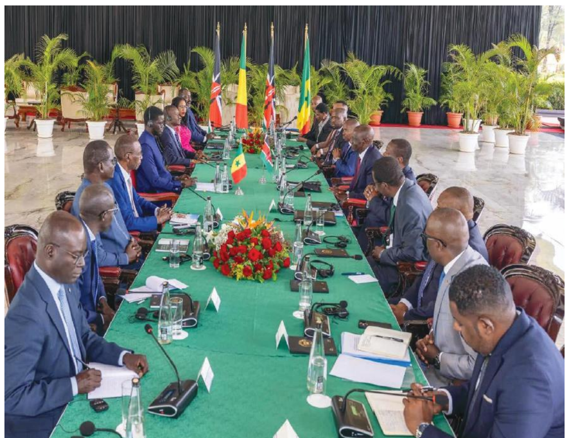
Government officials from Senegal and Kenya during the consultative meeting yesterday.

“We have agreed to work on organising the Joint Cooperation Commission, which I hope will help identify and explore concrete areas of partnership that need to be built or innovated,” he said.