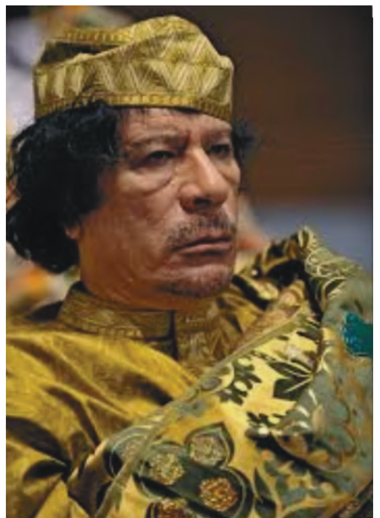
The late Muammar Gaddafi

The court has two months to examine the release appeal lodged by his lawyers