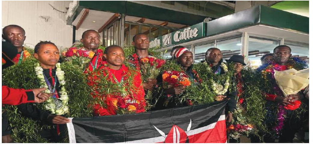
Team Kenya for the 24th Summer Deaflympics in Caxias do Sul, Brazil returning home to a heroic welcome at the JKIA.

Additionally, there are concerns over the inclusion of deaf handball, which was allegedly sus-