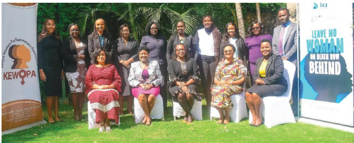
Some of KEWOPA members and ICJ officials after the Tuesday meeting.