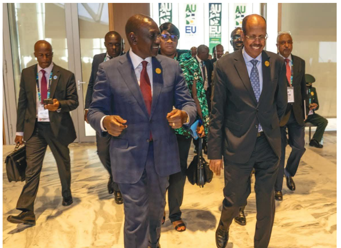
President William Ruto and AU chairperson Mahmoud Ali Youssouf leaving the conference hall on Tuesday.

moud Ali Youssouf affirmed the Commission's commitment to driving the reforms forward and praised Ruto for his sustained leadership in steering the process.