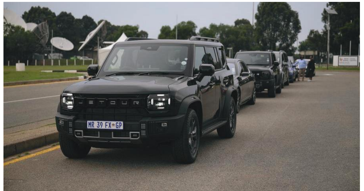
This photo taken on Nov. 20, 2025, shows the delegation motorcade outside the G20 Leaders' Summit venue in Johannesburg, South Africa, including a Jetour vehicle as an escort.