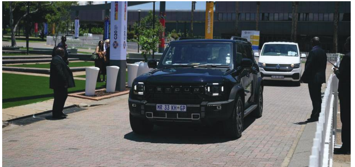
A Jetour vehicle arrives outside the venue of the G20 Leaders' Summit as an escort for the delegation motorcade, in Johannesburg, South Africa, Nov. 22, 2025.