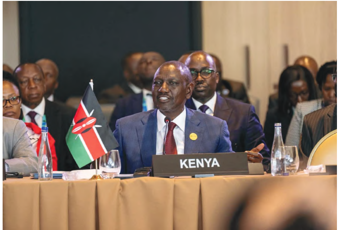
President William Ruto addressing the forum on Tuesday.

The report discussed in Luanda proposes far-reaching changes aimed at revitalising the AU's peace and security architecture, securing predictable financing for the Union, operationalising the long-delayed African Court of Justice and streamlining the AU Assembly agenda to improve focus and decision-making. It also calls for strengthening the Pan-African Parliament by advancing ratification of the Malabo Protocol, introducing clear categories for AU decisions to improve compliance, finalising the division of labour among AU organs and regional bodies, and restructuring AU institutions to create a leaner, more