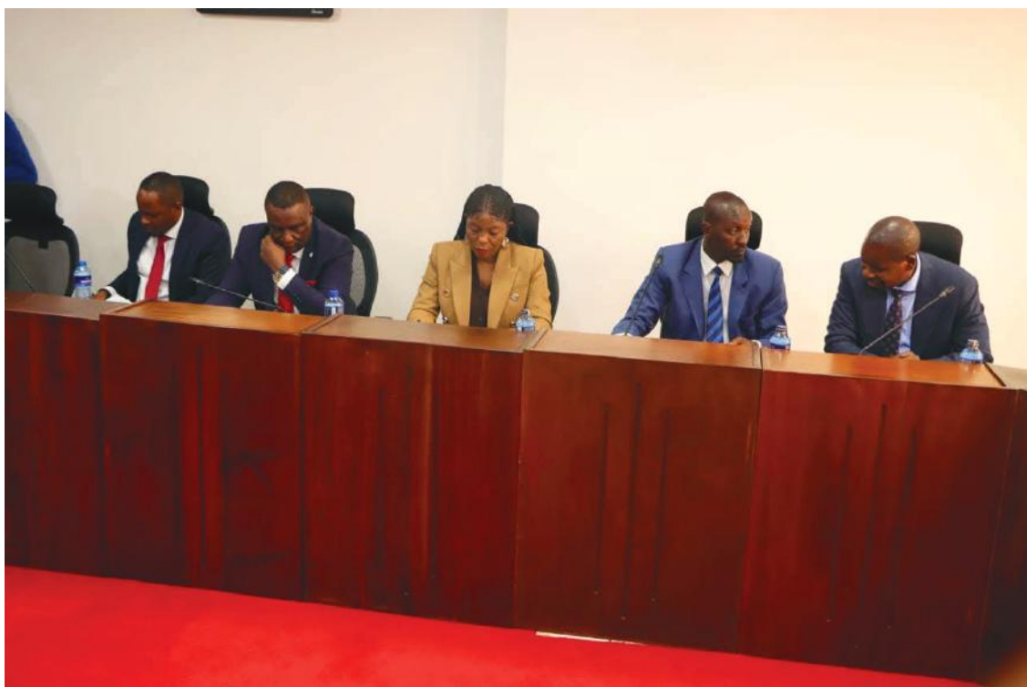
Some of the parliamentary committee members.

committee directed the Ministry to settle all verified certificates within two weeks to accelerate completion of the academies. MPs vowed to maintain close oversight, stressing that the projects were vital for nurturing grassroots sports talent and empowering youth nationwide.