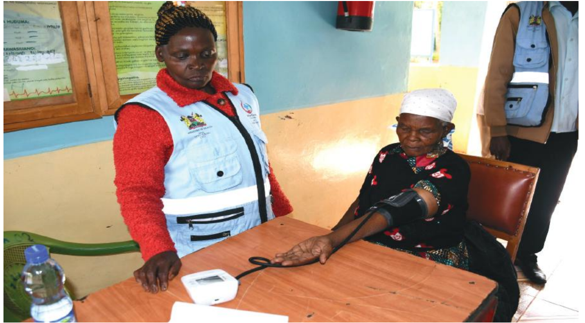
A health worker checking the Blood Pressure of a farmer at Wandumbi dispensary, Tetu yesterday

Farmers noted that the distance and cost are significant barriers to accessing healthcare and commended the KTDA Foundation for the initiative.