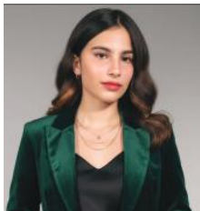
By: Ayesha Talib @themtkenyatimes