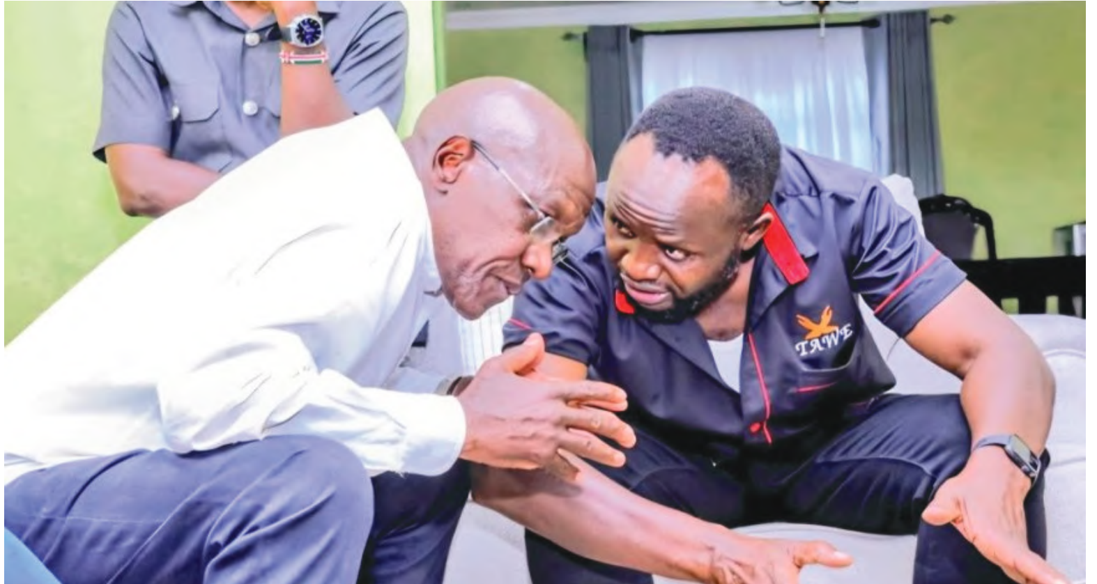
Governor George Nitemba and Senator Boni Khalwale

In recent years, Kenya has experienced a concerning pattern in the administration of state security: the withdrawal of protection from key public figures at moments of heightened political or institutional tension. Though the National Police Service (NPS) retains legal authority over the deployment of officers, the way this authority is exercised has significant implications for public trust, governance and constitutional order.