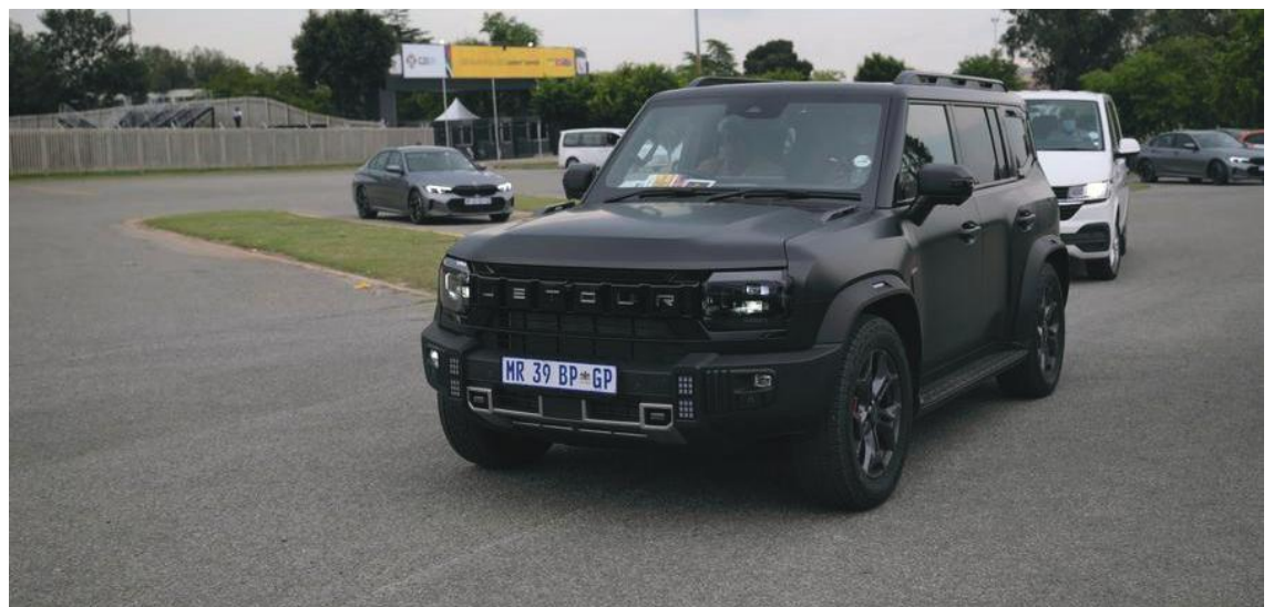
This photo taken on Nov. 20, 2025, shows the delegation motorcade outside the G20 Leaders' Summit venue in Johannesburg, South Africa, including a Jetour vehicle as an escort.