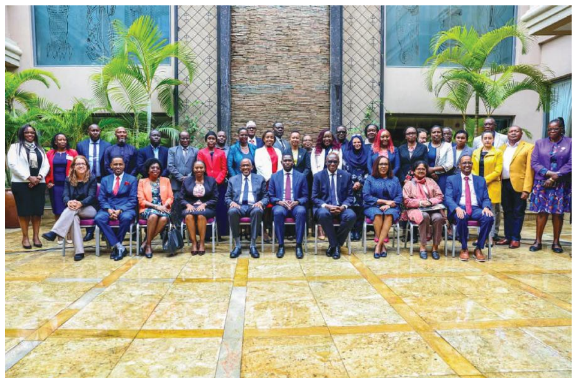
Participants during the inauguration of MPDSR steering committee.