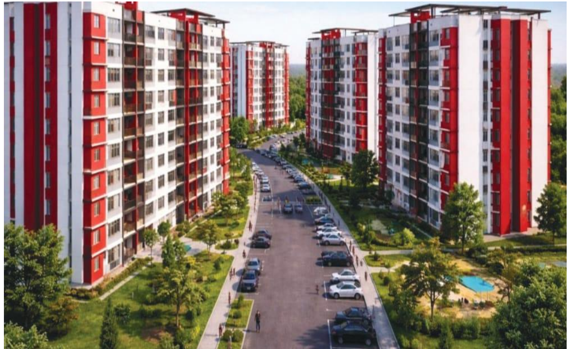
An affordable housing project

In neighbouring Kangema Constituency, another 212 housing units are planned. These will include 40 social