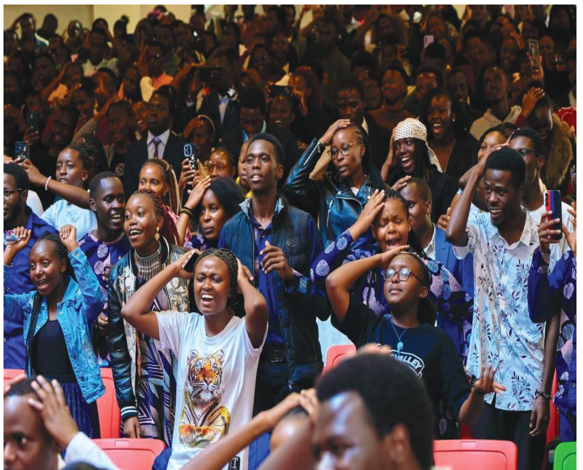
Part of the congregation during MKU's thanksgiving celebrations held on Sunday at the Mwai Kibaki Convention Centre, Thika town.