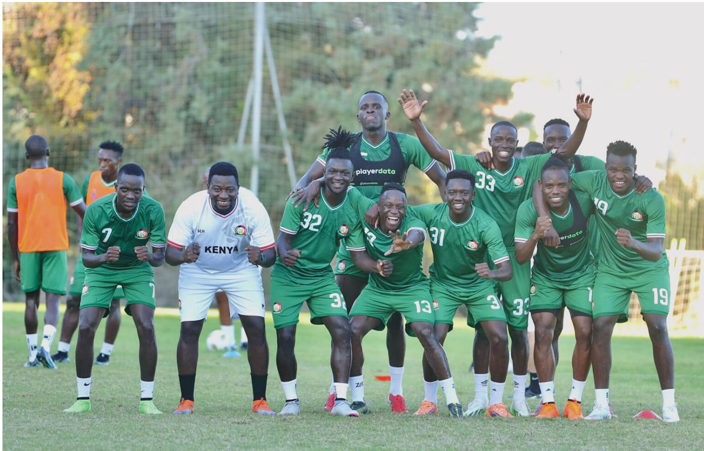
Harambee Stars players share a light moment in training in Turkey.