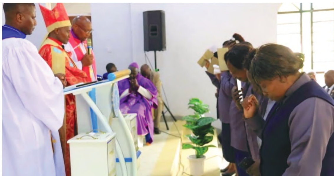
The ordination ceremony.

Earlier this month, more than 300 police chaplains drawn from across the country underwent specialised training in Kiambu County on addressing mental health challenges within the force. The programme equipped them with skills to mentor, counsel, and support officers facing rising psychological and family-related pressures.