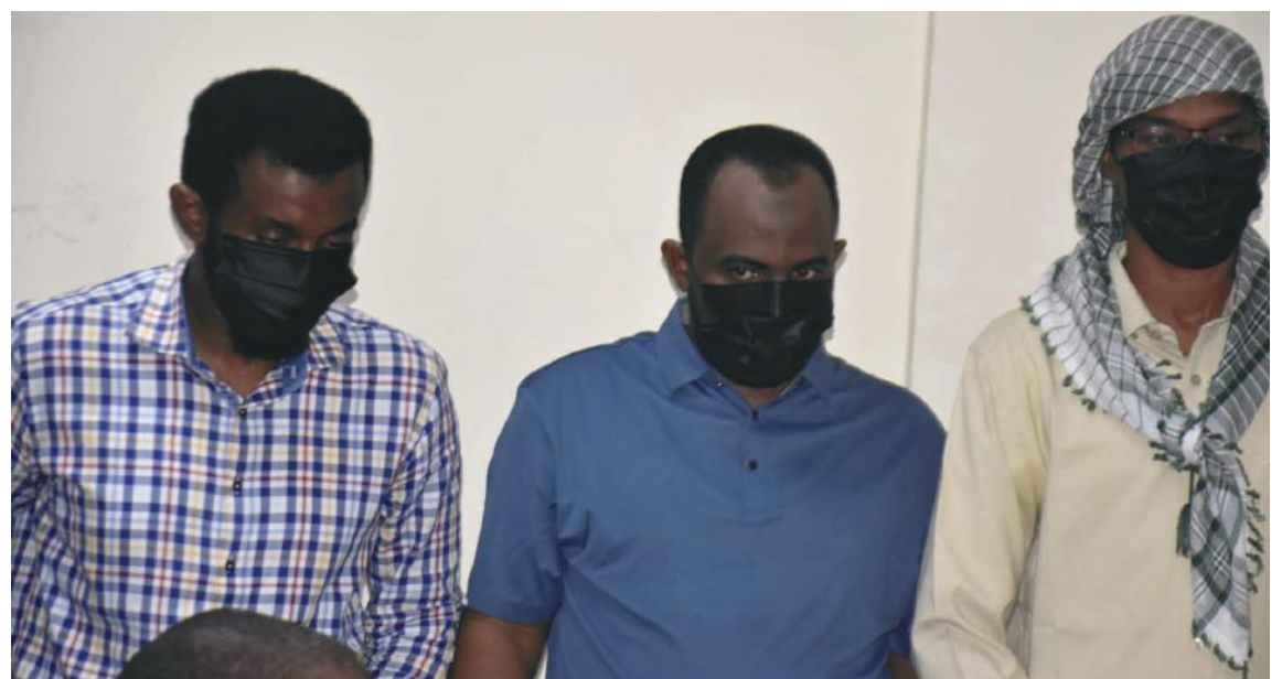
The suspects in court yesterday.

Daar was charged with conspiracy, fraudulent acquisition of public property, forgery and uttering false