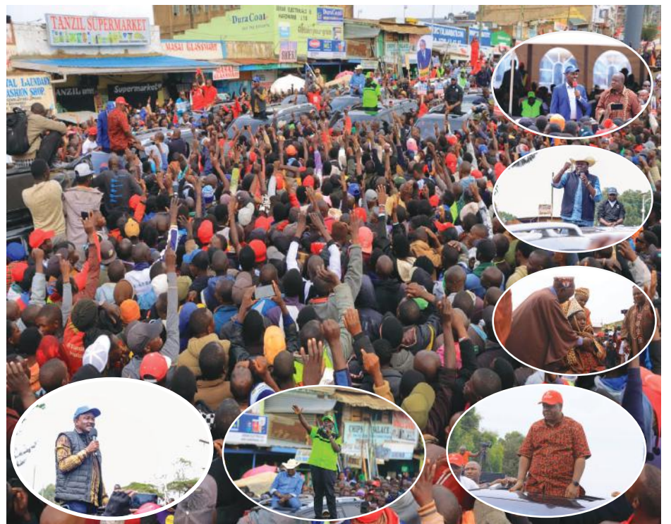
Leaders of the United Opposition yesterday in Nyamira

Leaders of the United Opposition yesterday said they are close to agreeing on a single presidential candidate to challenge William Ruto in the next General Election, vowing to face him with a united front. Speaking at Ekerenyu in Nyamira County during the coalition's first stop on a three-day tour of the Gusii region, former Deputy President Rigathi Gachagua expressed confidence that consensus would soon be reached. "This time, we are putting Kenya first and rallying behind one strong candidate. We shall not disappoint you," he told supporters.