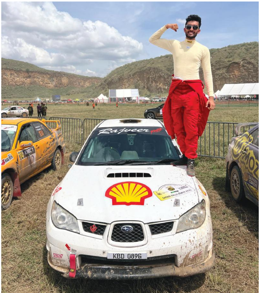
issues. We've done testing and Thethy adds. sion-making," he explains.

"Last year, I competed in a Subaru N12 built by Pro Motor Works, and I will be using the same car again this year. It's a strong and reliable machine, and last year's performance proved its durability, especially being one of the few cars to complete every stage without