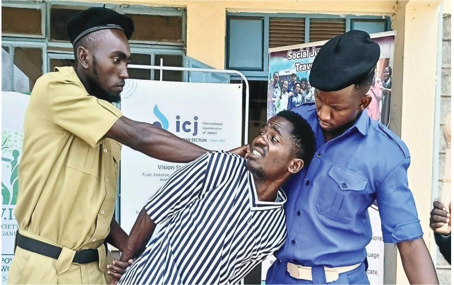
The Social Justice Centres Travelling Theatre stage a play on the legal inconsistencies.

Rights groups are stepping up calls for Parliament to remove the death penalty from Kenyan law, saying it conflicts with constitutional protections and modern standards of justice. Kenya last carried out an execution in 1987, during the tenure of former President Daniel arap Moi. Since then, courts have continued to hand down death sentences, but none have been implemented. Legal scholars describe this as a de facto moratorium. The death penalty remains in several statutes. Section 204 of the Penal Code prescribes death for murder. Sections 296(2) and 297(2) provide for death in cases of robbery with violence and attempted robbery with violence. Treason under Section 40 also attracts the same sentence. The Supreme Court addressed the issue in 2017 in Francis Karioko Muruatetu and Another v Republic . The judges ruled that the mandatory death sentence for murder was unconstitutional because it denied courts the discretion to consider mitigating factors and individual circumstances. The court did not abolish the death penalty. It held that capital punishment remains lawful under Article 26(3) of the Constitution, which allows deprivation of life following