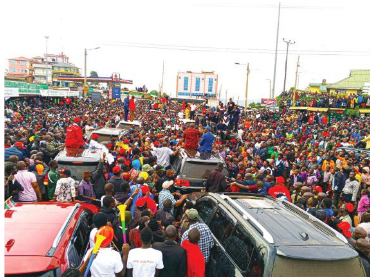
Leaders of the United Opposition yesterday in Nyamira

In Nyamira, Matiang'i was ceremonially installed as a community elder and spokesperson, further consolidating his political influence in the Gusii region.