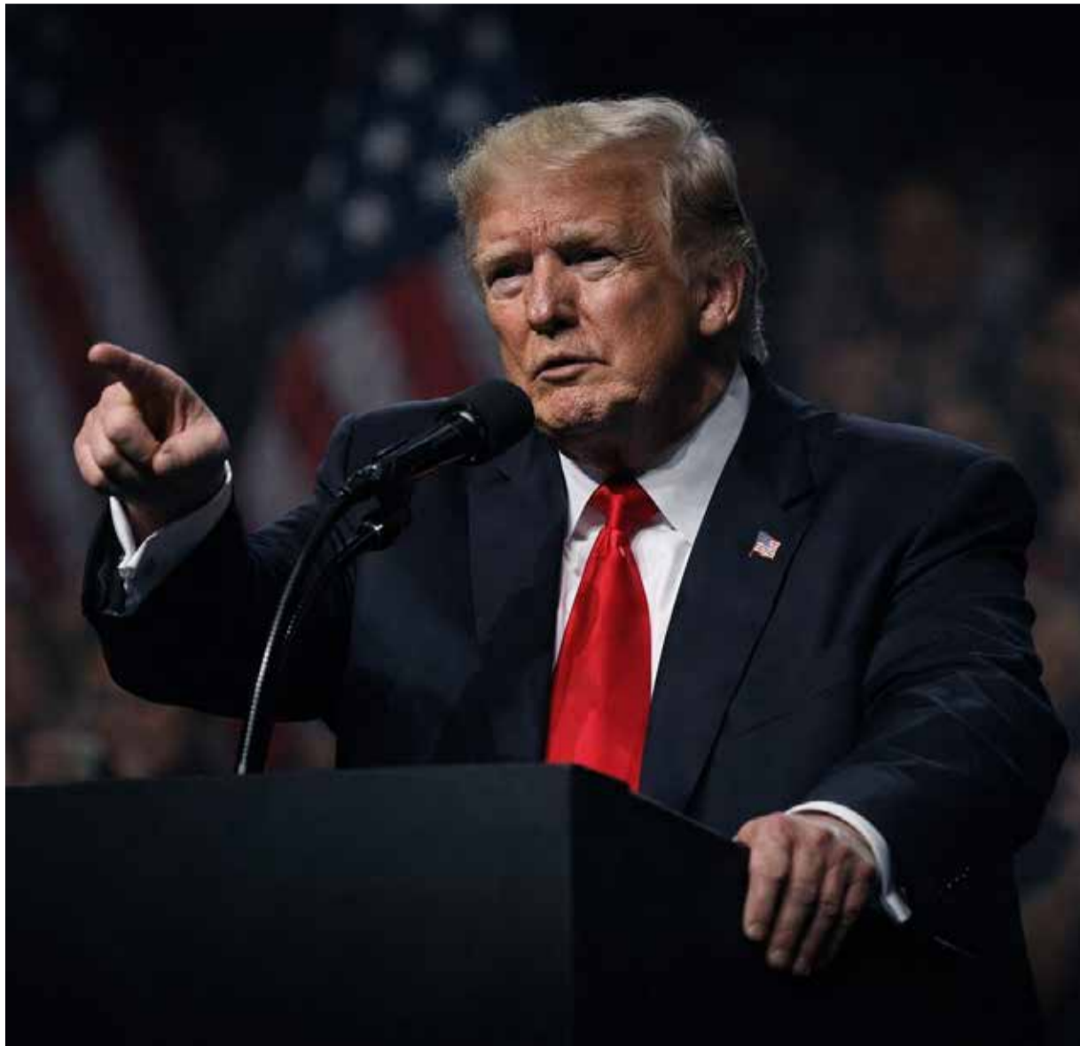
U.S. President Donald Trump

The U.S. decision to extend the ceasefire indefinitely has been widely interpreted as an attempt to preserve a diplomatic window, but analysts caution that it also serves broader strategic purposes. "Trump ... remains eager for a diplomatic solution to the war, wary of reviving an unpopular conflict he's claimed the United States already won," CNN reported Wednesday. However, the United States has not scaled back its military posture in the region. Multiple media outlets reported that U.S. naval deployments and surveillance activities in the Gulf have been maintained -- and even intensified -- during the ceasefire, suggesting continued pressure and retention of military options.