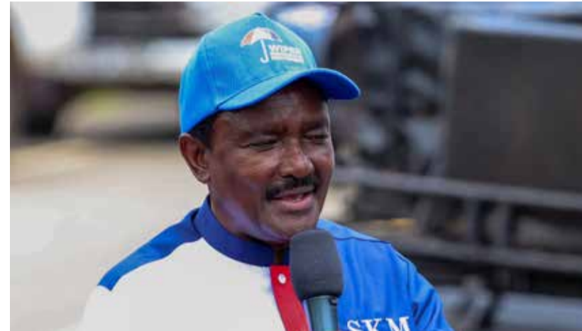
Kalonzo Musyoka addressing the public yesterday.

Additionally, he urged the electoral body to establish a transparent and accessible mechanism that would allow citizens to verify and correct