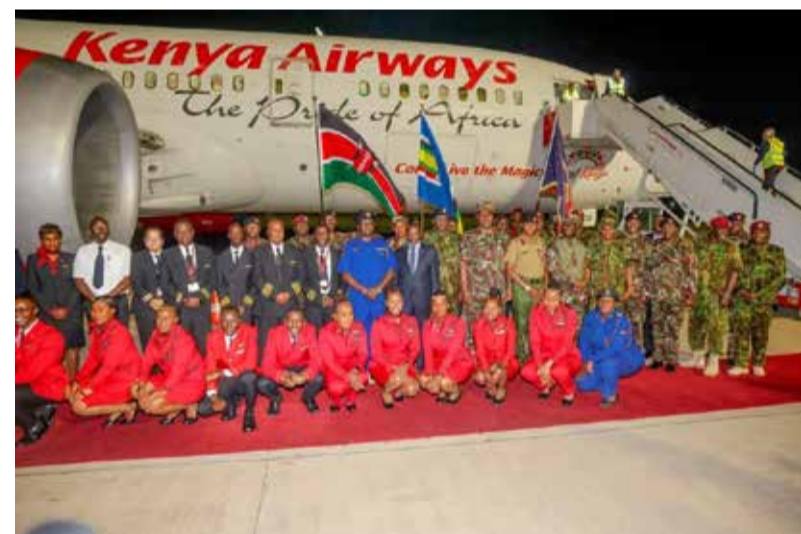
Some of the police officers with senior NPS officials and Kenya Airways staff after landing at JKIA.