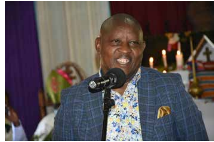
Governor Mutahi Kahiga

Leaders say the initiative is expected to significantly boost agricultural productivity, enhance food security, and create economic opportunities