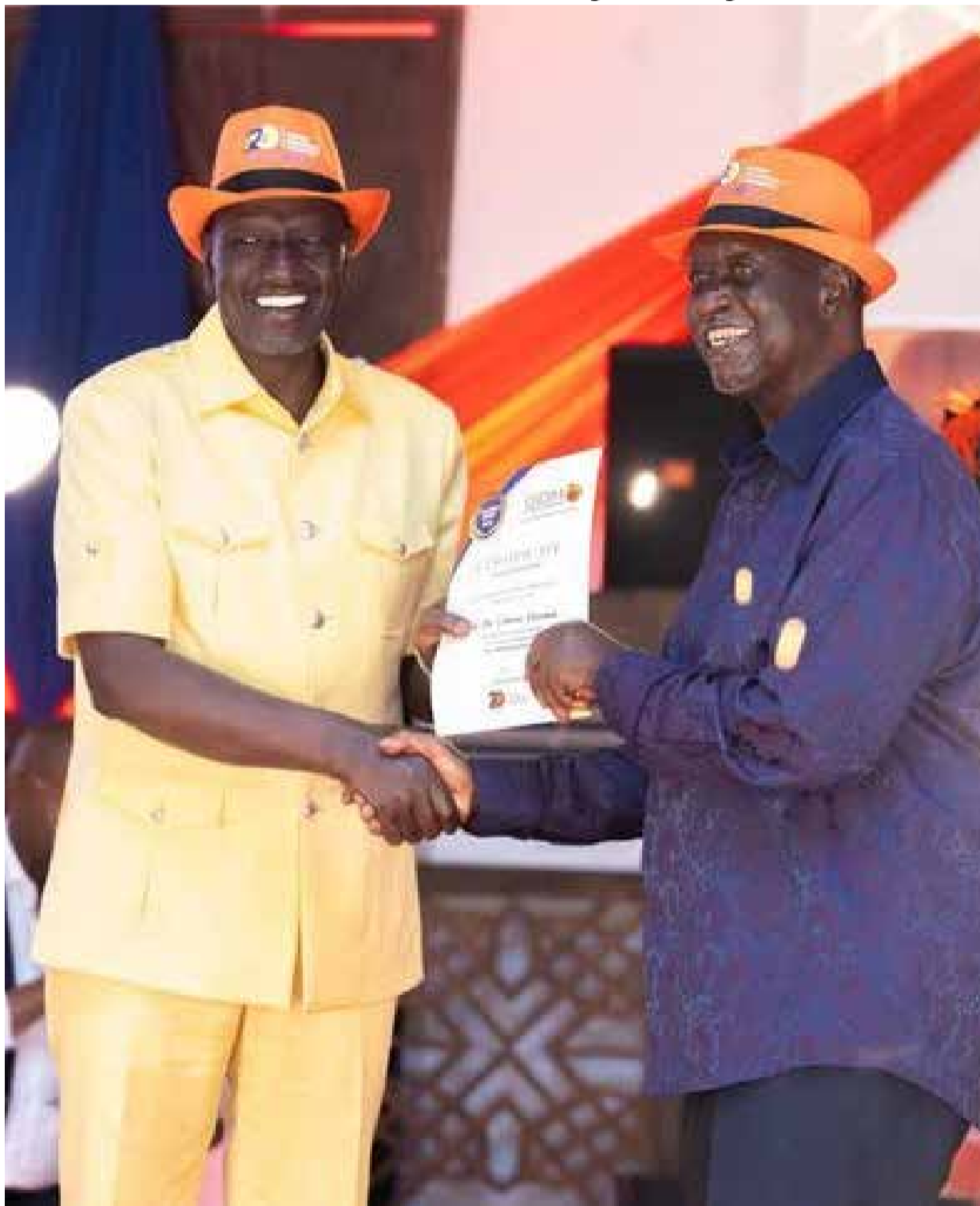
Broad-based engagement between ODM and UDA

misreading of ODM's internal dynamics. For decades, the party has not only been shaped by the towering influence of late Hon. Raila Odinga but also a resilient and ideologically anchored support base. That base is not easily swayed by elite negotiations or strategic accommodations. It is built on shared history, perceived struggle, and a collective sense of political identity that resists abrupt