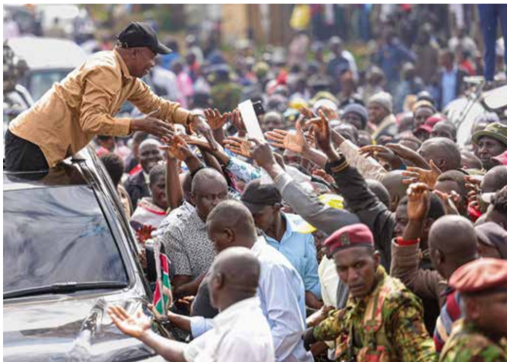
Deputy President Kithure Kindiki interacting with Eldama Ravine residents at Torongo area yesterday.

"Nobody should incite the people of Kenya to break the law or destroy their country