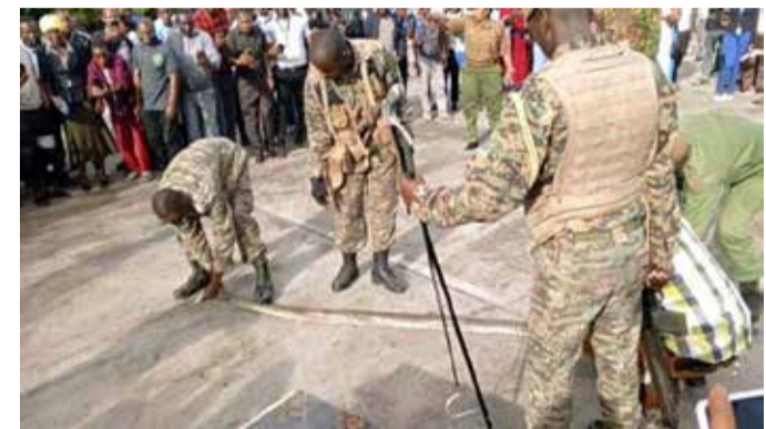
KWS, police and members of public viewing the snake at Namanga border.