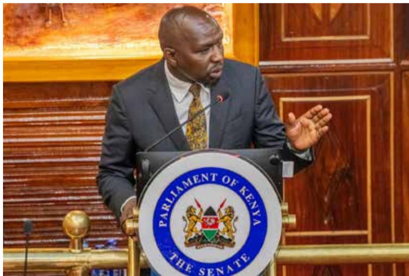
CS Kipchumba Murkomen

Murkomen informed the House that the Inspector General of Police had