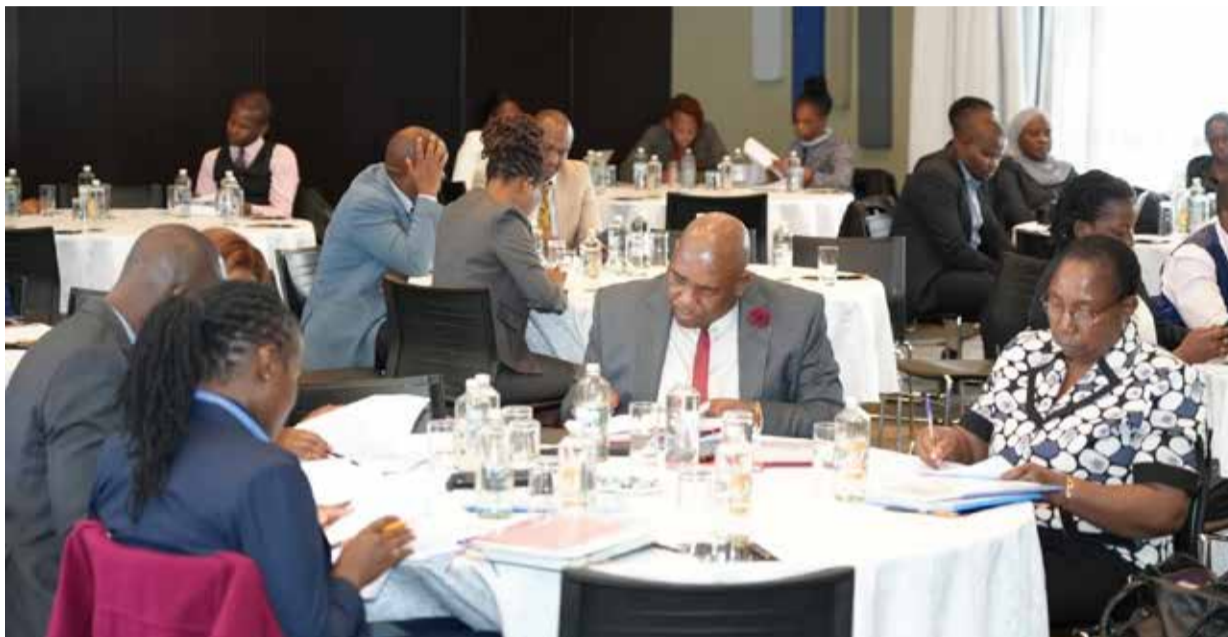
Stakeholders during one of the forums

Justice Mrima said the reforms are designed to address critical operational and legal challenges that have emerged since the court's establishment. These include jurisdictional ambiguities, conflicting High Court interpretations on the court's mandate, procedural timelines, appeals, execution processes, and the handling of complex contracts filed