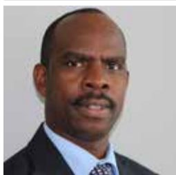
BY Henry Kinyua @themtkenyatimes

Coffee prices remained stable at the Tuesday auction held at the Nairobi Coffee Exchange, even as volumes declined in what analysts describe as a typical late-season trend.