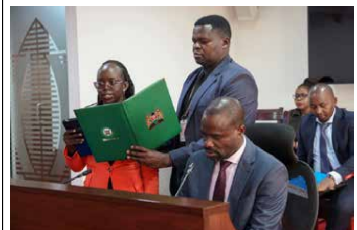
A Kenya Cultural Centre official taking oath before the PICSSAA team.