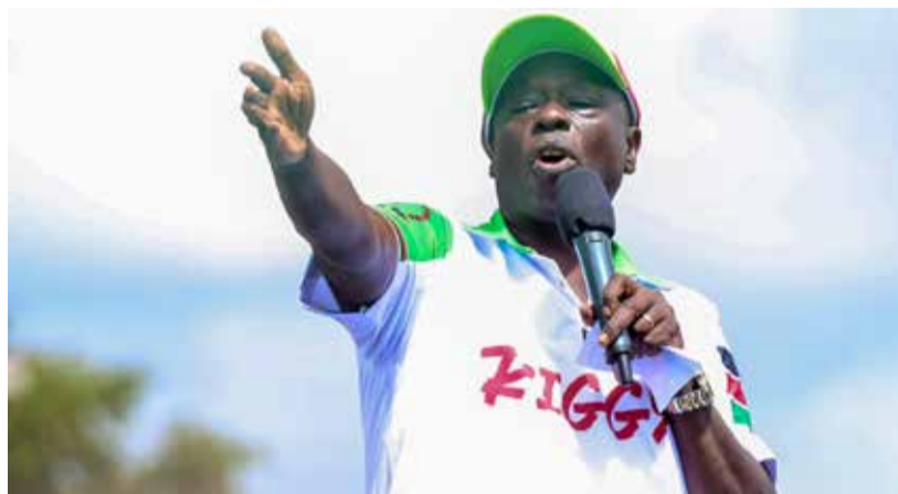
DCP leader Rigathi Gachagua in Kitui yesterday.

Muturi questioned how such changes could occur without the voter's involvement, warning that the incident reflects deeper systemic flaws in vot-