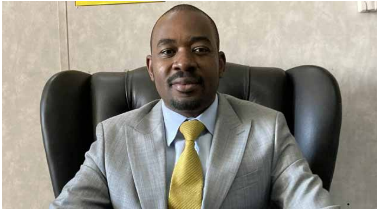
Zimbabwean opposition leader Mr. Nelson Chamisa

Zimbabwe has a long history of violence, from the liberation struggle to the present day. However, the recent spate of violent incidents, including state-sponsored attacks on opposition supporters, has sparked widespread concern and calls for accountability.