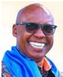
BY Jimi Wanjigi @themtkenyentimes

We are facing economic turmoil. Suffocating high fuel prices are only a symptom of economy in tatters.