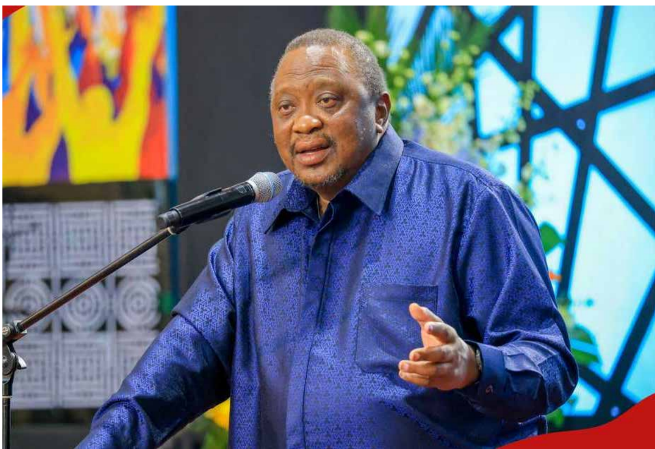
Former President Uhuru Kenyatta

NEXT GENERATION CLASSIFY "ONE-STOP NATIONAL BUSINESS DIRECTORY"