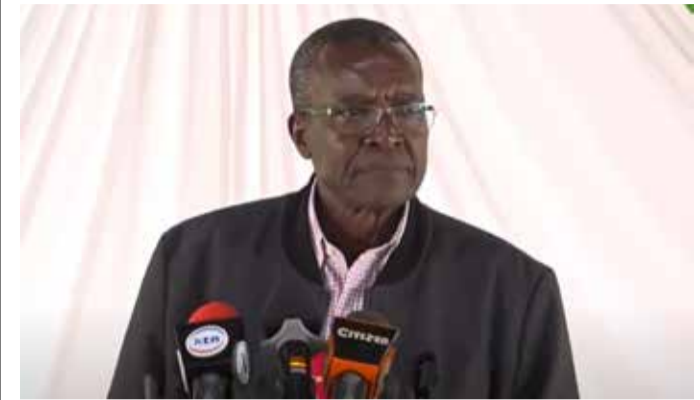
Former chief justice David Maraga