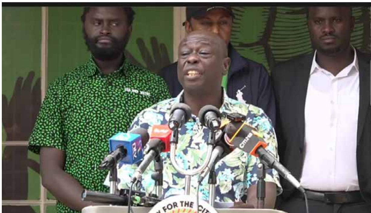
Rigathi Gachagua during the media briefing yesterday.

The former deputy president used the meeting to restructure his party leadership, appointing Nyandarua