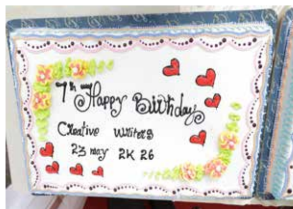
Creative Writers 7TH celebrations photo