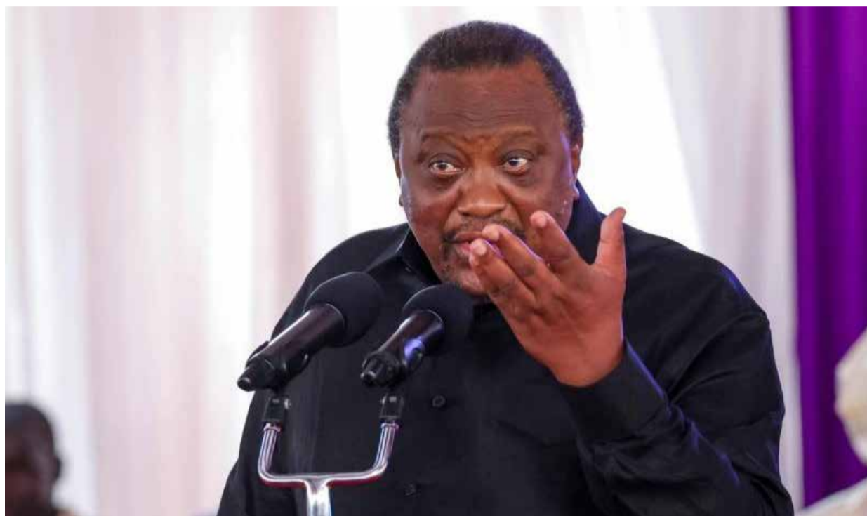
Former President Uhuru Kenyatta