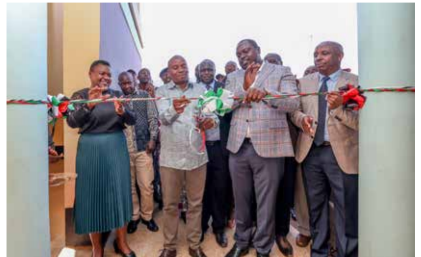
DP Kithure Kindiki launching as other stakeholders look on.

He pledged continued investment in education infrastructure, teacher recruitment and student support programmes, saying the Government was determined to ensure every child accesses quality and relevant education.