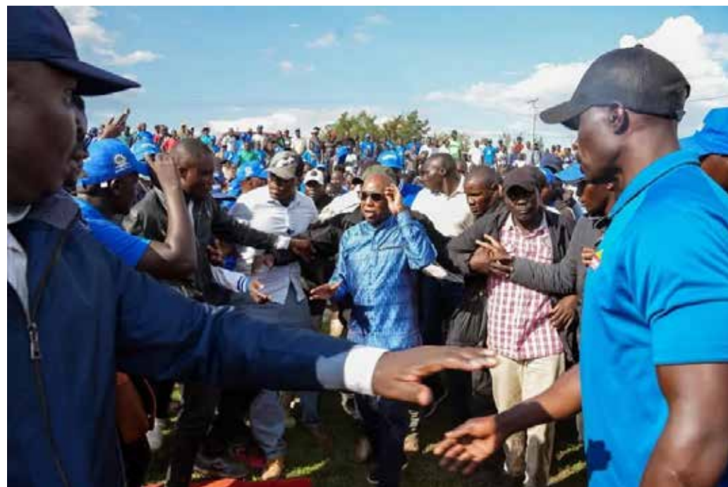
Safina party leader and it's presidential candidate Jimi Wanjigi (in glasses) engaging Kenyans in one of the many forums he convenes to seek their support.

We will cut off regulatory bureaucracy to accelerate innovation and investments. And our agenda will build industrial scale manufacturing and high value added agricultural industry powered by reliable and cheap energy. Kenyans will have direct say in their security affairs.