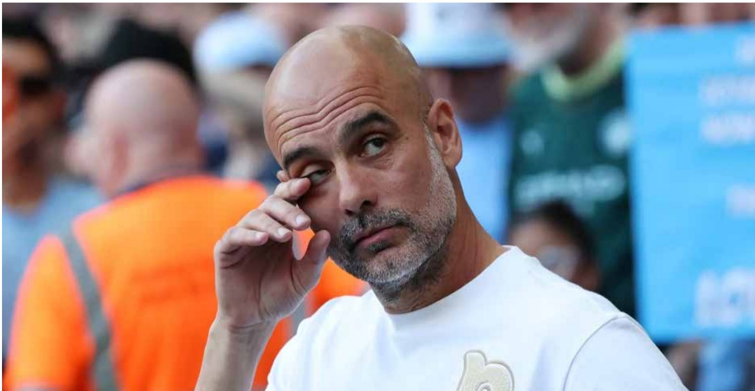
Manchester City's Spanish manager Pep Guardiola

P ep Guardiola bid an emotional farewell to Manchester City as a 2-1 defeat by Aston Villa yesterday brought down the curtain on a glittering decade under the Catalan.