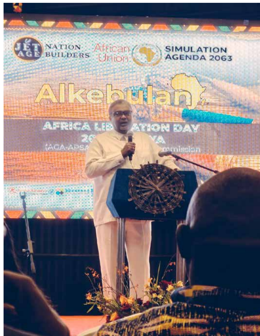
Ambassador Salah Hammed in Nairobi yesterday.

Ambassador Hammed called on African leaders to strengthen unity and make better use of the continent's vast resources, particularly its youthful population, which he said accounts for nearly 65