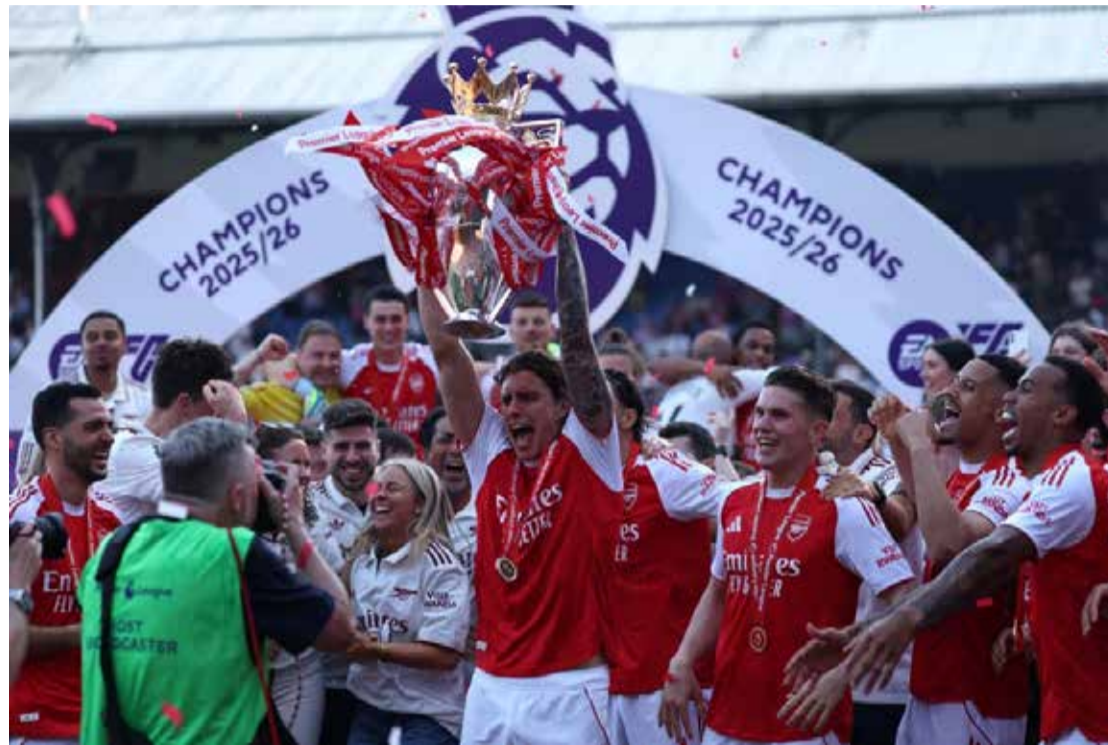
Arsenal's Italian defender #33 Riccardo Calafiori lifts the Premier League trophy at a presentation ceremony on the pitch after the English Premier League football match between Crystal Palace and Arsenal at Selhurst Park in south London

A rsenal lifted the Premier League trophy after celebrating their first game as champions with a 2-1 win against Crystal Palace on Sunday.