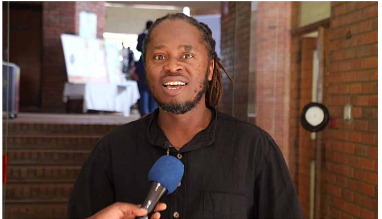
Ishmael Beah, an international author renowned for his books including A Long Way Gone and Memoirs of a Boy Soldier speaking during the event.

Ishmael Beah, an international author renowned for his books including A Long Way Gone and Memoirs of a Boy Soldier , who was the chief guest at the event, noted that storytelling has a unifying power which can be exploited to build strong peaceful bonds among communities. "Stories allow people to walk in each others shoes and see each other's