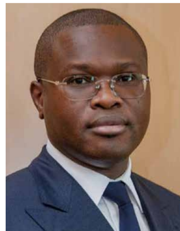
President Romuald Wadagni.