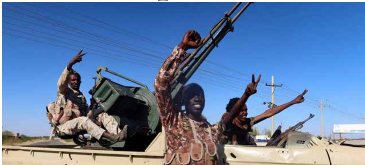
The conflict in Sudan

In Sudan, a devastating conflict has pushed 25 million people to the edge of starvation, with millions displaced and living in fear. The world barely blinks.