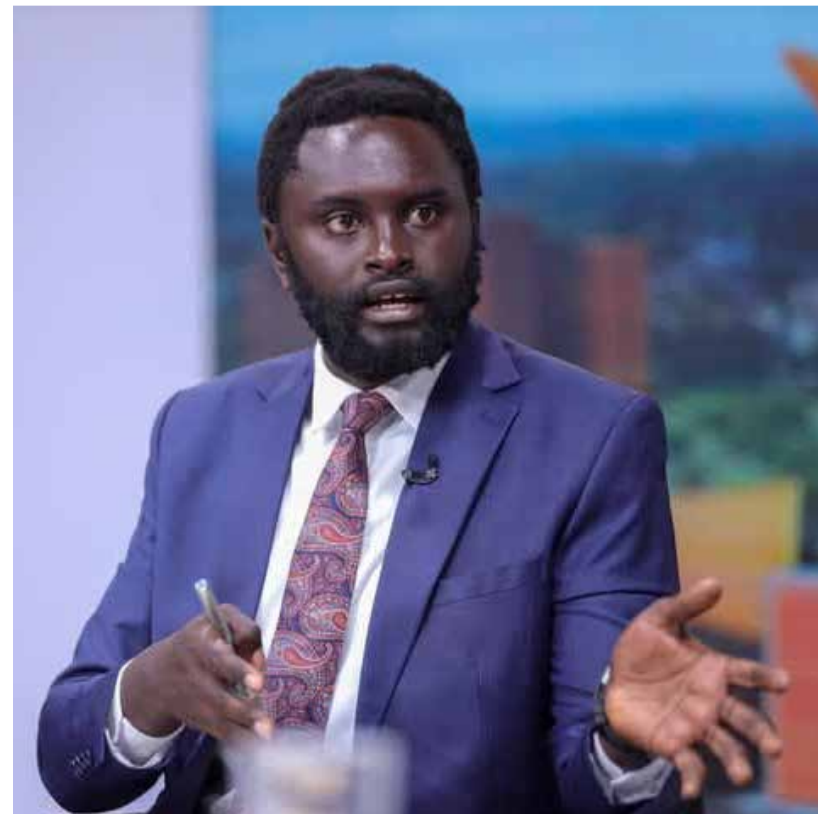
Nyandarua Senator John Methu

The DCP leader has in recent months mounted aggressive criticism of the government over taxation, cost of living, insecurity, and alleged political intimidation.